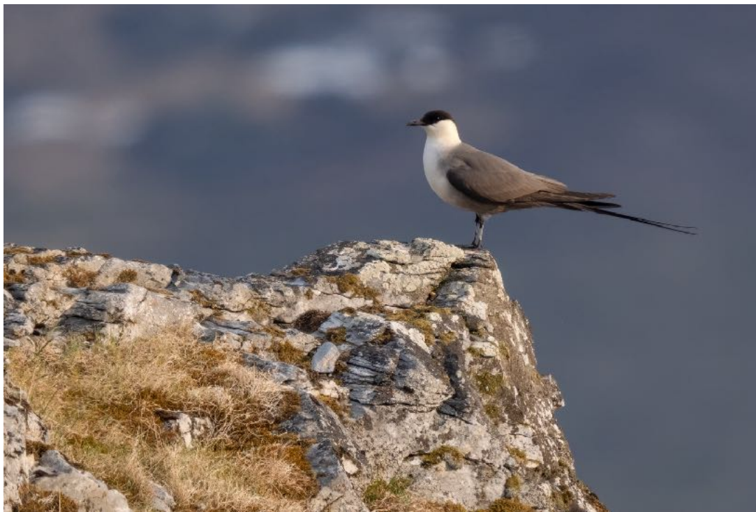
Long-tailed Jaeger - Photo by guide: Ben Knoot