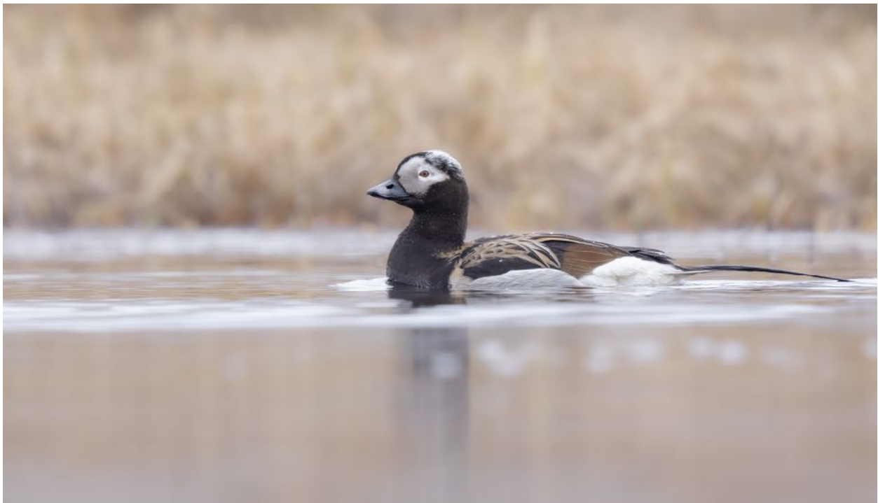
Long-tailed Duck