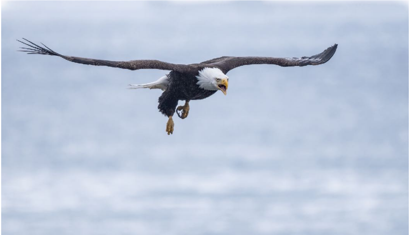
Bald Eagle (both)