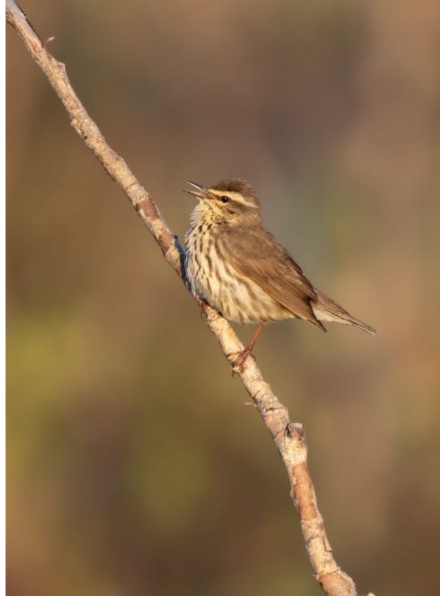
Northern Waterthrush