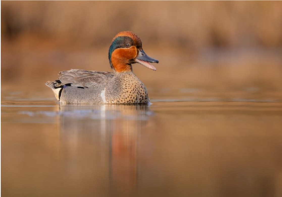
Green-winged Teal