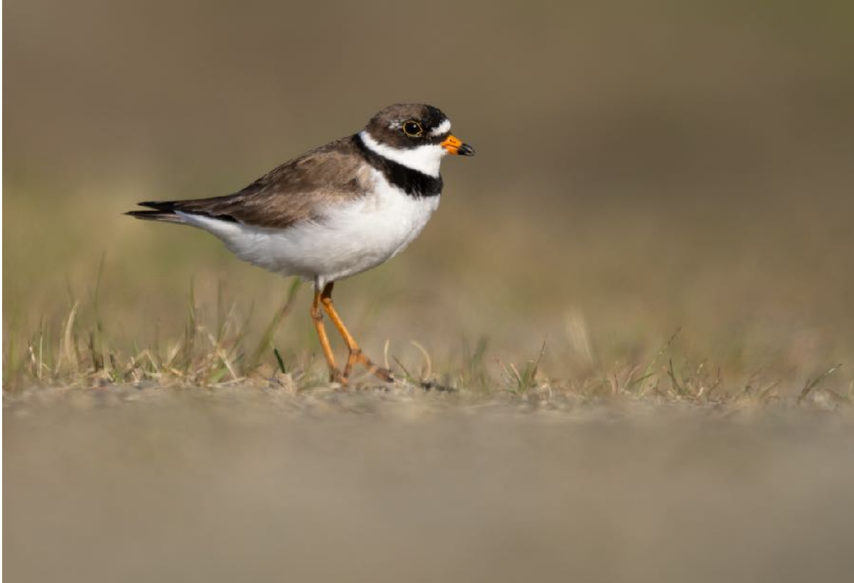
Semi-palmated Plover - Photo by guide: Ben Knoot