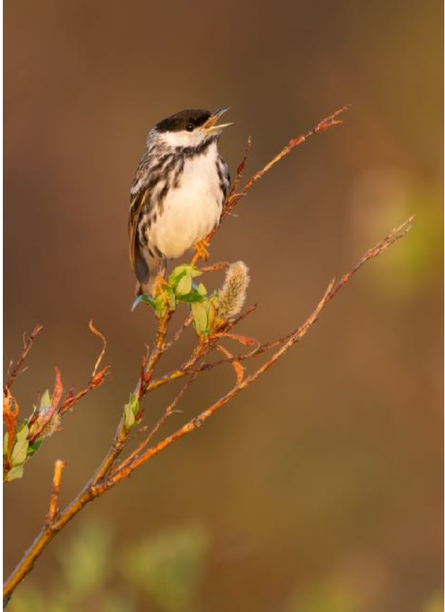
Blackpoll Warbler