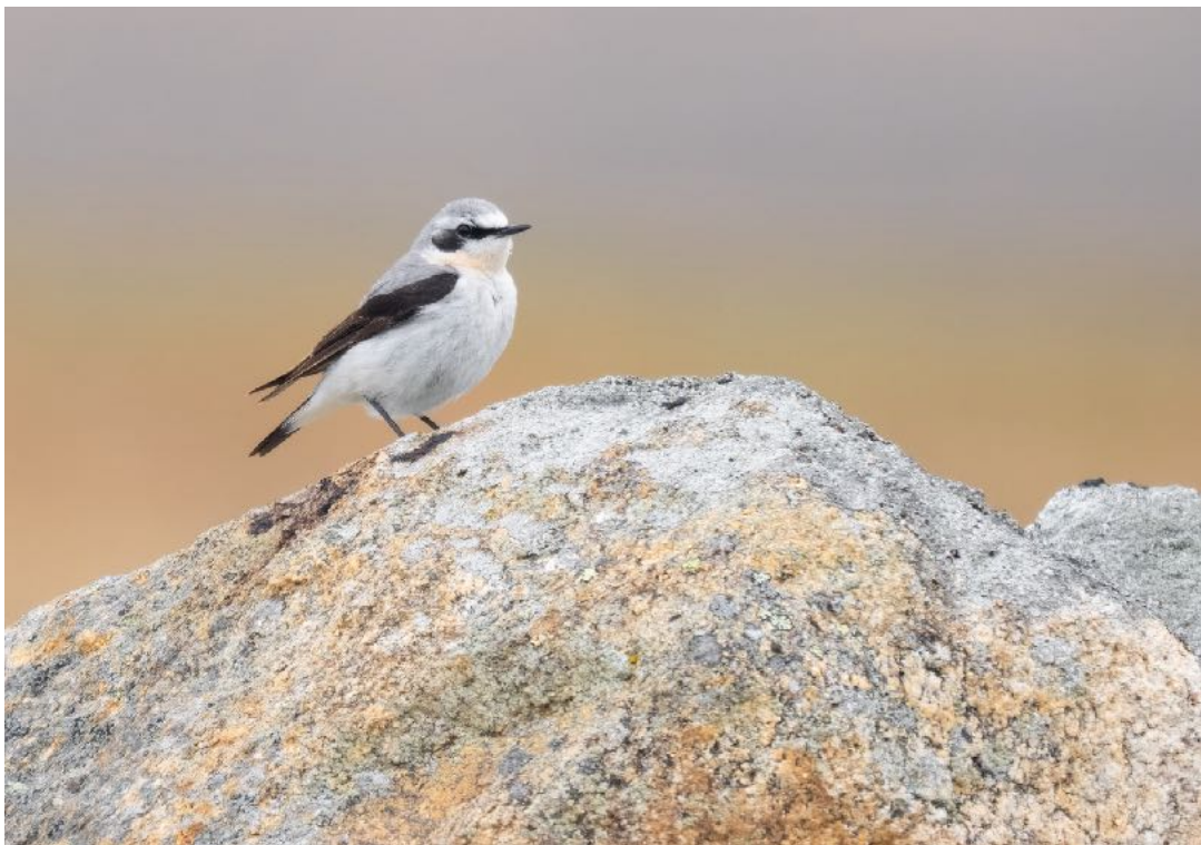
Northern Wheatear