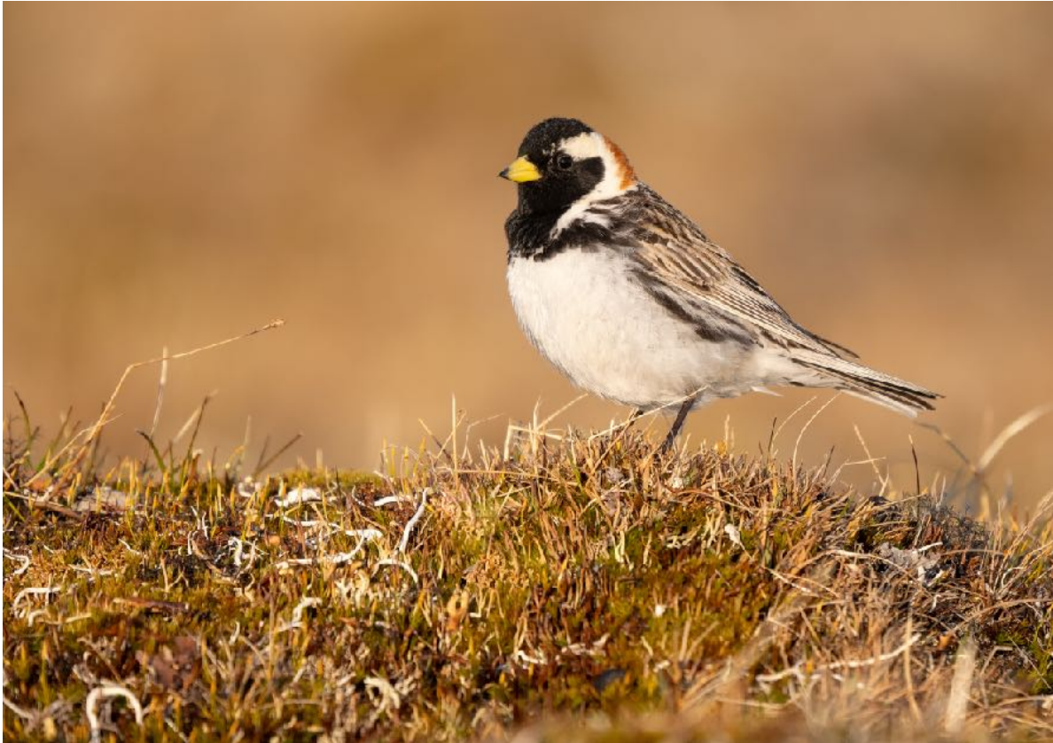
Lapland Longspur (both)