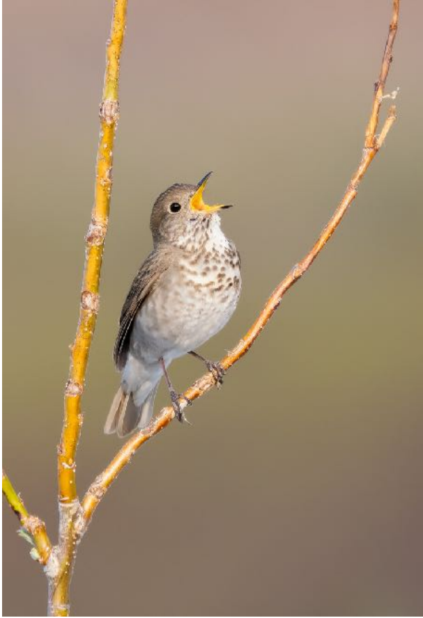
Common Redpoll - Photo by guide: Ben Knoot