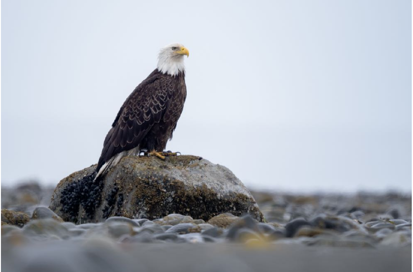
Bald Eagle (both)