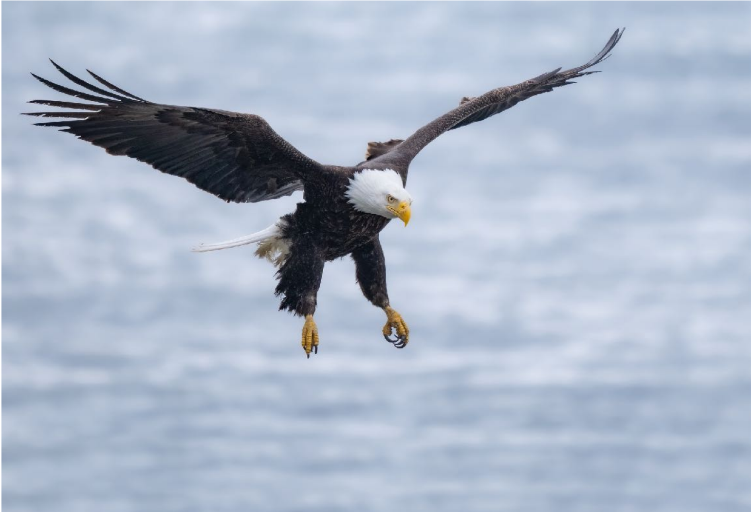
Bald Eagle