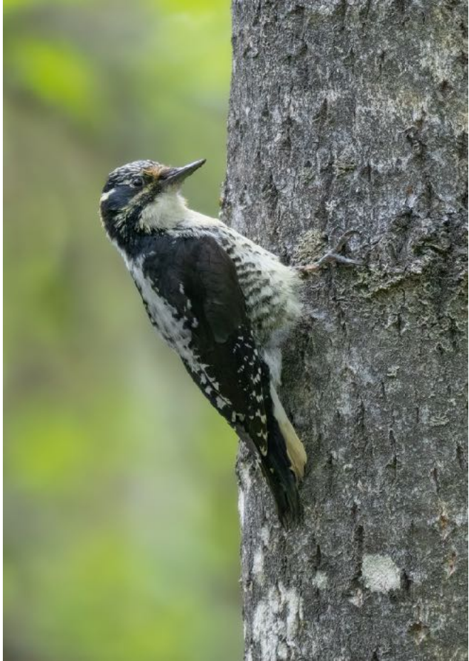
American Three-toed Woodpecker