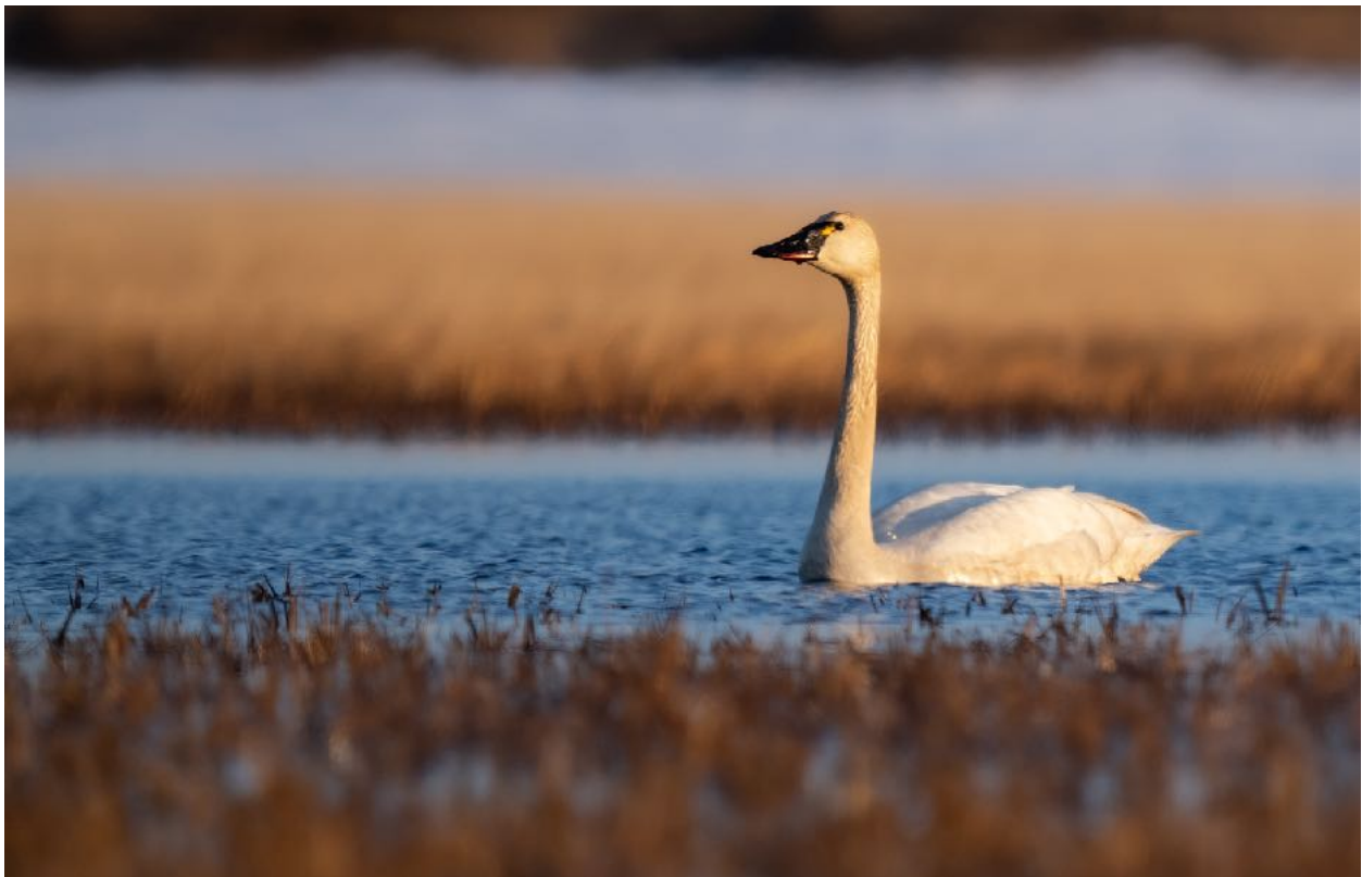
Tundra Swan