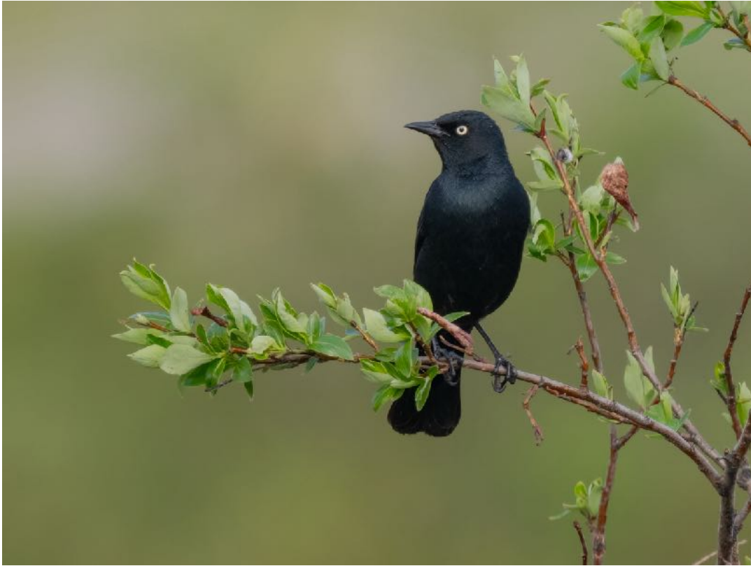
Rusty Blackbird