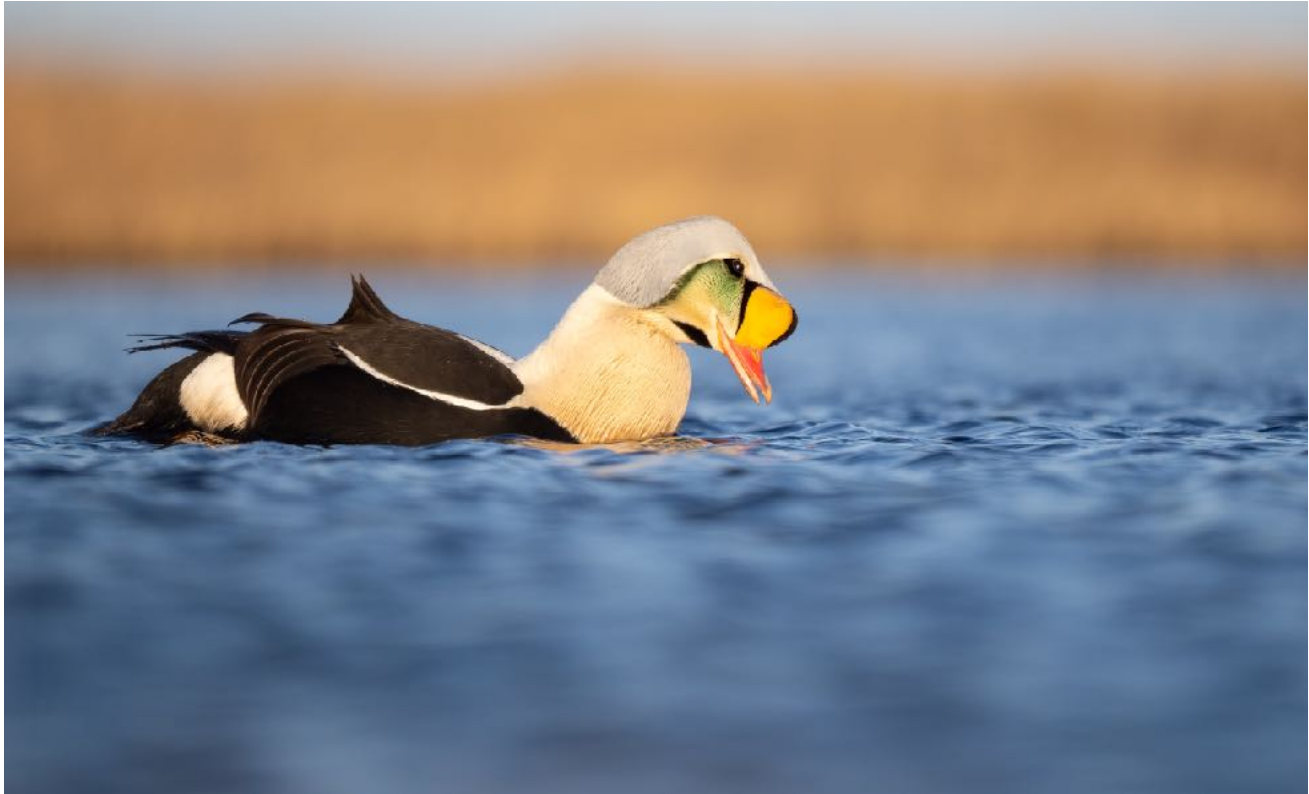
King Eider (both)