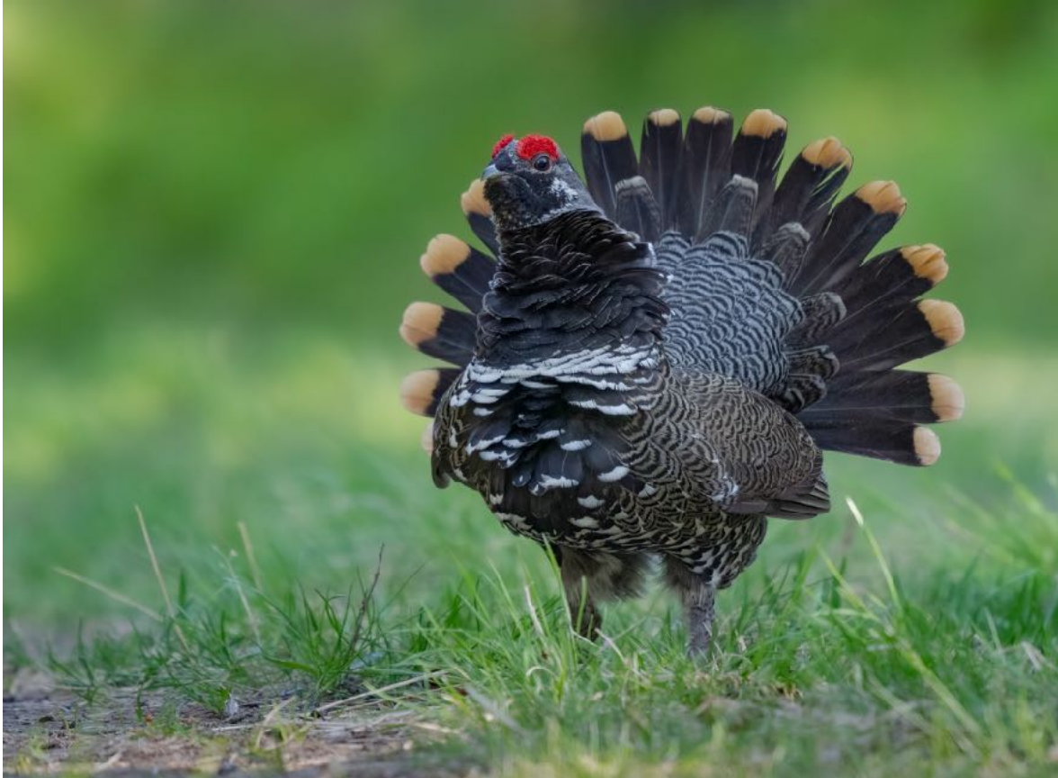
Spruce Grouse