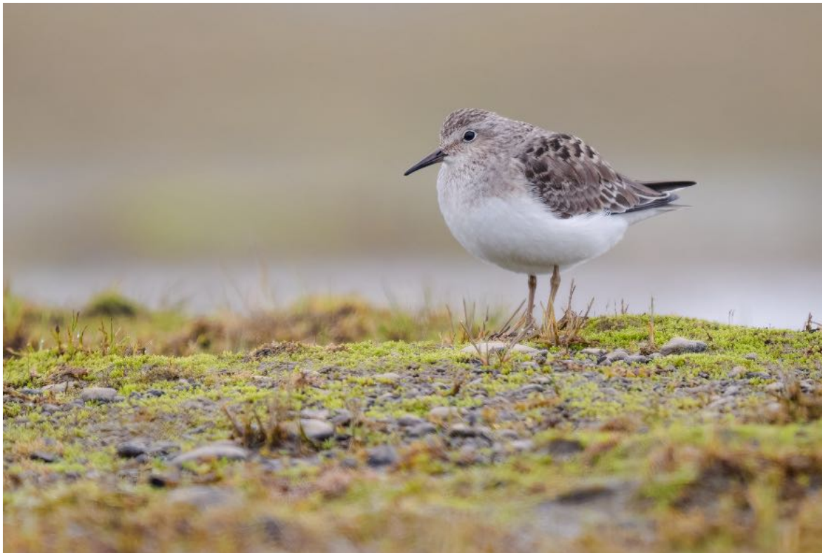
Temminck's Stint