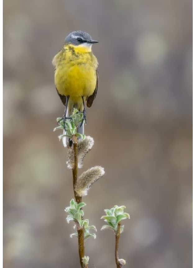
Eastern Yellow Wagtail