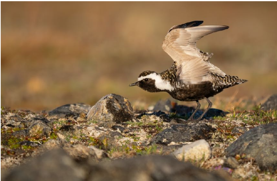
American Golden Plover