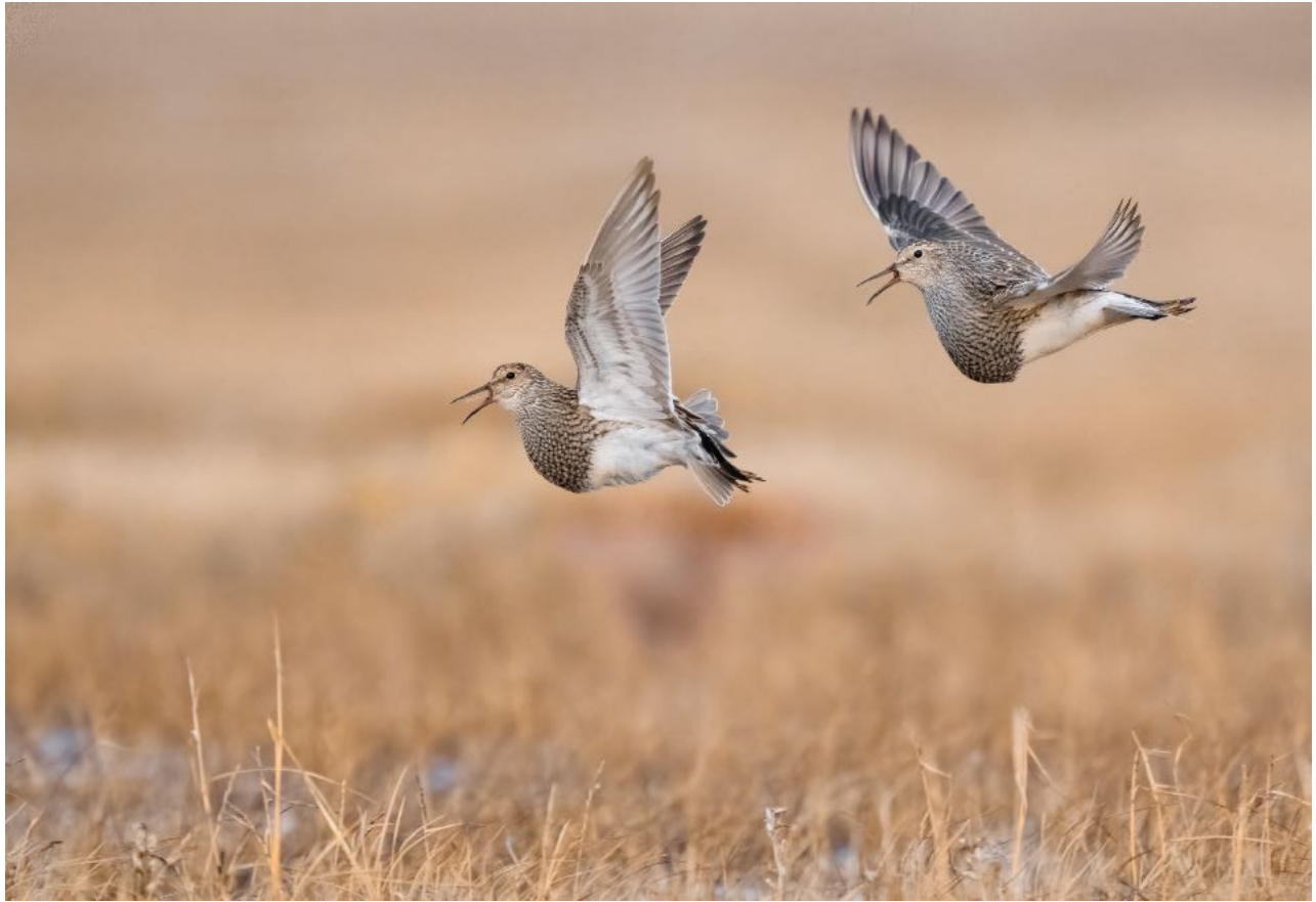
Pectoral Sandpiper (display flight)