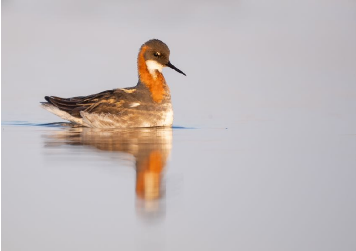
Red-necked Phalarope - Photo by guide: Ben Knoot