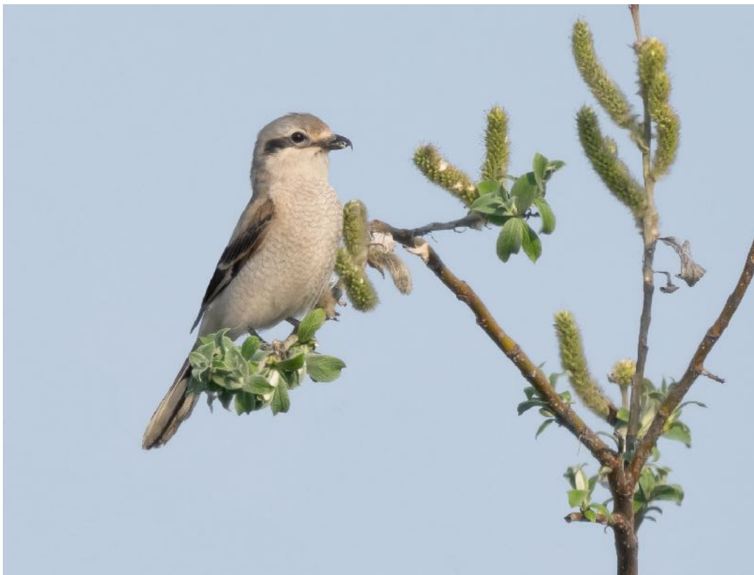
Northern Shrike