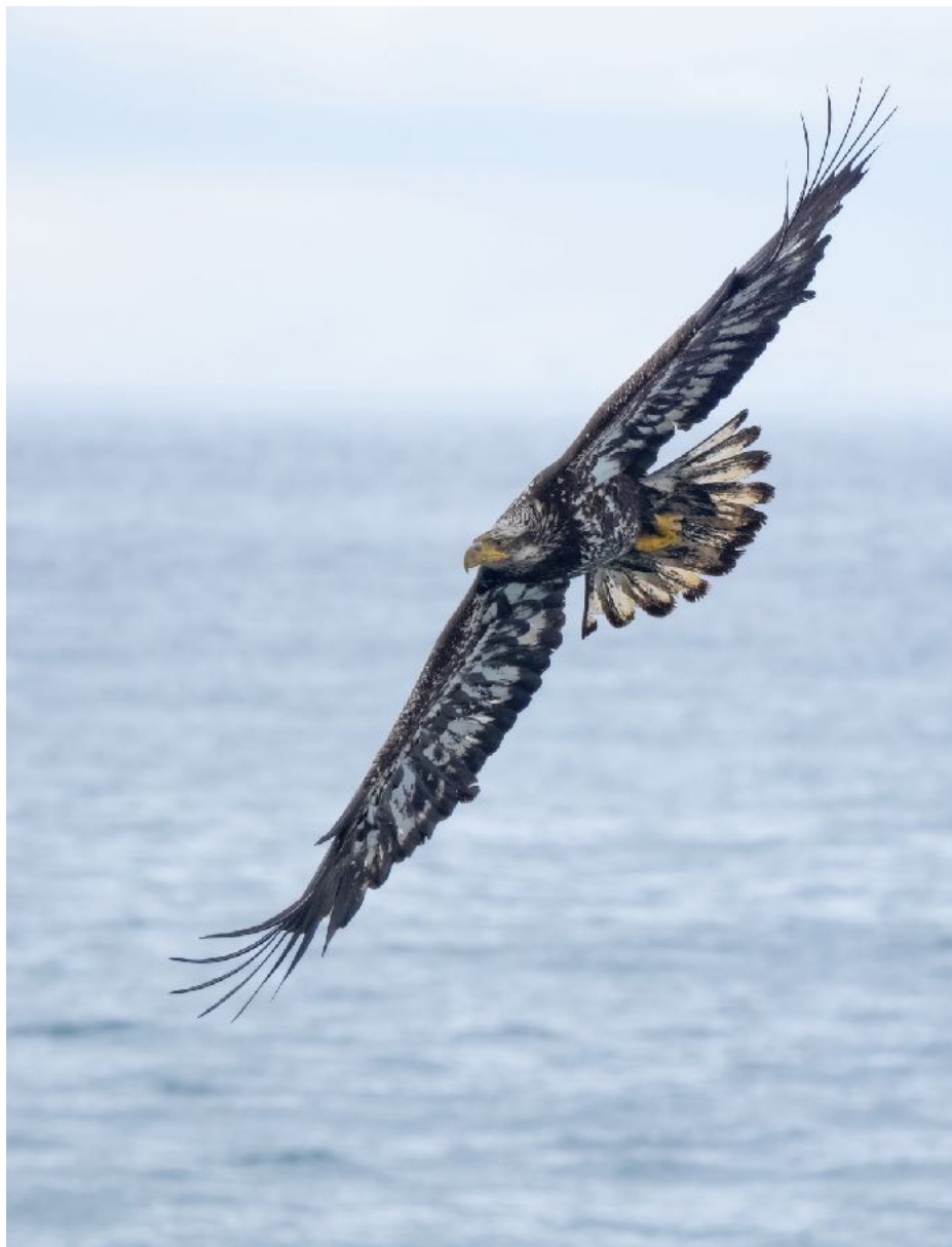
Bald Eagle

Homer was a custom request from two of the guests this year. We spent the entire time aiming to photograph Bald Eagles but also tried to take advantage of any other species we found. Not only did we pick up Bald Eagle but we also grabbed; Black-legged Kittiwake , Harlequin Duck , Glaucous-winged Gull and a beautiful Moose ! The weather overall was “meh” but we still managed some fun stuff when we had a burst of sunshine or at least a high enough overcast day to not make the images look completely washed out. Once we concluded our time here with all of the amazingly fun restaurants and our fantastic hosts of our BnB we hit the road back to Anchorage to meet up with our other two friends to start the main tour.