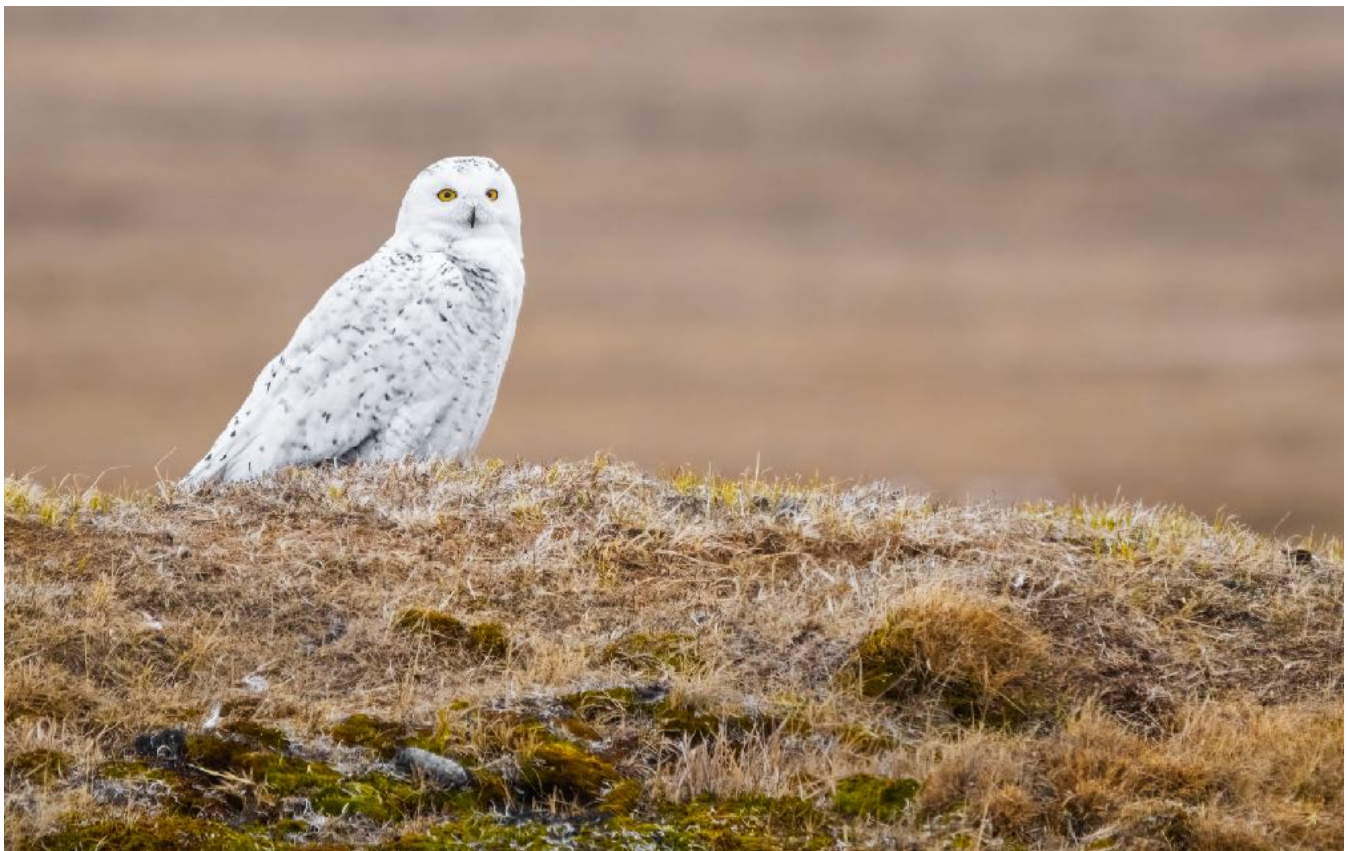
Snowy Owl - Photo by guide: Ben Knoot

Barrow is nick-named 'the top of the world' and even though that isn't quite accurate, it certainly feels like it when you arrive. The now named Utqiagvik sits at the end of the road in terms of the northern for the United States. It is cold, mostly cloudy and spits rain just about every other day and sits on a layer of permafrost. Almost entirely Boggy Tundra with thousands upon thousands, maybe even millions of tundra pools and coastal floating ice which just happens to be the perfect place for breeding ducks, shorebirds and a few other random predators like jaegers and the iconic Snowy Owl...it also happy to be a photographers paradise. Over the course of our time here we managed; Spectacled, Steller's and King Eider, Pacific and Red-throated Loon, Lapland Longspur, Snowy Owl, Dunlin, Pectoral, Baird's, Western and Semi-palmated Sandpiper , our third and final jaeger, the Pomarine Jaeger, Tundra Swan, Long-tailed Duck, Black Guillemot, Snow Bunting, Red and Red-necked Phalarope, Greater White-fronted Goose . We also had several more 'rare' encounters with a Temminck's and Red-necked Stint . We also tried our luck with a Polar Bear tour. We weren't able to see any bears but we did enjoy a nice drive up to Point Barrow (officially the end of the road) and managed a quick view though no photos of Sabine's Gull . Overall, we had an excellent time in Barrow, but were all ready to head back to anchorage and catch our flights home the next day.