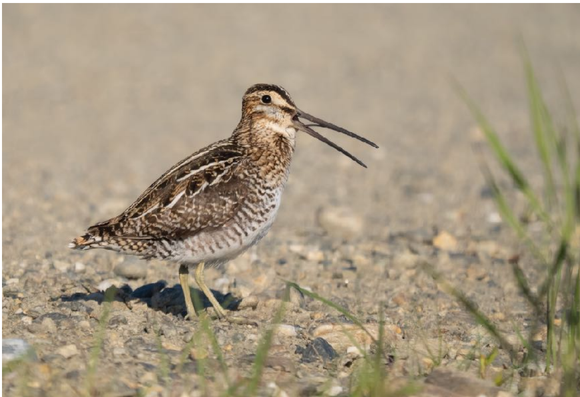
Wilson's Snipe