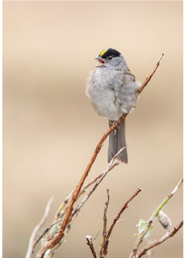
Golden-crowned Sparrow