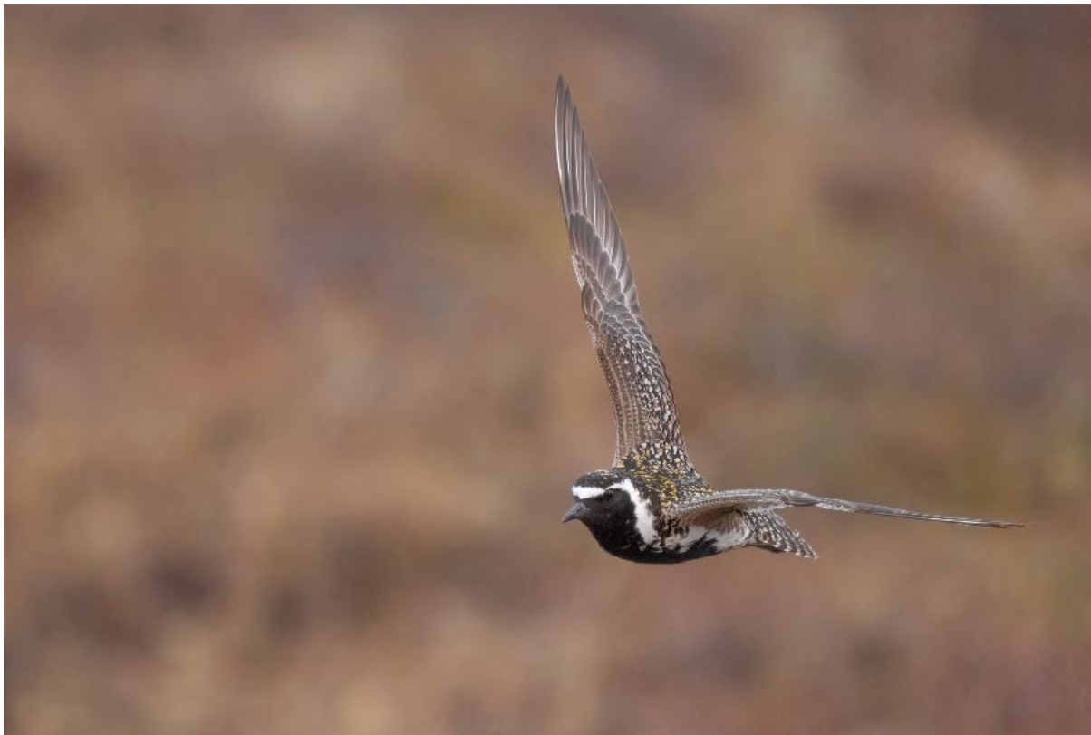
Pacific Golden Plover - Photo by guide: Ben Knoot