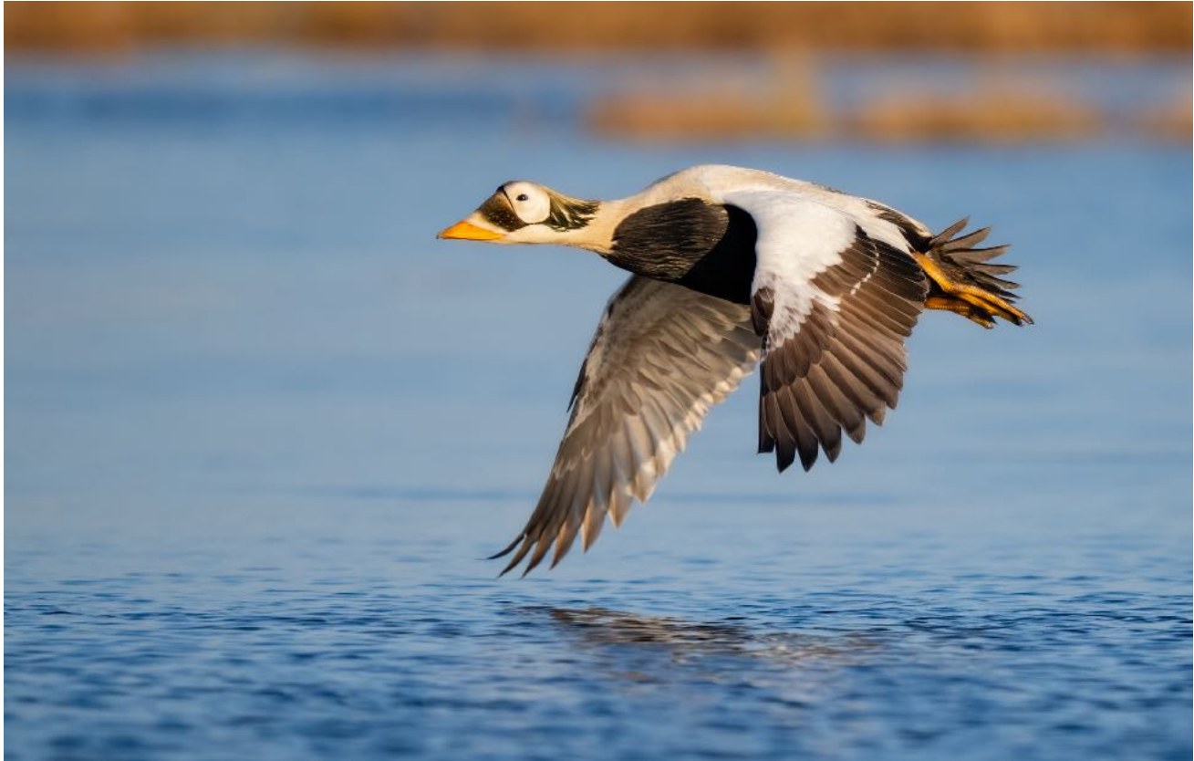
Spectacled Eider (both) - Photo by guide: Ben Knoot