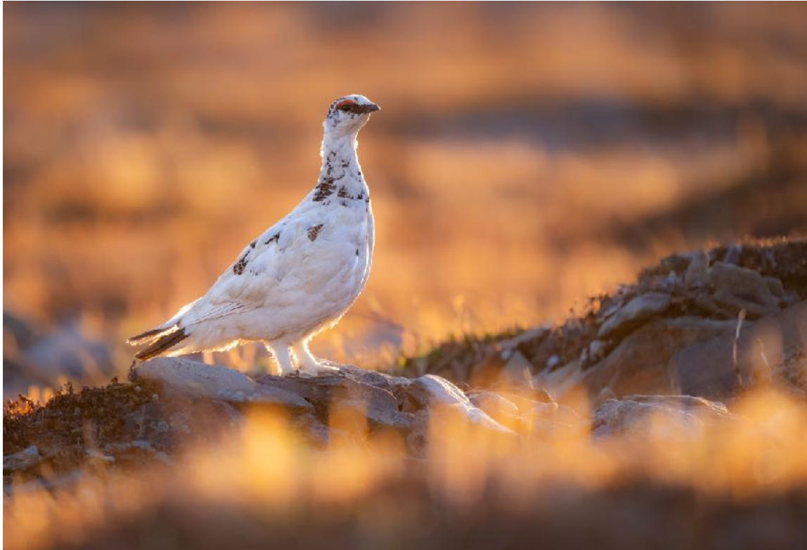
Rock Ptarmigan