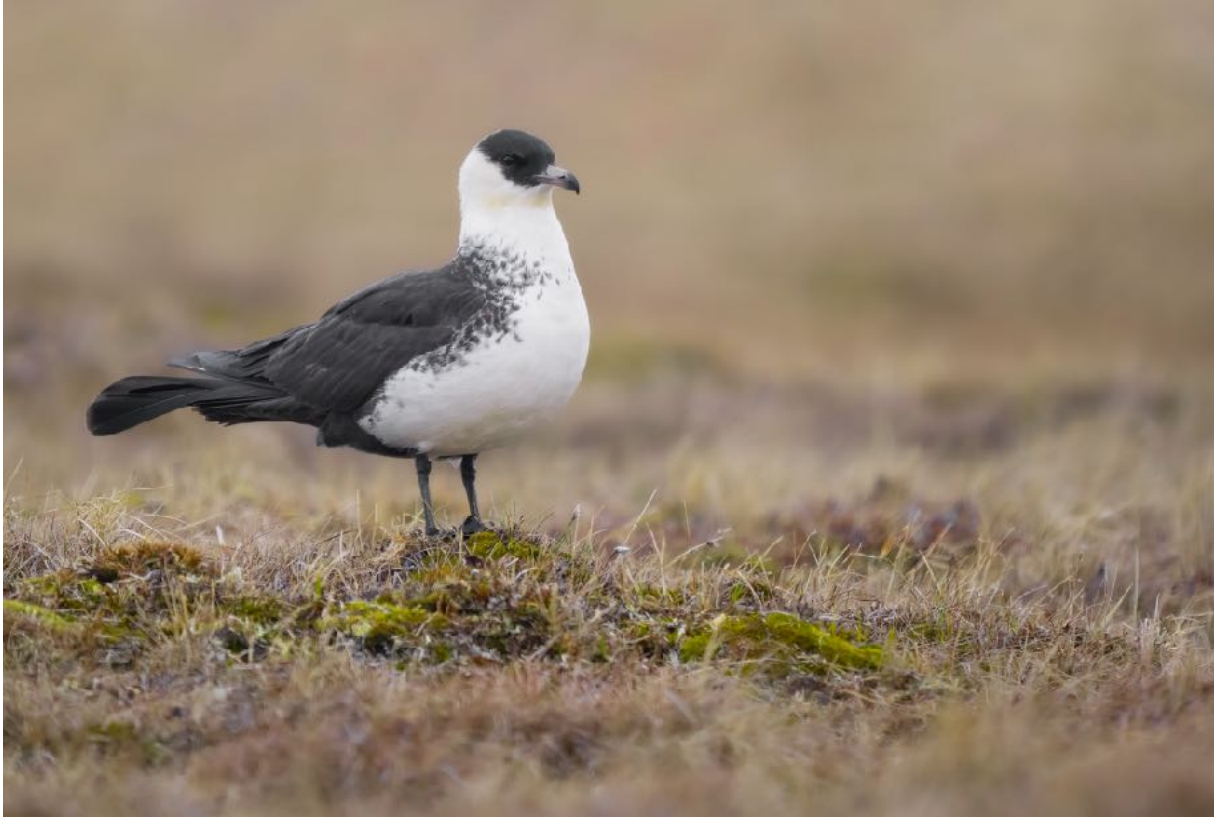
Pomarine Jaeger