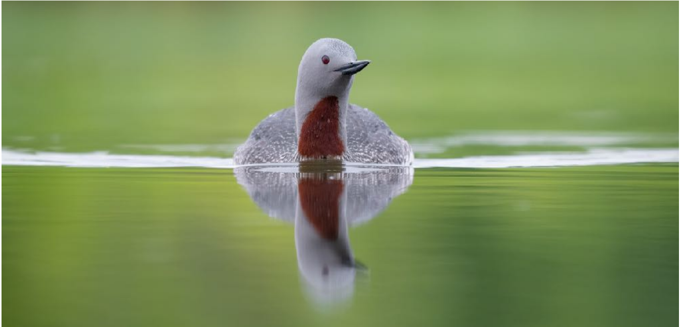
Red-throated Loon