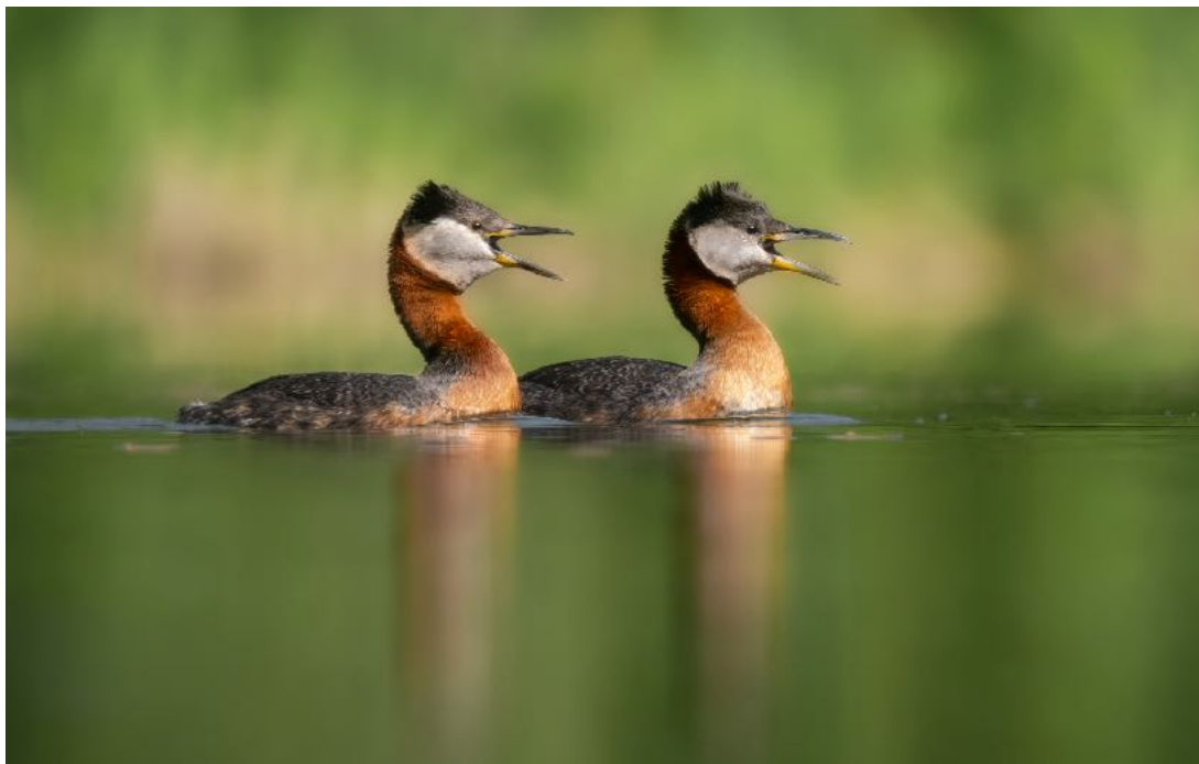
Red-necked Grebe