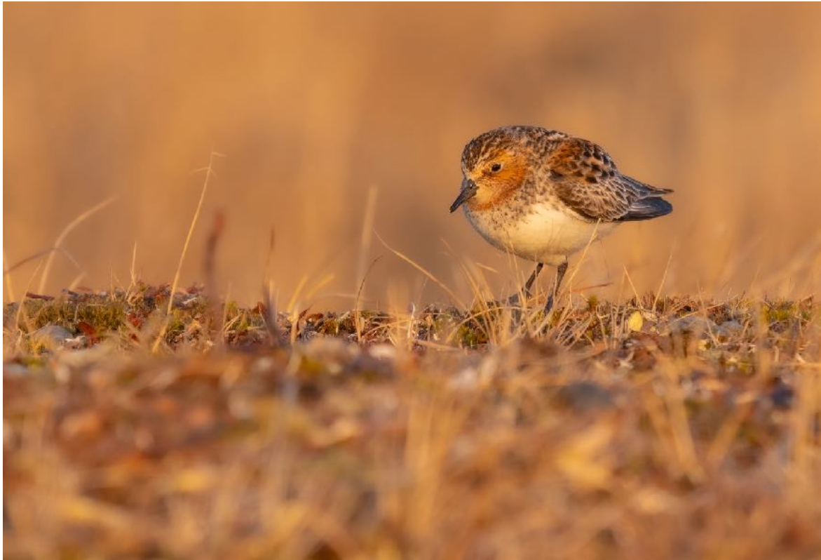
Red-necked Stint