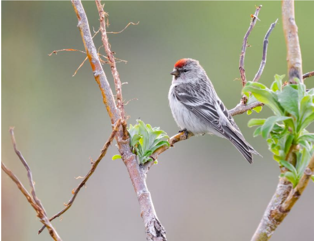
Hoary Redpoll