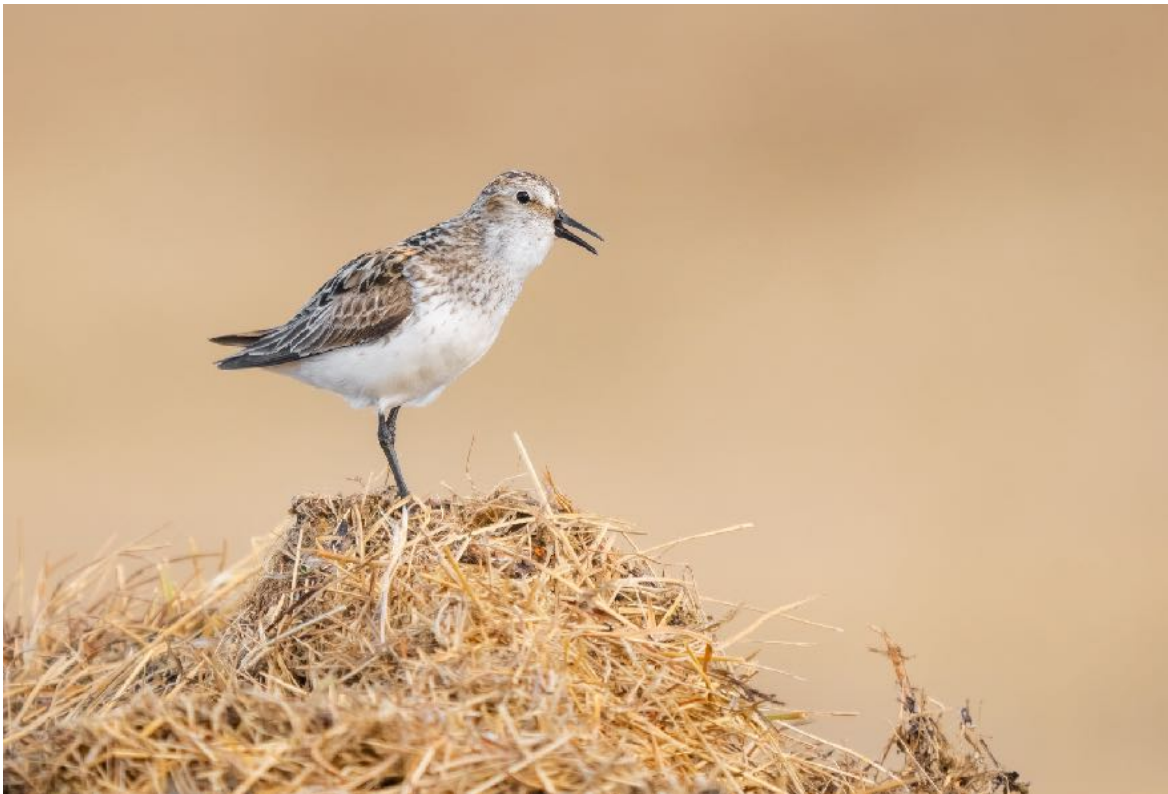
Semi-palmated Sandpiper