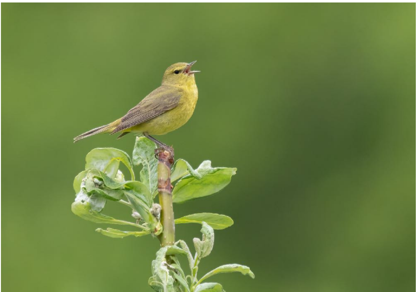
Orange-crowned Warbler