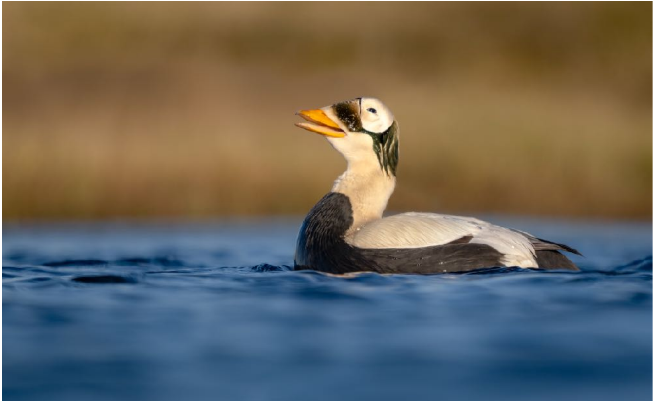
Spectacled Eider (both)