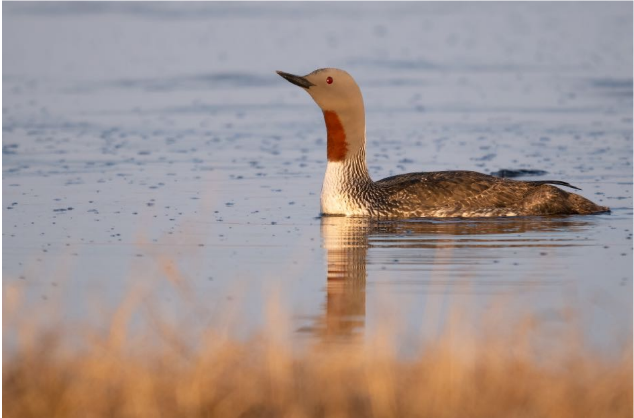
Red-throated Loon - Photo by guide: Ben Knoot