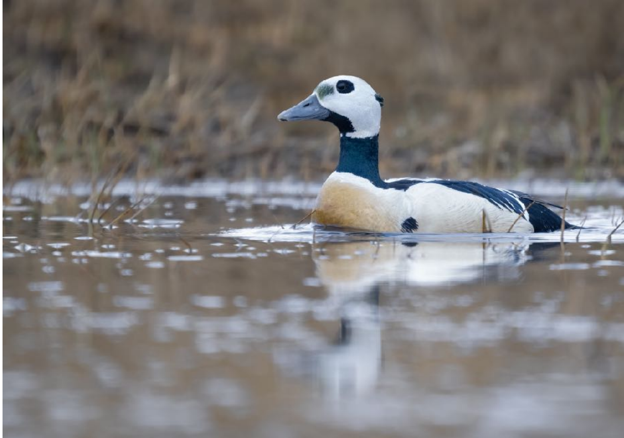
Steller's Eider