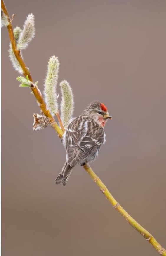
Common Redpoll