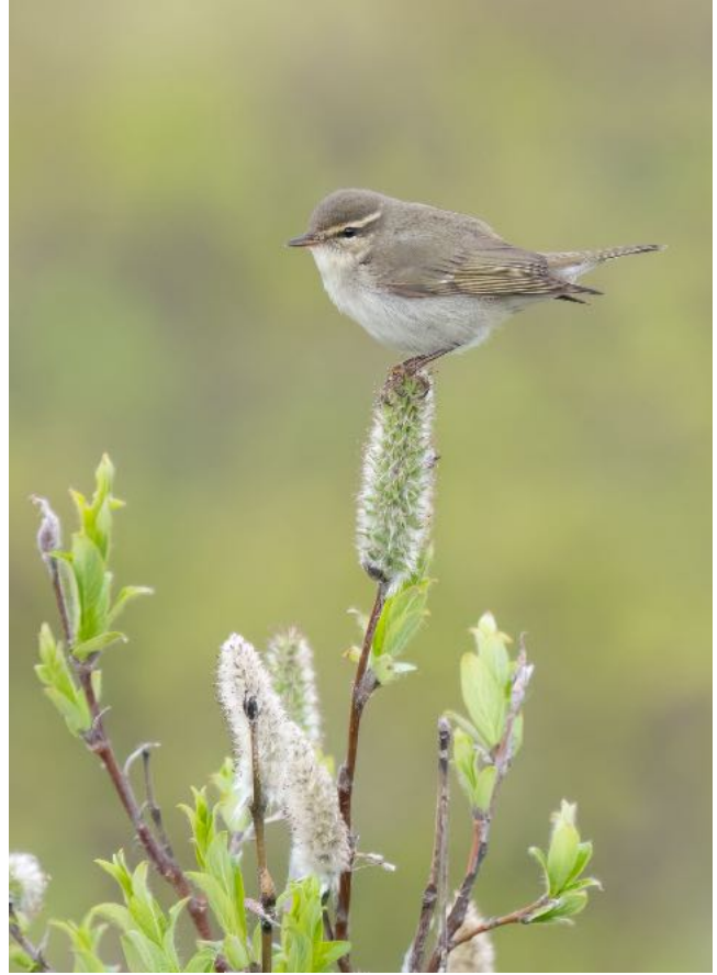
Common Redpoll