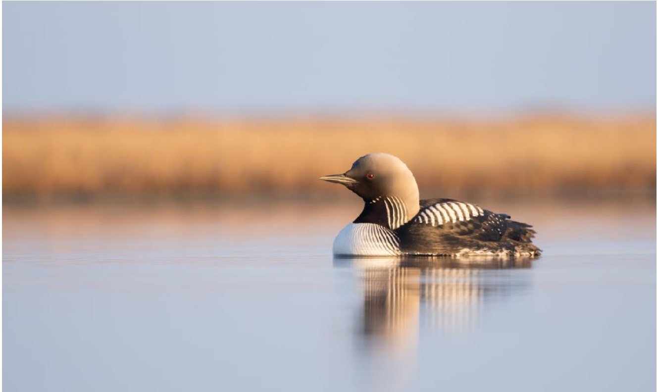
Pacific Loon (both)