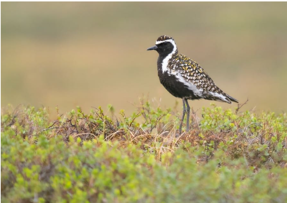
Pacific Golden Plover - Photo by guide: Ben Knoot