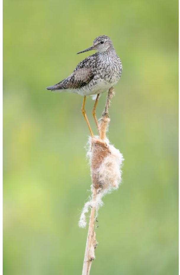
Lesser Yellowlegs