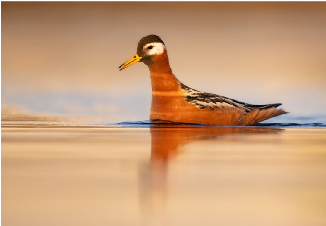
Red Phalarope