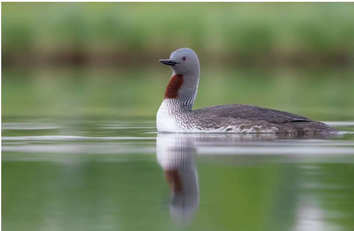
Red-throated Loon