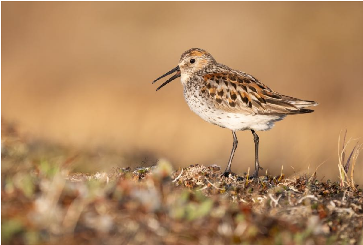
Western Sandpiper