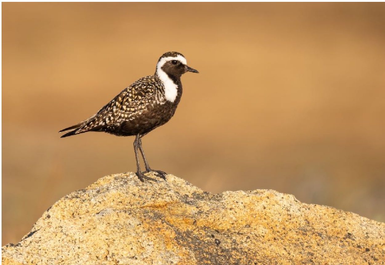
American Golden Plover

Nome is essentially three, maybe four main roads that are excellent for a variety of photographic opportunities. Rocky and grass tussock style tundra and riverside shrubbery is mixed with rocky hillsides which is great for us as it provides us with plenty of birds to photograph. The shrubby stuff holds birds like; Hoary and Commonly Redpoll, Bluethroat, Blackpoll, Wilson's and Arctic Warbler, Fox Sparrow, Golden-crowned Sparrow, Northern Waterthrush, Northern Shrike and Rusty Blackbird . These birds are some of our smallest targets on the entire tour and some of our only passerines believe it or not. The 'typical tundra' that we go through in Nome gives us some great opportunities to photograph a variety of breeding shorebirds. Some of these birds can be found in Barrow as well but most are more easily photographed here. Birds like; American and Pacific Golden Plover, Semi-palmated Plover, Whimbrel, Western Sandpiper, Bar-tailed Godwit, Wilson's Snipe, Willow Ptarmigan, Lapland Longspur, Long-tailed and Parasitic Jaeger . A few other randomly photographed species were Rock Ptarmigan . And of course, can't forget about the lumbering Musk Ox! Passerines like Northern Wheatear and Eastern Yellow Wagtail are always really nice additions to our tour but are usually much more difficult where as the common Gray-cheeked Thrush is a near daily participant in the morning, and late afternoon chorus. This year we also had a pretty wonderful photoshoot with a Green-winged Teal .