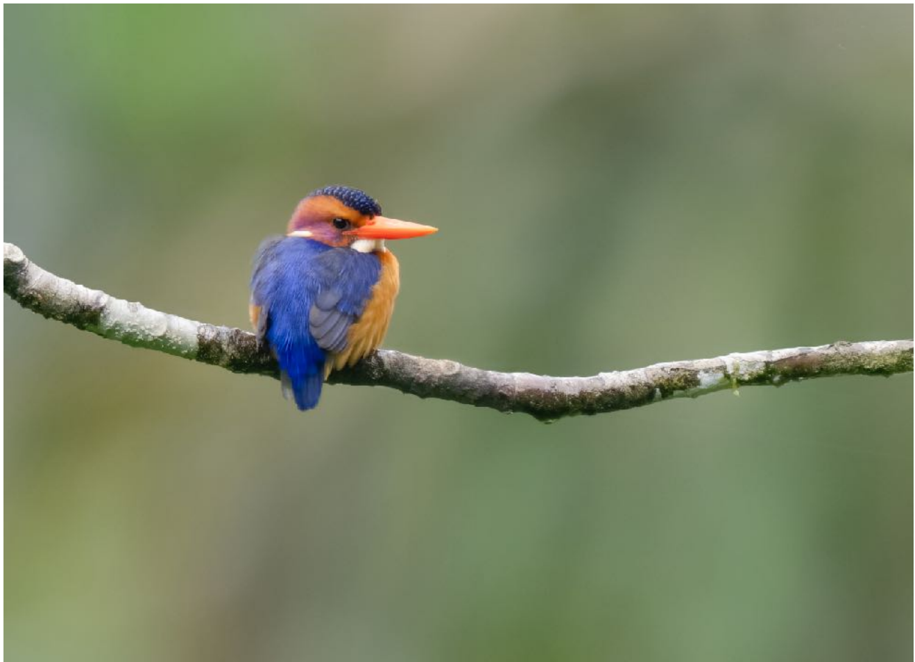
African Pygmy Kingfisher

The day started with a delicious early morning breakfast. After we had had our fill, we piled into an old 4x4 Land Rover, picked up our local ranger protection and headed into the Ankasa Reserve . It was a bit of a drive to get where we wanted to go and the road was not good to say the least so it took about an hour so. We even had a bit of a delay as we got stuck for a few minutes, nothing some skilled recovery driving couldn't solve. We arrived at a clearing where we'd begin our walk to several ponds dotted within this thick West African rainforest. The first pond proved to be the most fruitful, netting us; White-bellied and Blue-breasted Kingfisher and a very quick look at African Finfoot . Continuing on through the morning, we dodged little rain showers and worked hard to get on the birds. Birds like; Orange-breasted Forest Robin , Rufous-winged and Black-capped Illadopsis were our skulking forest highlights while the Sabines Spinetail enchanted us from the skies above. Photographically, I enjoyed a sweet little African Pygmy Kingfisher that sat long enough for a few snaps. Very sweet! A little trouble on the way out of the reserve when we got seriously stuck but again, a little team work and finagling and we were freed and off to a delicious lunch...the pizza was calling, and I was going to answer!