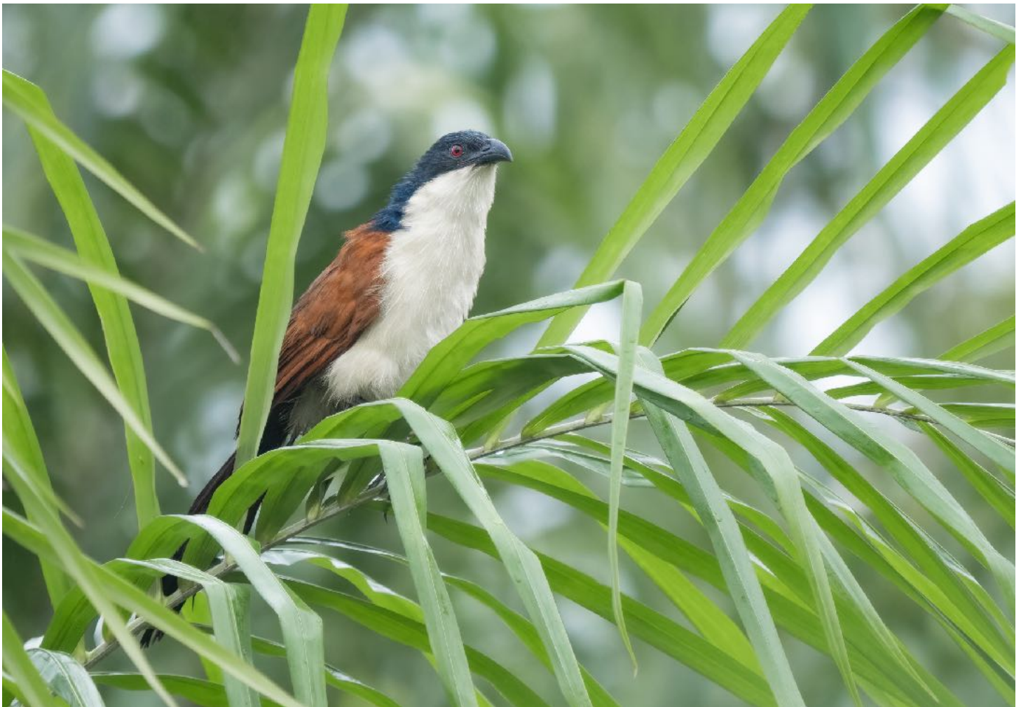
Blue-headed Coucal - Photo by Guide: Ben Knot

We then traveled to the Pare River where we had two targets. It took all of 20-seconds to find both of them. Several Rock Pratincole were hanging out on the large rocks in the middle of the river and we got to watch a family of White-throated Blue Swallows interacting for several minutes before we decided that enough was enough and it was time to return to the hotel for lunch.