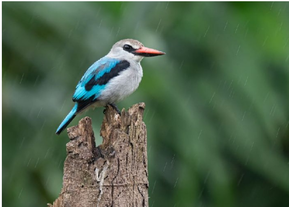
Woodland Kingfisher