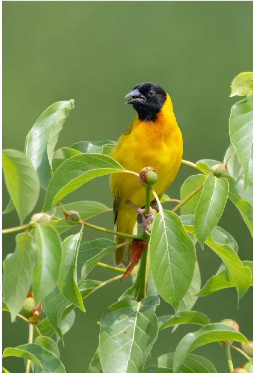
Black-headed Weaver

After a quick lunch and some delicious ice cream thanks to our local guide, we hit the road, continuing towards our final destination. A brief stop-off at Nasia Wetland granted us some good looks at Black-headed Weaver , a Winding Cisticola and some quick flight views of a Lesser Honeyguide . Time to move on towards our main birding stop for the afternoon.