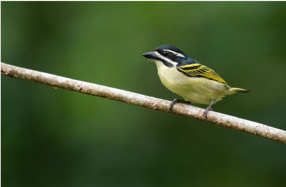
Yellow-throated Tinkerbird

After a tour of Cape Coast Castle where we learned a lot of slave trade and colonial history that took place in Ghana. After a nice seaside lunch and continued our journey towards Kakum NP. After a nice rest, the afternoon was spent entirely on a forest road just north of Kakum NP . This road showed us the thick rainforest of this area but that didn't stop us from having a great afternoon with loads of new species. We started off by enjoying a very low down Spotted Greenbul which was a nice change of pace from the usual canopy birding. Continuing on our walk we added; Brown-cheeked Hornbill , Sabines Puffback , Bronze-tailed Starling , Johanna's Sunbird , Yellow-spotted Barbet , Bristle-nosed Barbet , and Chestnut-winged Starling . I also took advantage of a low down Yellow-throated Tinkerbird for a great photo opportunity.