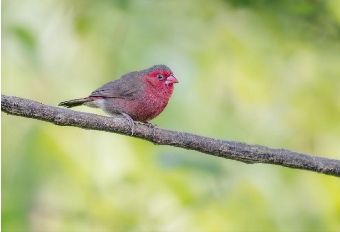
Bar-breasted Firefinch