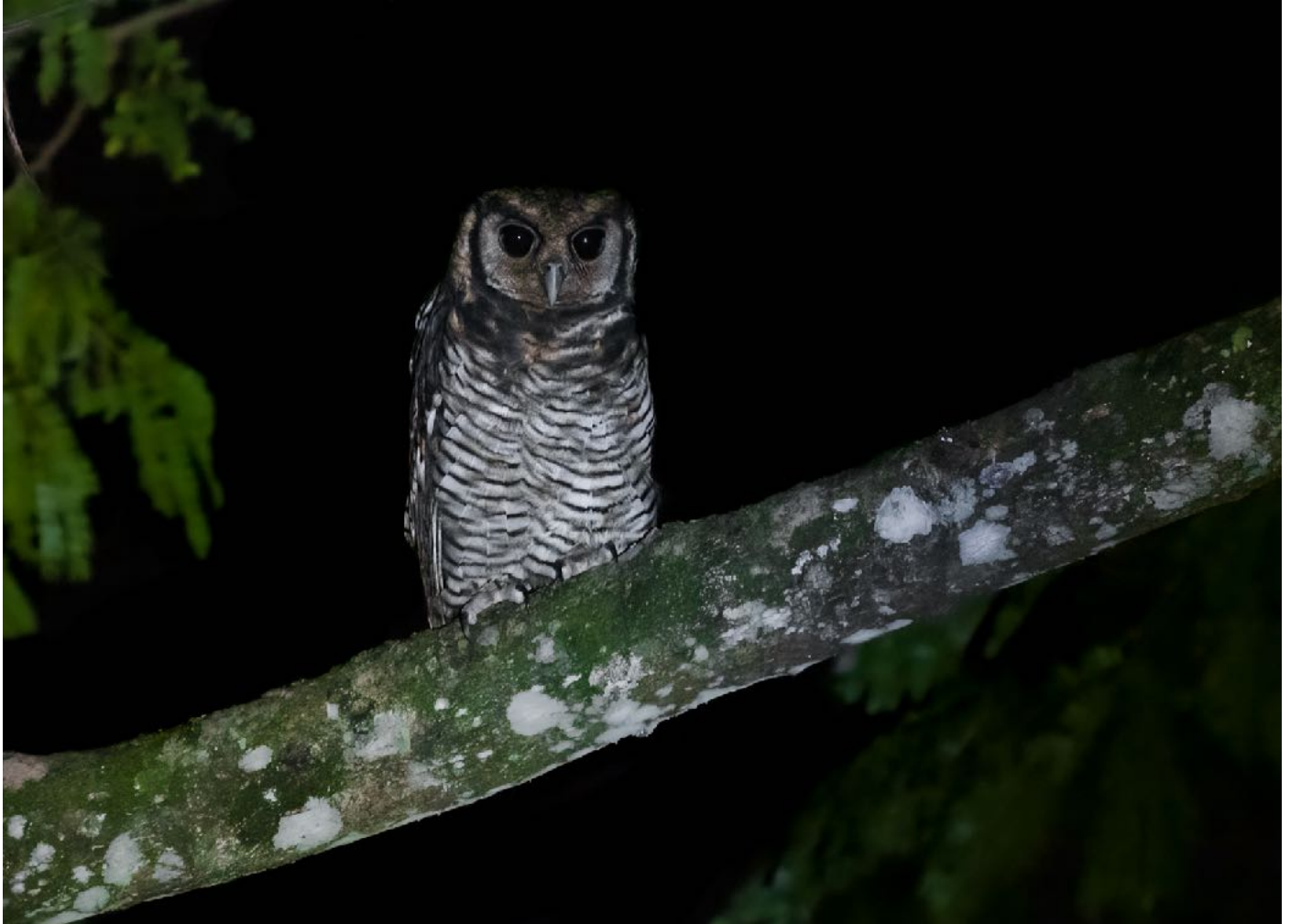
Fraser's Eagle Owl