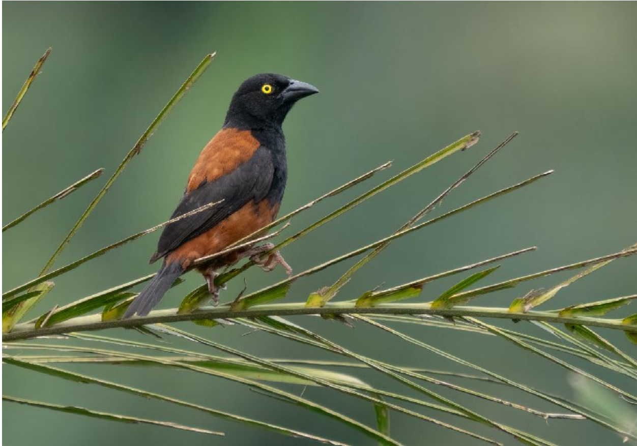
Black-and-Chestnut Weaver

Now at the terrific Ankasa Reserve Lodge (the best accommodation on the tour in my opinion) we took advantage of the free hour or so before dinner to see if we could pick up any last minute species. We started off strong with a new sunbird, the Reichenbach's Sunbird . Then, a little time spent standing around at the bridge over the river revealed two species of kingfisher. Two Giant Kingfishers gave us a few flyby views and our sharp young birder had a quick but confirmative view of Shining Blue Kingfisher . As it was now getting quite dark, the frogs started to sing and the birds quieted down for the night, we retired to our lovely cabins, prepped for dinner and enjoyed our first night in Ankasa Lodge...Oh, you thought we were done?! No way. Around 9:00pm plus or minus a few inconsequential minutes, we all received a knock on our doors asking if we wanted to go for a bit of a night drive in Ankasa Reserve to see a pretty odd but special bird for this area. Luckily, it was relayed to us that the driver and our guide had already located the target so it was really just a matter of getting out of bed, throwing some clothes on, grabbing the torches and heading out...which of course, we did! A little bit of a drive and a very short walk through a dark forest during a light evening rain shower revealed FOUR Nkulengu Rail sitting side by side. Very fun way to end the day and indeed, worth getting out of bed for.