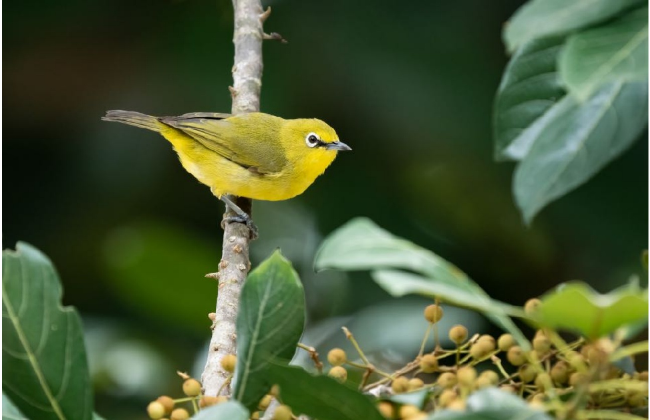
Northern Yellow White-eye - Photo by Guide: Ben Knoot