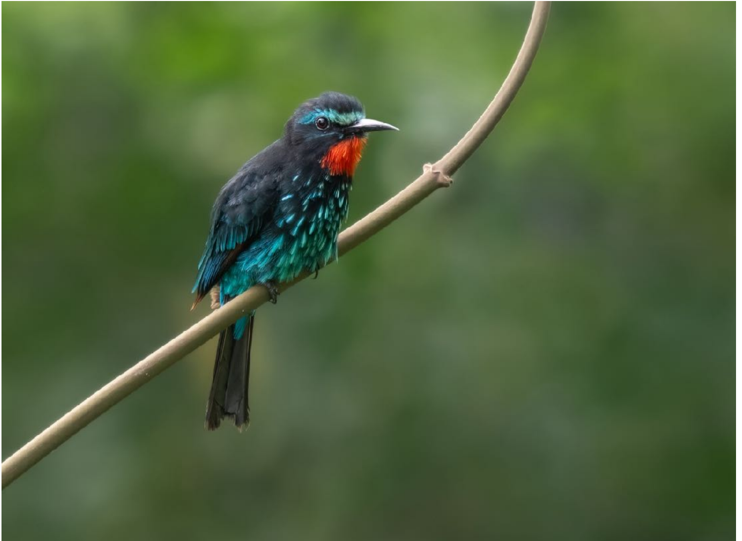
Black Bee-eater (Voted BIRD OF THE TRIP)

Ghana: Picathartes and Egyptian Plover with Pre-Extension to Atewa Hills