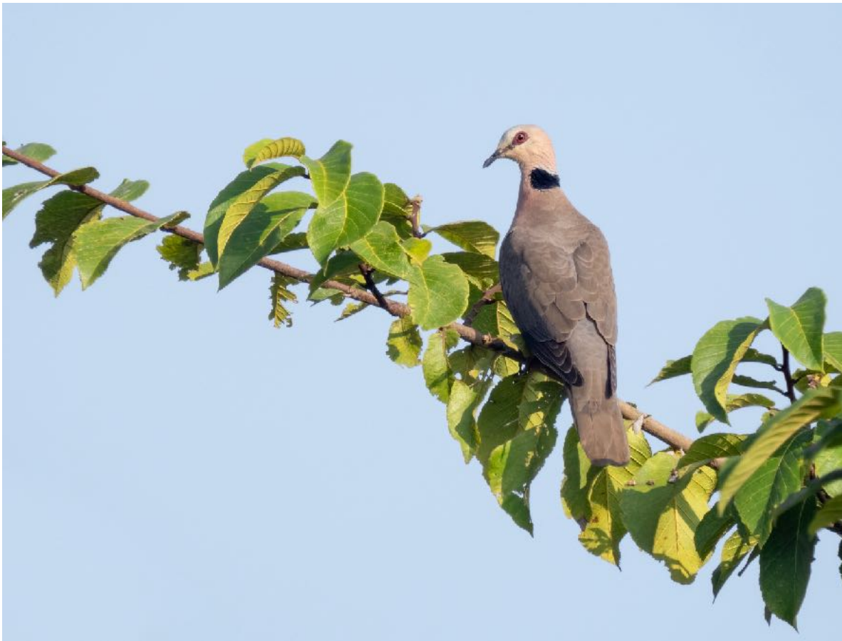
Red-eyed Dove

Our last stop before arriving at our hotel for the evening was the same random open country road I visited last year. This time, like last, it was just as productive, granting us views at some great birds. Singing Cisticola , Yellow-mantled Widowbird , Northern Fiscal , Snowy-crowned Robin Chat , Bar-breasted Firefinch , Dideric Cuckoo , Red-winged Prinia , African Gray Woodpecker and a close proximity fly-over African Hobby were very welcome additions to our lists.