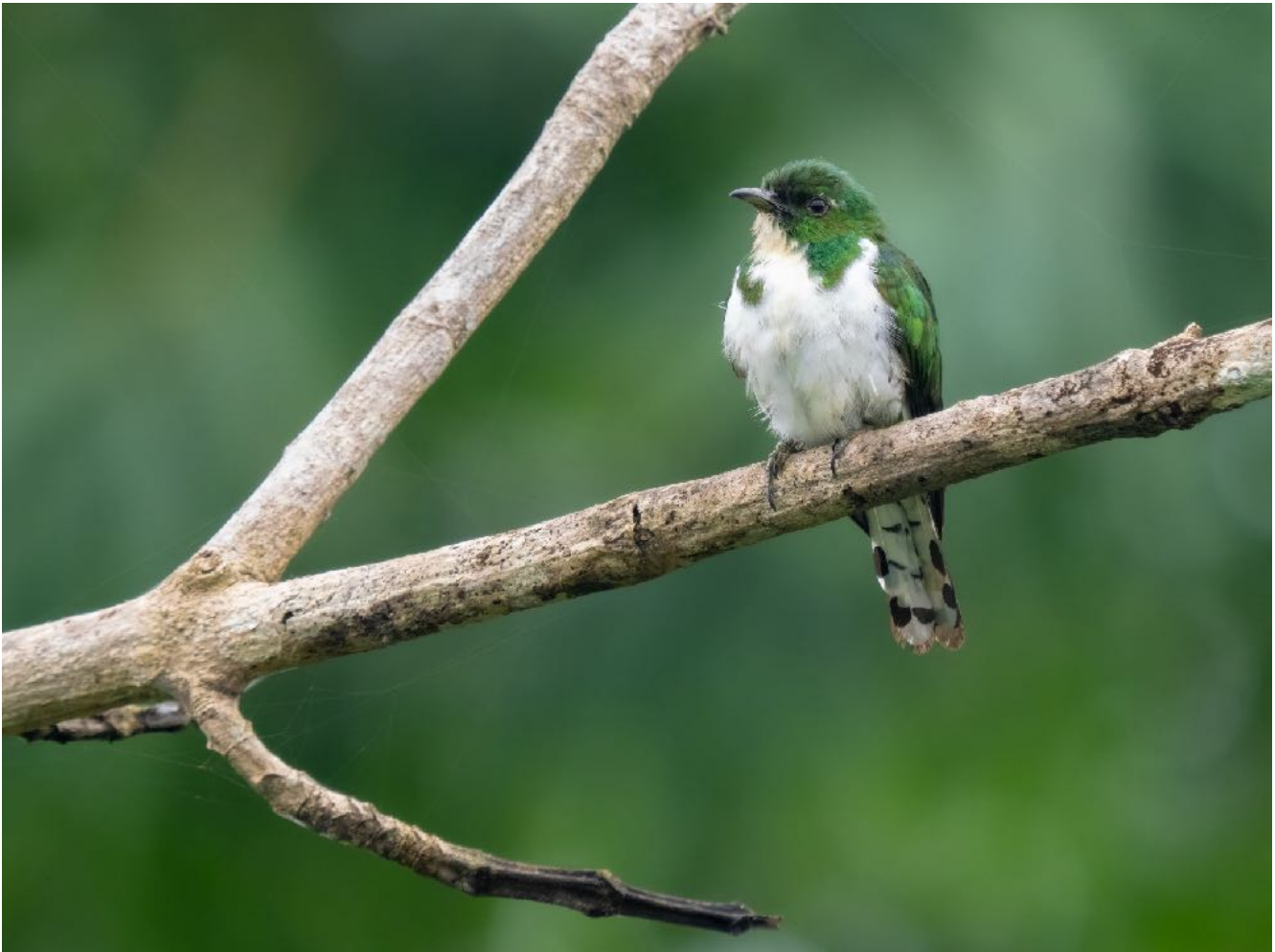
Klaas's Cuckoo

What a fun morning. We returned back to “another farm area north of Kakum”, mostly to try and get some better views of the flufftail but also to try for some other open country birds we missed the previous afternoon. I particularly like open country stuff for the photo opportunities, which were fairly numerous today! En route along the highway, we added a fun; Black-winged Bishop and Bronze Mannikin to our now extensive bird list.