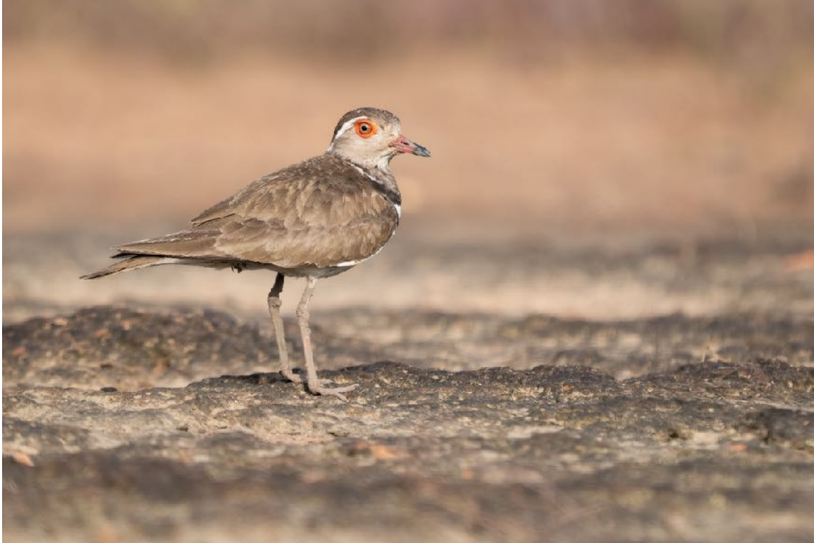
Forbe's Plover