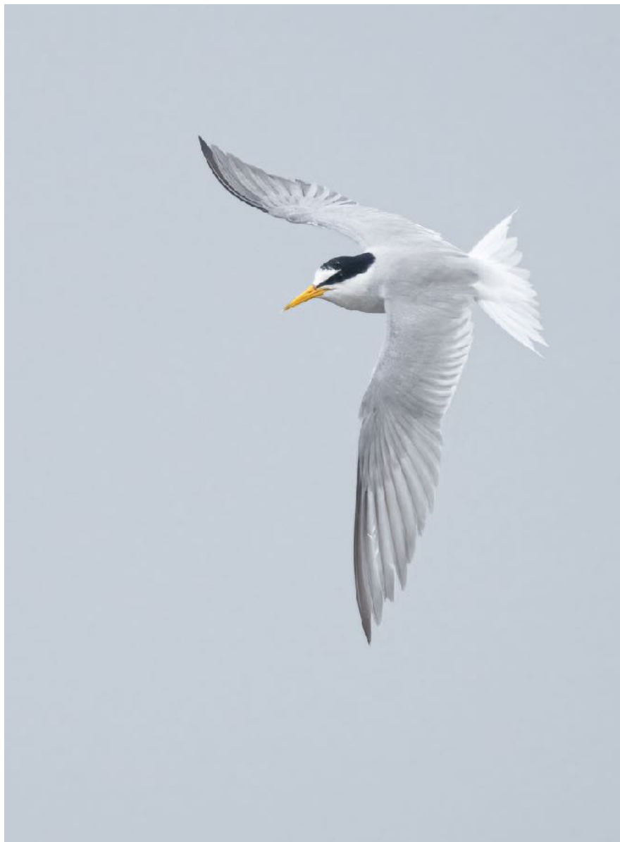
Little Tern

Today we begin the main tour with a trip from our hotel in Accra to Winneba Lagoon . It is important to hit this area on a decent tide and we did just that. The tide was good and we were able to pick up some decent species. We started off enjoying several Piapiac actively cleansing a baby goat of parasites and other insects. We then saw a huge colony of Village Weaver the odd Black-winged Kite kept us entertained between the main showing of birds we were scoping from the mudflats. Here we managed to tick; Little, West African Crested and Common Tern, Spur-winged Lapwing, Great and Little Egret, Western Reef Heron, Common Greenshank and Common Redshank, Ruddy Turnstone, Black-winged Stilt, White-fronted and Black-bellied Plover, Common Sandpiper, Pied Kingfisher, Whimbrel, and Marsh Sandpiper.