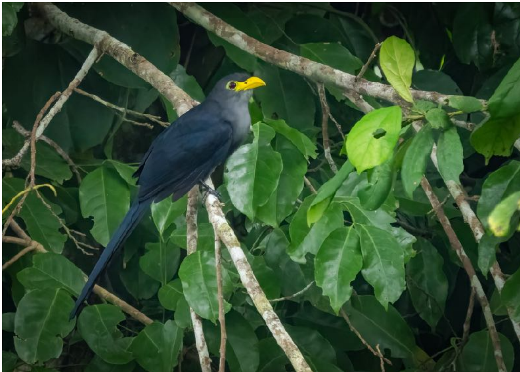
Blue Malkoha