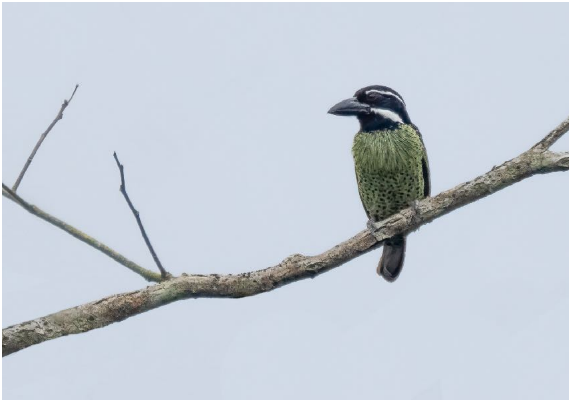
Hairy-breasted Barbet

Well what can we say...we want this bird! We decided to try our luck again up Atewa Hill for another shot at the Blue-mustached Bee-eater. We knew we couldn't go all the way up because of timing reasons but we still gave it a go. On the way up the hill in some of the more disturbed habitat we started with two great birds, a Black-and-white Shrike-flycatcher and a Naked-faced Barbet . We continued to climb and more great birds like; African Forest Flycatcher , Ayer's Hawk Eagle , Buff-spotted Woodpecker , Yellow-mantled Weaver , Velvet-mantled Drongo , and some brief but confirmative views of White-tailed Alethe . We also saw some interesting insect life. Some unidentified worm type larvae doing a community style caterpillar movement kept us entertained in a freaky kind of way and a stunning moth that mimicked a dead leaf to near perfection provided some entertainment as we argued which "leaf" was actually the moth...haha - lot's of fun! When it came down to it, it was time to leave and we still couldn't find the bee-eater. Really too bad but again, a terrific effort on all accounts. Just as we were about to leave, the sharp eyes of one of the guests spotted a great bird, a stunning Hairy-breasted Barbet so we piled out of the car and had some great views of a great bird just before a long drive to back to Accra. The rest of the afternoon was spent enjoying the pool, repacking and prepping ourselves for the start of the main tour. After a nice dinner, we hit the sack.