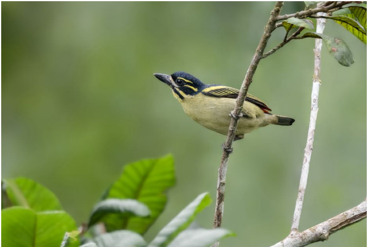
Red-rumped Tinkerbird

This is quite an interesting area as it is sort of disturbed farmland right on the edge of pristine forest. Because of this you get a cool mix of birdlife that is sometimes hard to see in the denser forests and you also get some great open species. During the first part of our afternoon, we added; African Green Pigeon, Blue-throated Brown Sunbird, Buff-throated Sunbird, Crested Malimbe, Little Bee-eater, Little Greenbul, Simple Greenbul, Black-and-White Mannikin, and Black-headed Paradise Flycatcher. As we walked closer to the start of the hill climb (the gate), one of our primary targets for this area started to call. A few teaser flight views later, and we finally had some great perched views of the secretive little Yellow-throated Cuckoo. Such an awesome bird and it was definitely a great feeling to finally get eyes on it.