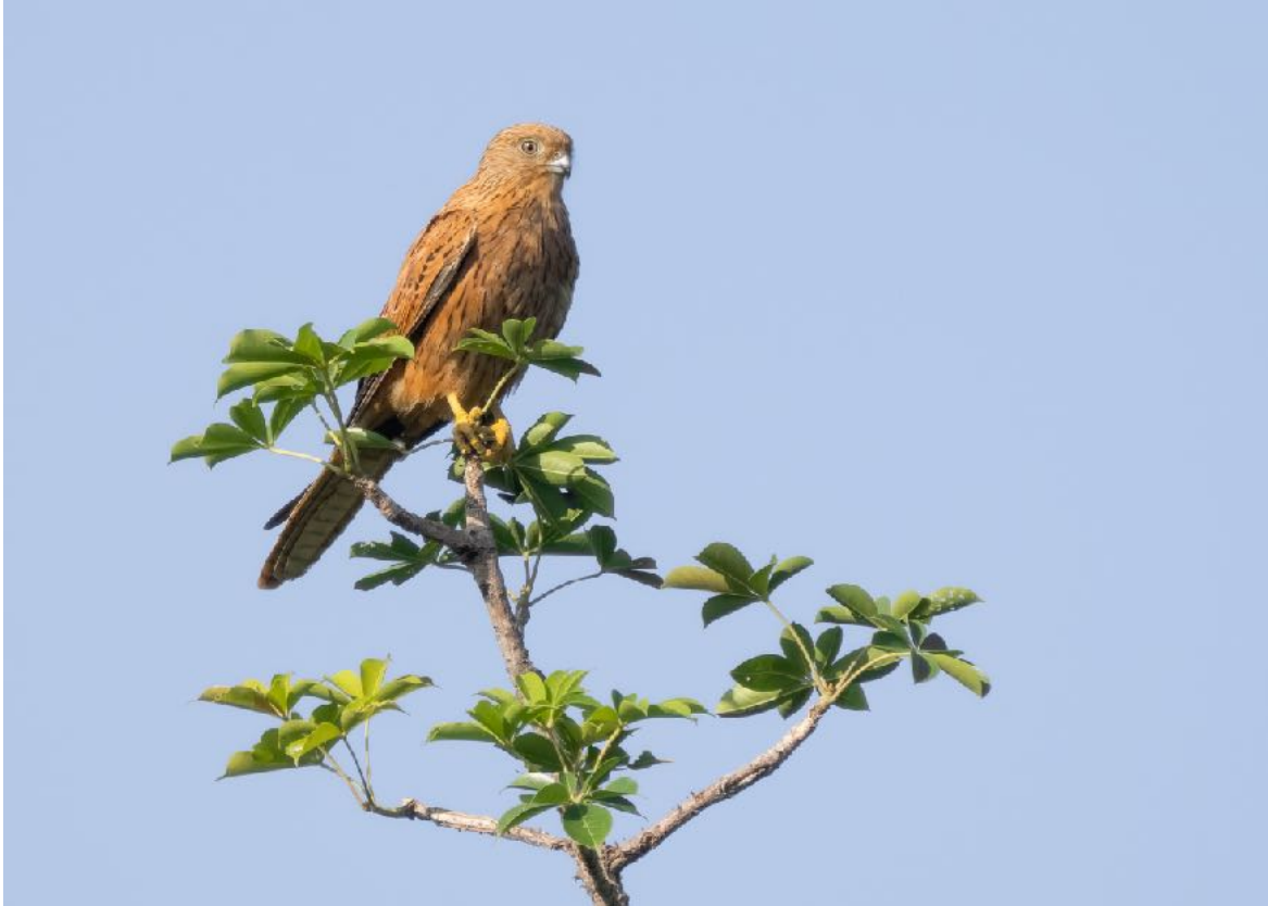
Fox Kestrel