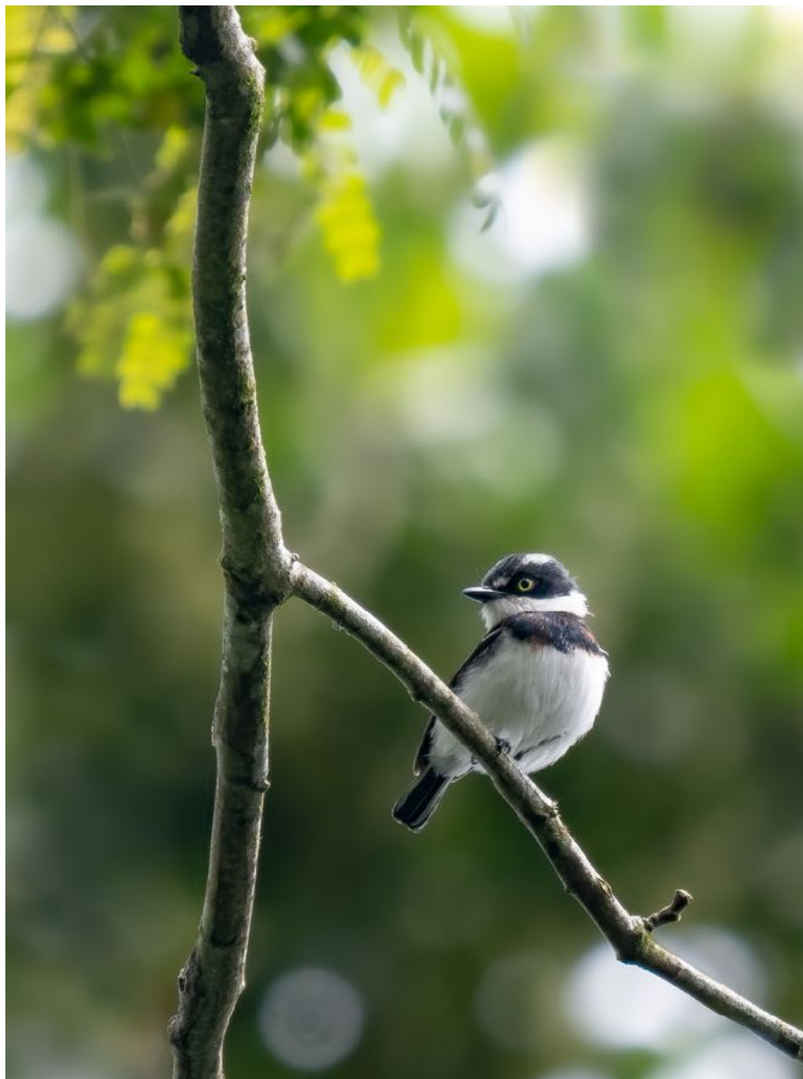
West African Batis

Even though we dipped on that bird, we did see some great stuff. Highlights included; Puvell's Illadopsis , Green and Tit Hylia , White-breasted Nigrita , Plain, Golden, Western Bearded, Red-tailed, Gray, Honeyguide , and Slender-billed Greenbul , Square-tailed Sawwing , Red-headed and Blue-billed Malimbe , Black-capped and Sharpe's Apalis , Finsch's Flycatcher Thrush , Chestnut-capped Flycatcher , Tiny, Green, Olive and Fraser's Sunbird , Red-billed Helmet-shrike , Yellow-billed Turaco , Chocolate-backed Kingfisher , Long-tailed Hawk , West African Wattle-eye , Western Black-headed Oriole , Western Nicator , Shining Drongo , Maxwell's Black Weaver , West African Batis , Black Cuckoo , Black-throated Coucal , Black Bee-eater , and finally just on the way out, a stunning little African Pygmy Kingfisher ...an impressive list huh?! It's a tough walk and some tough birding but great overall success for the day on the hill!