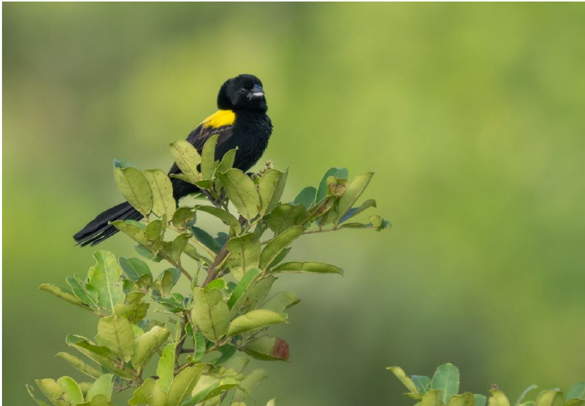
Yellow-mantled Widowbird