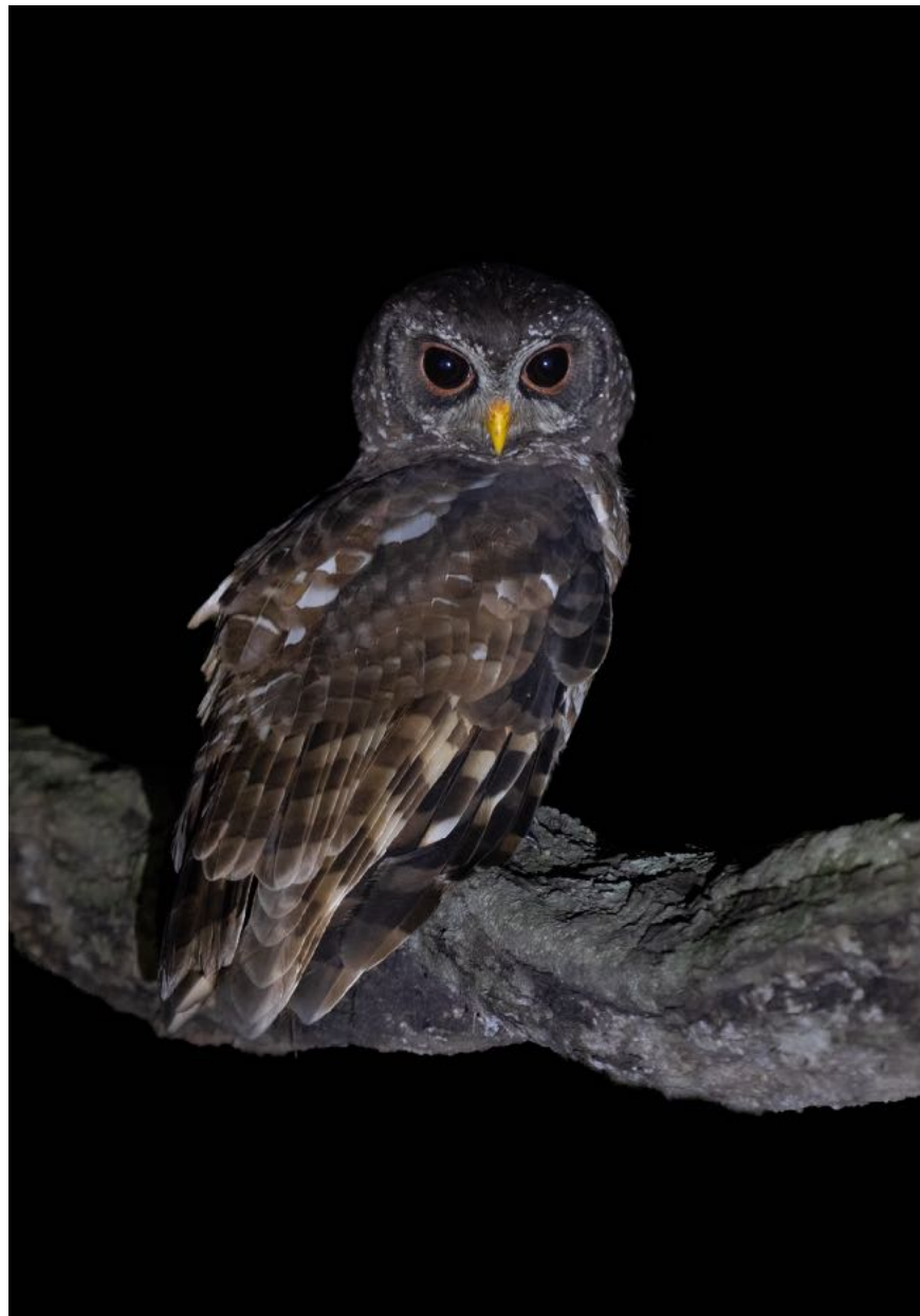
African Wood Owl - Photo by Guide: Ben Knot

Well what can you say, sometimes birding is just slow. Our afternoon was that way as we re-entered Ankasa Reserve . This time, we walked a good portion of the road. We picked up almost nothing new visually except a very brief flight view of Congo Serpent Eagle . Lots of new “heard-only” birds but nothing in the way of new species were seen. This happens sometimes and the only thing you can do is return to the lodge and enjoy a nice dinner. So we did! Then the afternoon was saved when the training guide came running up to us and said we should follow him. He and our main local guide had found a stunning, low down, out in the open African Wood Owl . A fantastic way to cap off a great dinner and a great bird to “save” an otherwise slower afternoon. That’s birding for ya!