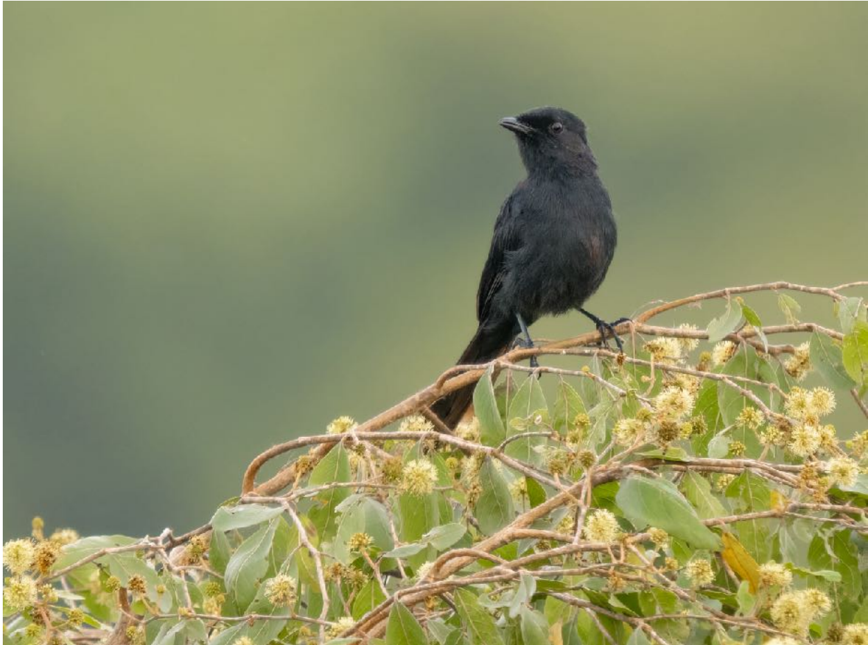
Northern Black Flycatcher

After a really nice break and lunch, we hit the road again, being sure to pick up our ranger friend and his bolt action protective gear. The afternoon was a bit slower but then again, they always are. We went into more of the grassland areas where we were really introduced to the Tsitzy Fly population of Mole NP. We persevered through the flies to tick; Sun Lark, Forbe's Plover, Brown-rumped Bunting, Striped Kingfisher, White-fronted Black Chat, White-throated Francolin , and the striking Black-crowned Tchagra .