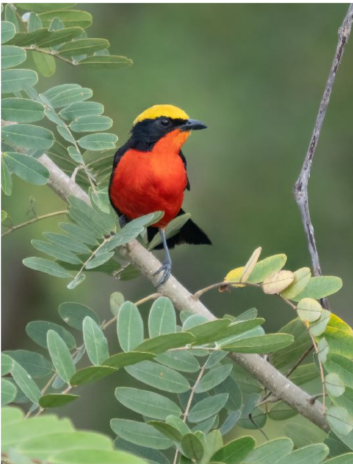
Yellow-crowned Gonolek

Today was our last really big travel day. The total distance from Mole to Bolgatanga takes about 6-hrs to cover so we weren't in a huge rush to leave Mole and when we got on the way, we planned a few stops en route but mainly we just wanted to get there. Before all of that though, we had a nice birding session around the lodge. Mole Motel is actually a really nice birding destinations which is one big reason we stay here. Around the grounds we added; Pied-winged Swallow , Red-throated Bee-eater , Black Crake , Great Spotted Cuckoo , Yellow-crowned Gonolek , African Paradise Flycatcher and for the last time, we enjoyed watching a group African Elephants cool themselves down in the pool below the motel.