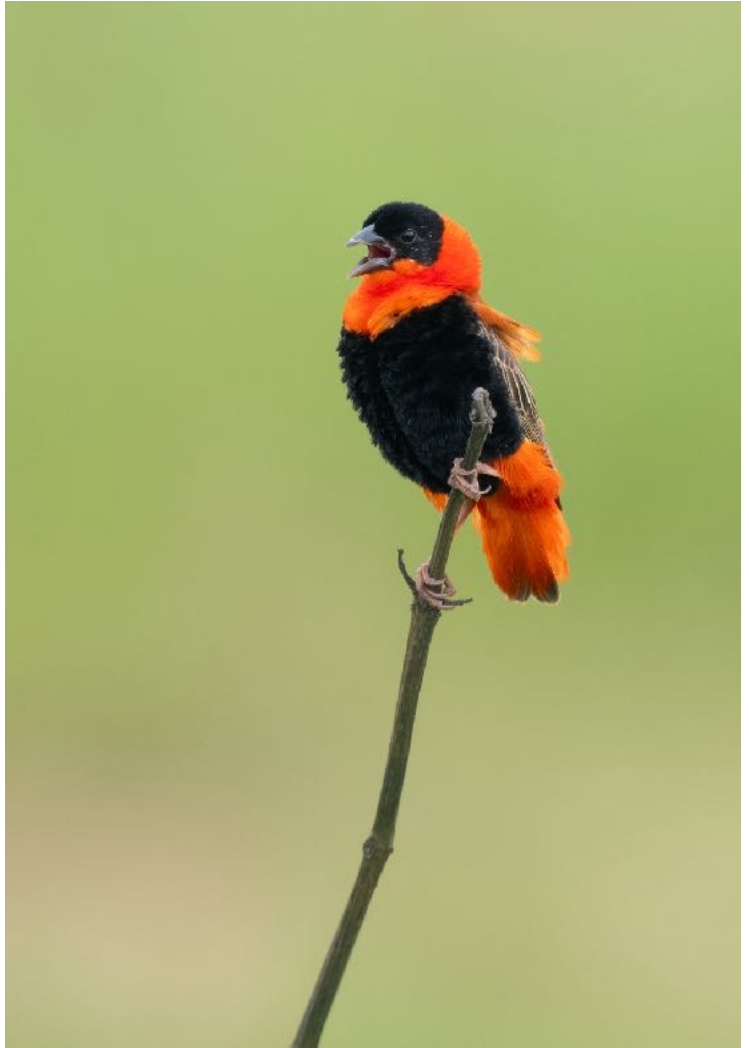
Northern Red Bishop

This afternoon was quite slow. We had done so well in the park that we were just now looking for very tough species. We spent the majority of the afternoon looking for African Spotted Creeper but unfortunately came up short during our search. We spent a few hours walking a section of road that by all means had quite a bit of activity on it but not much new, which at this stage is expected. Sorting through all of our usual Mole birds we added two new birds; Swallow-tailed Bee-eater and African Golden Oriole to the list. As night set in, we hit the airstrip to wait for our night-time target to make its presence known. It took all of about 30-min for us to get our bins on a cute little African Scops Owl . Very nice to catch up with this bird since we only had it down on our list previously as a heard-only way back during our time in Shai Hills at the beginning of the tour. We returned back to the hotel for our dinner and then hit the hay, ready to venture up towards the Burkina Faso border tomorrow to look for a very special bird.