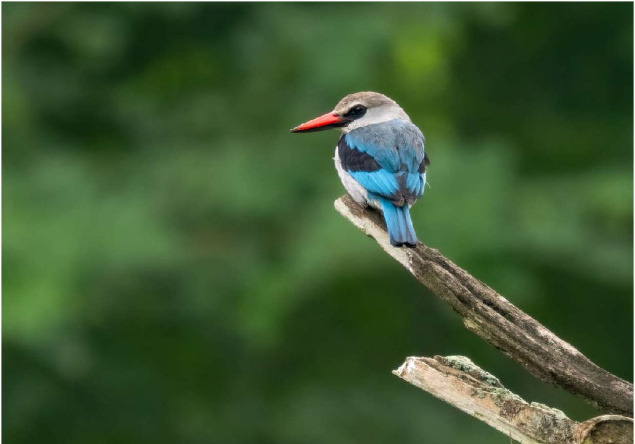
Woodland Kingfisher

Today was the first day of the tour and we were all excited to get started. We began with a fun location called Legon Botanical Gardens . This is an interesting local city park that hosts a variety of attractions like a small canopy walk, lagoon canoeing and a few interpretive signs that keep guests entertained. We were entertained thoroughly with an introduction to the local birds like; African Thrush, Guinea Turaco, Green Woodhoopoe, Yellow-fronted Tinkerbird, White-crowned Robin Chat, Oriole Warbler, Brown Babbler, Western Plantain-eater, Purple Starling, African Gray and Northern Red-billed Hornbill, Woodland Kingfisher, Broad-billed Roller and Splendid Sunbird. The lagoon itself hosts a variety of fun nesting waders like; Black-crowned Night Heron, Western Cattle Egret and Long-tailed Cormorant. Around the lagoon we also added Squacco Heron, Striated Heron and a surprise Black Heron. A very nice morning indeed!