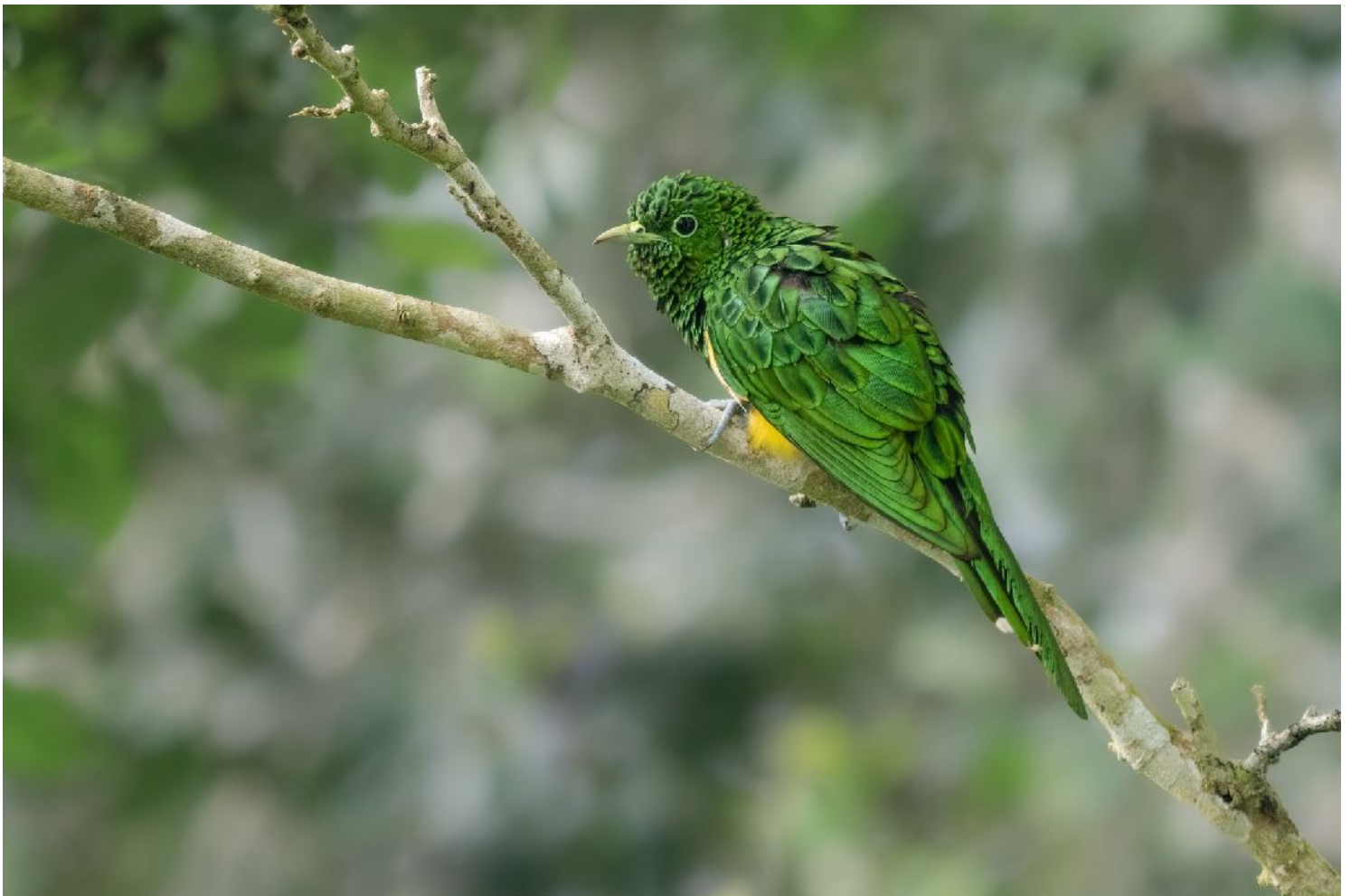
African Emerald Cuckoo