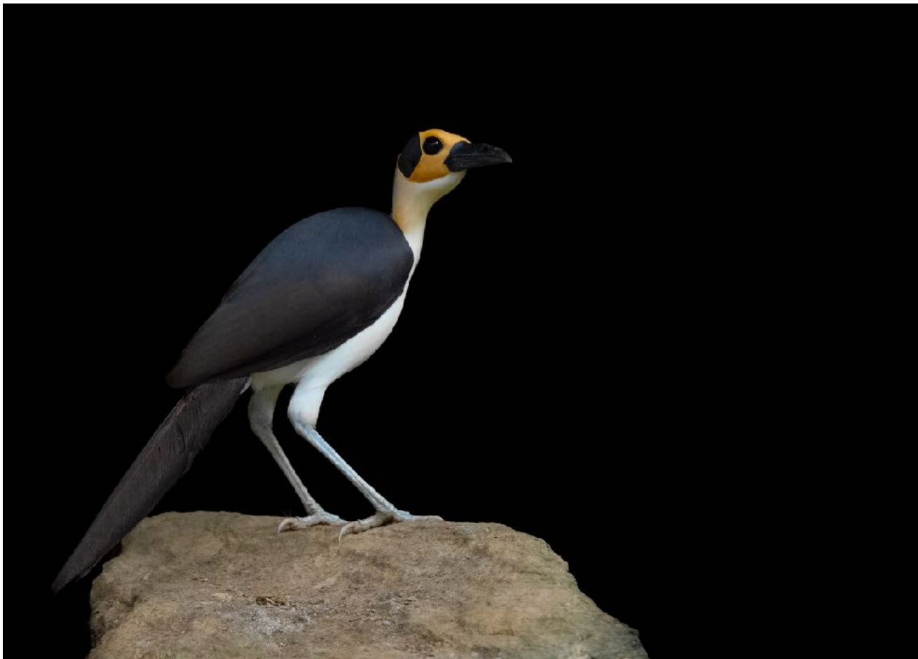
White-necked Rockfowl (Picathartes)