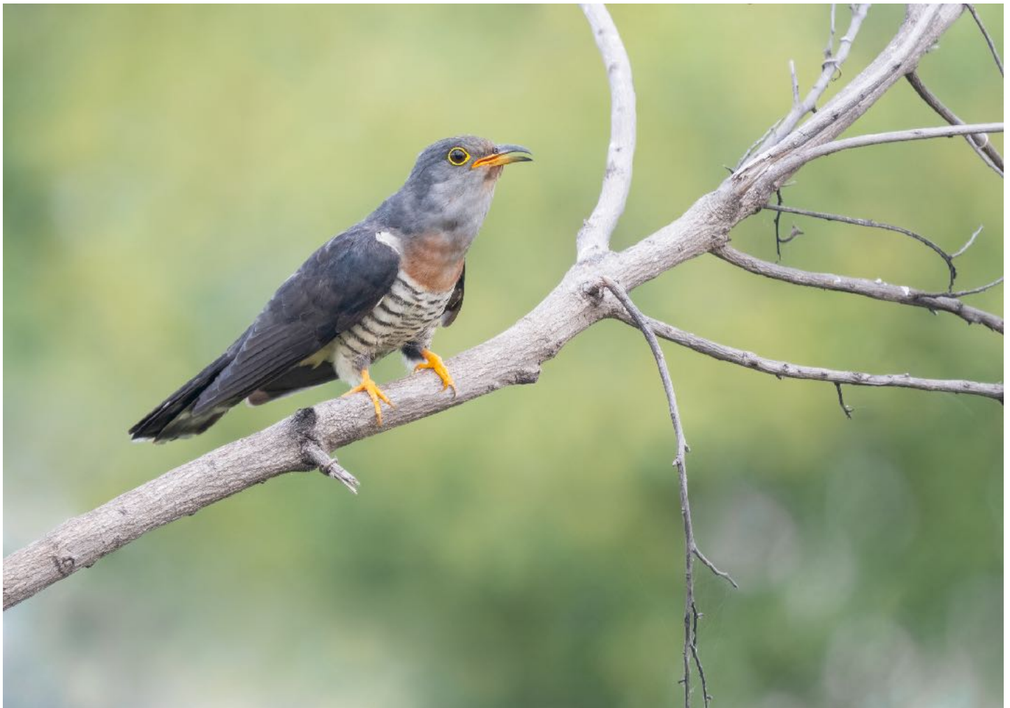
Red-chested Cuckoo

Right from the gate of Mole National Park we had some great views of our first of many Stone Partridge . We entered the park and just meters in we had our first sightings of Bushbuck , Common Warthog and Kob , some fun mammals to add to our growing bird list. Then, a MEGA. A stunning male Abyssinian Ground Hornbill right alongside the road...epic. Now it was time to head into the hotel, check in and get settled after that long day. We arrived around 4:30pm so we had about an hour plus to do a little birding around Mole Motel . Here we found; Pearl-spotted Owlet , White-shouldered Black-tit , Chestnut-crowned Sparrow Weaver , Hadada Ibis , Hammerkop , Red-chested Cuckoo and a female Senegal Batis . A great start to our savanna birding for sure. Time for bed to prep for an early morning and a full day in Mole NP tomorrow!