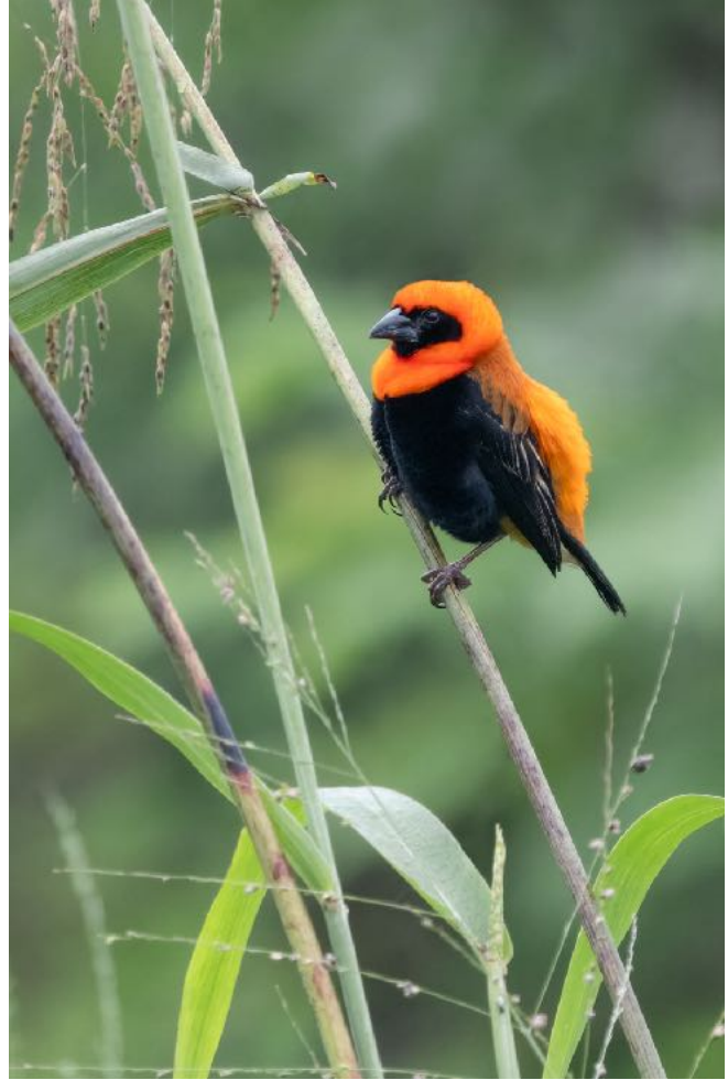
Black-winged Bishop