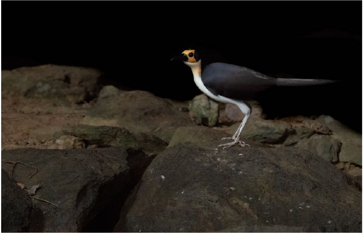
White-necked Rockfowl (Picathartes)