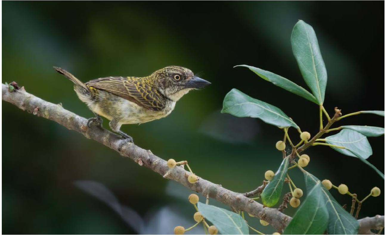
Speckled Tinkerbird