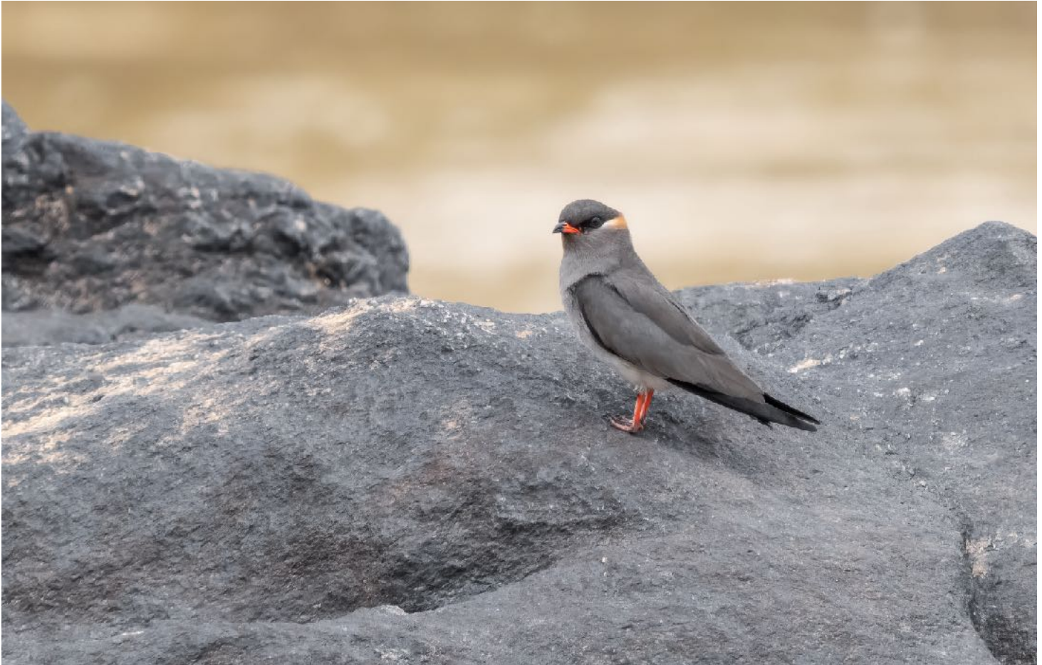
Rock Pratincole

After a great rest we spent the entire afternoon in another farm area north of Kakum . Here we had one target, another try at the skulking White-spotted Flufftail. On our way to our spot, we didn't see too many new birds, only the strikingly beautiful African Jacana . This "Jesus Bird" really is a natural marvel, even if we only saw it walking around with some chickens and not strutting its stuff on the nearby lily pond. Time for the main show. After a fairly short walk and some ducking in and around palm trees, we arrived at a muddy little creek with a small viewing area. It took several minutes of waiting and after very very quick glimpses we finally were able to have an only "quick" (rather than very very quick!) glimpse of the beautiful White-spotted Flufftail .