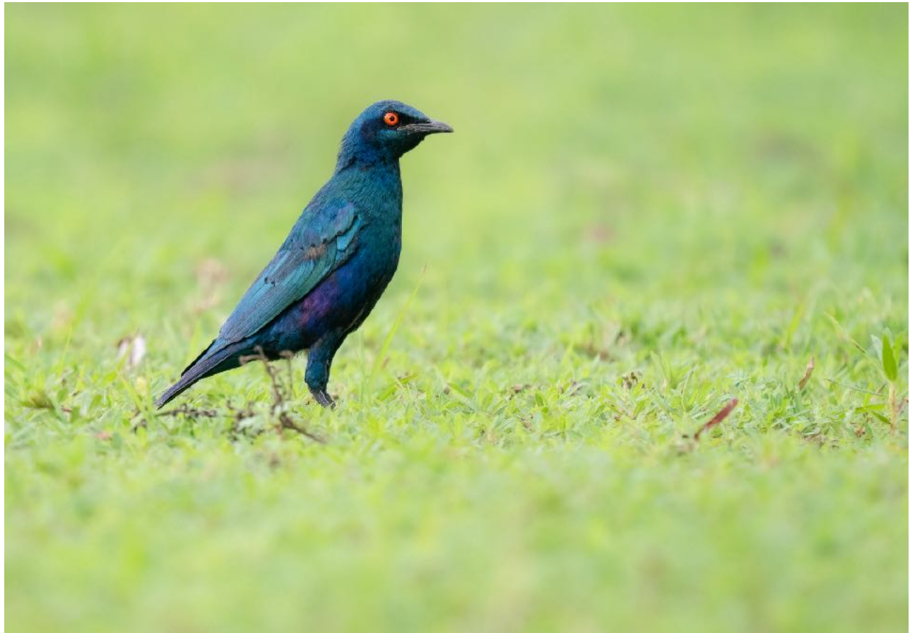
Greater Blue-eared Starling

Not only is today the last full day of birding but it is also quite a critical one! We start early and head towards the border with Burkina Faso and bird the White Valto River for a very special bird. Before that, we have to get there. Our destination is approximately two hours away from our hotel so naturally, en route to White Valto River , we were able to pick up a few things. First up, a stunning Red-necked Falcon . Love that bird. Now in the farmland and villages before the river we added; Greater Blue-eared, Chestnut-bellied and Bronze-tailed Starling, White-rumped Seed-eater, White-billed Buffalo-weaver, Abyssinian Roller, Red-rumped Swallow, Collared Morning Dove , and some stunning close proximity flight views of Rose-ringed Parakeet .