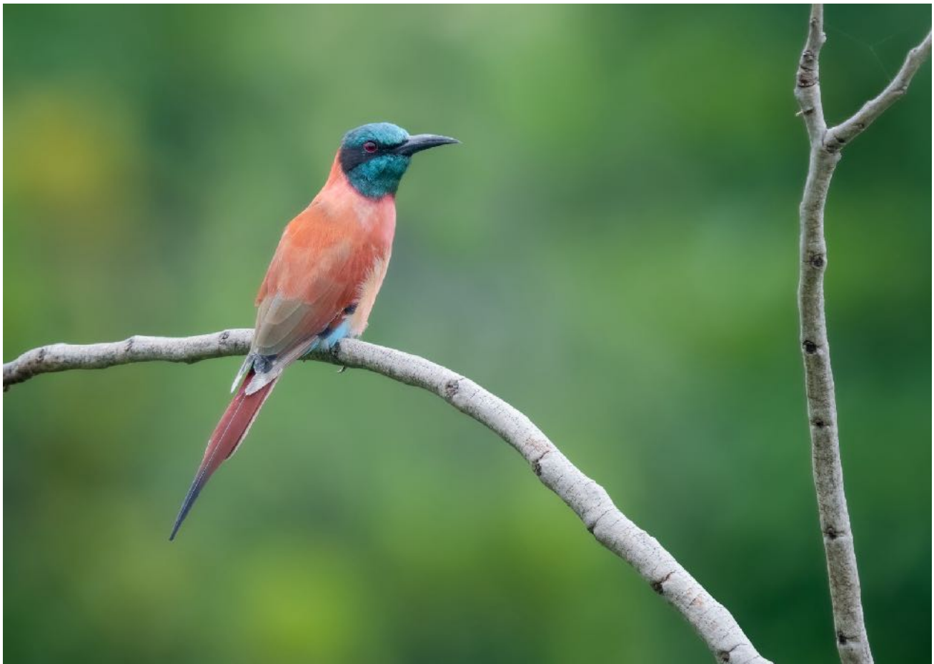
Northern Carmine Bee-eater