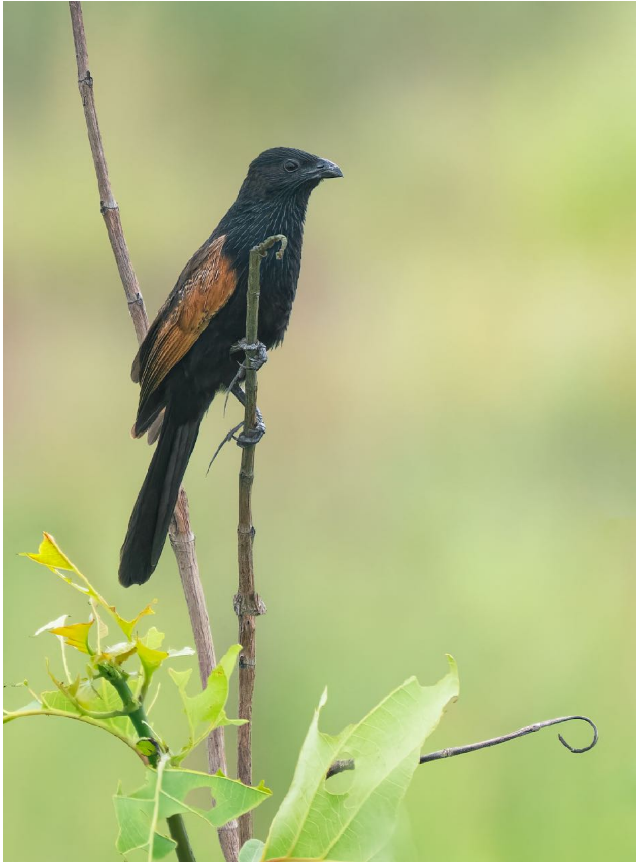
Black Coucal (Last bird of the trip deserves a full page spread!)