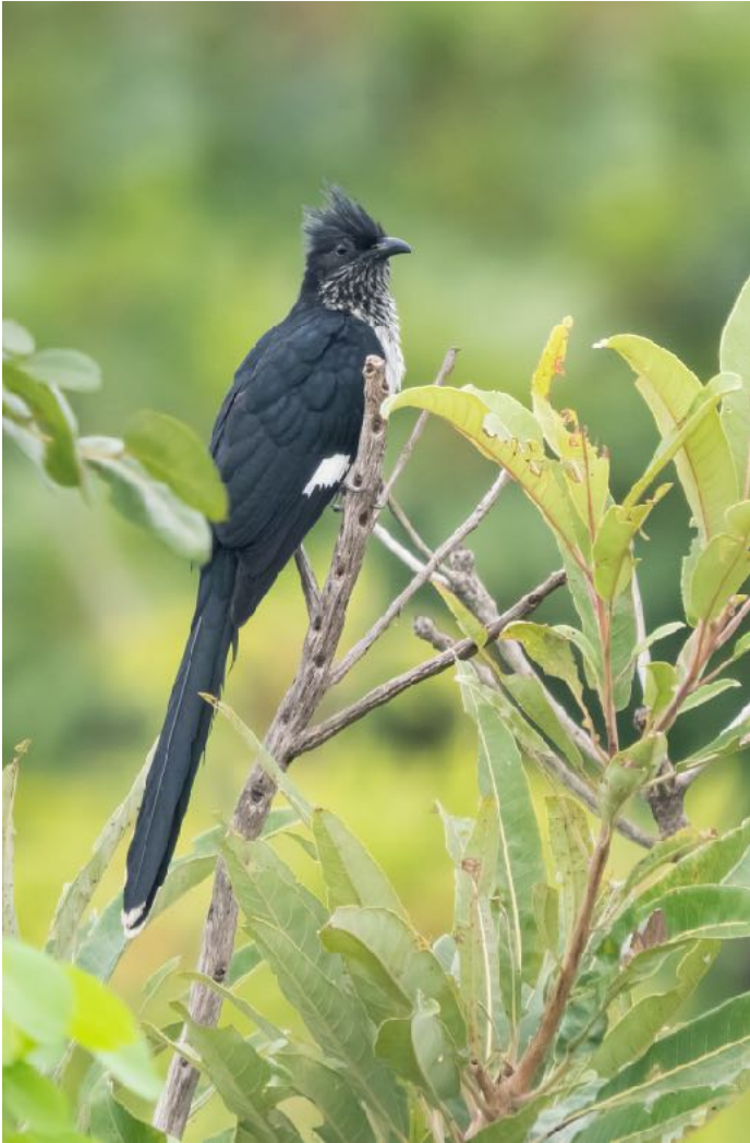
Levaillant's Cuckoo - Photo by Guide: Ben Knoot