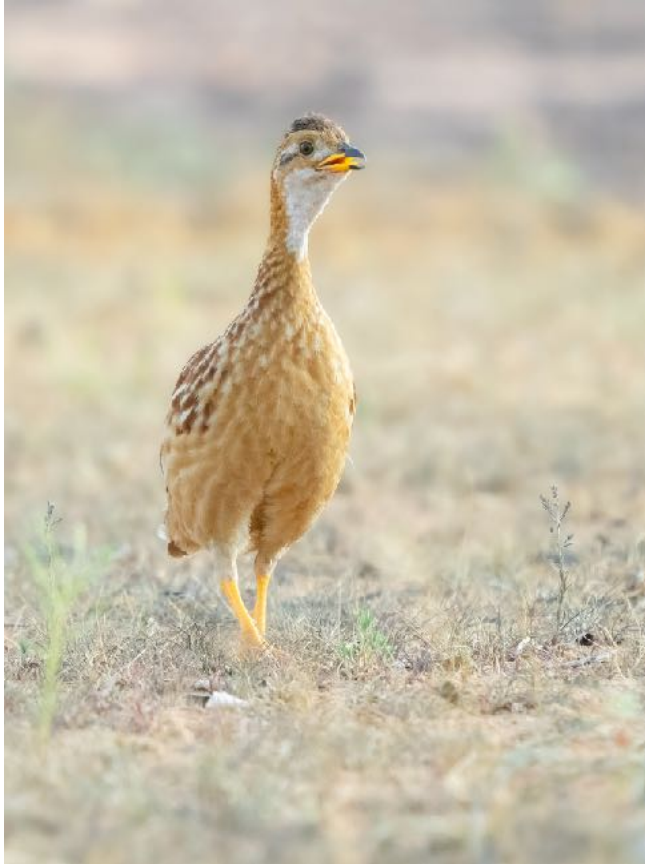
White-throated Francolin