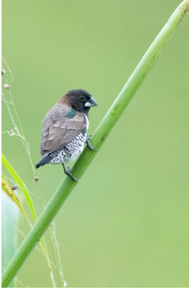
Bronze Mannikin