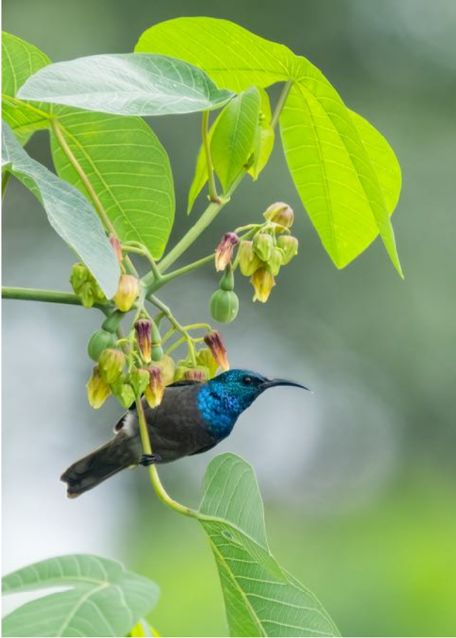
Green-headed Sunbird