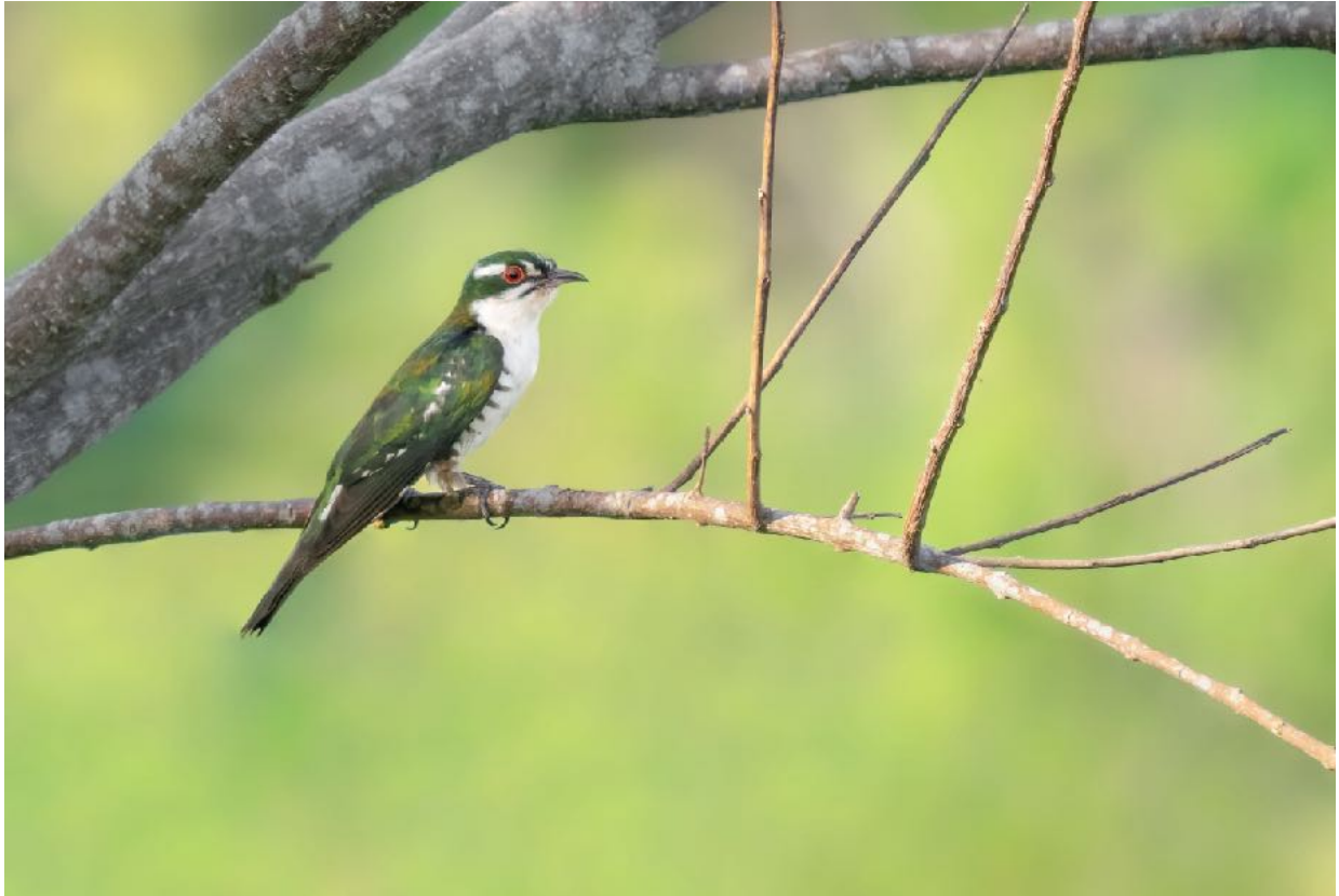
Dideric Cuckoo