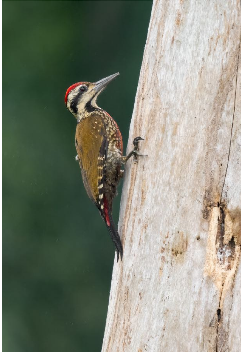
Fire-bellied Woodpecker