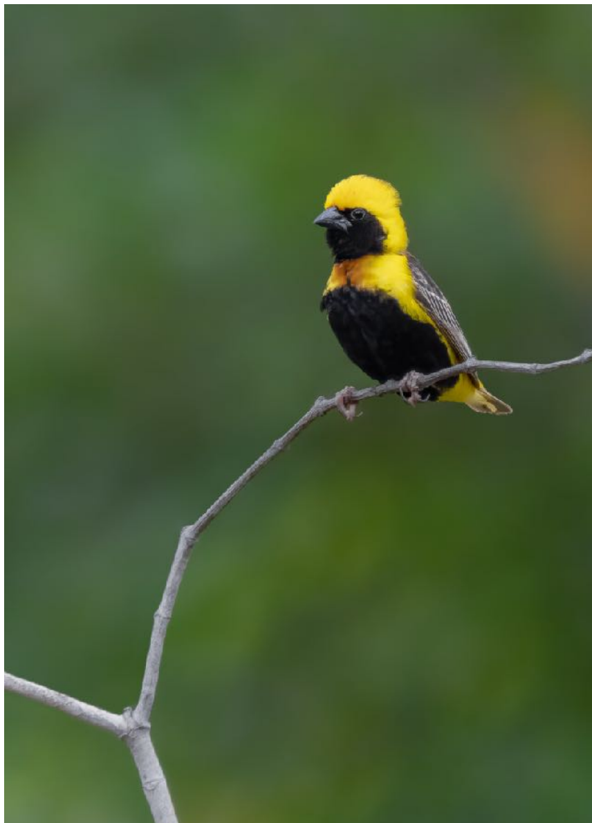
Yellow-crowned Bishop

Today was our first full day in Mole NP . We had an early breakfast, picked up our local armed ranger (required) and hit the road into the park. We walked a nice loop within the park to pick up; White-breasted and Red-shouldered Cuckooshrike, Black-faced and Red-billed Firefinch, Rufous Cisticola, Yellow-breasted Apalis, Lavender Waxbill, Northern Black Flycatcher, Red-billed Quelea, Beautiful Sunbird, Helmeted Guineafowl, Black-billed Wood Dove, Black-capped Babbler, Malachite Kingfisher, Sulphur-breasted Bushshrike, Sahel Bush Sparrow, White-backed and Hooded Vulture, Sharpe's Drongo, Western Violet-backed Sunbird, Village Indigobird, and a stunning male Yellow-crowned Bishop . Whew! Quite a nice morning right?!? We certainly thought so.