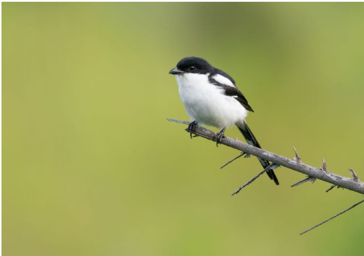
Northern Fiscal