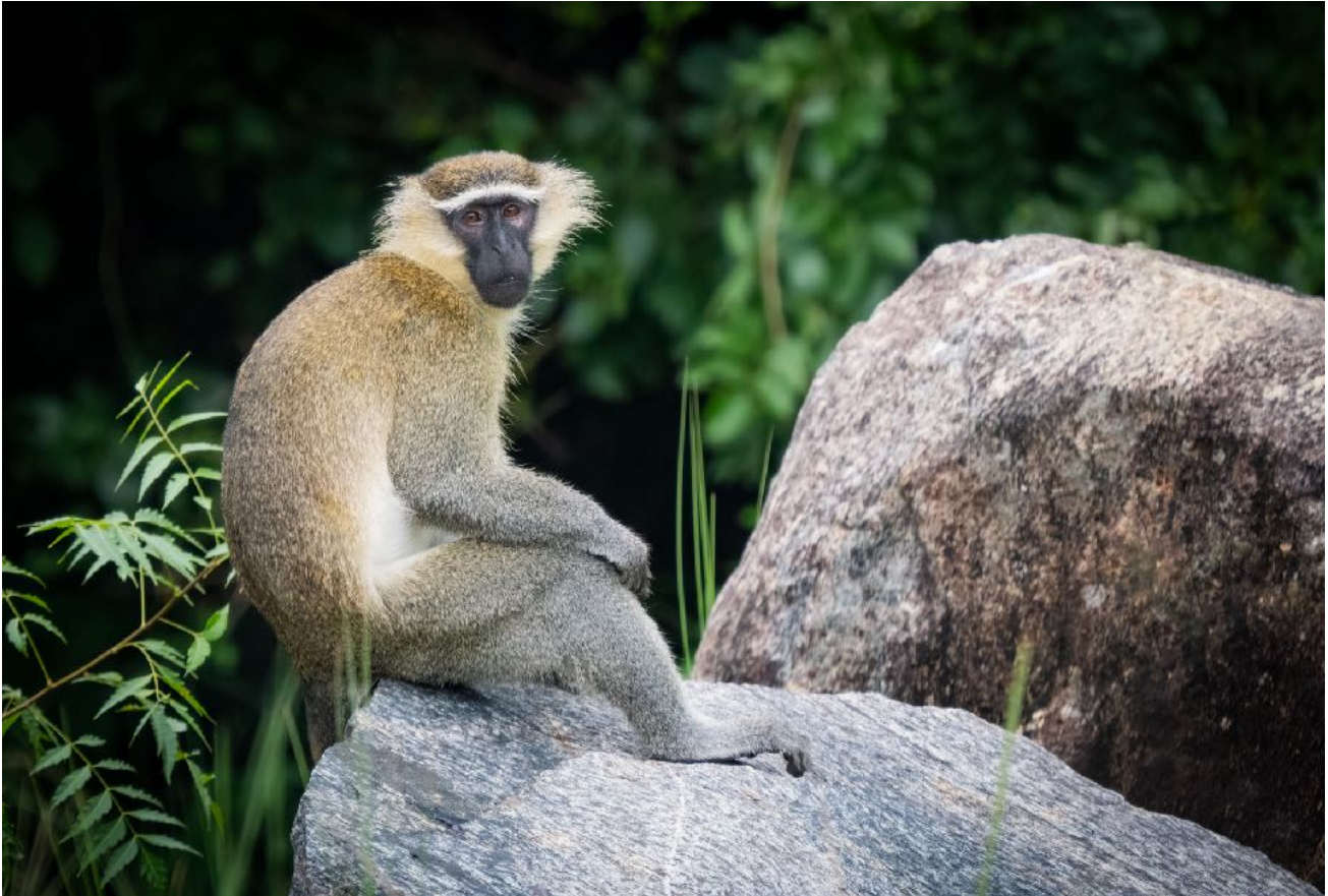
Vervet Monkey

Much of the afternoon was then spent driving towards our main location for the extension, the Atewa Hills region. The drive itself proved somewhat fruitful, netting us some cool birds but nothing we wouldn't see again and again during the main tour. However, after a nice lunch, right after talking about it with one of the younger birders on the trip, he then spotted a lone Black Kite circling. This time of year these are not very common and this would indeed be the only sighting for this bird during the trip! Well spotted. Upon arrival at our hotel, we had a few hours of free time so a few of us decided to walk the gardens of the K'Archy Lodge where we found what we later dubbed, "the magic tree". A small fruiting tree in the back of the property that was bringing in some great birds...some that were usually a little tough to see! In those few hours we tallied up; Northern Yellow White-eye , Yellow-rumped Tinkerbird , Speckled Tinkerbird , Red-rumped Tinkerbird , Chestnut-breasted Nigrita , Gray-headed Nigrita , Common Bulbul , Olive-naped Weaver , Laughing Dove , and the oh so common, Green-backed Camaroptera . Away from the tree we also noted, African Palm Swift , Blue-headed Coucal , Northern Gray-headed Sparrow , Splendid Starling , Pied Crow and Pin-tailed Whydah . Now it was time to head out to our primary location for the afternoon, the lower farmlands and open country of Atewa Hill .