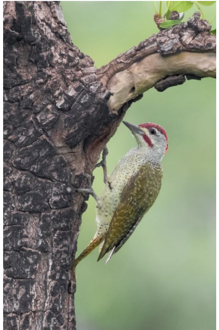
Fine-spotted Woodpecker

Now on one of the main ring-roads in Mole NP we continued our search for new targets. We added a really nice pair of Levaillant's Cuckoo and some nice Variable Sunbirds but other than that, we were reconnecting with species we had already seen before like Blue-bellied Roller , Lizard Buzzard , Yellow-billed Shrike , Yellow-fronted Tinkerbird , etc. One last stop off at Mognori River to pick up African Blue Flycatcher and some stunning Northern Red Bishops and then we were off back to the hotel for lunch and our afternoon break.