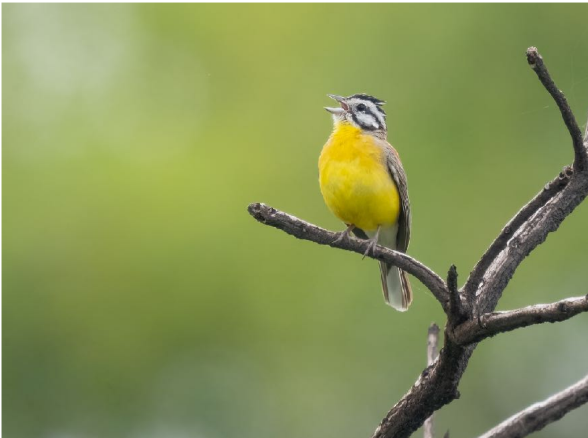
Brown-rumped Bunting