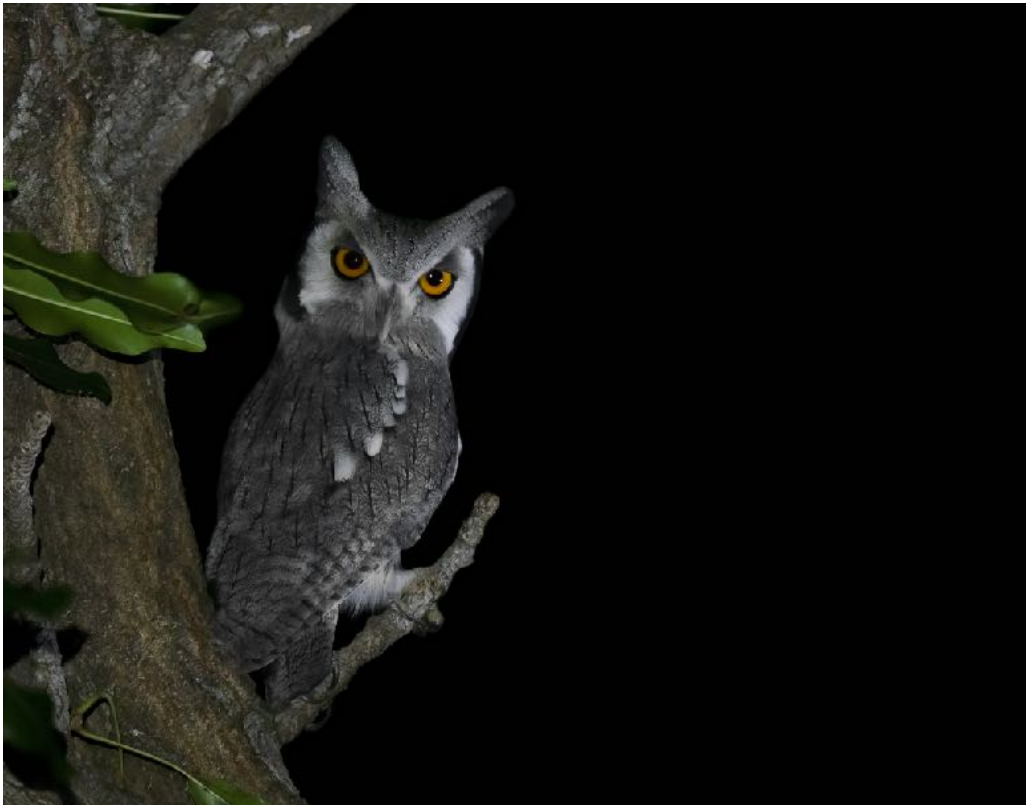
Northern White-faced Owl