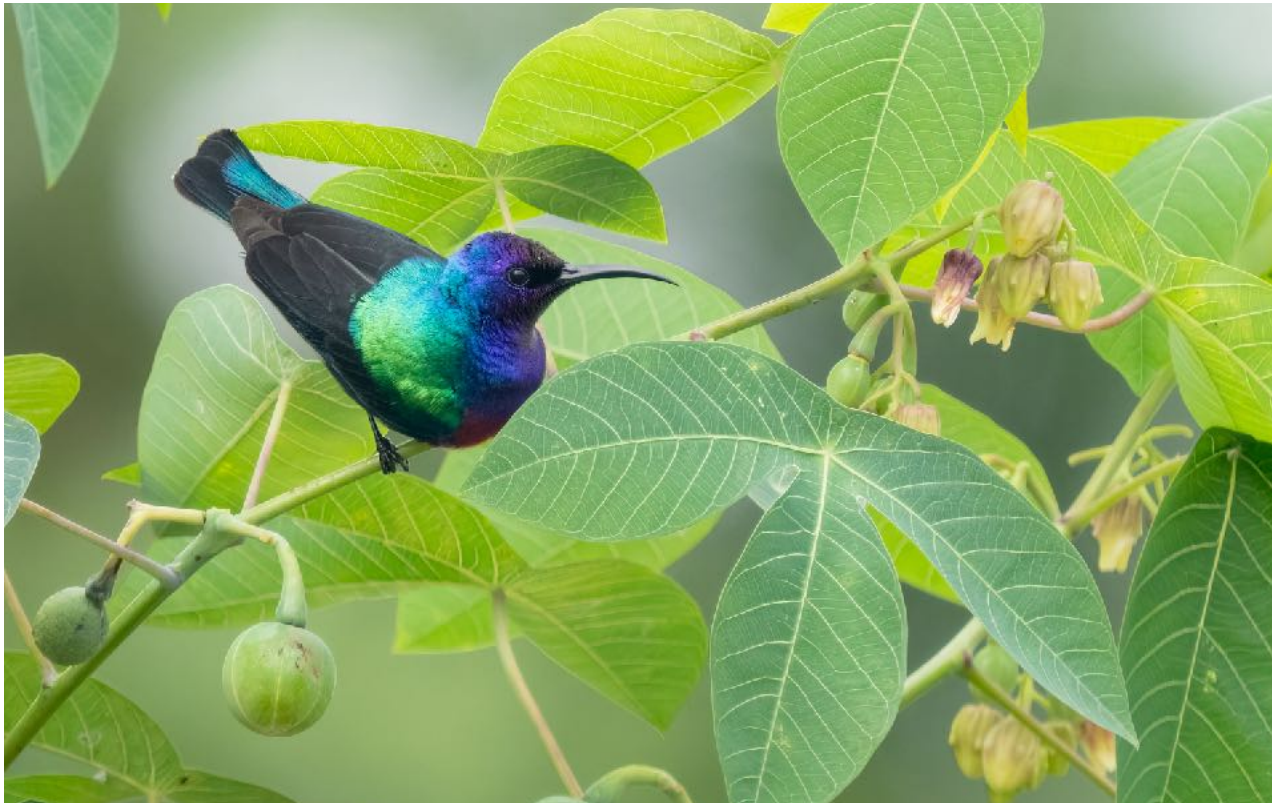
Splendid Sunbird - Photo by Guide: Ben Knoot

We took a short break for lunch and to let the heat of the day dissipate. Around about 3:30pm, we set off for a very cool open area called Shai Hills . The massive cliffs, foothill evergreen forests and open areas provided us with some great birds like: Copper Sunbird , Mocking Cliff Chat (the white crowned race), a distant soaring African Harrier Hawk , Croaking Cisticola , Double-spurred Spurfowl , Northern Puffback , Senegal Eremomela , Senegal Coucal , Vieillot's Barbet , Northern Crombec and the gigantic Mosque Swallow . We weren't quite done with Shai Hills yet. We sat and waited for dusk, among the calling African Scops Owl we did manage to see Long-tailed and Plain Nightjars on the drive out of the park. A nice first day!