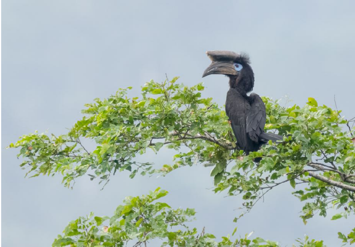
Black-casqued Hornbill - Photo by Guide: Ben Knot

Once we completed our morning here, we ventured back towards the hotel for lunch and our mid-afternoon rest. We noted a flowering tree just across the way from Rainforest Lodge that seemed to be attracting quite a few sunbirds. Among the already seen Splendid and Copper Sunbirds , we also added Green-headed Sunbird and then a pair of Magpie Mannikin were discovered nesting nearby. A nice pick up before lunch!