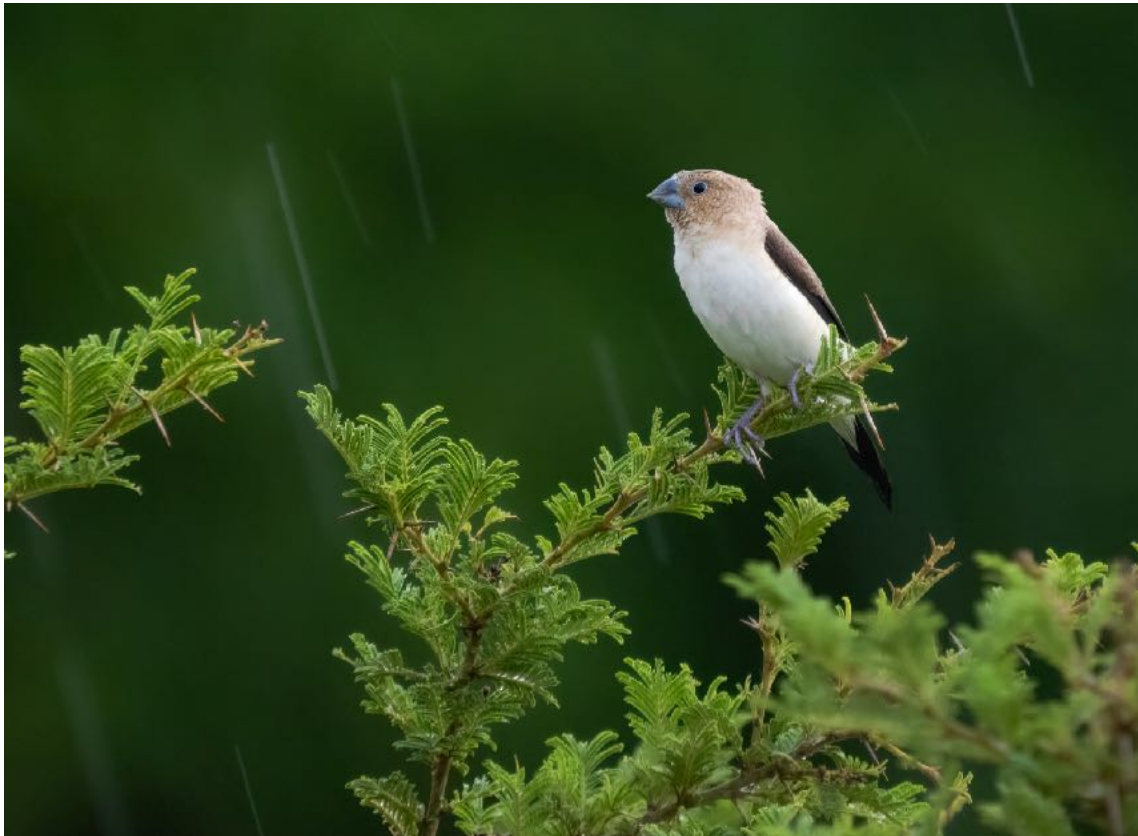
African Silverbill