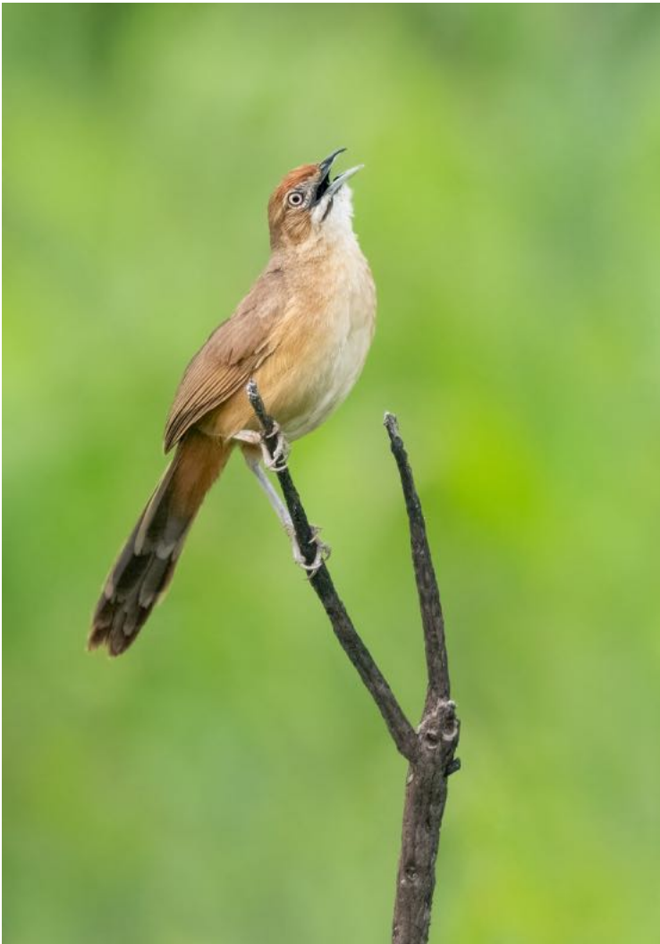
Mustached Grass Warbler

This, our second full day in Mole NP was more of a target chase sort of day rather than a flurry of new species as was the day before. We walked the road towards the airstrip where we found; Dorst's Cisticola , Fine-spotted Woodpecker , Brown-backed Woodpecker , Lesser Blue-eared Starling and a Mustached Grass Warbler .