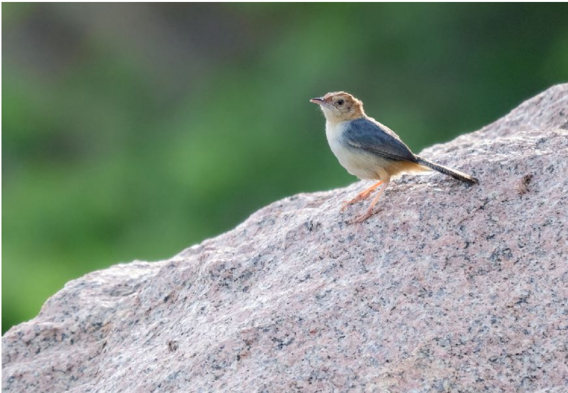
Rock-loving Cisticola