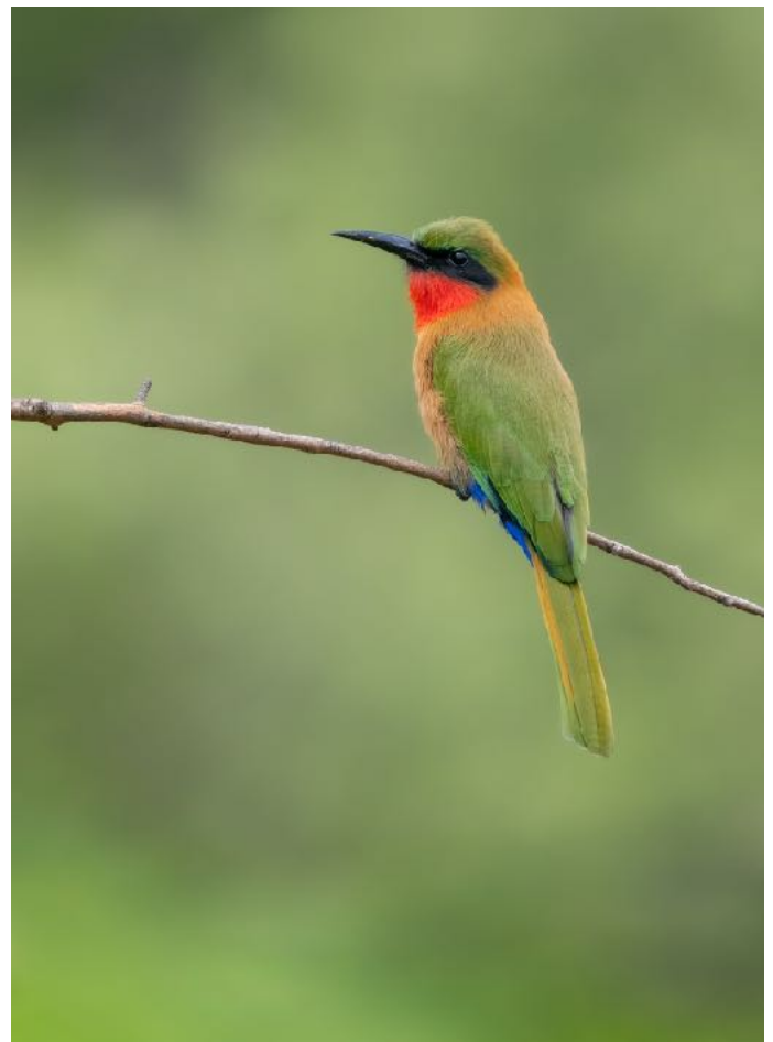
Red-throated Bee-eater

Now it was time to say goodbye to Mole. After paying our tab and turning in our keys we set off towards our first and really only cultural stop of the tour, a 600yr old mosque just a stones throw away from Mole. This was an interesting experience to say the least and a fun look into this small villages most prized possession.