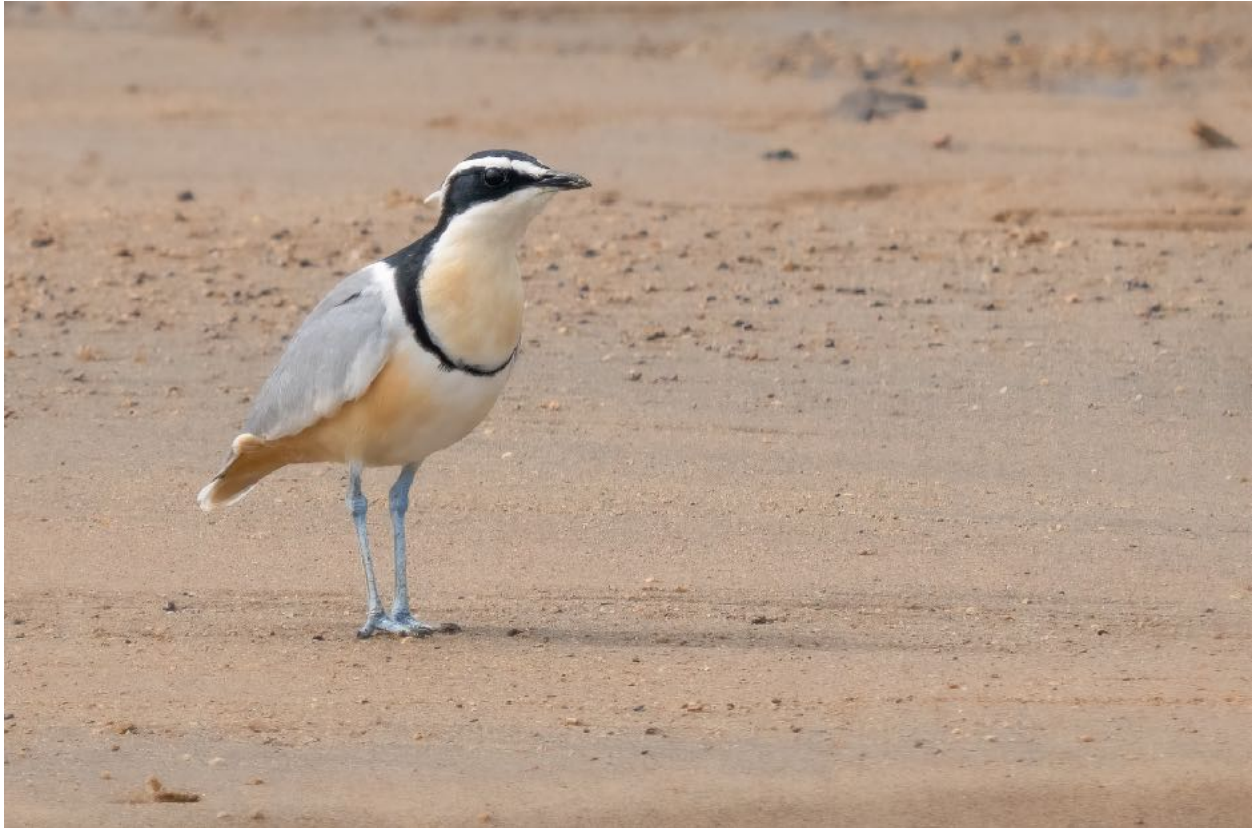
Egyptian Plover (both)