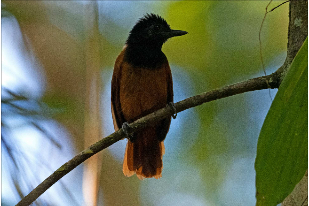
Female Cocha Antshrike at Sani Lodge

We also visited nearby Yasuni National Park, where we found Rusty-belted Tapaculo , Black-faced Antthrush , Elegant and Buff-throated Woodcreepers , White-bearded and Golden-headed Manakins , White-Shouldered and Banded Antbirds , Red-necked Woodpecker , Great-billed Hermit , Black-tailed Trogon , Short-billed and Pygmy Antwrens , and the cute Lafresnaye's Piculet . Also, on the local river islands we found Chestnut-bellied Seedeater , Yellow-browed Sparrow , Oriole Blackbird , Olive-spotted Hummingbird , White-bellied and Parker's Spinetails . At the end, our stay and visit to Sani Lodge was extremely successful. We had the lodge all to ourselves, found many of our specific target birds, and plenty more besides.