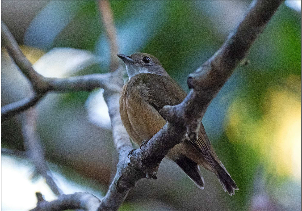
This Orange-crested Manakin was a very late addition at Sani Lodge

After that, it was time to take the boat back to Coca for another three hours upriver, where we didn't see too much, except for White-winged and White-banded Swallows , Gray-breasted Martin , and Snowy and Great Egrets . Once we get to Coca , we drove up to Narupa Lodge in the foothills of the Andes. Some brief birding on the way led us to finding Coppery-chested Jacamar , Rufous-winged Antwren , Montane Foliage-Gleaner , Scaled Fruiteater and another major target bird, a Chestnut-headed Crake . Eventually, we arrived at the lodge late in the evening ready for a warm supper.