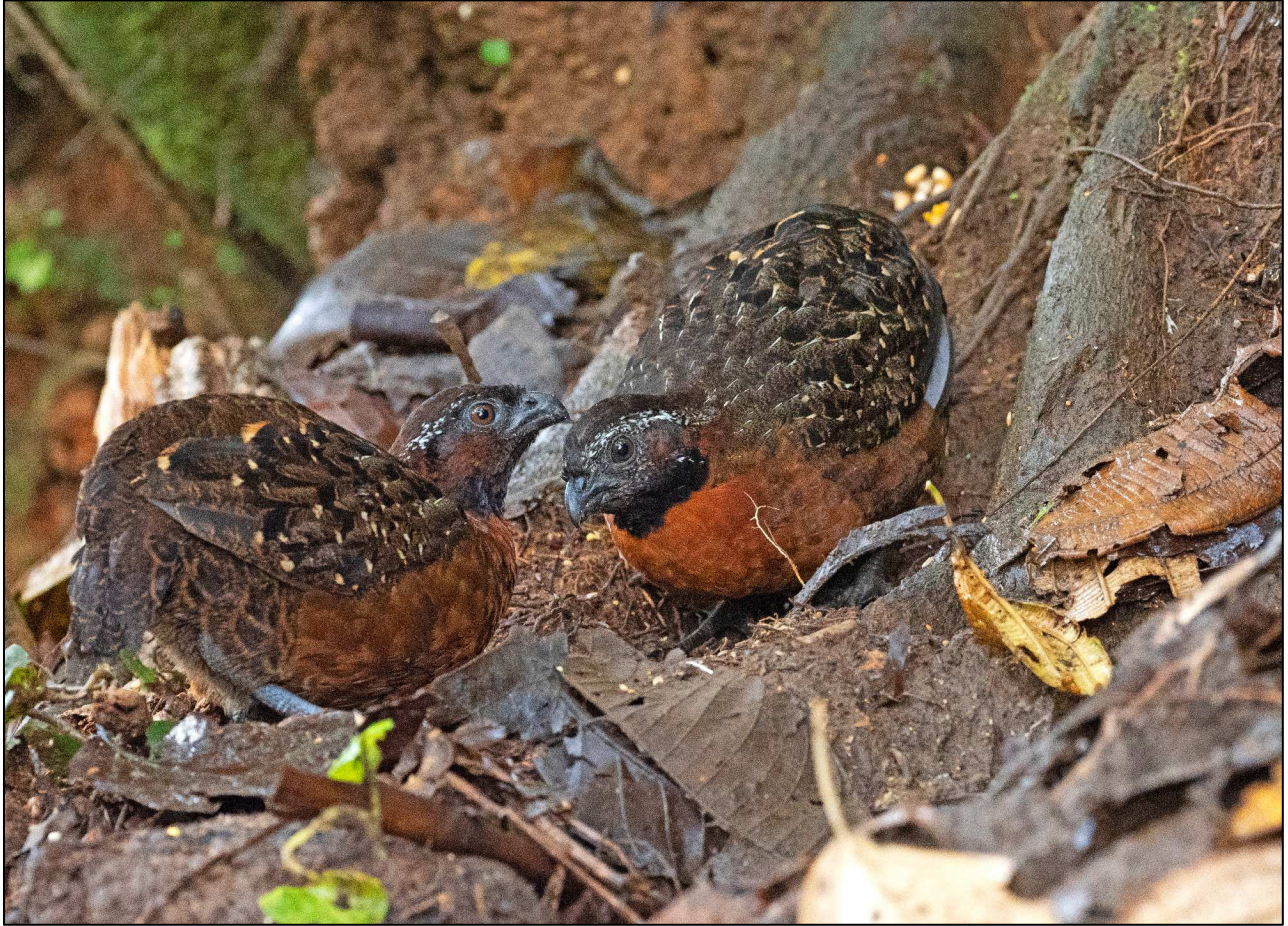
Remarkable views of Rufous-breasted Wood-quail at Wayra Reserve

Over the next two days we experienced some heavy rains, but that did not stop us from exploring both of the reserves, Narupa and Wayra , which share similar bird lists. Some of the highlights included Black-billed Treehunter , Montane Foliage-Gleaner , Olivaceous Greenlet , Orange-billed Sparrow , and an assortment of tanagers , including Silver-beaked , Yellow-bellied , Spotted , Golden-eared , Blue-necked and Paradise Tanagers . Moving into lower areas of the reserve proved productive with great views of a Sunbittern in a creek beside the park ranger's house, in addition to Cliff Flycatcher , Red-headed Barbet , and Andean Cock of the Rock .