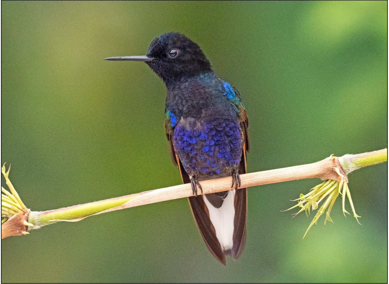
Velvet-purple Coronet from Paz de las Aves