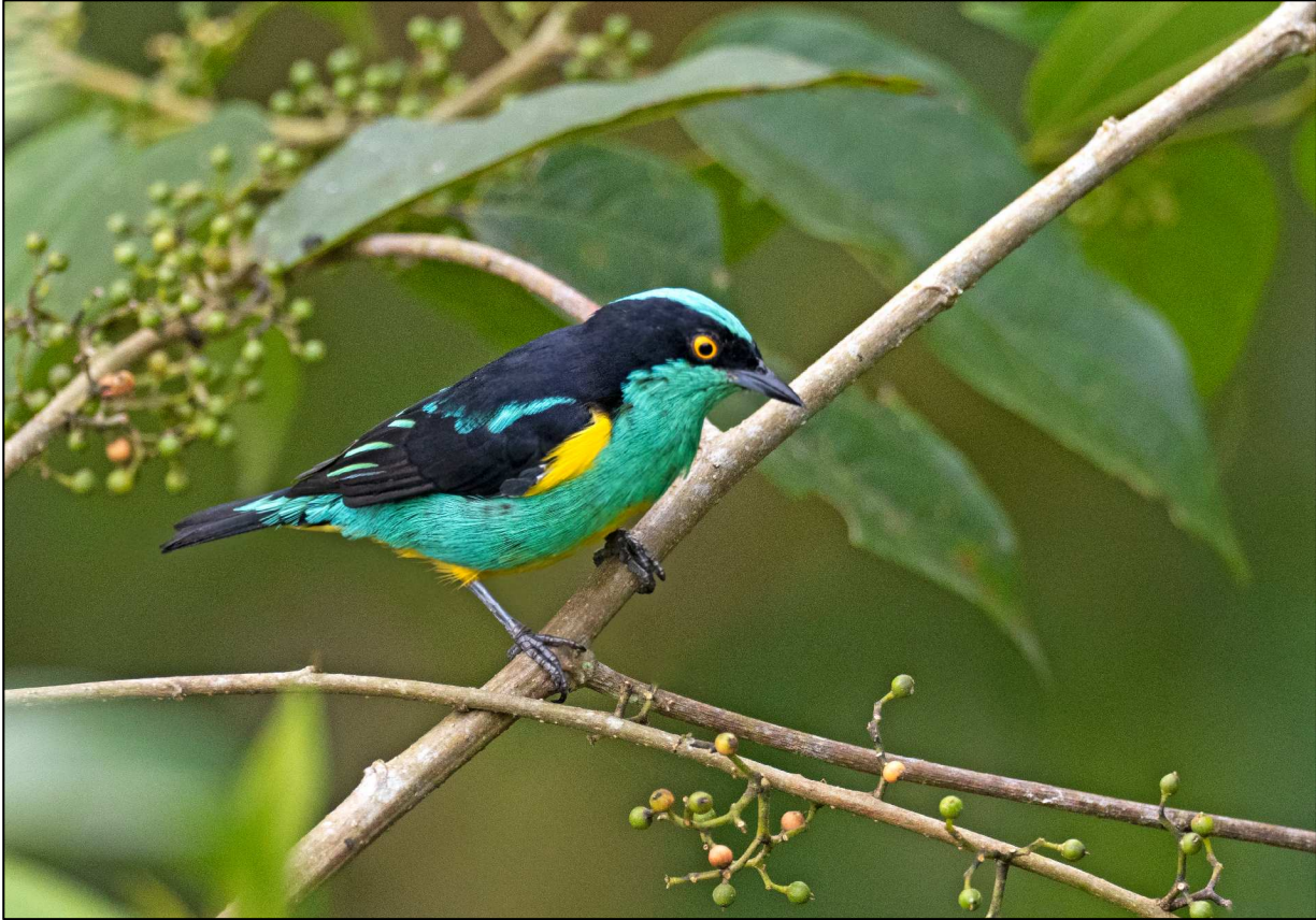
Black-faced (Yellow-tufted) Dacnis from Silanche and Purple-throated Woodstar from Guaycapi