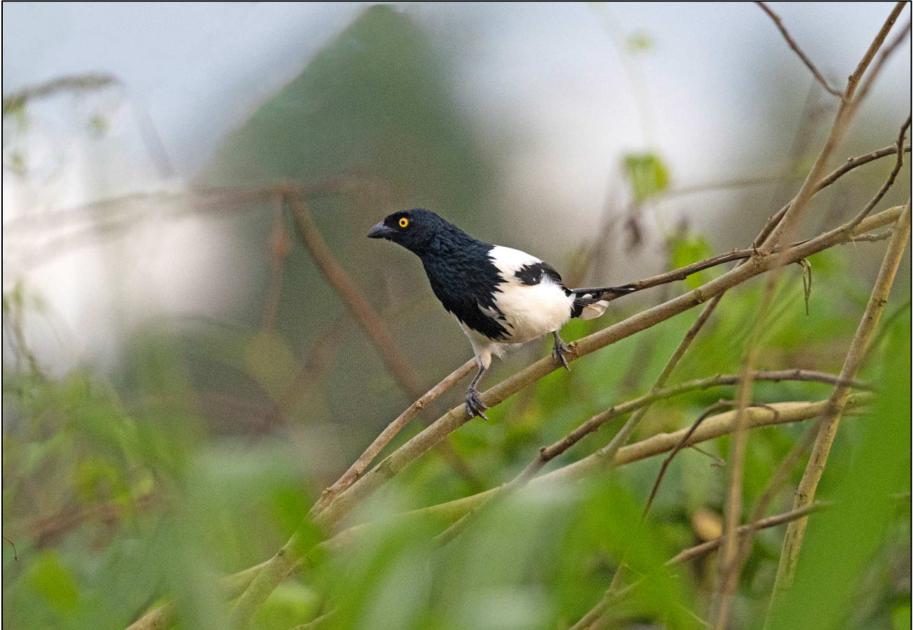
Magpie Tanager from the Amazon

On this day we transferred from one piece of the Amazon to another. We moved away from the hilly part of the Amazon where Gareno is located to Sani Lodge , located in the flat Amazonian lowlands alongside the Napo River, a major tributary of the mighty Amazon itself. This was largely a travel day, as we drove to the oil town of Coca , and then took a boat downriver to Sani Lodge . The drive to Coca produced some roadside birds en-route, like Swallow Tanager , White-eared Jacamar , Red-bellied Macaw , Speckled Chachalaca , Orange-backed Troupial , Southern Lapwing , Swallow-tailed Kite , Green-backed Trogon and numerous Bare-faced Ibis .