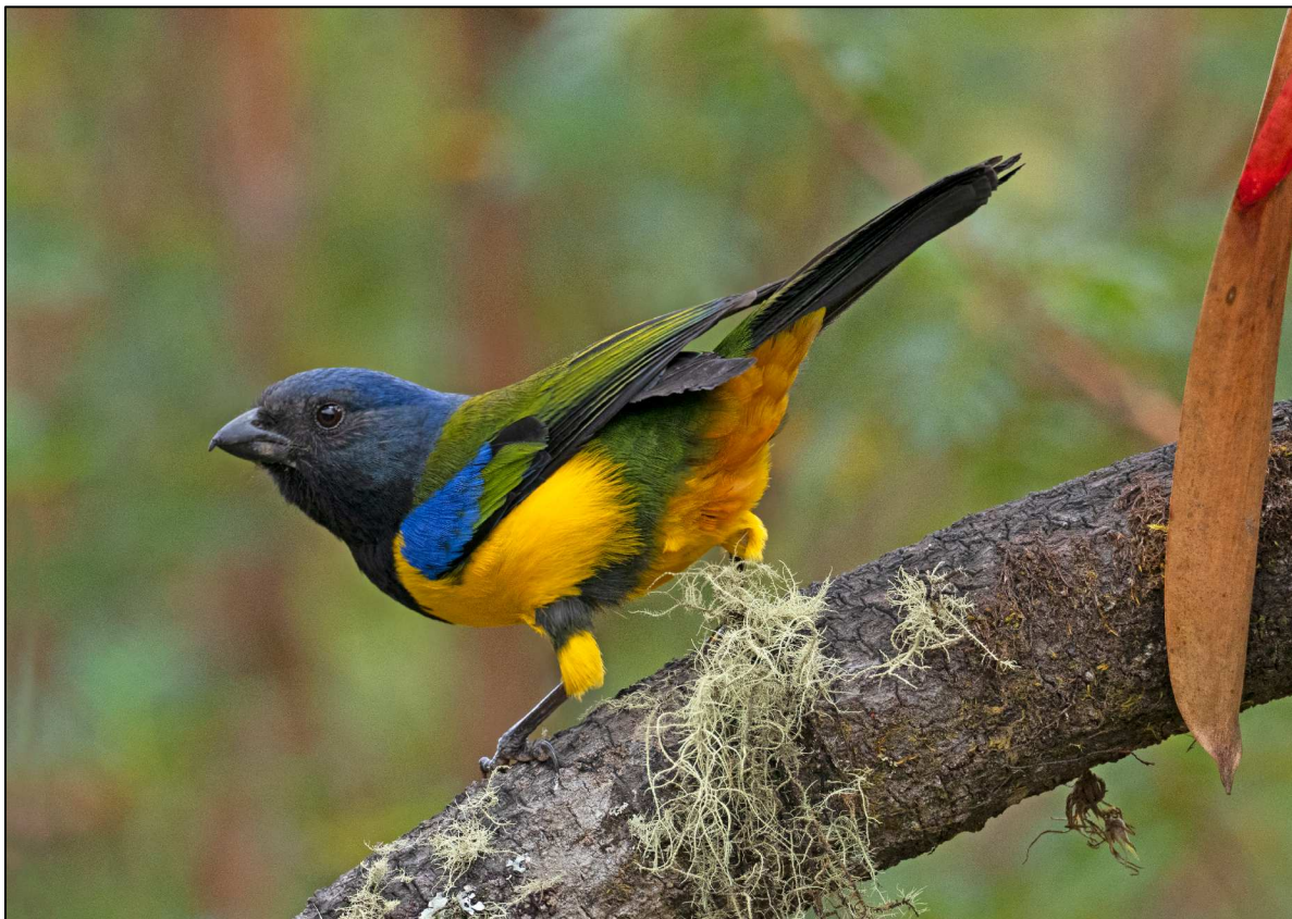
Black-chested Mountain-Tanager at Yanacocha, on the same morning as a Torrent Duck in the Alambi Valley