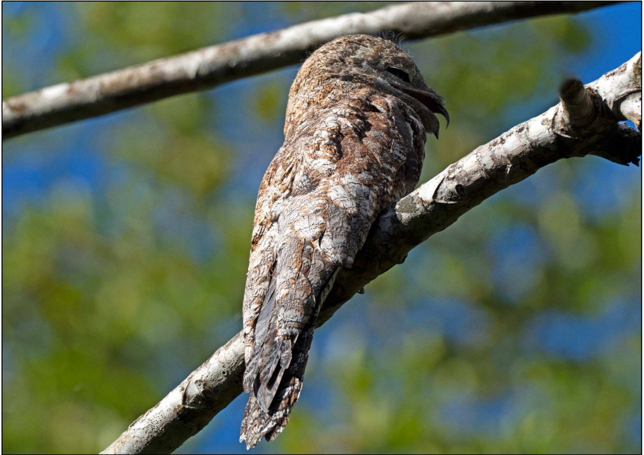
Great Potoo close to Sani Lodge

While taking in a welcome drink at the lodge we saw a White-chinned Jacamar , and there was just enough time to find another target species, Amazonian Scrub-Flycatcher , behind the cabins to finish off a pretty good “travel” day!