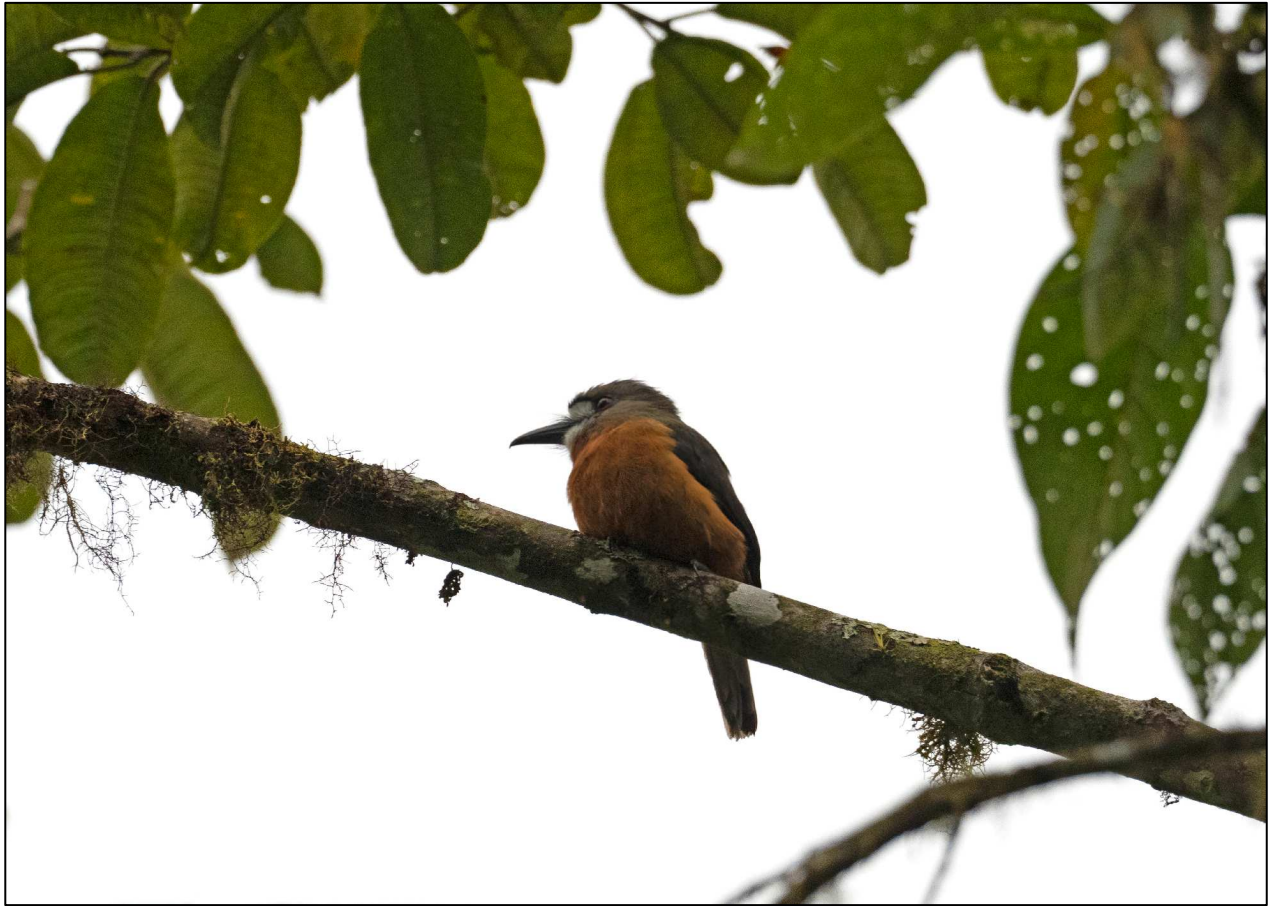
White-faced Nunbird from the Upper Tandayapa Valley

We arrived at the famous Tandayapa Bird Lodge in time for lunch. While eating lunch, we had the chance to see some birds at the fruit feeders from the lodge window, including Red-headed Barbet , Rufous Motmot , Crimson-rumped Toucanet , and Golden-naped, Golden and Black-capped Tanagers , as well as a regional endemic, Toucan Barbet . The hummingbird feeders alongside held their own selection of birds too, with Booted Racket-tail , Andean Emerald , Fawn-breasted Brilliant , Buff-tailed Coronet , Rufous-tailed Hummingbird , Lesser and Sparkling Violetears , Brown Inca , Purple-bibbed Whitetip , Violet-tailed Sylph , and the miniature Purple-throated Woodstar all in attendance.