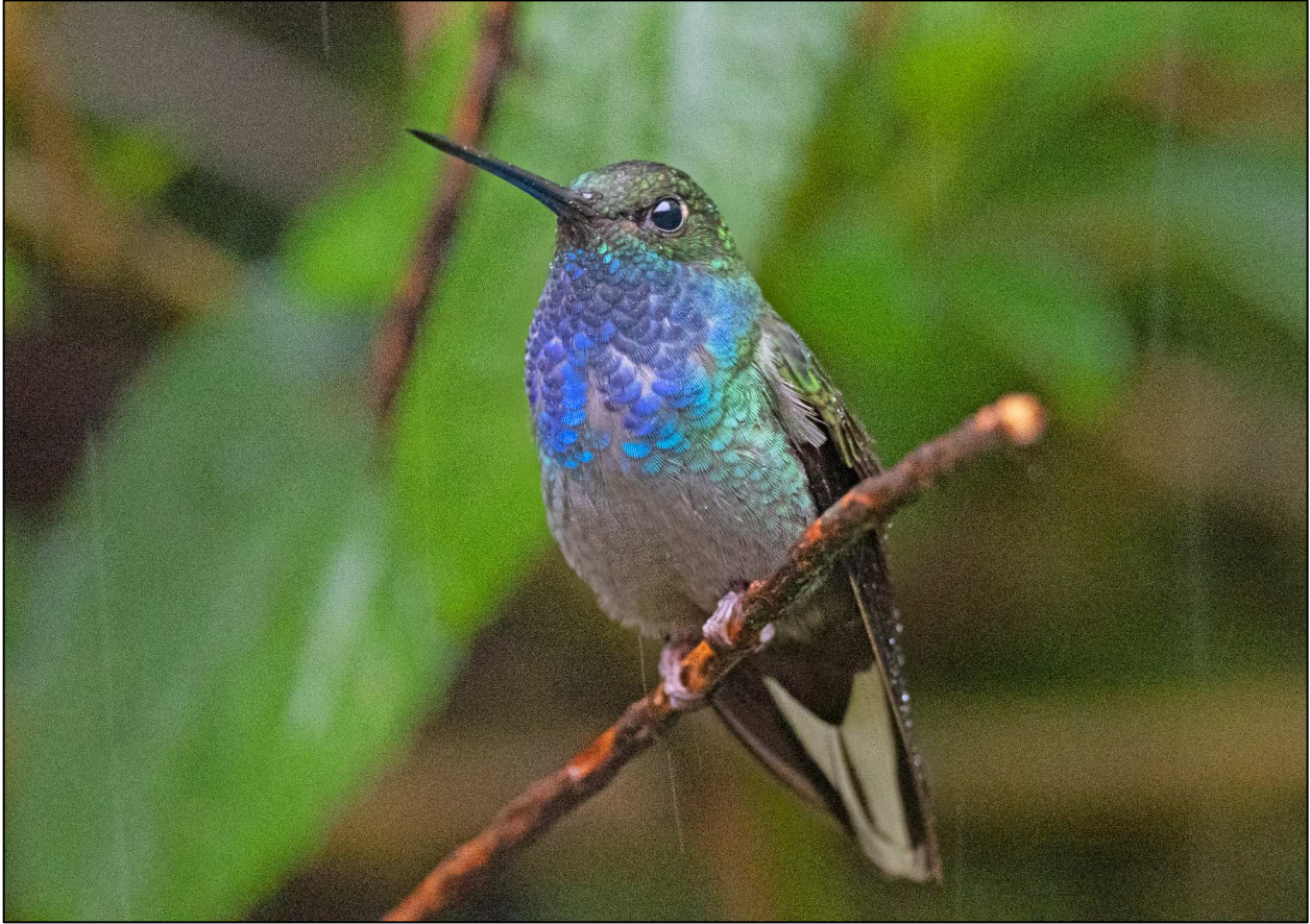
Green-backed Hillstar from Narupa