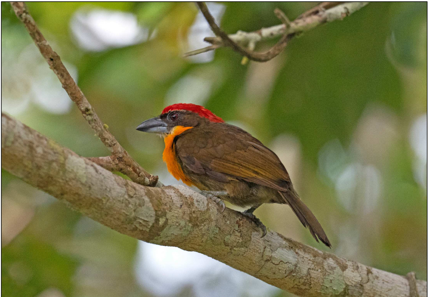
Scarlet-crowned Barbet from the Amazon

After such a productive morning at Guango , we headed off towards the Gareno area of the Amazon, but did some birding along the way, where we saw species like, Violaceous Jay , Crested Oropendola , Chestnut-eared Araçari , Magpie and Masked-crimson Tanagers , Yellow-tufted Woodpecker , Scarlet-crowned Barbet , Red-breasted Meadowlark , Caquetá Seedeater , and a Point-tailed Palmcreeper in their favored Moriche palm trees. We arrived at our hotel, near Gareno Lodge , in the late afternoon, which offered us air con and hot water for our comfortable stay in the Amazon.