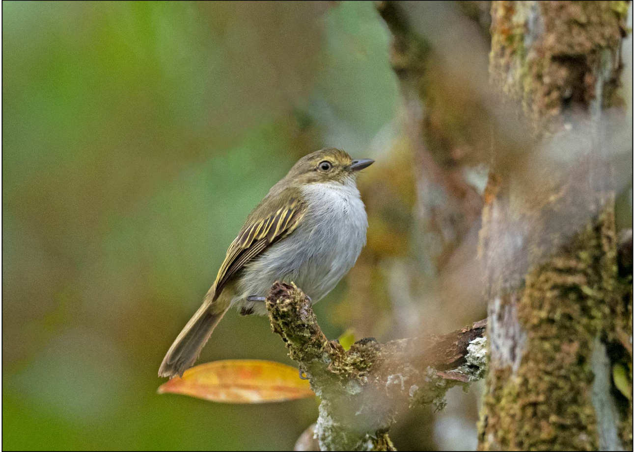
Chocó Tyrannulet from Silanche Bird Sanctuary