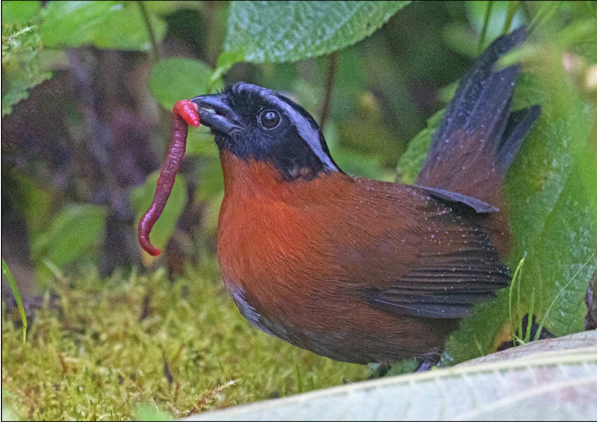
Tanager Finch in the Upper Tandayapa Valley