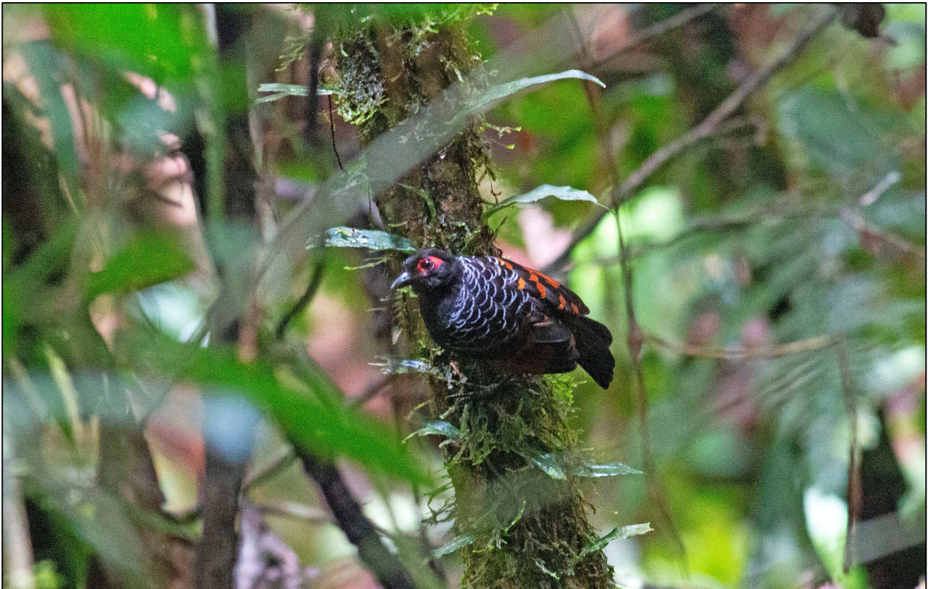
This Reddish-winged Bare-eye was photographed near Gareno Lodge

This trip in northern Ecuador was a custom tour, with the specific aim of targeting specialties that were lifebirds for the person involved. The trip started by journeying northeast of the capital Quito, by car, where we targeted, and found, Páramo Tapaculo , Andean Potoo and Red-hooded Tanager . From there, we continued towards the Amazon , where Gareno Lodge was our final destination. On the way there we added some other target species, like Plushcap and Point-tailed Palmcreeper . At Gareno itself, birds came like Fiery Topaz , Reddish-winged Bare-eye and the stunning White-plumed Antbird , which were much wanted target species, along with other standouts like Pavonine Quetzal , Ash-throated Gnateater , Hairy-crested Antbird , Rufous Potoo , and Slaty-backed Forest-Falcon . From Gareno we swapped one Amazon area for another, this time visiting Sani Lodge . Some of the major requests that fell there included Orange-eyed Flatbill , Amazonian Scrub-Flycatcher , and Orange-crested Manakin , and on some Napo River islands we found Black-and-white Antbird , Orange-fronted Plushcrown , Black-banded Crake , while around the lodge we found the extremely local Cocha Antshrike . Other Sani highlights included White-bellied and Parker's Spinetails , Great Potoo , Rusty-belted Tapaculo , Black-faced Anthrush , Sungrebe , and White-shouldered and Plumbeous Antbirds .