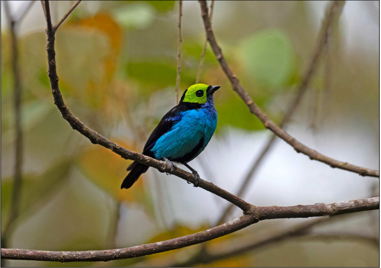
The spectacular Paradise Tanager from Wayra Reserve