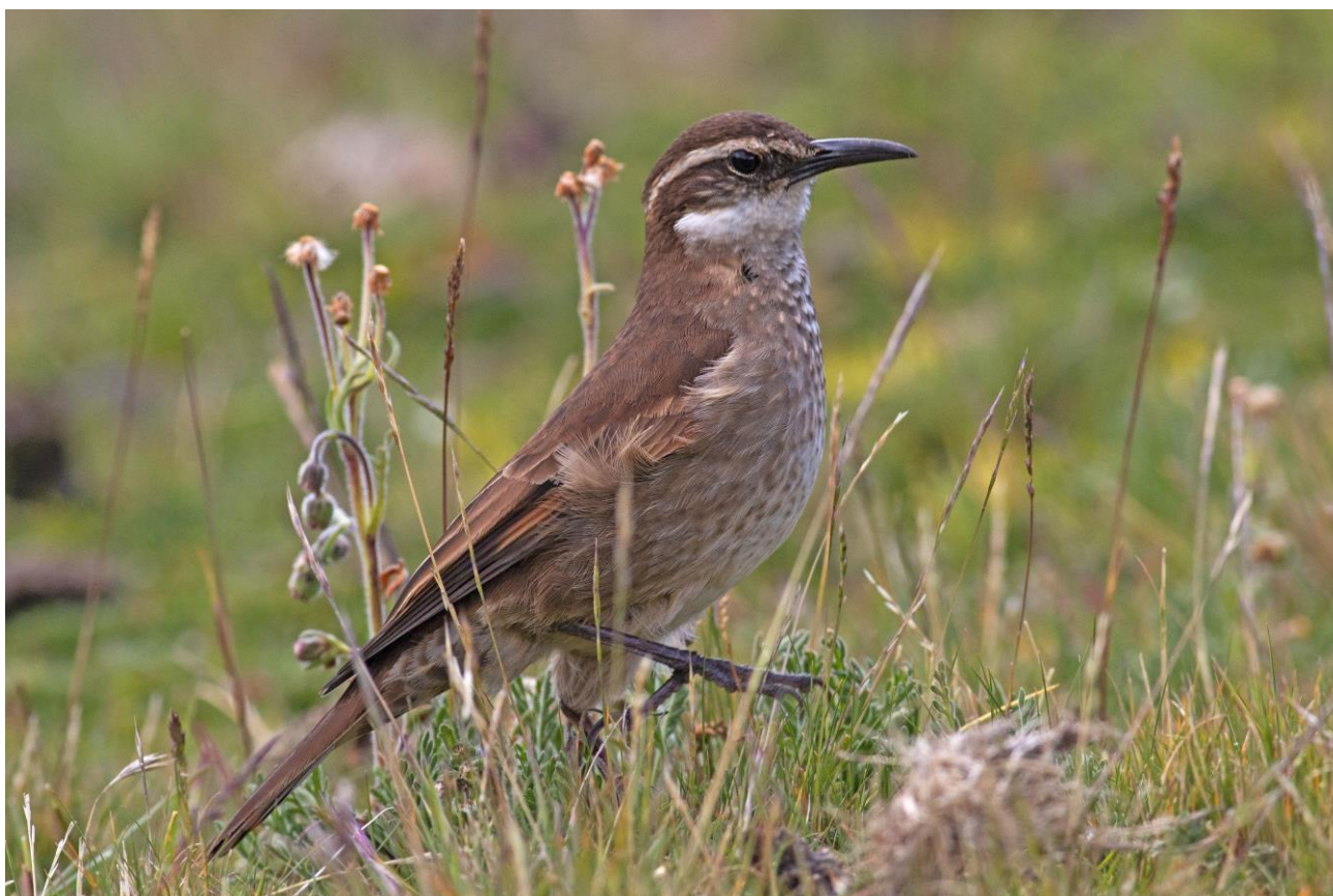
Stout-billed Cinclodes from Antisana National Park