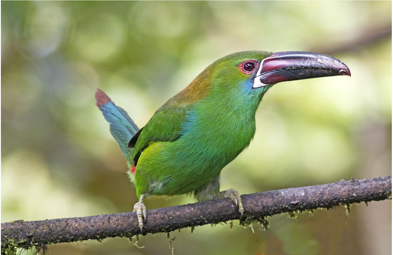
Crimson-rumped Toucanet from Refugio Paz de las Aves