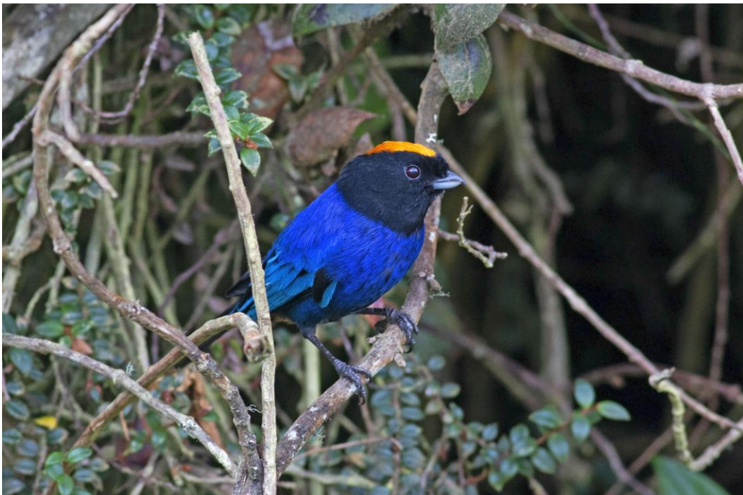
Golden-crowned Tanager from above Papallacta Village

After a last few minutes to enjoy the hummingbirds, we headed up towards Papallacta Pass. One area with a small patch of forest turned out to be a good spot for Agile Tit-Tyrant , Glossy and Masked Flowerpiercers , Lacrimose and Scarlet-bellied Mountain-Tanagers , Pale-naped Brushfinch , Rufous Antpitta and the deep marine blue Golden-crowned Tanager .