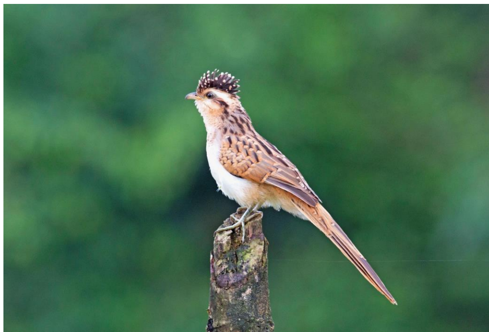
Striped Cuckoo from entrance road to Rio Silanche