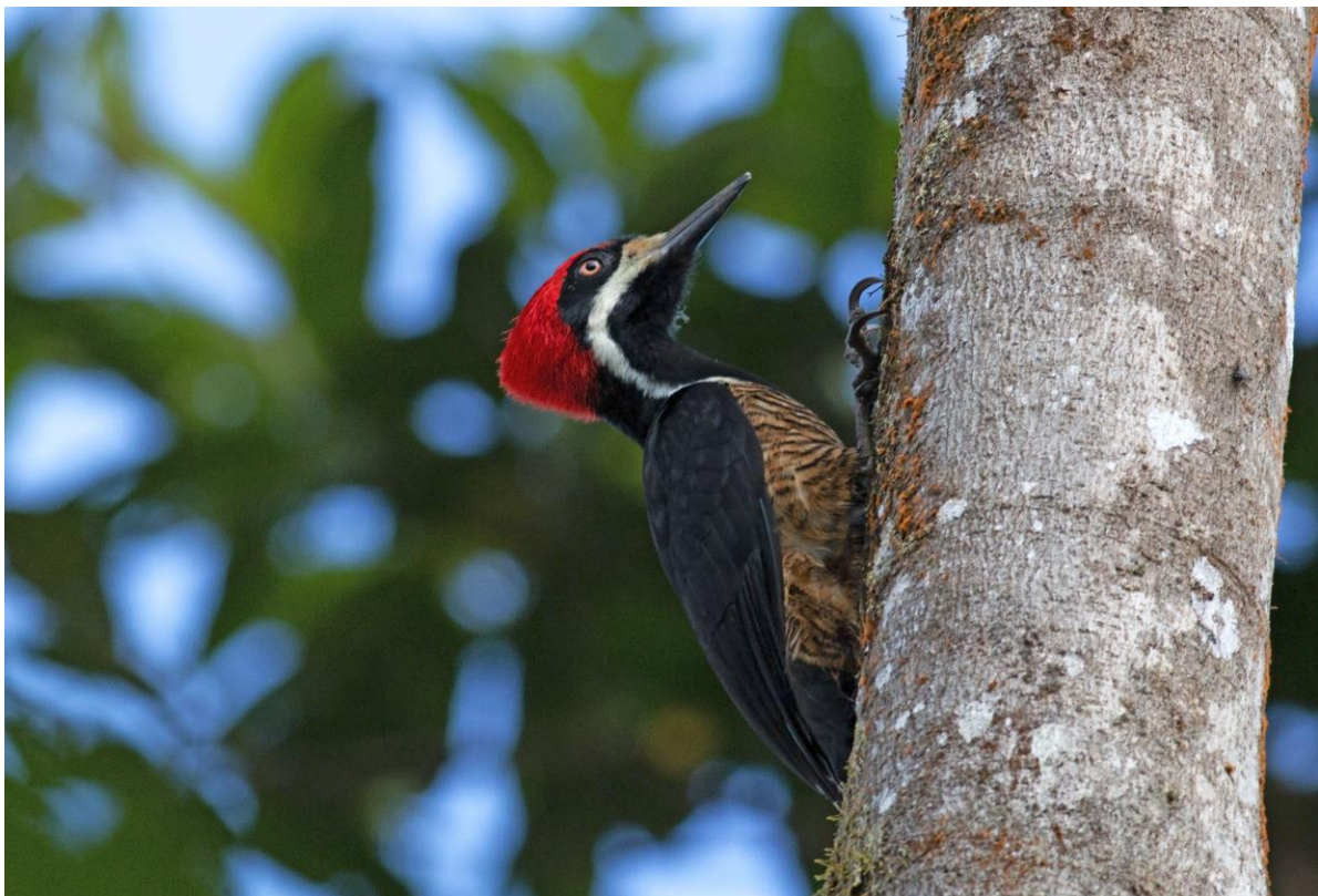
Powerful Woodpecker from Refugio Paz de las Aves