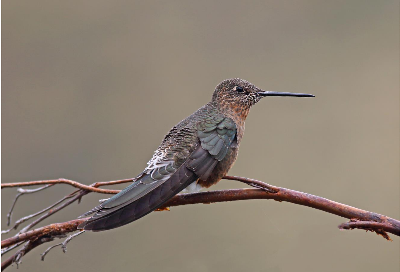
Giant Hummingbird from Tambo Condor Restaurant

We had our lunch at one of the local restaurants near the park, and fortunately the restaurant has some hummer feeders where we had nice views of Shining Sunbeam , Black-tailed Trainbearer , Tyrian Metaltail , and the enormous Giant Hummingbird .