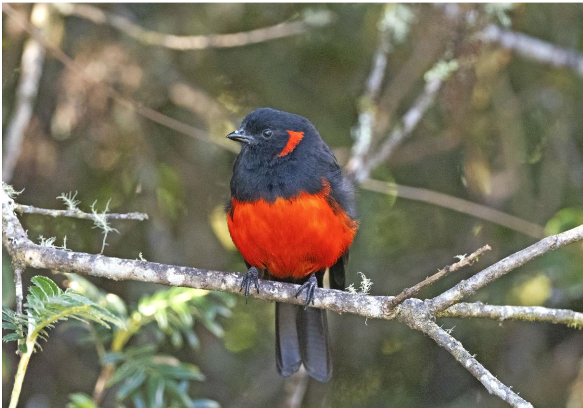
Scarlet-bellied Mountain-Tanager at Yanacocha Reserve

April 22, Yanacocha Reserve. Everyone had arrived the night before in Quito, so we left early this morning to Yanacocha, which is close to the city, just behind the volcano. We stopped along the entrance road to see our first species like Black Flowerpiercer , Superciliaried Hemispingus , Spectacled Redstart , and Brown-bellied Swallow . Once we arrived in the main reserve (high elevation temperate forest) there were already some special birds coming to the feeders like Andean Guan , Scarlet-bellied and Black-chested Mountain-Tanagers , Yellow-breasted Brushfinch . The hummingbird feeders by the parking lot gave us the chance to get Great Sapphirewing , Shinning Sunbeam , Sapphire-vented Puffleg and the bizarre looking Sword-billed Hummingbird . Later in the morning, we went for a walk along the trail where we also had nice activity, with Gray-browed Brushfinch , Glossy and Masked Flowerpiercers , White-browed Spinetail , Rufous Wren , White-throated and White-banded Tyrannulets , Cinereous and Blue-backed Conebills , Crowned-Chat-Tyrant , Smoky Bush-Tyrant and even the difficult Purple-backed Thornbill which was working some flowering trees. More hummingbird feeders at the end of the trail had pretty much same hummers except for Golden-breasted Puffleg which was added to our list.