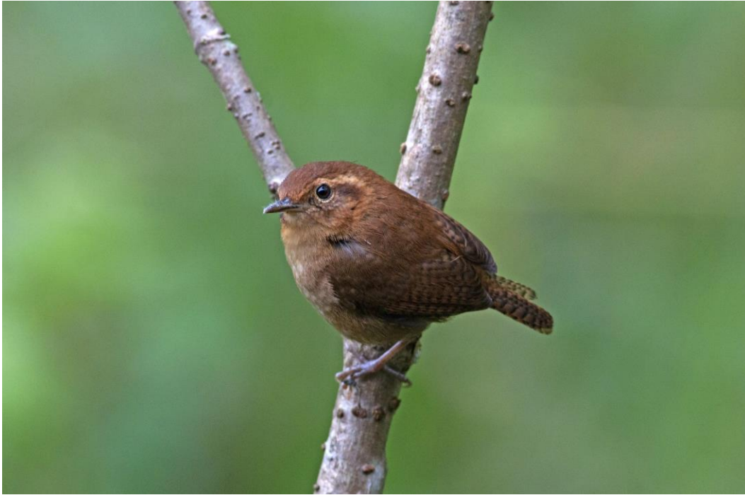
Mountain Wren from Guangos Lodge

After a last few minutes to enjoy the hummingbirds, we headed up towards Papallacta Pass. One area with a small patch of forest turned out to be a good spot for Agile Tit-Tyrant , Glossy and Masked Flowerpiercers , Lacrimose and Scarlet-bellied Mountain-Tanagers , Pale-naped Brushfinch , Rufous Antpitta and the deep marine blue Golden-crowned Tanager .