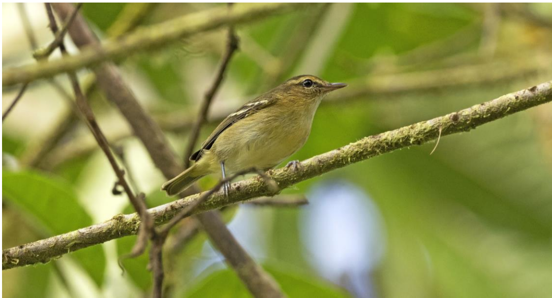
Choco Vireo one of the regional endemic from Amagusa Reserve

April 26, Mashpi area. This fantastic birding area is a long way from Tandayapa, so we took another packed breakfast to get there early. We started birded along the road towards the private Amagusa Reserve, quickly encountering a nice mixed feeding flock with a frenzy of birds like Pacific Tuftedcheek , Bronzy-olive Pygmy-Tyrant , Red-faced Spinetail , Rufous-rumped Antwren , Ornate Flycatcher , Barred Becard , and Brown-billed Scythebill . We even got great views of Indigo Flowerpiercer and Choco Vireo , both of them quite rare and local species. Continuing along the same road brought us a more wonderful species that we were hoping for like Esmeraldas Antbird , Rose-faced Parrots flying by, Olive-crowned Yellowthroat , and Slaty Spinetail , while a small patch of Heliconia flowers attracted a White-tipped Sicklebill and White-throated Wedgebill . A fruiting Melastome tree was bringing in two other special birds, Club-winged Manakin and the striking Orange-breasted Fruiteater .