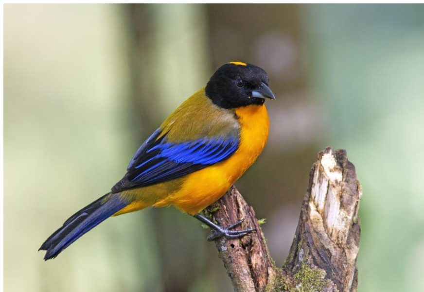
Black-chinned Mountain-Tanager from Amagusa Reserve

After the productive walk, we decided to visit the feeding stations at the reserve which are often ridiculously active. Yes, they were indeed busy and we started seeing Black-winged Saltator , Orange-bellied Euphonia , Golden , Flame-rumped , Rufous-throated , Golden-naped , Flame-faced , Moss-backed , and the iridescent Glistening-green Tanager coming to get bananas from the feeders. More and more birds came in and we added Golden-collared Honeycreeper , Black-chinned Mountain-Tanager , Crimson-rumped Toucanet , the gaudy and attractive Toucan Barbet which was absolutely awesome. We also had hummingbird activity at the feeders too, where we saw a bunch of Empress Brilliants , Brown Incas , White-whiskered Hermits , Green Thorntails , Purple-bibbed Whitetips , Violet-tailed Sylphs , and even the very beautiful Velvet-purple Coronet . We made several stops along the drive back to the lodge, picking up a few species like Bat Falcon , Dull-colored and Yellow-faced Grassquits , Yellow-bellied Elaenia and the colorful Golden-rumped Euphonia .