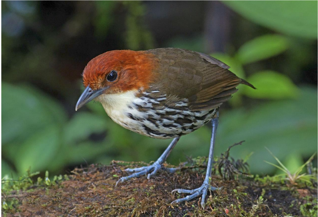
Chestnut-crowned Antpitta from Refugio Paz de las Aves