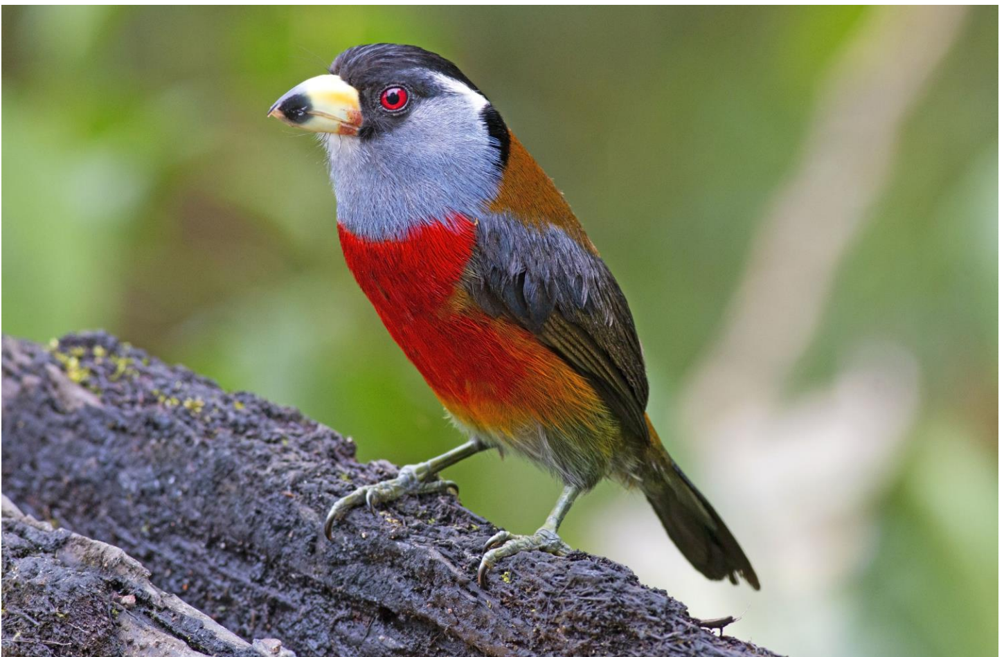
Toucan Barbet, one of the regional endemics at Tandayapa Bird Lodge