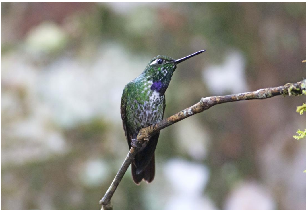
Purple-bibbed Whitetip from Tandayapa Bird Lodge

April 23, Tandayapa Valley. Tandayapa Bird Lodge just might be the best place to see hummingbirds in the entire world, but before spending time on them, we first visited their blind, where birds come in to eat moths that were attracted by a light overnight. It's about ten minutes away from the lodge by foot, and once we arrived there, we saw Ornate Flycatcher, Zeledon's Antbird, Three-striped and Russet-crowned Warblers, and White-throated Quail-Dove. Later on, we went to have breakfast and while we were eating we saw other birds catching moths like Streak-capped Treehunter, Golden-crowned Flycatcher, and Scaly-throated Foliage-gleaner. The lodge feeders on the front porch gave us the chance to see at least 15 different hummingbird species like White-bellied and Purple-throated Woodstars, Purple-bibbed Whitetip, Buff-tailed Coronet, Green-crowned and Fawn-breasted Brilliants, Violet-tailed Sylph, Andean and Western Emeralds, Brown Inca, Rufous-tailed Hummingbird, Lesser, Sparkling, and Brown Violetears, and perhaps the group favorite, the Booted Racket-tails that were coming in big numbers. The hummer show never stops and we spent a lot of time during our stay enjoying it.