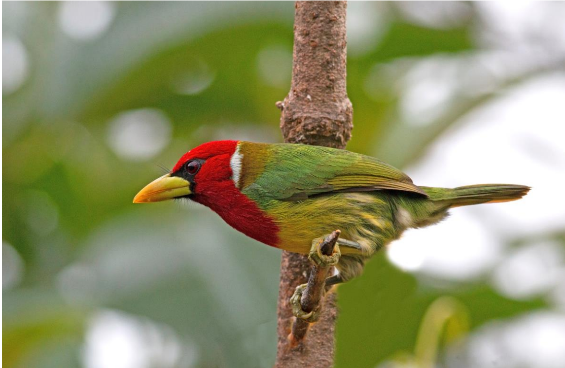
Red-headed Barbet from Tandayapa Bird Lodge

Unfortunately it rained a lot in the afternoon, but even so we had some activity near the lodge where we saw Black-capped, Blue-gray, Palm, Silver-throated and the bright Golden Tanager, Thick-billed and Orange-bellied Euphonias, Crimson-rumped Toucanet, Rufous Motmot and the attractive Red-headed Barbet - a lot of these were coming to eat bananas from the lodge fruit feeders. At the end it wasn't a bad afternoon at all.