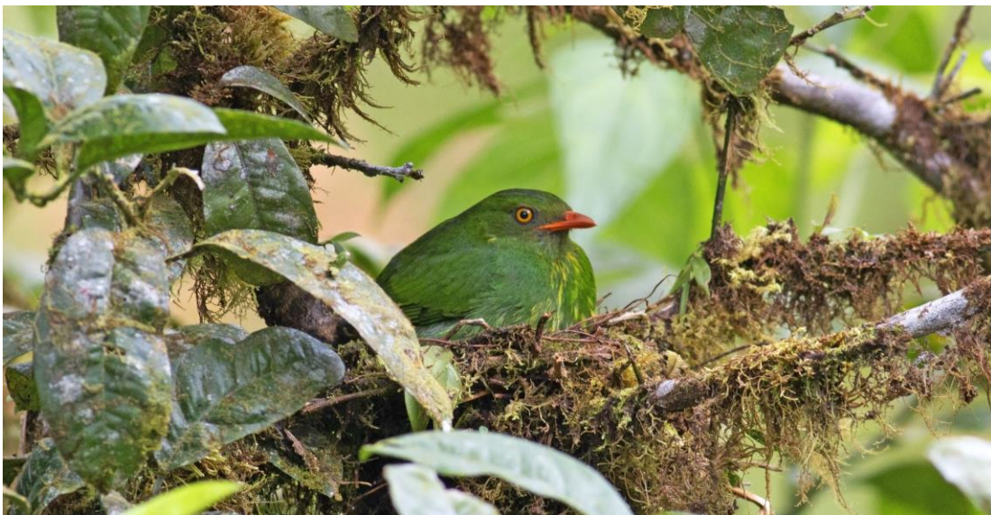
Female Orange-breasted Fruiteater from Amagusa Reserve