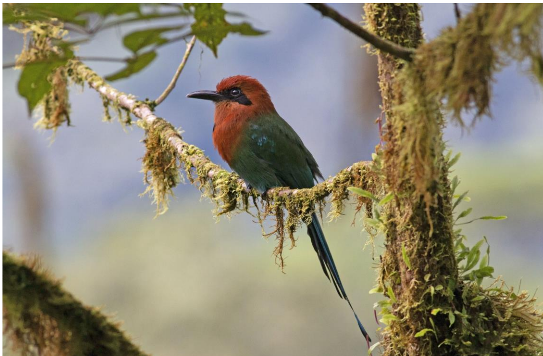
Broad-billed Motmot from Rio Silanche Bird Sanctuary

really nice mixed species feeding flock with Scale-crested Pygmy-Tyrant , the miniature Black-capped Pygmy-Tyrant , Black-crowned Antshrike , Plain-brown Woodcreeper , Yellow-tufted Dacnis , Rufous winged, Scarlet-browed , and Gray-and-gold Tanagers , Rufous-tailed Jacamar , Dot-winged Antwren , Orange-fronted Barbet , and Red-rumped, Cinnamon , and Guayaquil Woodpeckers . As always our visit to this great little bird sanctuary had been really productive.