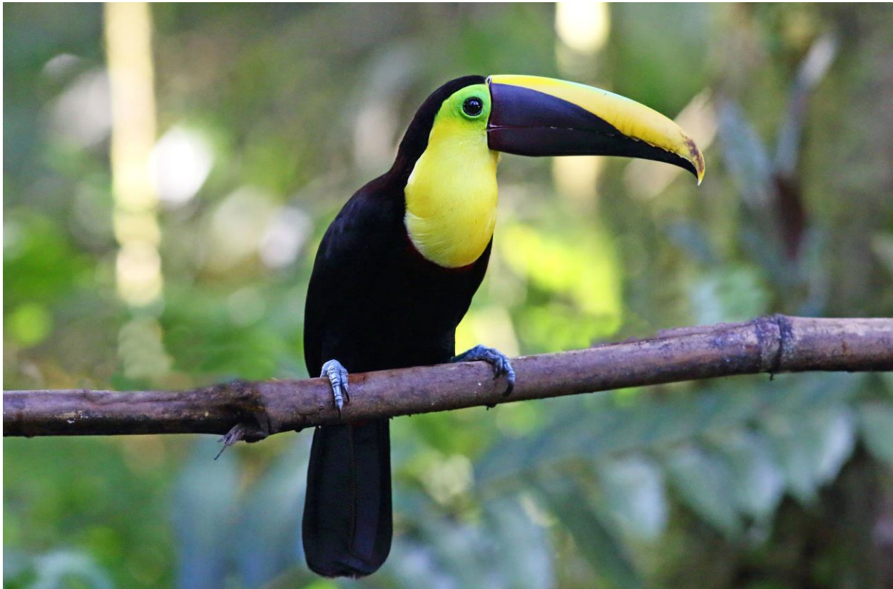
Choco Toucan from Milpe Bird Sanctuary

April 25, Milpe Bird Sanctuary and Los Bancos. Today we began with a visit to Milpe Bird Sanctuary, located in foothill forest at around 1000 meters (3300 feet) elevation. Near the parking lot we saw Yellow-throated and Choco Toucans , Pale-mandibled Aracari , Rufous Motmot , and Orange-billed Sparrow and the nearby hummingbird feeders were bringing in Green Thorntail , Green-crowned Brilliant , White-necked Jacobin , Green-crowned Woodnymph , and White-whiskered Hermit . Later on, we birded a forest trail, and along the beautiful path we had a mixed feeding flock with Choco Warbler , Slaty-capped Flycatcher , the handsome Ornate Flycatcher , Lineated , Buff-fronted , and Scaly-throated Foliage-gleaners , Wedge-billed and Spotted Woodcreepers , Ochre-breasted Tanager , Smoky-brown Woodpecker , and Yellow-throated Chlorospingus . There were also some shy ground species like Scaly-breasted Wren and the beautiful Spotted Nightingale-Thrush . Up in the trees we spotted a couple of day-roosting Black-and-white Owls which was pretty amazing to see.