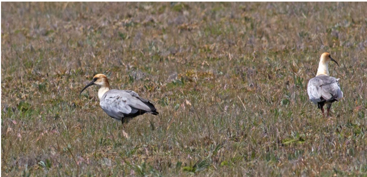
Black-faced Ibis from Antisana National Park