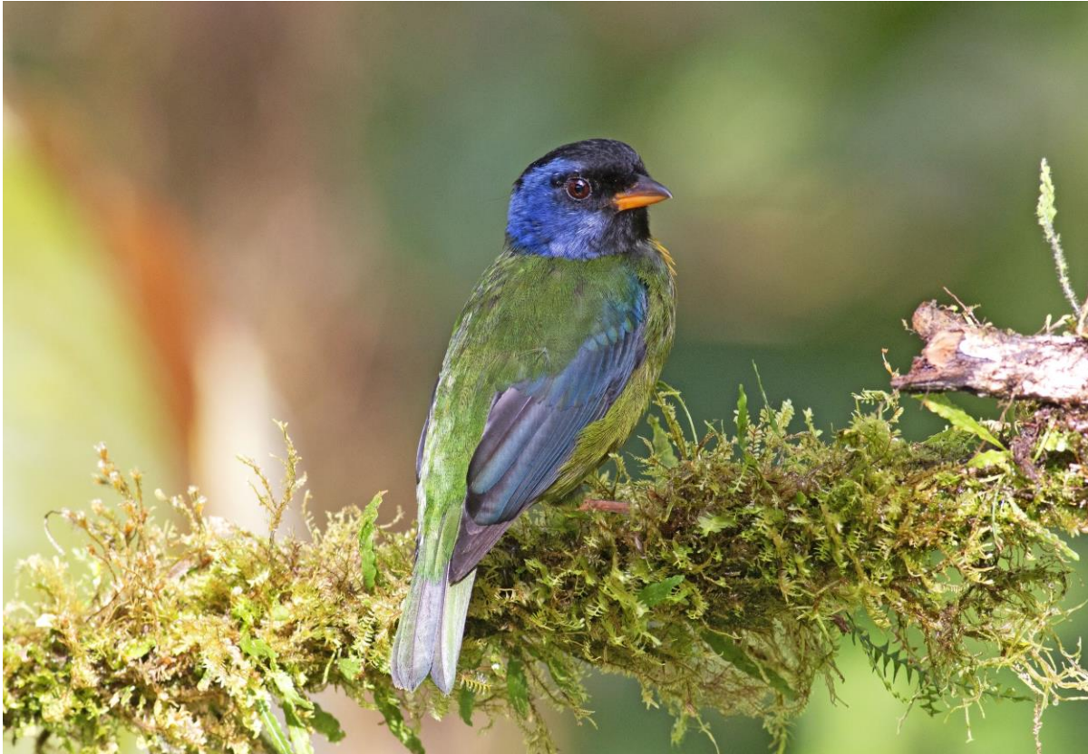
Moss-backed Tanager from Amagusa Reserve

April 27, Refugio Paz de Aves and Calacalí. Today we visited Refugio Paz de Aves, sometimes affectionately called the “antpitta farm”, a world famous hotspot with some species hard to find elsewhere. As usual we started out by having our packed breakfast at the Andean Cock-of-the-rock display site, which was an absolutely impressive show as the males came in to do their daily ritual to attract the females. Also in the same area we had a family of Dark-backed Wood-Quails and a sleeping Lyre-tailed Nightjar just by the road. Higher up at a different spot in the reserve, we saw Yellow-breasted and Chestnut-crowned Antpittas which were coaxed in eventually by Sr. Paz. Also, this forest held a few other species that we saw while waiting for antpittas like Scaled and Green-and-black Fruiteaters , Plate-billed Mountain-Toucan , Crimson-rumped Toucanet , Blue-winged Mountain-Tanager , Toucan Barbet , Tyrannine Woodcreeper , Uniform Antshrike , and the mighty Powerful Woodpecker . After such a wonderful experience on the western side of Ecuador we went back to Quito, but not without birding on the way near Calacalí town, where the dry scrubby habitat brought us a few good birds like Black-tailed Trainbearer , Tufted Tit-Tyrant , Common Ground-Dove , Band-tailed Seedeater , and Ash-breasted Sierra-Finch . We reached our hotel in Puembo near the airport for the last night of the main tour, bidding farewell to those not joining the extension.