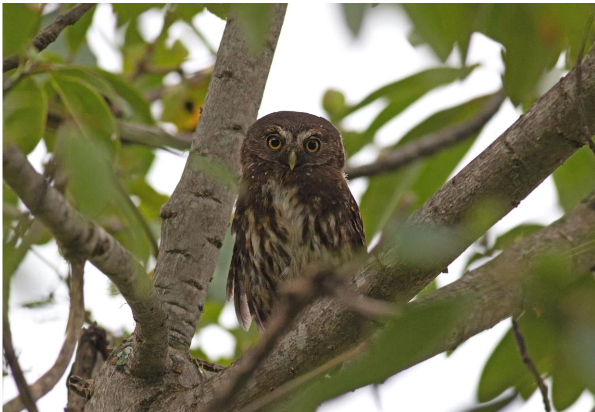
Andean Pygmy-Owl from Upper Tandayapa Valley