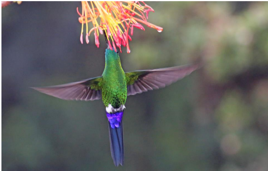
Sapphire-vented Puffleg from Yanacocha Reserve

On the walk back, we saw an Aplomado Falcon soaring above us. After lunch we headed down the mountain towards Tandayapa, but along the way we saw a few species like Red-crested Cotinga sitting on the tree tops, a small mixed feeding flock with Blue-winged Mountain Tanager , Turquoise Jay , White-winged Brushfinch , Montane Woodcreeper , and Glossy-black Thrush , and White-capped Dipper and Torrent Tyrannulet along the Alambí River. Just before the lodge, we had another feeding flock with Metallic-green , Golden-naped , and Flame-faced Tanagers and Golden-crowned and Streaked-necked Flycatchers . Just when we thought things couldn't get better, we also found the attractive Golden-headed Quetzal and the Chocó endemic Plate-billed Mountain-Toucan which were perching quietly near the road. All arrived at the lodge with big smiles and enjoyed our first delicious dinner there.