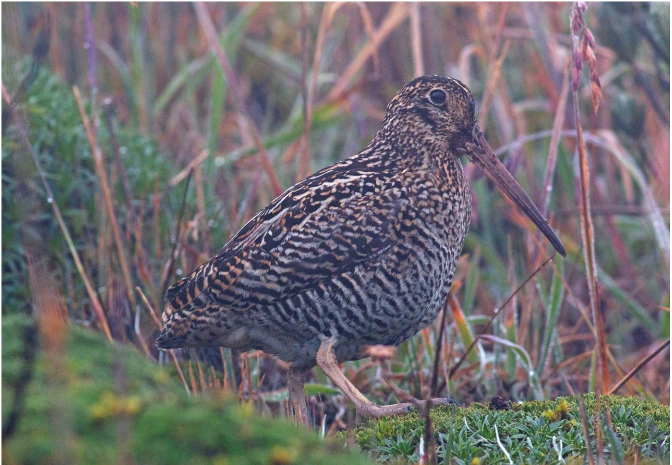
Jameson's Snipe from Papallacta Pass

After lunch, we drove up to the pass, where as usual the weather wasn't any good, but with some luck we were able to get at least four individuals of Jameson's Snipe , which was very unusual. We couldn't stay up here for very long because of the cold so dropped down a bit, where we found Plumbeous Sierra-Finch , Chestnut-winged and Stout-billed Cinclodes , Paramo Ground-Tyrant , Variable Hawk and Carunculated Caracara . We even saw a few new species for the trip like Andean Tit-Spinetail , Tawny Antpitta , White-chinned Thistletail , Blue-mantled Thornbill , and Many-striped Canastero . Just before calling an end to the trip, at a small patch of Polylepis forest near the main road, a rare Giant Conebill responded nicely, a great way to finish a wonderful trip. We arrived safely in our hotel in Puenbo, doing a final checklist before dinner.