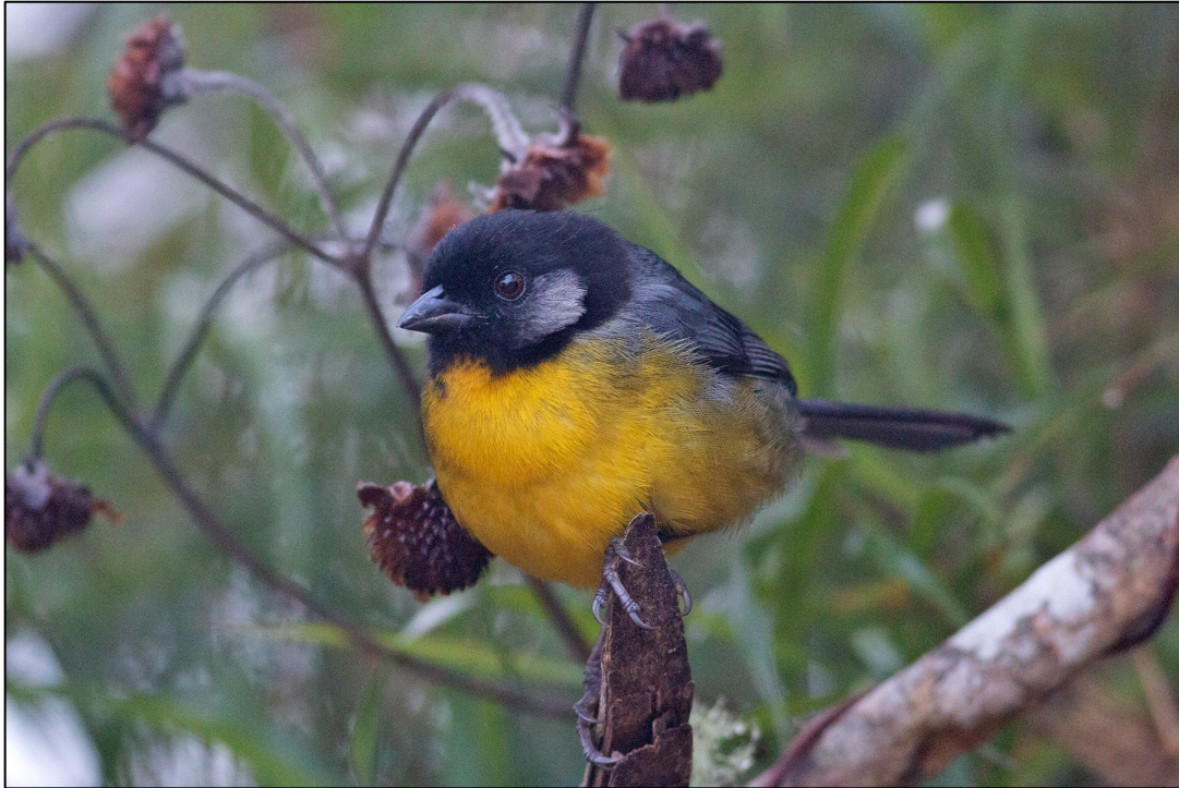
Santa Marta Brushfinch (above), and Blue-naped Chlorophonia