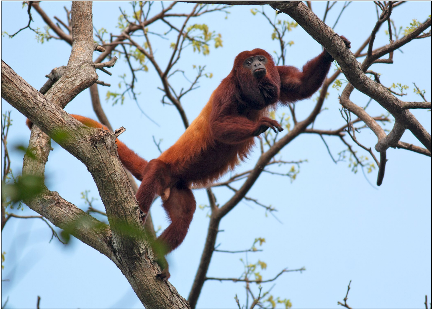
Venezuela Red Howler