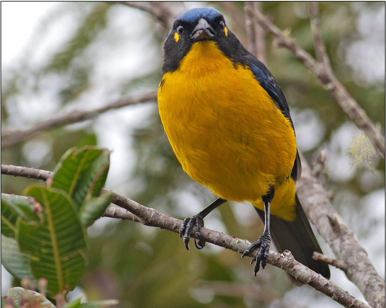
Black-cheeked (Santa Marta) Mountain-Tanager comes in for a close-up near El Dorado Lodge

In the end, we had recorded 328 species, 316 of which were seen.