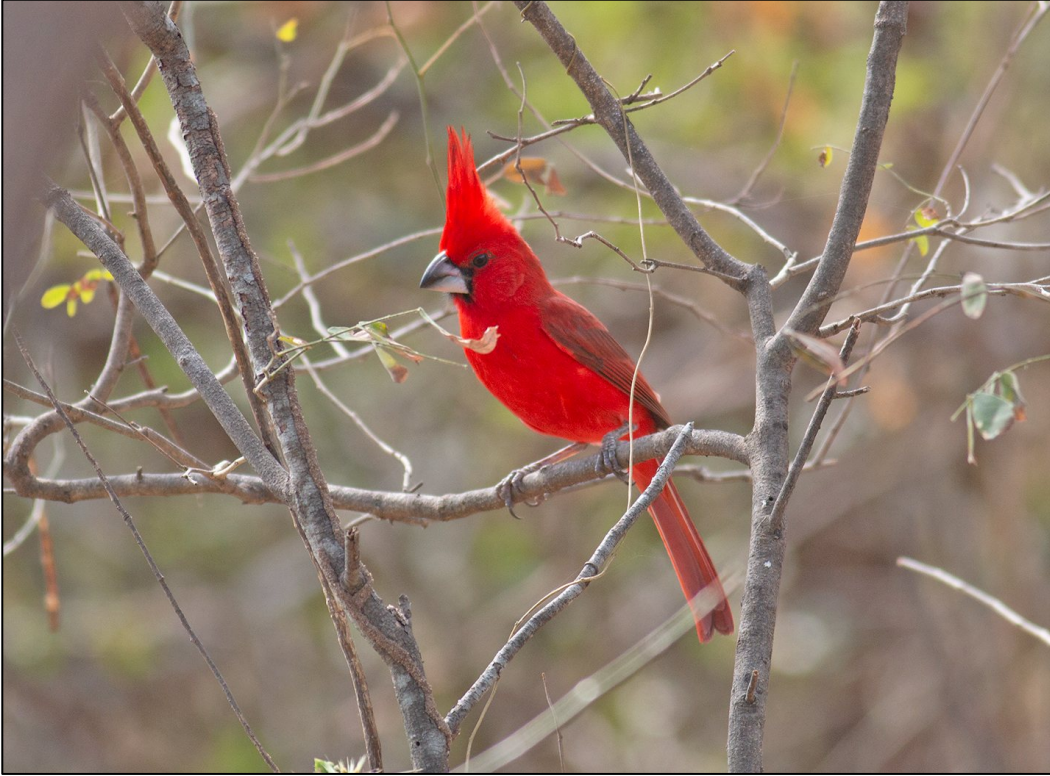
Vermilion Cardinal male (above) and female