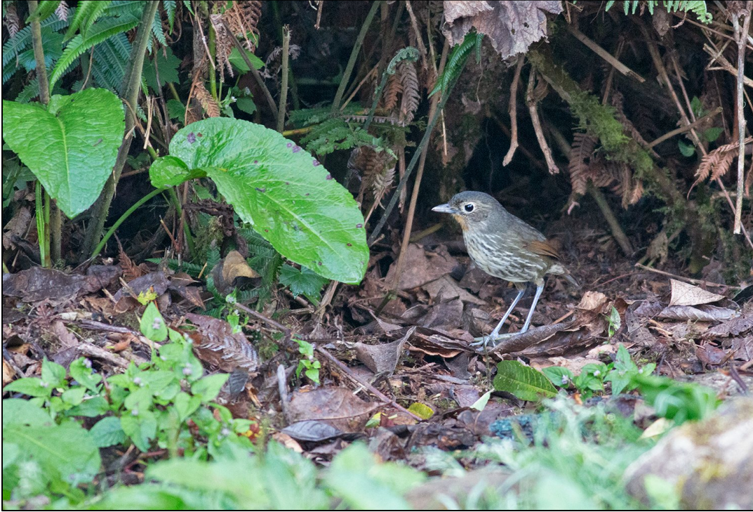
Santa Marta Antpitta (above) and White-lored Warbler