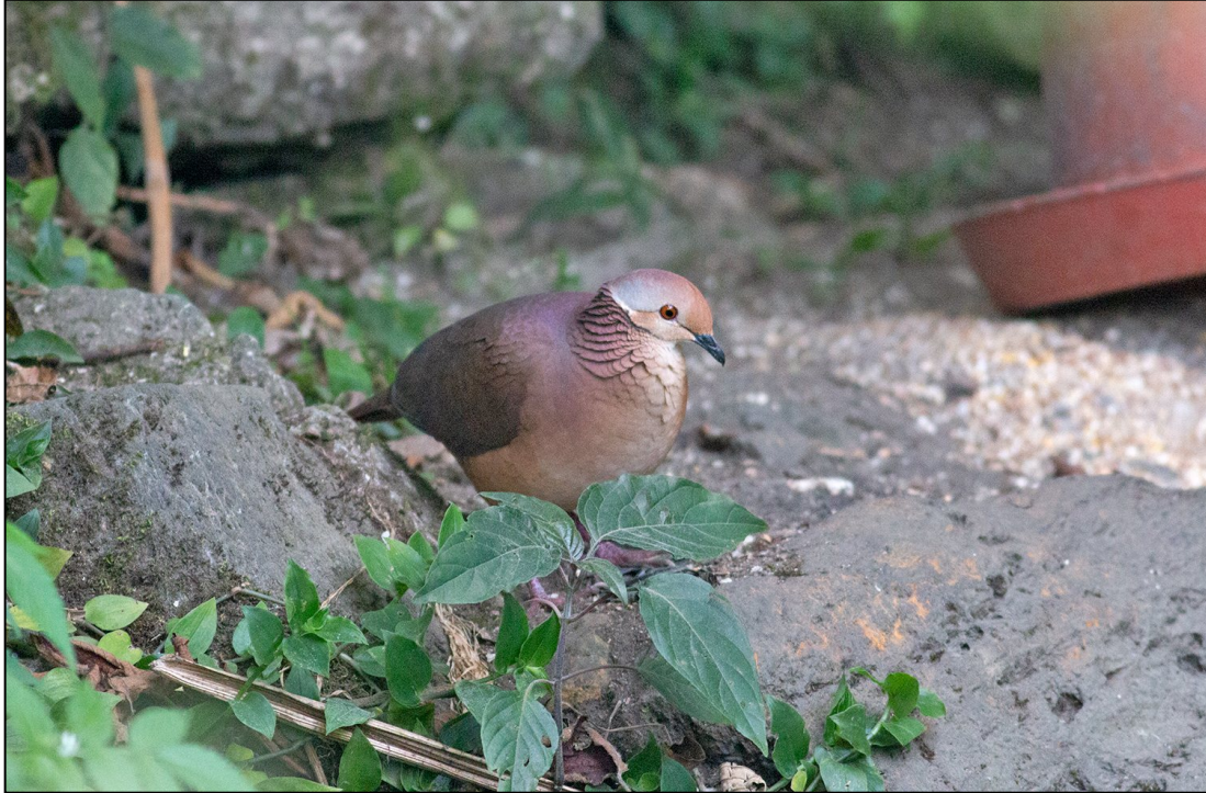
Lined Quail-Dove (above) and White-tailed Starfrontlet