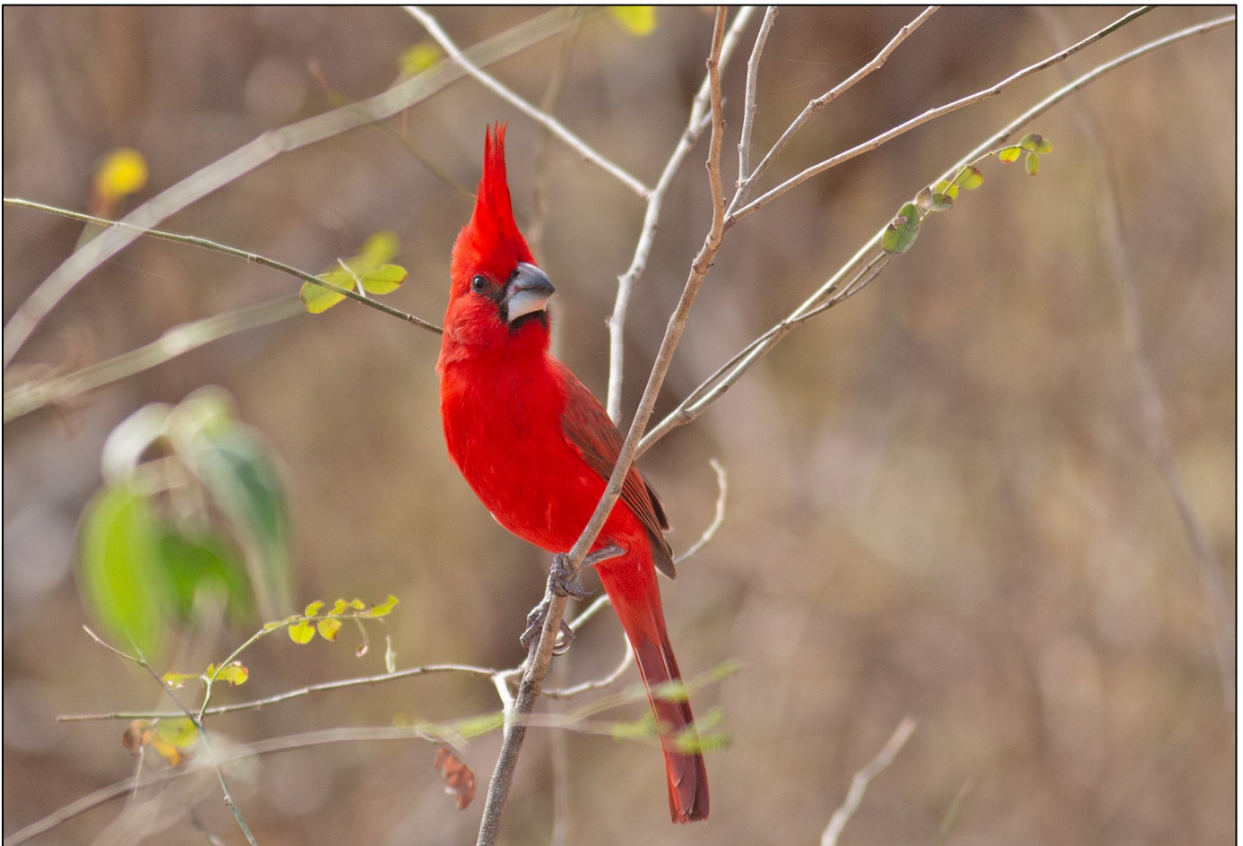
Vermilion Cardinal , a stunning specialty along the Caribbean coast seen early on the tour