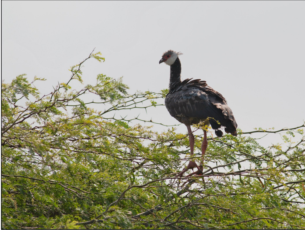
Northern Screamer (above) and Green-rumped Parrotlet