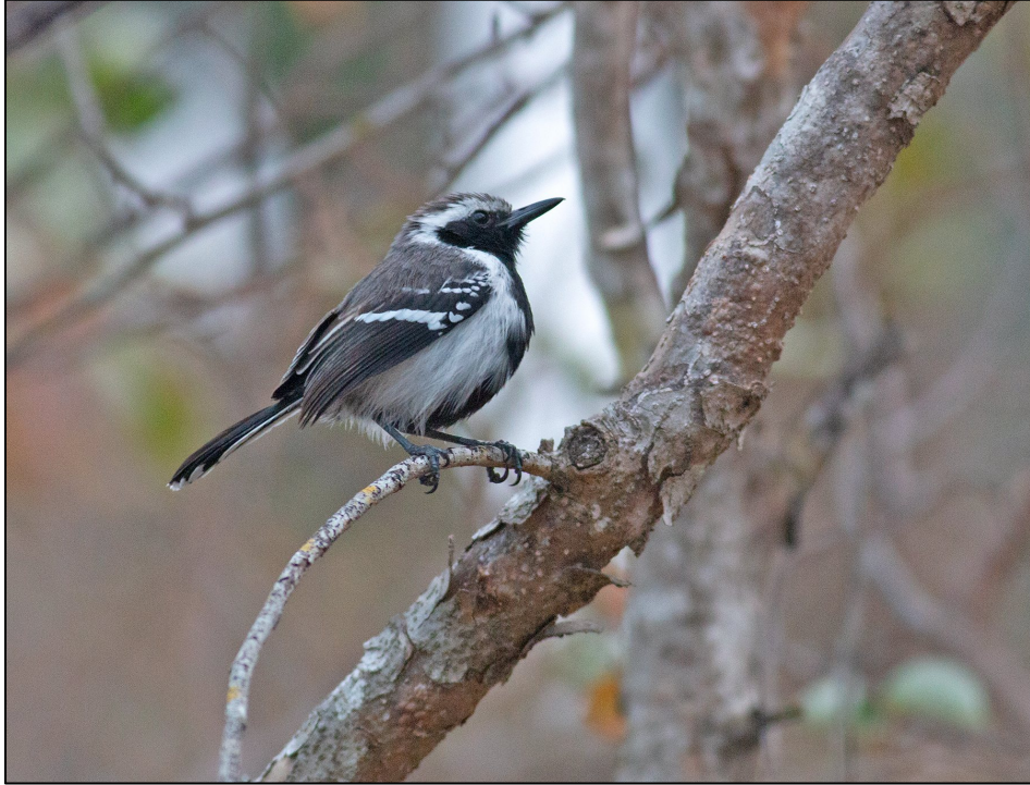
White-fringed Antwren (above) and Russet-throated Puffbird