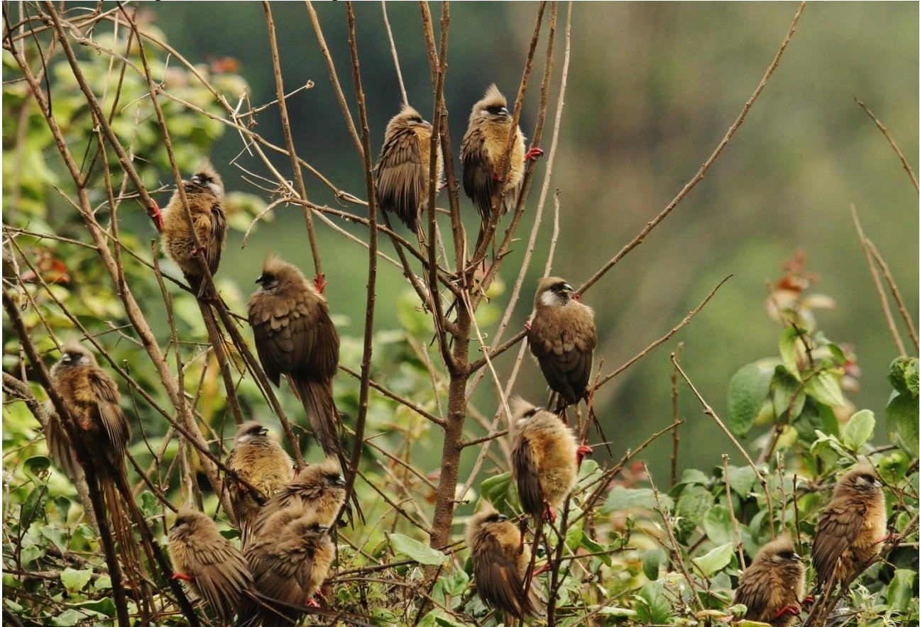
A few Speckled Mousebirds hanging out on the slopes of Mt. Kenya.

Our next full day was also wet but many target birds were still acquired. The stunning Abyssinian Crimsonwing , Black-headed Apalis , White-starred Robin , and White-browed Crombec all were found before breakfast. Moving into other areas of the forest towards Castle Lodge we got into a flock containing Moustached Tinkerbird , Tullberg's Woodpecker , Brown Woodland-Warbler , Black-fronted Bushshrike , and Rueppell's Robin-Chat . Birding around the lodge gardens produced Tacazze , Olive , and Eastern Double-collared Sunbirds , while Streaky Seedeaters foraged for seeds. Nearby a group of noisy Hunter's Cisticola's definitely made themselves heard. Then, while watching a small party of Kandt's Waxbills near the lodge pool we had to move far out of the way as a family group of Elephants came to the pool for a drink! It was amazing to watch these massive beasts from the lodge balcony with a cold beer in hand. As day turned to night for us on Mt Kenya, and after an amazing dinner, we were successful in spotlighting 2 Montane Nightjars as they foraged around our bungalows.