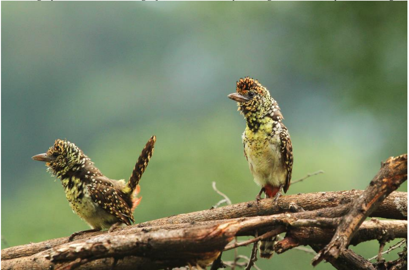
D'Arnaud's Barbets in full display mode.