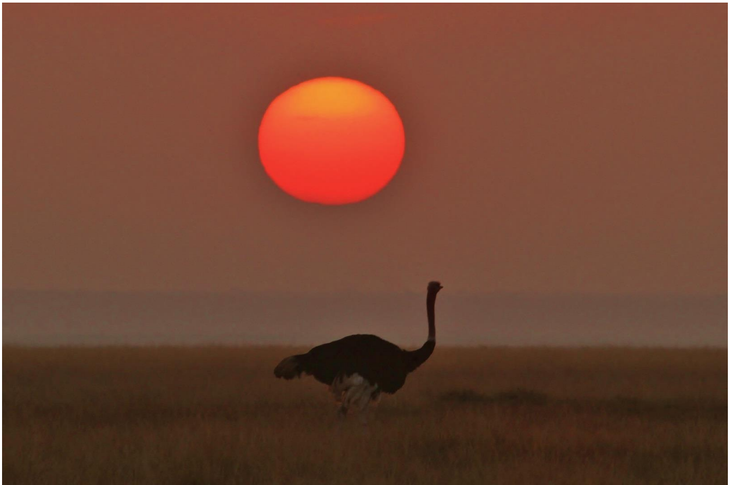
Sunrise and Ostrich, a typical start to your day in Kenya.