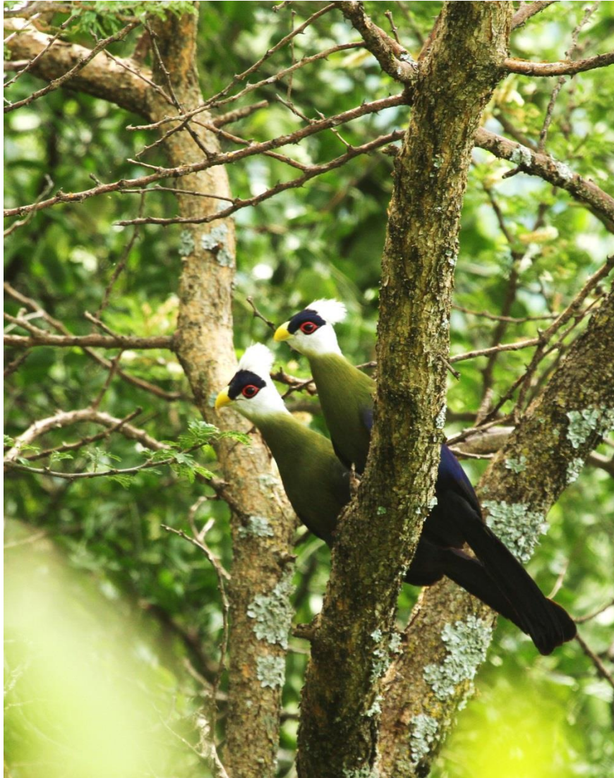
Voted bird of the trip, it is hard to argue when you see these White-crested Turacos.

Today our drive crosses through many different habitats, and the only way to get a big list is to take advantage of these habitats as it may be the last time you see them. First we birded a highland marsh, finding Jackson's and Fan-tailed Widowbird , Yellow Bishop , and Tinkling Cisticola . Stopping for lunch in the Kerio Valley (part of the Great Rift Valley system, we found the voted bird of the trip, the simply stunning White-crested Turaco . We had walk away views of a pair courting each other, showing their truly amazing color contrast from deep white to emerald green.