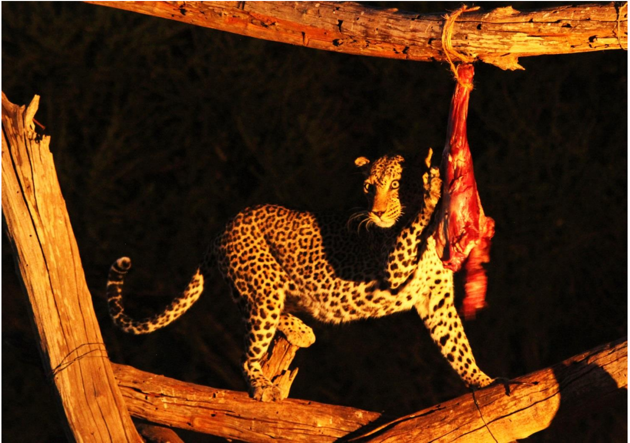
Some people feed finches sunflower seed, some go a little bigger, same principle. Leopard in Tsavo West NP.