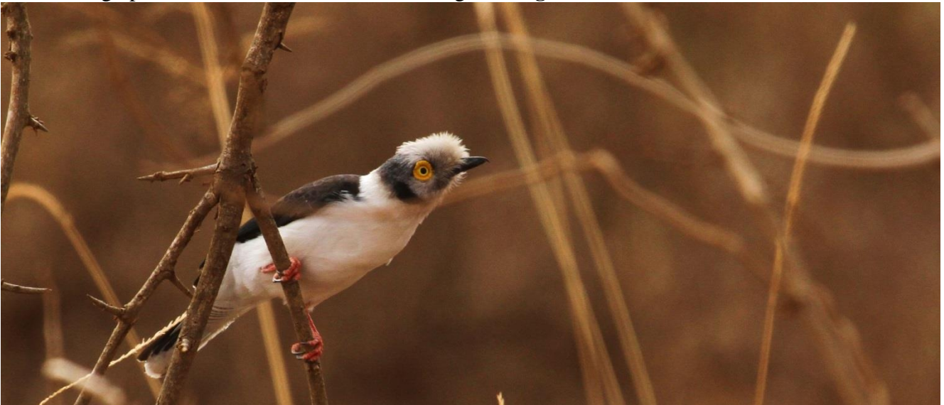
White Helmetshrikes are common, and travel in noisy flocks, always a favorite

Driving to another area of the Reserve a huge number of Wildebeest had gathered. As far as the eye could see the grass was littered with mammals. It is a treat to witness this fluid mosaic of life. Amongst the Wildebeest were hundreds of Topi, and Thomson's Gazelle, but we also found 2 separate prides of Lion, numerous Spotted Hyena, and a few Black-backed Jackal. Finding kills, old and fresh, was a regular occurrence, and was great to see the vulture diversity here. Lappet-faced, White-backed, and Hooded Vultures were in large numbers literally cleaning up the grasslands. We also did well finding all the small bird species, cleaning up all the Cisticolas needed, including Trilling Cisticola .