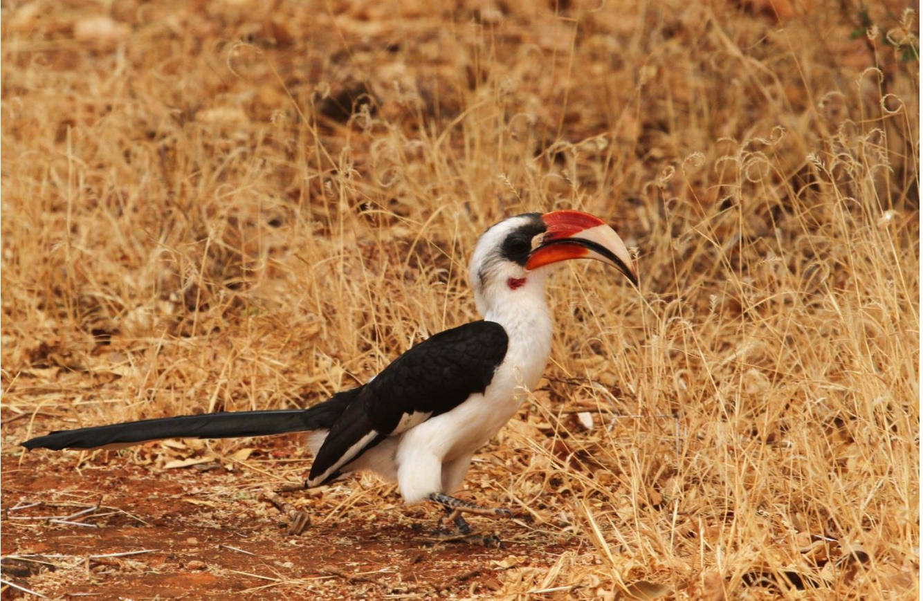
A Von der Decken's Hornbill in Tsavo East NP.

The drive through Tsavo East was very dry, and it was clear at the large population of Elephant were taking out their anger on the former trees. Birding was tough at times but we still found some great targets. The first European Bee-eaters had arrived here but were quickly trumped by the much less common Somali Bee-eater . A Rosy-patched Bushshrike hopped up to the top of a bush, while a large group of Vulturine Guineafowl crossed the road in front of us. Further east, and closer to the coast, we finally found our Golden Pipit target. Possibly the best looking in the family, these birds look more like yellow butterflies when in flight.