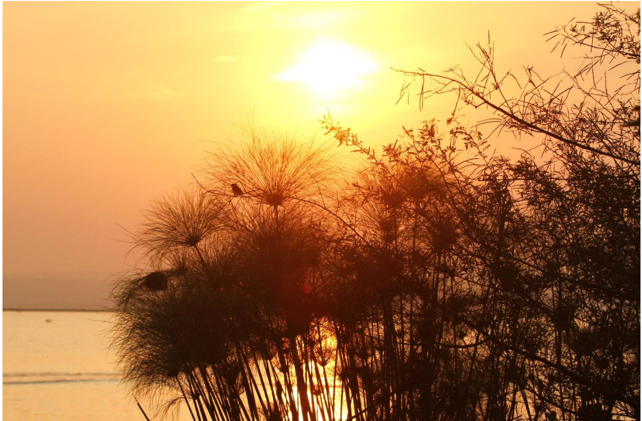
Part of the beautiful Papyrus swamp edging the famous Lake Victoria. Note the Swamp Flycatcher left of center.

We arrived in Kakamega by mid-afternoon and immediately started birding the road. Right away we got into some flock activity, which included some tricky skulkers like Banded Prinia and Black-faced Rufous-Warbler . Entering our hotel grounds at the beautiful Rondo Retreat it was clear that this was going to be a very “birdy” area. On arrival we were greeted by the weird Great Blue Turaco , which was nesting on the hotel grounds. Simply going to our rooms to drop off our luggage we had to stop to see the nearby Gray-headed Negrofinch , White-chinned Prinia , and Vieillot’s Weavers . Our final bird of the day was a Mackinnosn’s Fiscal , of which there is a resident pair using the lodge as their feeding ground.