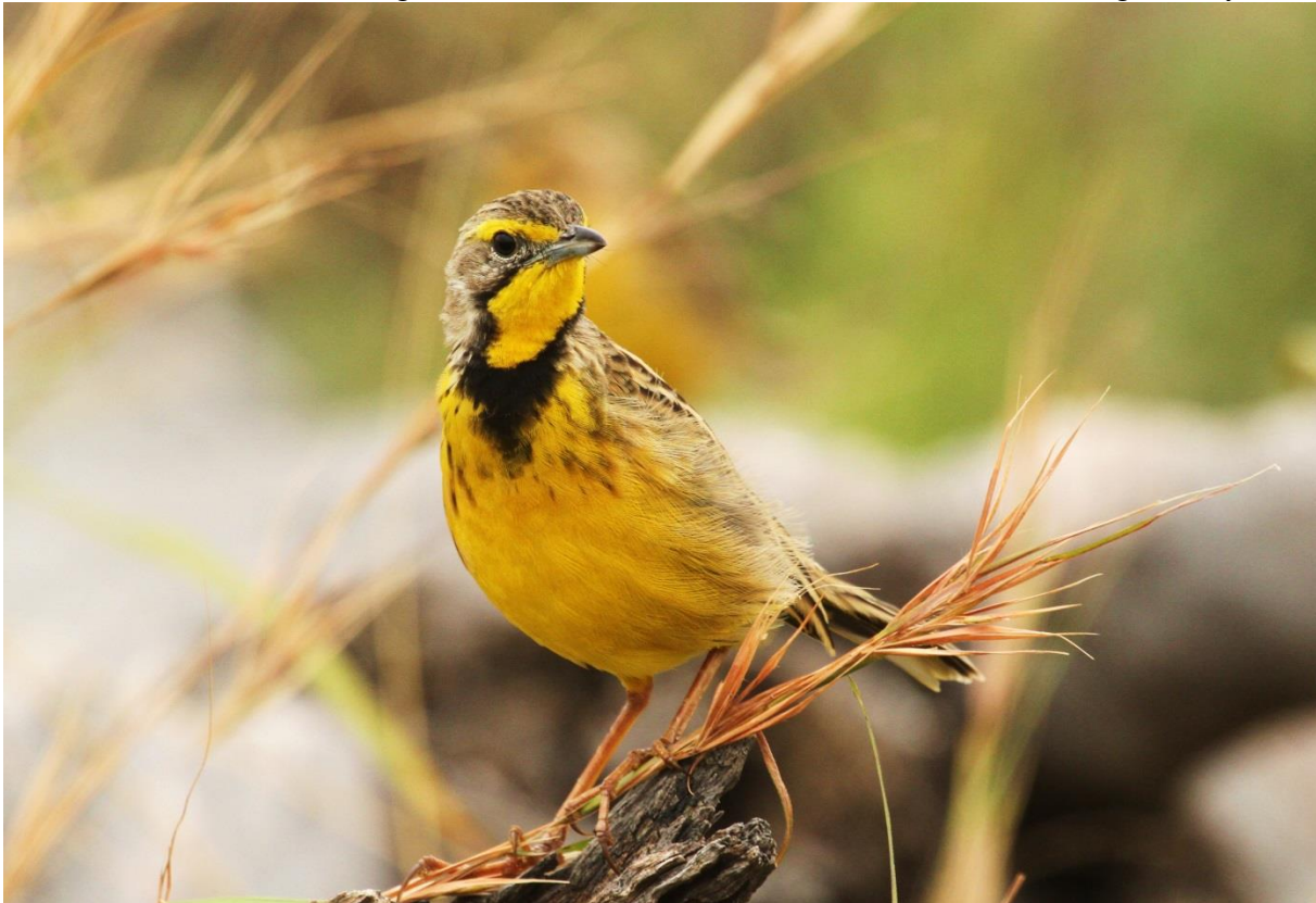
The Meadowlark look-alike, Yellow-throated Longclaw.

Our first birding of the tour started with a trip south of Nairobi to the saline Lake Magadi. Although the Lake was our final destination it took a long time to get there as the road leading was very birdy indeed. Our first birds were Marabou Storks which we actually found frolicking amongst the Nairobi traffic. Moving out of the city and over the Ngong Hills where the habitat changes and we had our first Schalow's Wheatear . Once we started descending into the Great Rift Valley we came upon a couple nice flocks in the acacia scrub which held sharp looking Red-throated Tits, Banded Parisoma, White-bellied Canary, and Red-and-yellow Barbet , amongst others. Further along we went for a stroll and found Blue-capped Cordonbleu and Southern Grosbeak-Canary , while close by a Jackson's Hornbill was calling, three great target birds acquired. Suddenly 2 Abyssinian Scimitarbills flew over and landed in a nearby acacia showing off their bright red, curved, bills. At the lake the main target was Chestnut-banded Plover , which we saw right away.