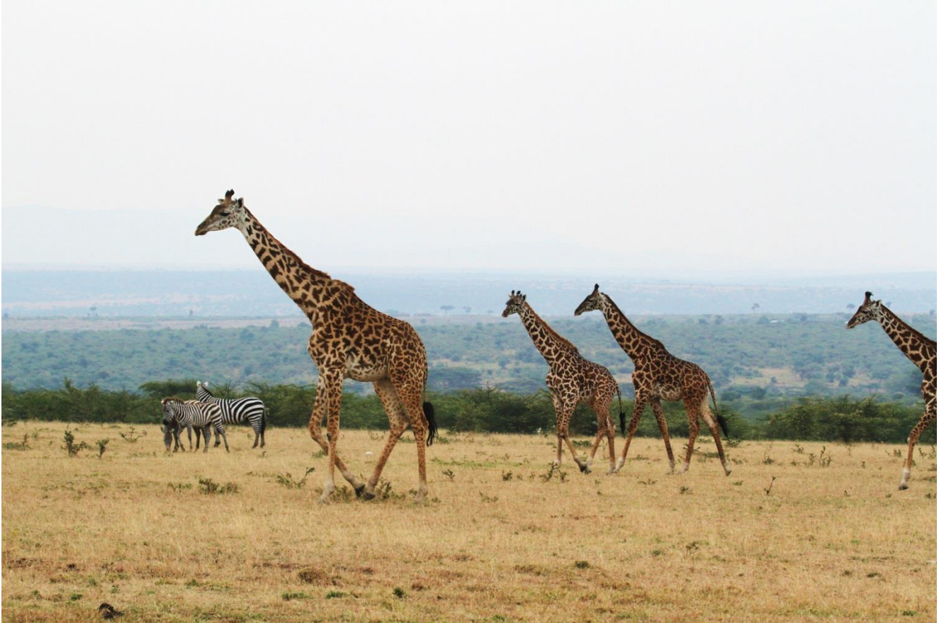
The docile and graceful Giraffe, always a favourite.

amazing and is a must visit. In fact about 600 species have been recorded in Nairobi N.P. within the city limits, making Nairobi the world “birdiest” capitol. We saw many great birds here this afternoon including the localized Nairobi Pipit , African Rail , White-bellied Tit , Hartlaubs’s Turaco , Scarlet-chested Sunbird , and many more. Our first day of birds and big mammals comes to an end. Spirits are high in excitement for the rest of the tour.