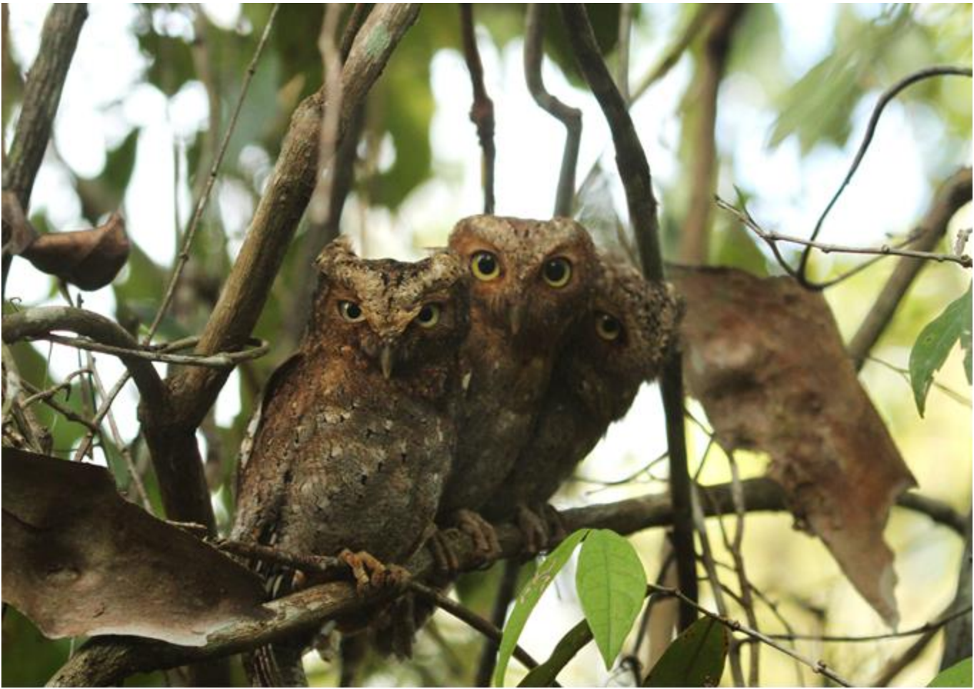
Voted cutest bird of the trip, these rare and local Sokoke Scops-Owls are a trip highlight.