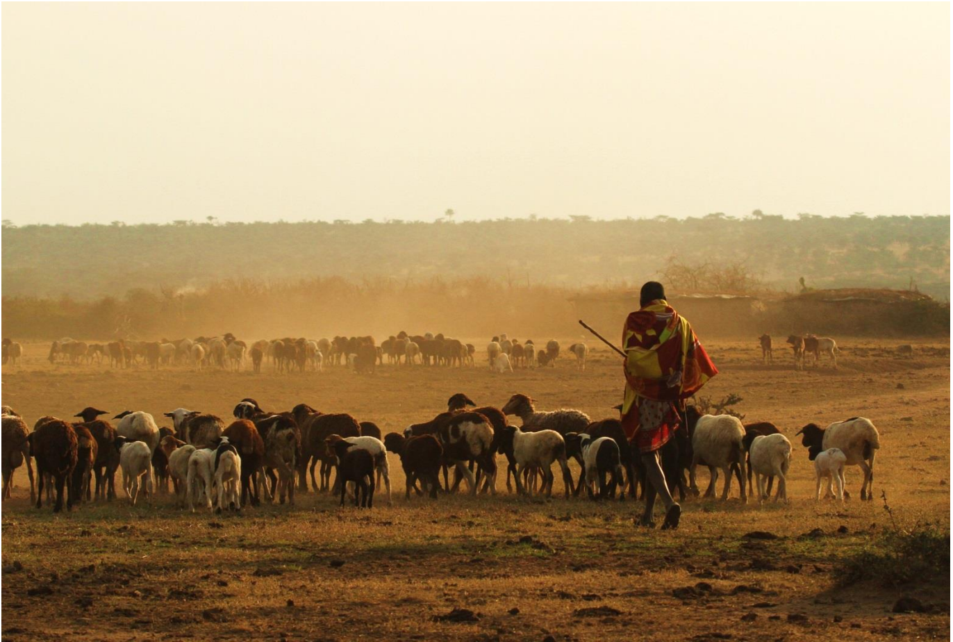
A Masai man and his herd.