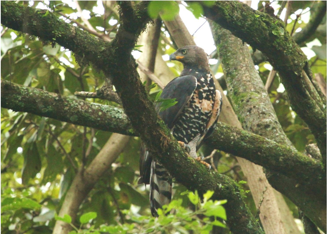
The mighty Crowned Hawk-Eagle just after narrowly missing a Blue Monkey in Kakamega.