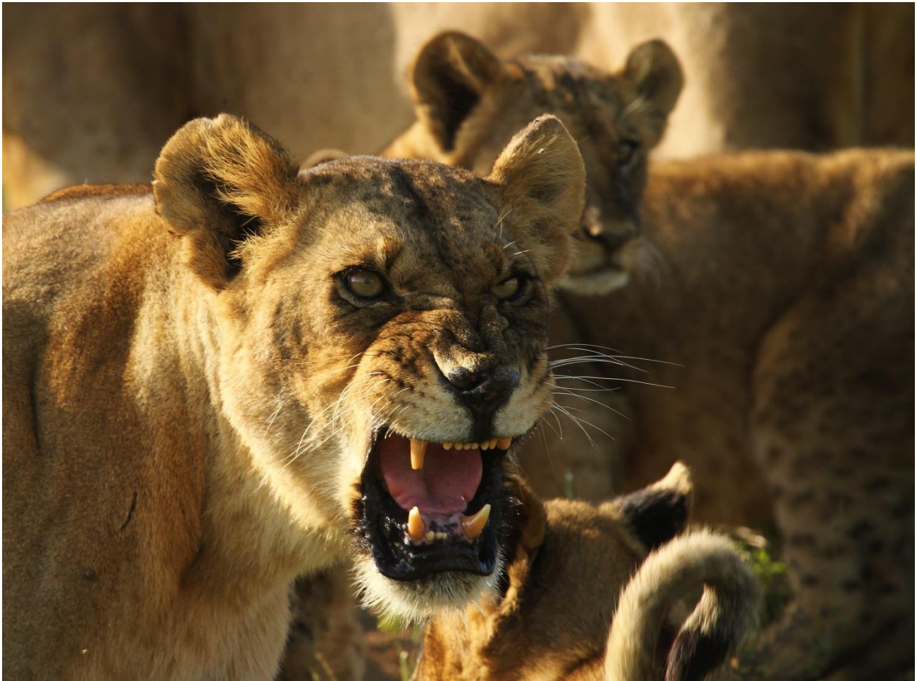
Lioness in protection mode, Lake Nakuru NP.

be Kenya. This tour was not timed to get a huge species list, since the European migrants were not present yet, but instead timed to get the most out of the Wildebeest migration in the Masai Mara Reserve. Highlights were plentiful for this tour, and it is hard to peg down and one highlight. Big cats are always a favourite, and they put on a show for sure. Seeing a family of Cheetah feeding on a Thomson's Gazelle, and then finding Serval and a pride of Lions 20 minutes later was cause for a morning celebration. Then watching a Leopard at a "feeder" in the east was simply too easy. Watching thousands of wildebeest cross the Mara River guarded by 20 foot Nile Crocodiles puts the reality of the food chain in your face. Then, being in the middle of the commotion while the huge African Crowned-Eagle attacked a troop of Blue Monkeys in Kakamega Forest, and finding the rare Sokoke Scops-Owl and weird Golden-rumped Elephant-Shrew in the coastal Sokoke forest. These are just a few of many great memories.