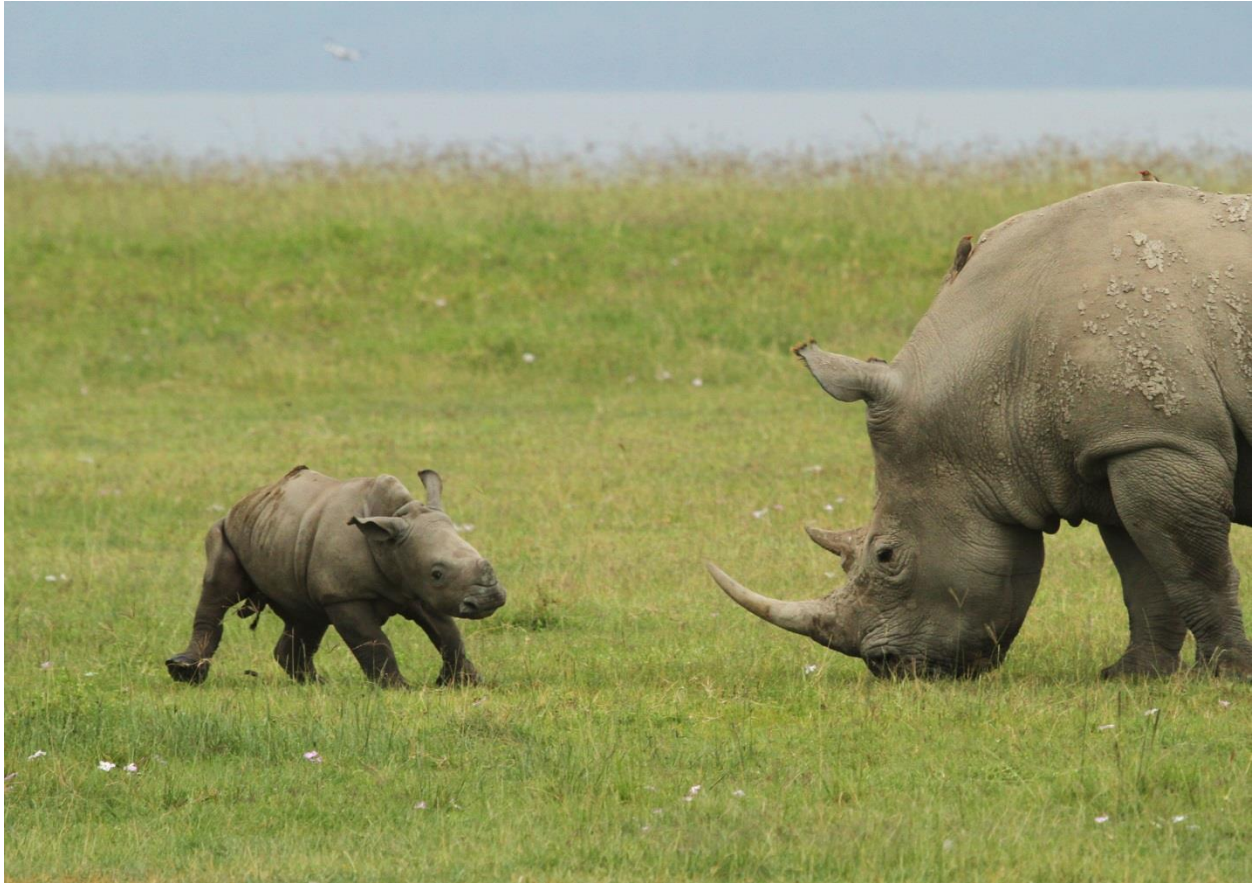
Baby White Rhino “shuffelin”, Lake Nakuru.

and well maintained with beautiful yellow Fever Trees with Waterbuck and Bushbuck grazing right outside your door.