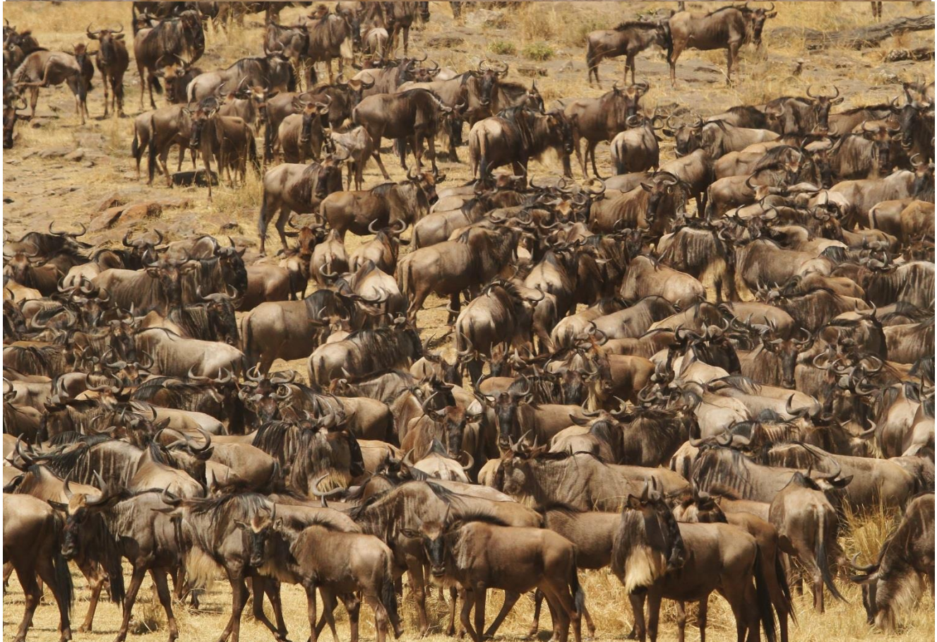
Thousands of Wildebeest cross the Mara River, where it pays to be cautious.