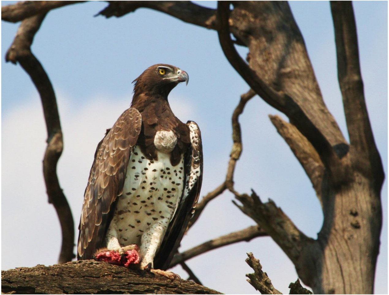
Martial Eagle with Banded Mongoose prey, the aerial apex predator.

Driving to another area of the Reserve a huge number of Wildebeest had gathered. As far as the eye could see the grass was littered with mammals. It is a treat to witness this fluid mosaic of life. Amongst the Wildebeest were hundreds of Topi, and Thomson's Gazelle, but we also found 2 separate prides of Lion, numerous Spotted Hyena, and a few Black-backed Jackal. Finding kills, old and fresh, was a regular occurrence, and was great to see the vulture diversity here. Lappet-faced, White-backed, and Hooded Vultures were in large numbers literally cleaning up the grasslands. We also did well finding all the small bird species, cleaning up all the Cisticolas needed, including Trilling Cisticola .