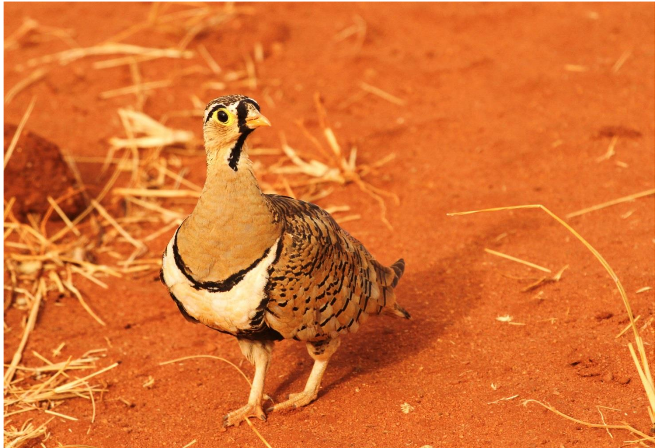
Beautifully patterned and confiding, this Black-faced Sandgrouse was a great find.