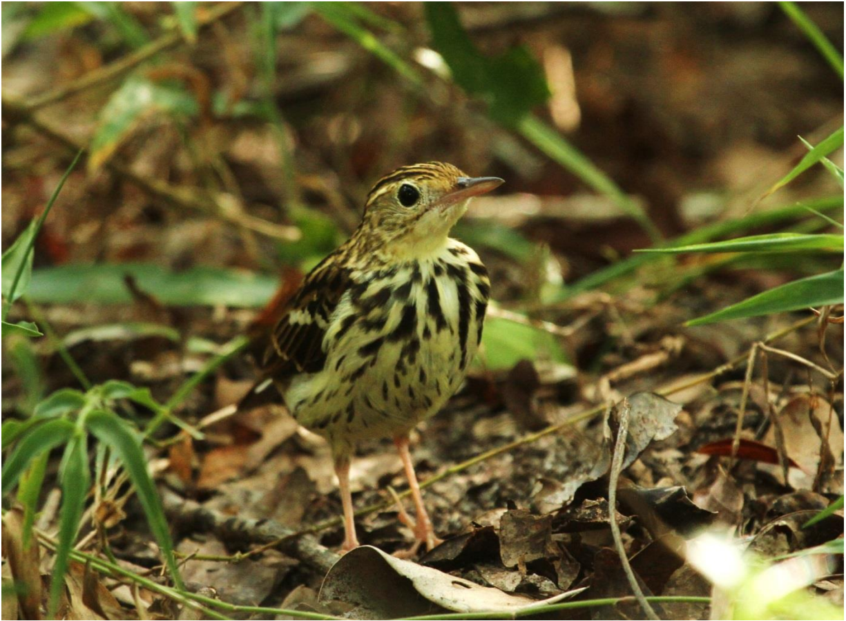
The shy Sokoke Pipit is an odd and beautiful species of the coastal forest floor.

The afternoons were spent along the coastal mangroves and flats of Mida Creek and Sabaki River Mouth. We found some great shorebirds at low tide from the monotypic Crab Plover , to the squat Terek Sandpiper , and the elongated Eurasian Curlew . The coastal scrub held Zanzibar Bishop , Golden Palm Weaver , and even Violet-breasted Sunbird . On the coast we found 6 species of terns plus Sooty Gulls . As the light faded on our final day in the area we watched Collared Pratincoles flying around us on the sand dunes, a great way to end our time here.