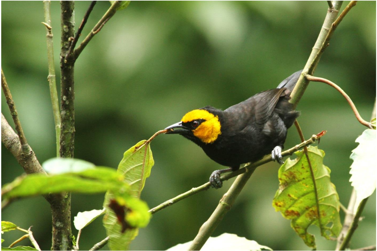
Black-billed Weaver in Kakamega Forest collecting nest materials.