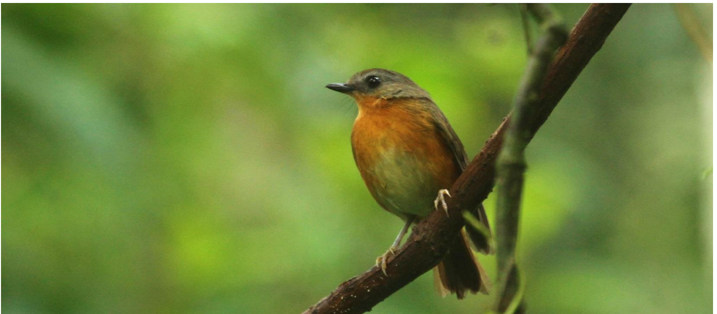
The Equatorial Akalat, a shy species of the forest undergrowth in Kakamega.

We arrived in Kakamega by mid-afternoon and immediately started birding the road. Right away we got into some flock activity, which included some tricky skulkers like Banded Prinia and Black-faced Rufous-Warbler . Entering our hotel grounds at the beautiful Rondo Retreat it was clear that this was going to be a very “birdy” area. On arrival we were greeted by the weird Great Blue Turaco , which was nesting on the hotel grounds. Simply going to our rooms to drop off our luggage we had to stop to see the nearby Gray-headed Negrofinch , White-chinned Prinia , and Vieillot’s Weavers . Our final bird of the day was a Mackinnosn’s Fiscal , of which there is a resident pair using the lodge as their feeding ground.