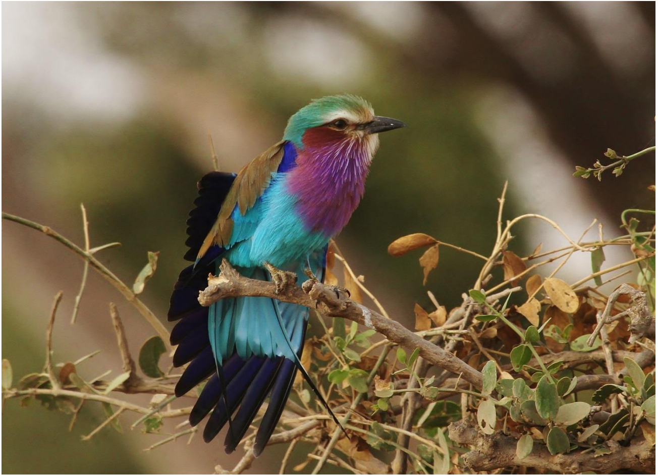
The most photographed bird species in east Africa, the Lilac-breasted Roller.