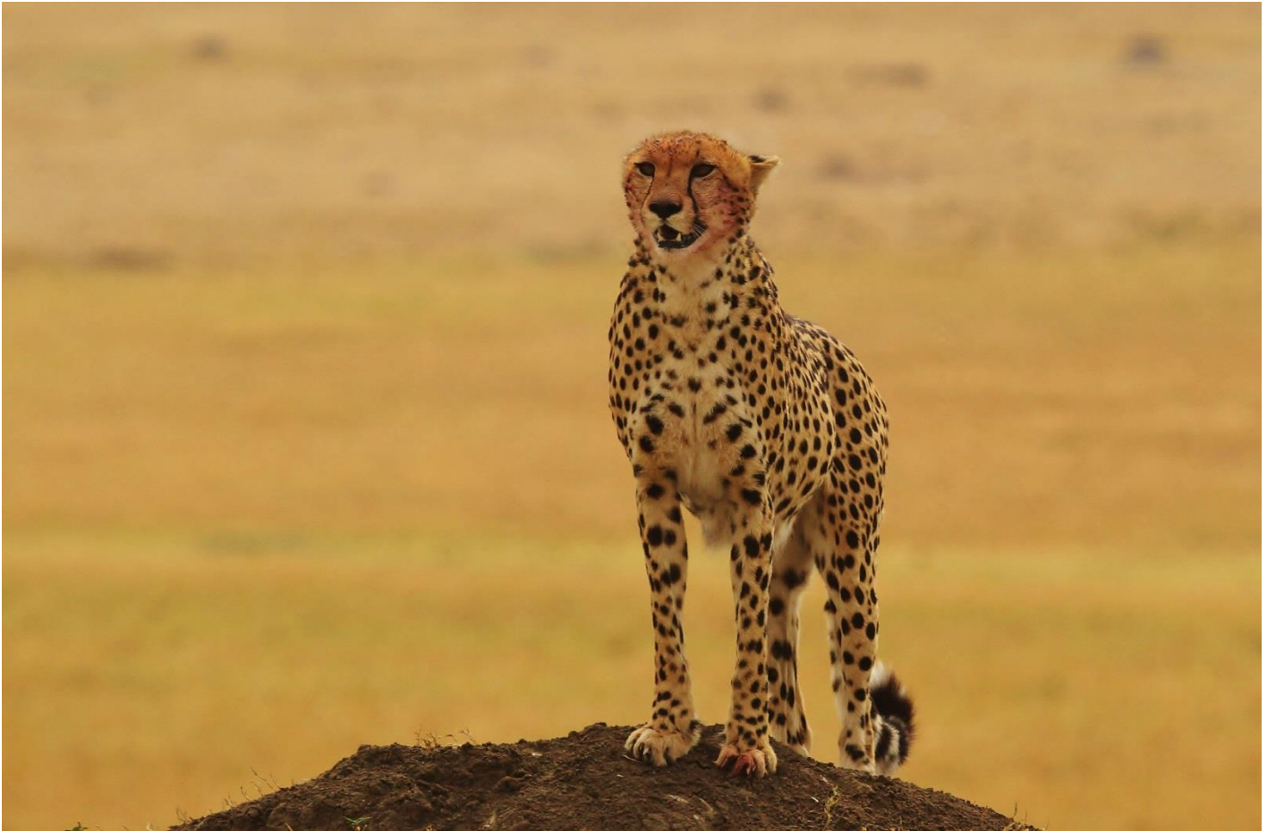
This mother Cheetah and her 3 large cubs were voted top mammal of the tour.

Another great highlight was to witness the Wildebeest and Zebra crossing the Mara River. A well known subject for wildlife documentaries, it is indeed very hard to predict exactly when they will make their crossing, and the timing changes every year. So to see 3 different crossings was indeed very fortunate. This is a very stressful time for these animals as massive Nile Crocodiles also gather at the crossing spots for this seasonal buffet. Indeed the river is strewn with hundreds of carcasses, and we even witnessed a huge croc take out a young Wildebeest. It was amazing to see the raw power of nature, and the annual predator/prey relationships that have gone on in this area for millennia.