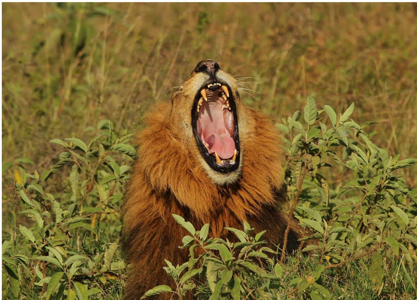
Male Lion showing his hardware, Lake Nakuru.

After getting all of our targets at Lake Baringo it was time to head south across the equator and into the magical Lake Nakuru National Park. Famous for its million or so flamingos the lake didn't disappoint as we entered the sea of pink. Scouring the shoreline we also had amazing views of Greater Painted-Snipe as well as a few migratory shorebirds like Ruff , and Common Greenshank . The park is also famous for its sizable population of White Rhino, of which we found 8, including a mother and young. We were even lucky enough to find 2 Black Rhinos in the surrounding forest. Another spectacle were the huge numbers of Great White Pelican , nearly pink in their breeding plumage it was amazing to see hundreds of these giant glide over the glass water in evening light. Our final surprise of the day came around sunset as the rare Striped Hyena trotted across the road in front of us. A very lucky sighting indeed, as this bone eating specialist is much more shy than the common Spotted Hyena.