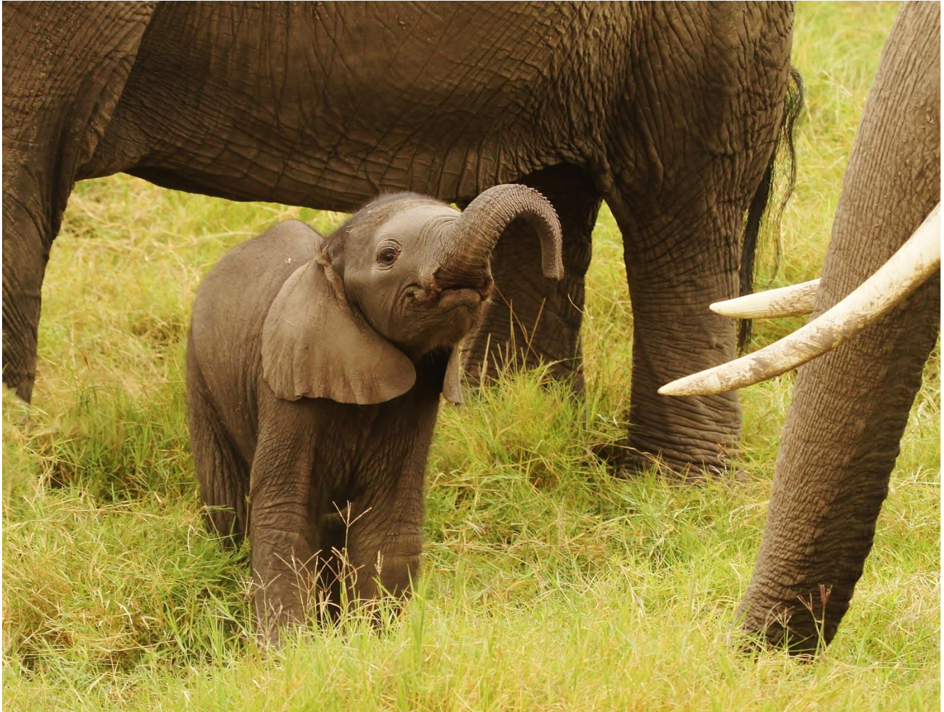
Young African Savannah Elephant still learning to use its trunk.

After checking into our hotel we immediately headed back out to the beautifully named Dunge Swamp. Our main quarry here is Papyrus Gonolek as well as other marsh inhabitants. We tried for some time for the Gonolek, but alas we had to settle for a heard only for this secretive species. Alas we still got some great birds such as Papyrus Canary, Slender-billed Weaver, and the cute Carruther's Cisticola.