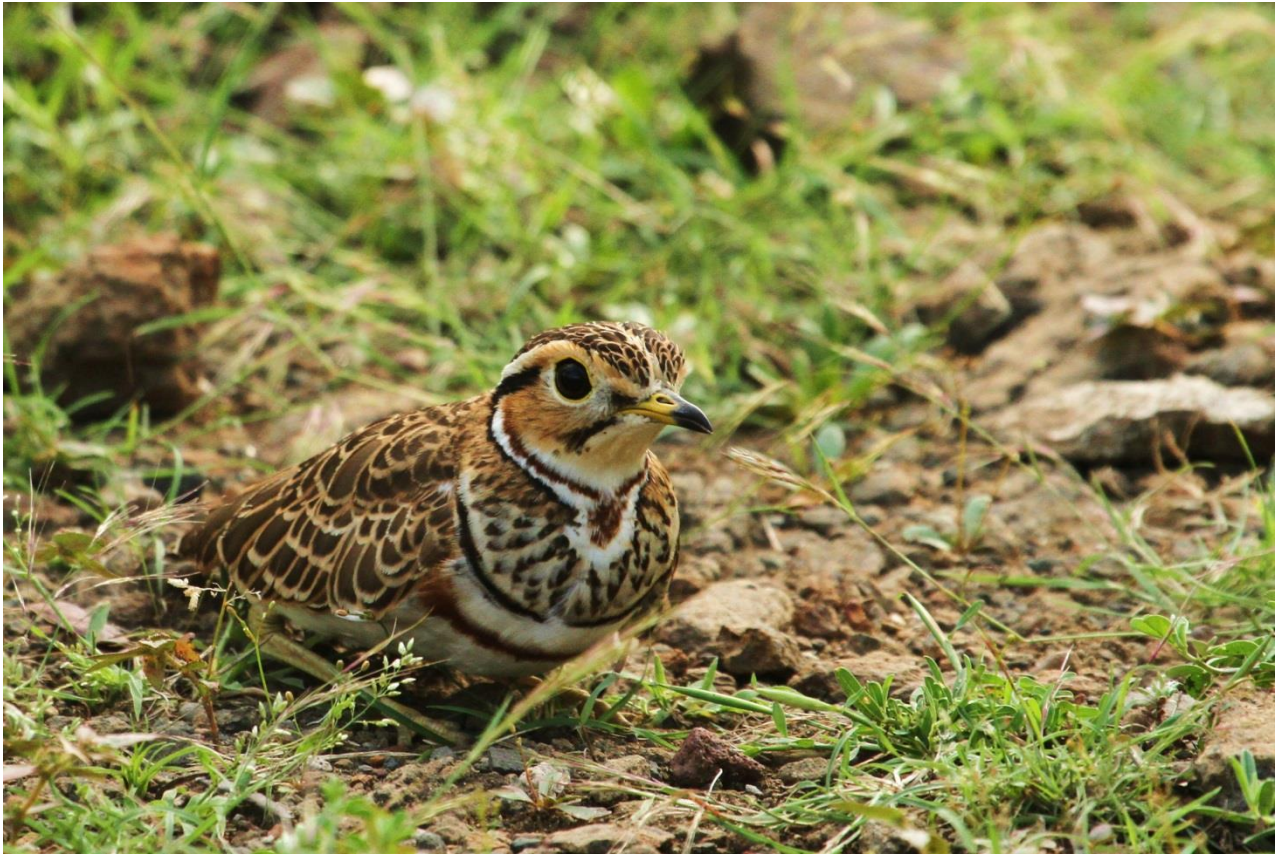
The beautiful Three-banded Courser roosting at Lake Baringo.