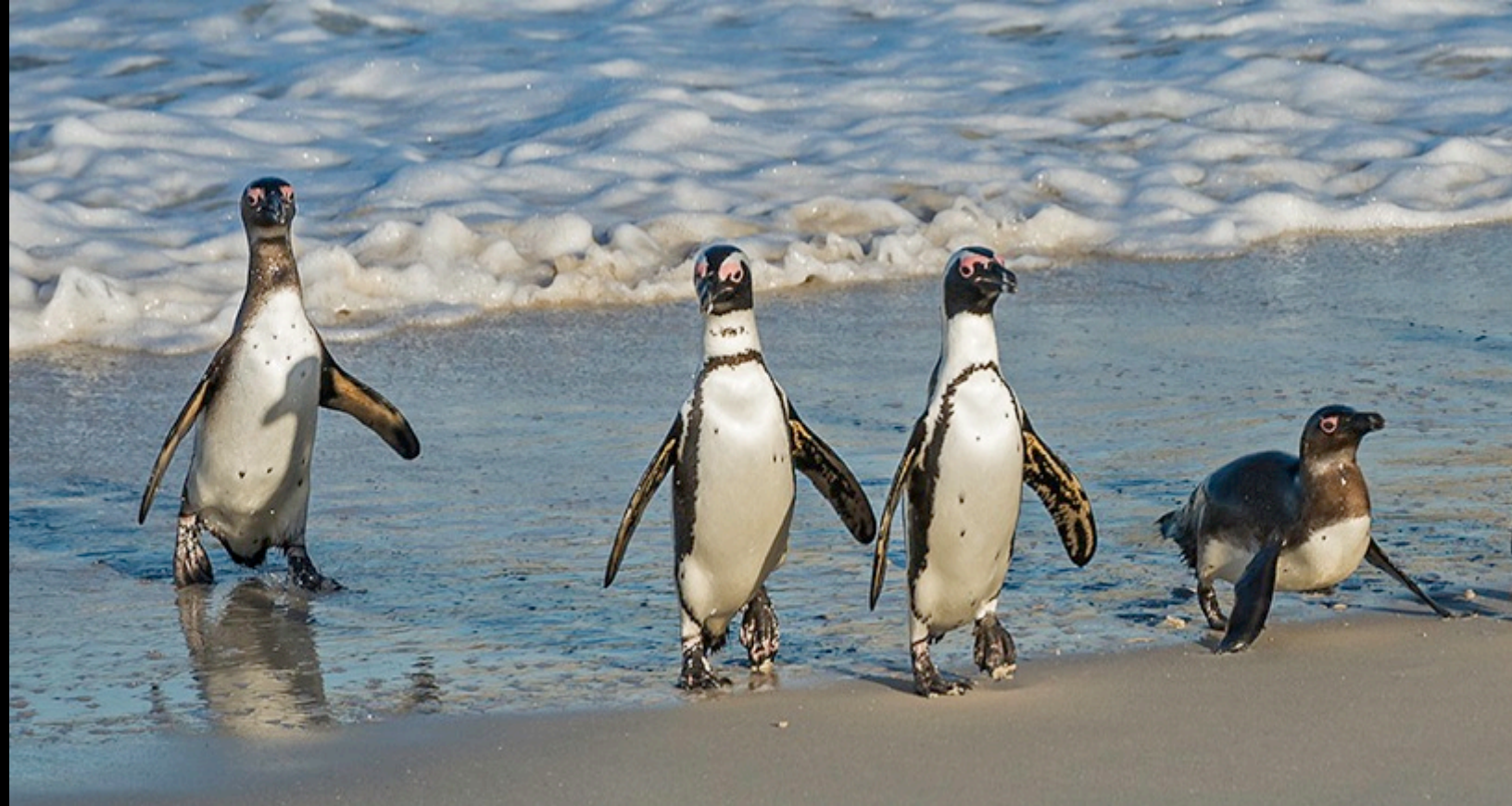
A couple hours spent photographing Jackass or African Penguins near Cape Town was a delight.