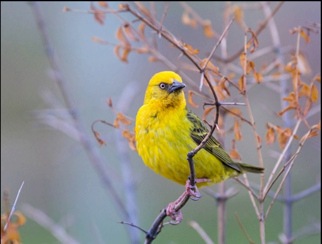
The bird feeders at our lodge near the Tanqua Karoo attracted species like this Cape Weaver. Ken Behrens.