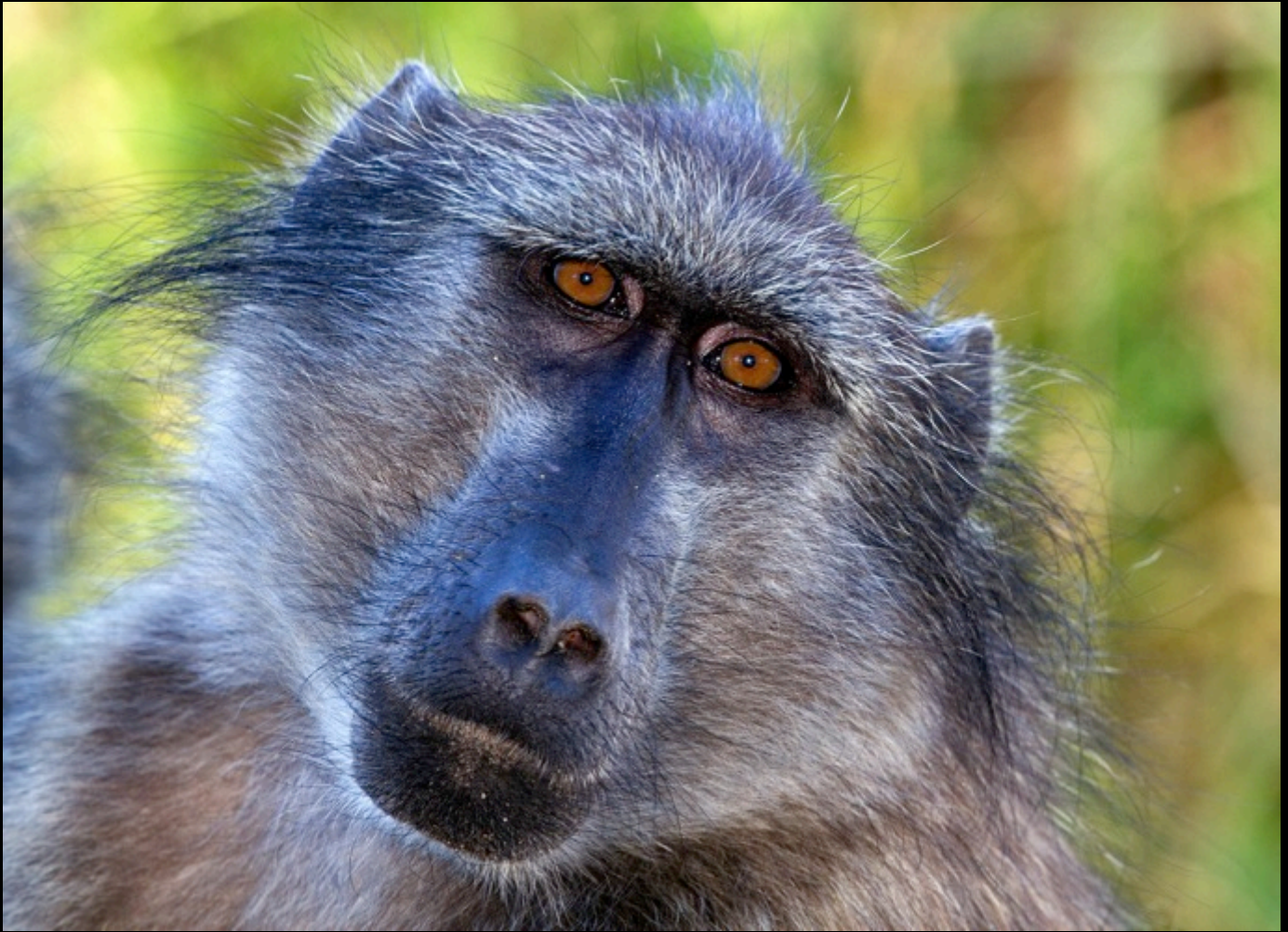
A soulful-looking Chacma baboon from Kruger.