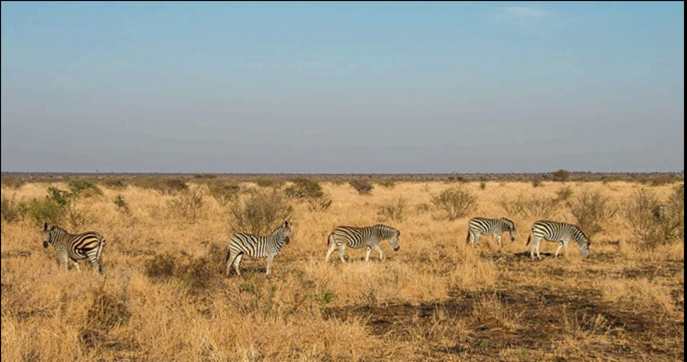
Burchell's Common Zebras and the dry season colors of Kruger.