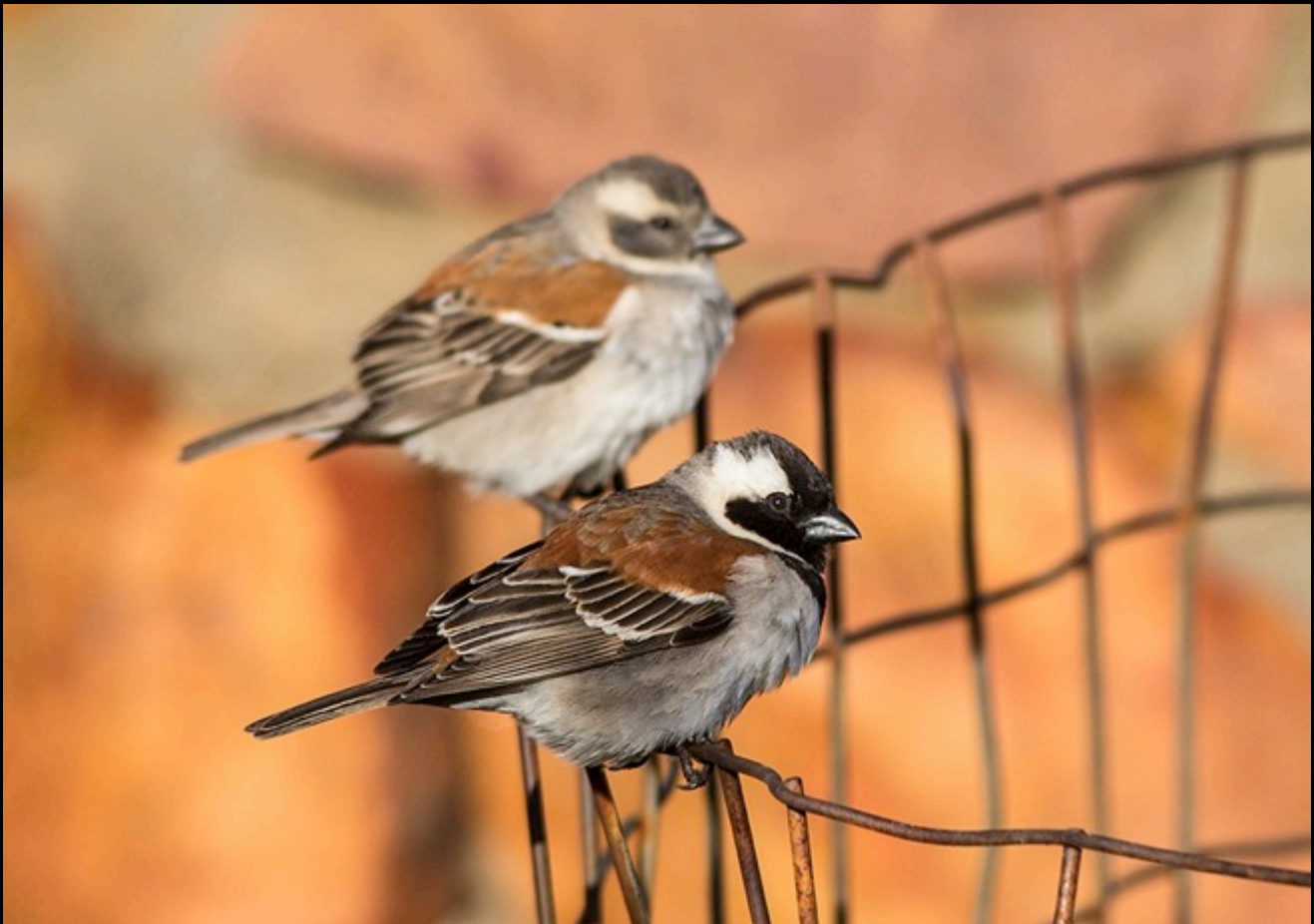
Mrs. and Mr. Cape Sparrow.