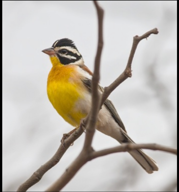
A couple of Kruger's bounty of bird species, most of which are approachable and photographable: Natal Francolin (left) and Golden-breasted Bunting (right).