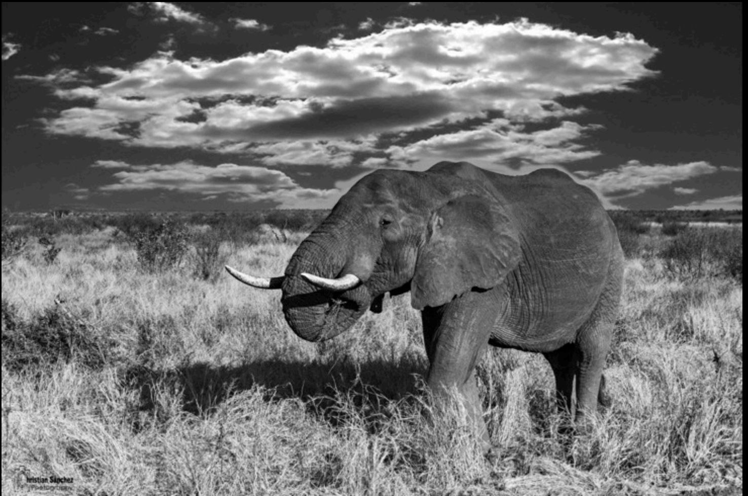
An elephant looking good in black and white.