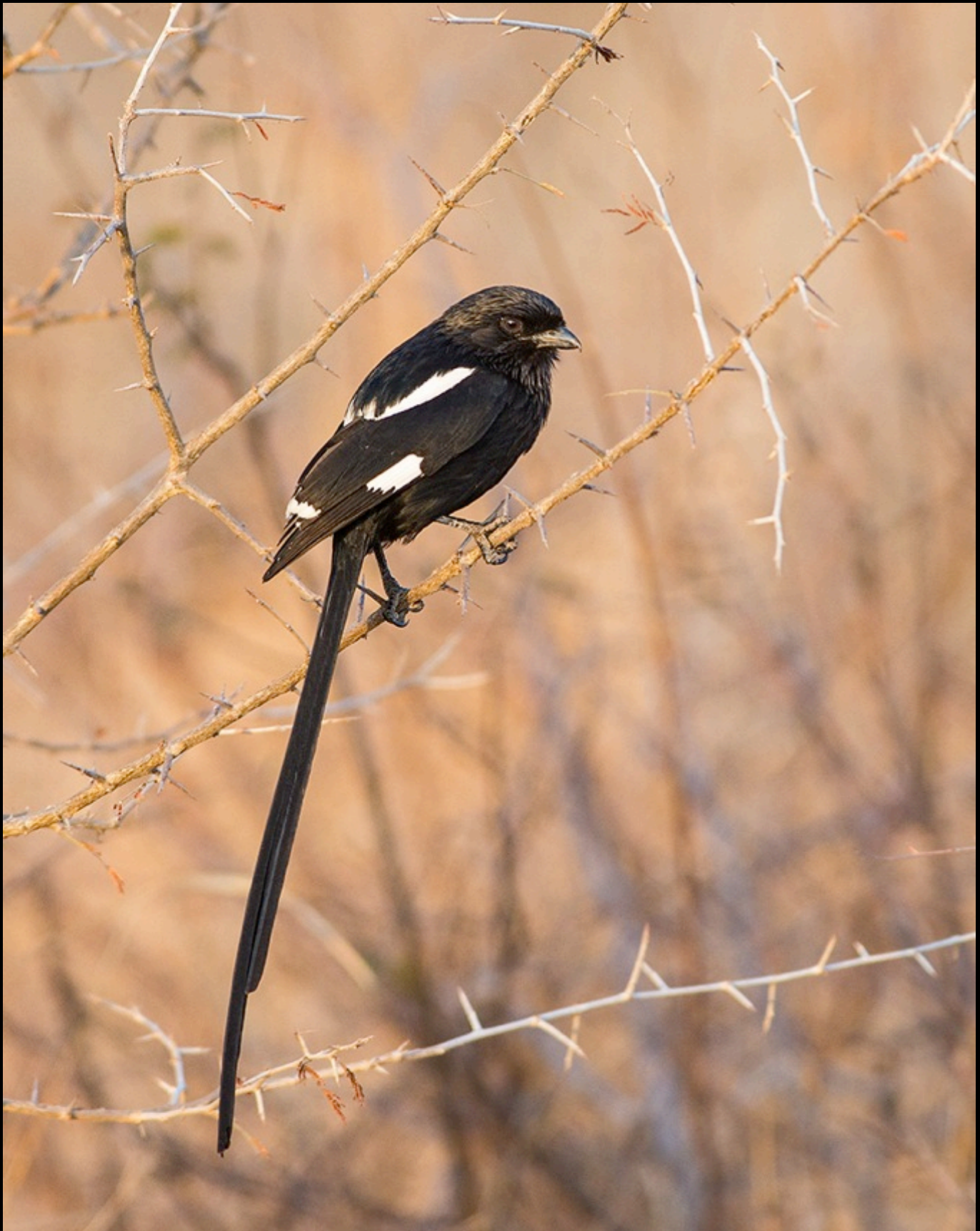
The improbable Magpie Shrike, in Kruger.