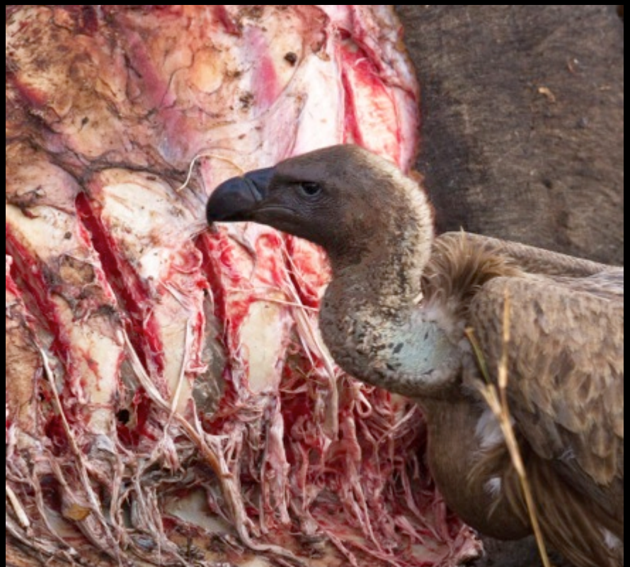
This lion had made a kill, which attracted White-backed Vultures.