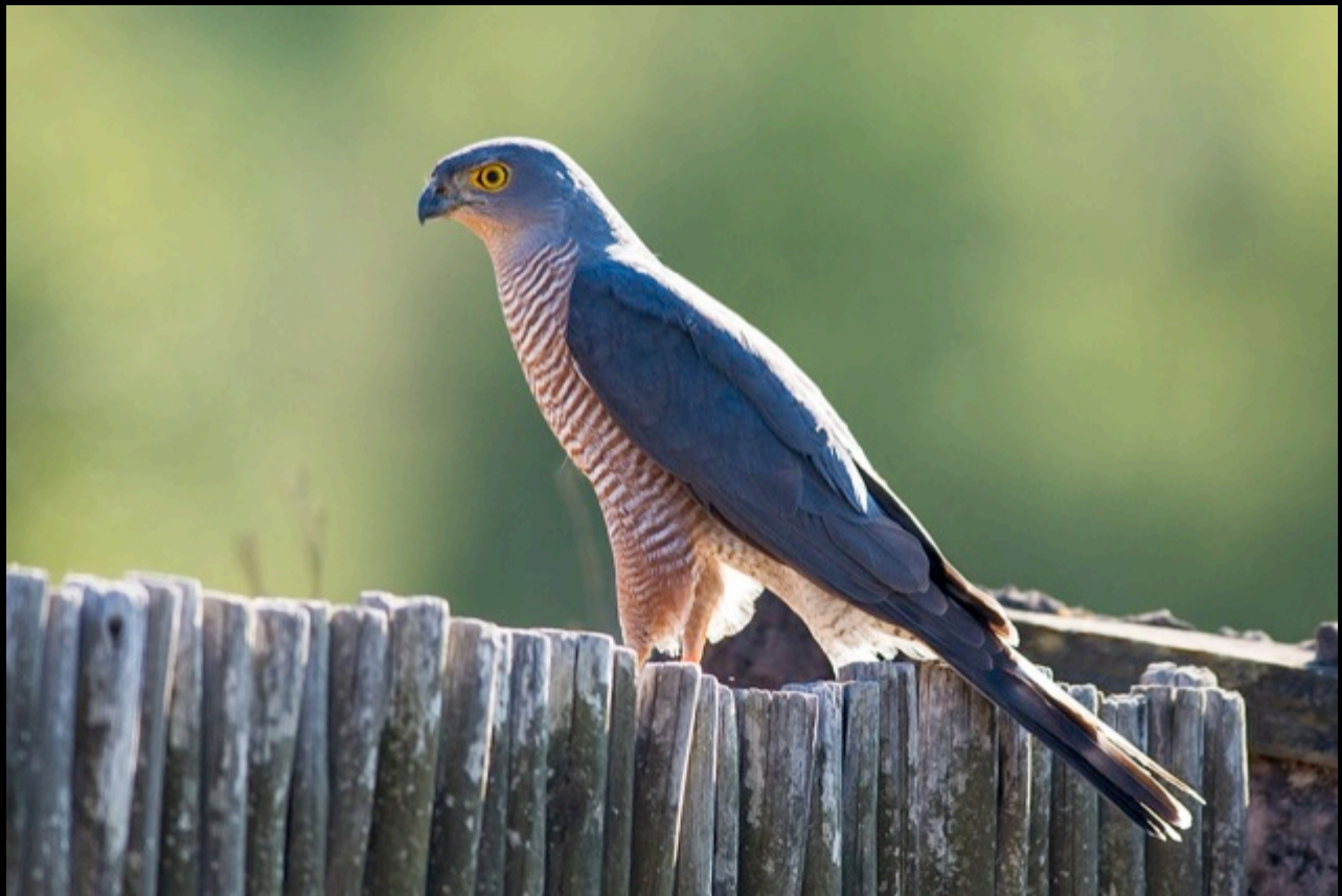
African Goshawk in the mountains east of Johannesburg.