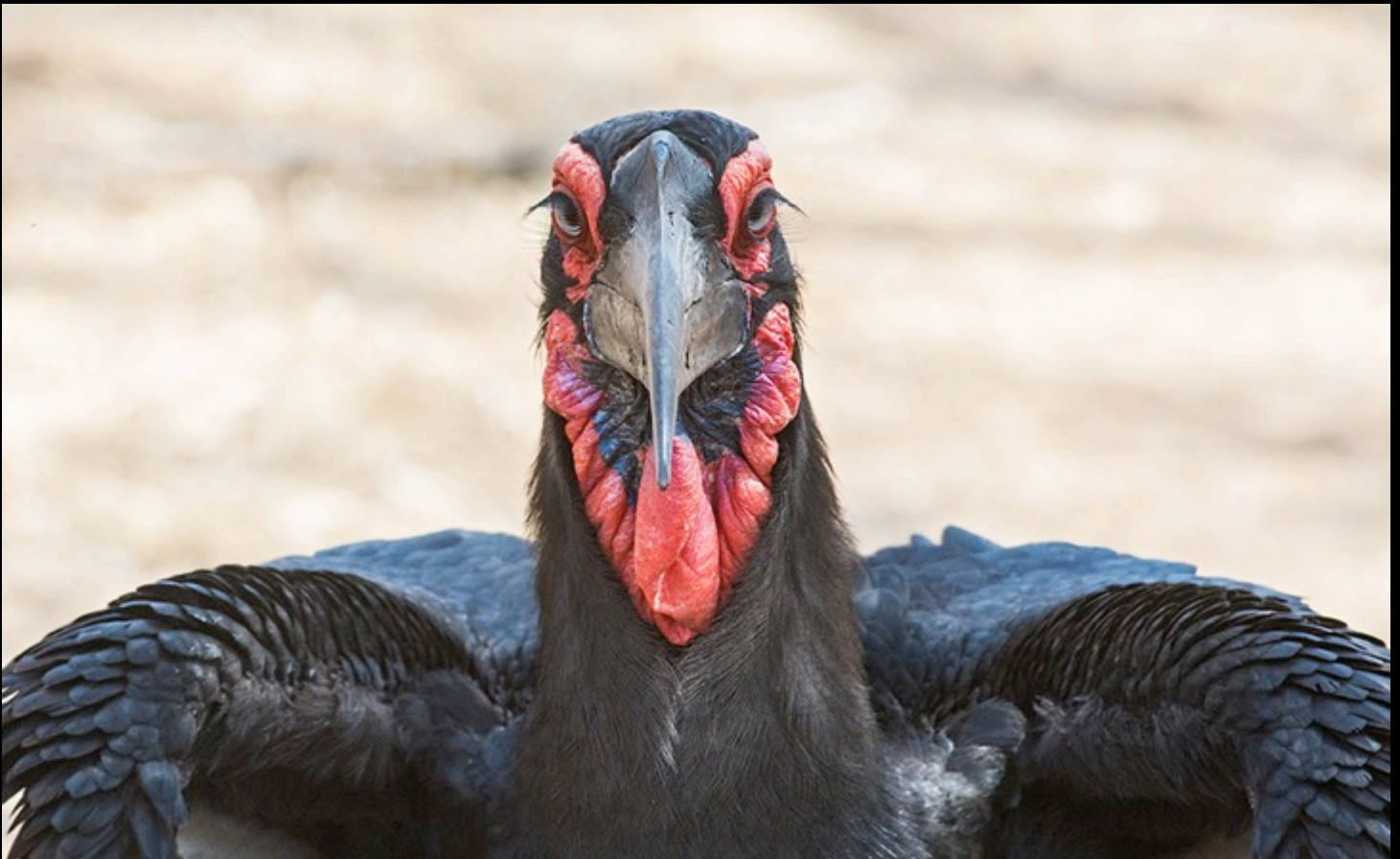
Southern Ground Hornbill is a broad-shouldered beast of a bird! Ken Behrens.