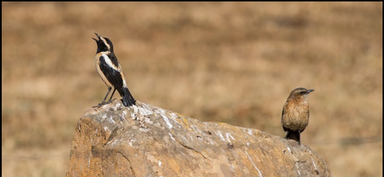
Buff-streaked Chat, a sharp Highveld endemic from Dullstroom.