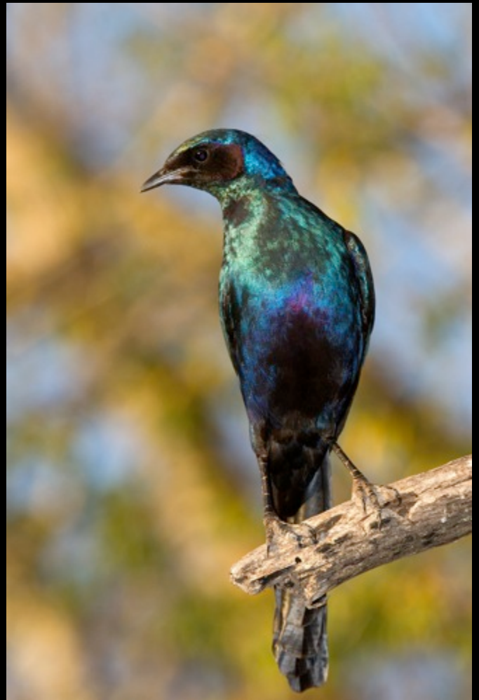
Southern Yellow-billed Hornbill (left) and Burchell's Starling (right).