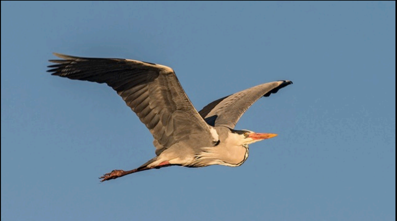
Gray Heron was one of many species that we photographed at Strandfontein. Ken Behrens.