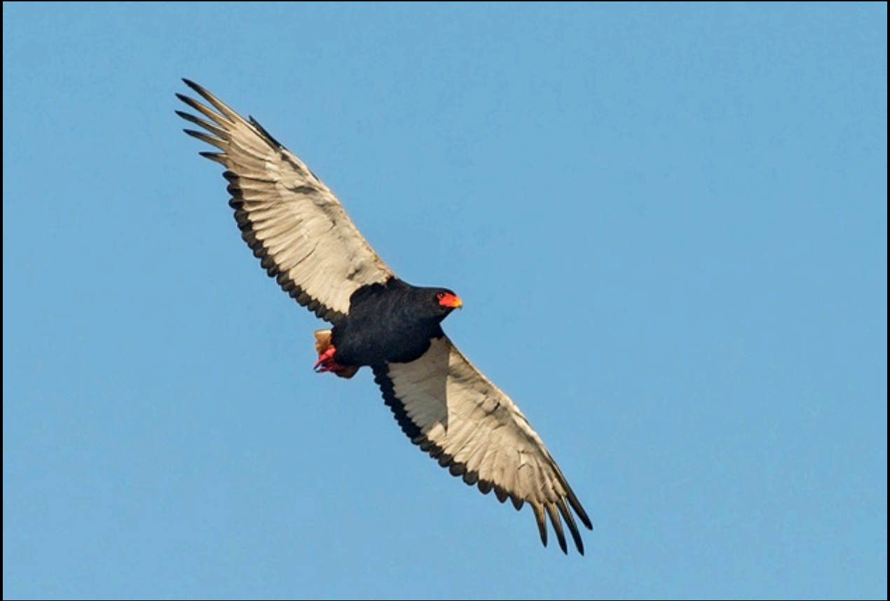
Bateleur is just one of a bounty of raptors photographed in Kruger NP. Ken Behrens.