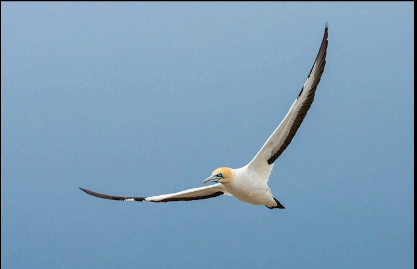
Cape Gannet on the West Coast.