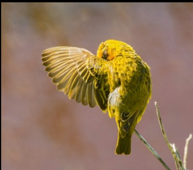
Clockwise from top left: Bokmakeirie, Southern Red Bishop, Cape Weaver, and Purple-crested Turaco.