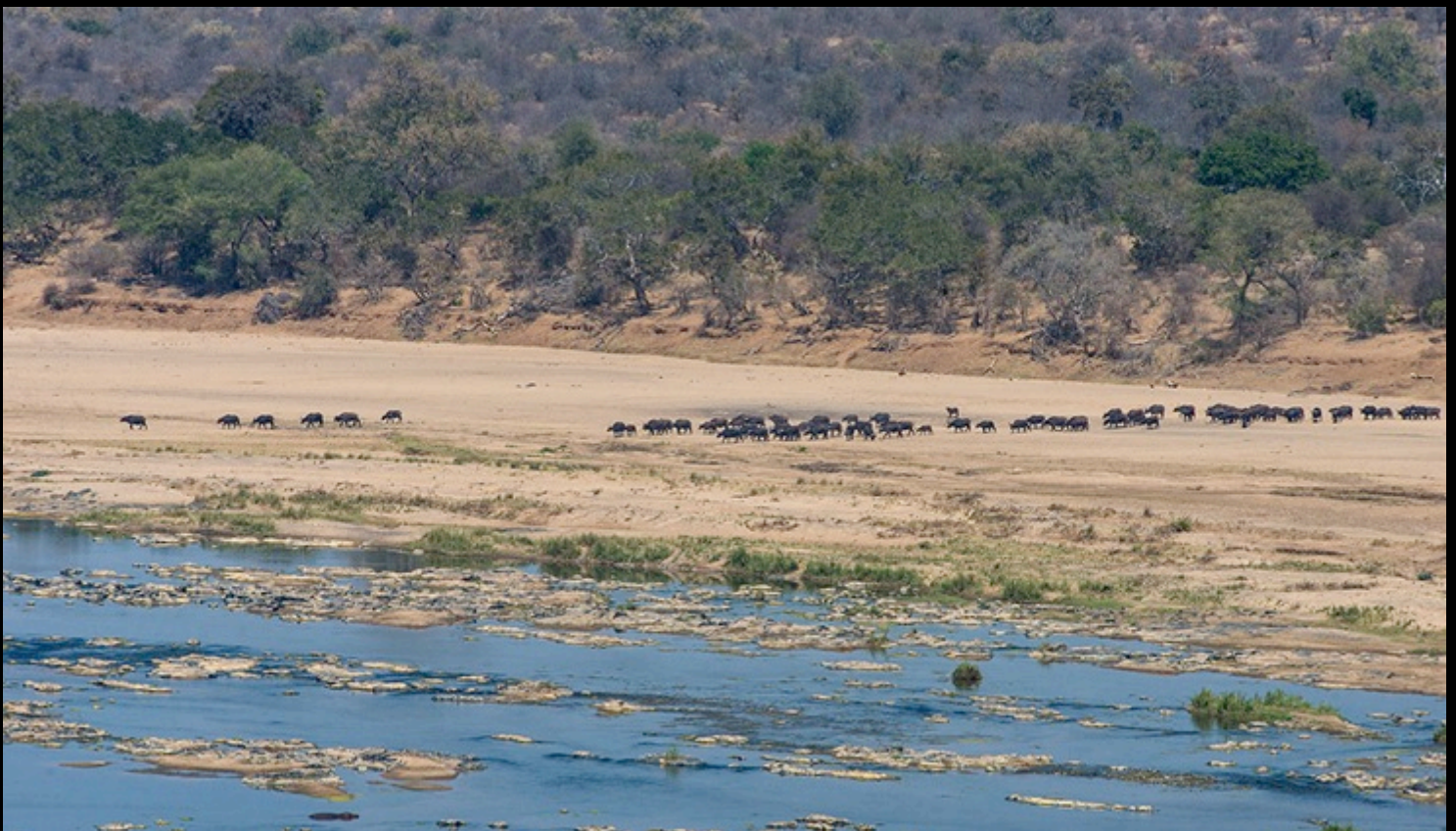
An epic scene from Kruger: African buffalo march down to the Oliphants River to drink. Ken Behrens.