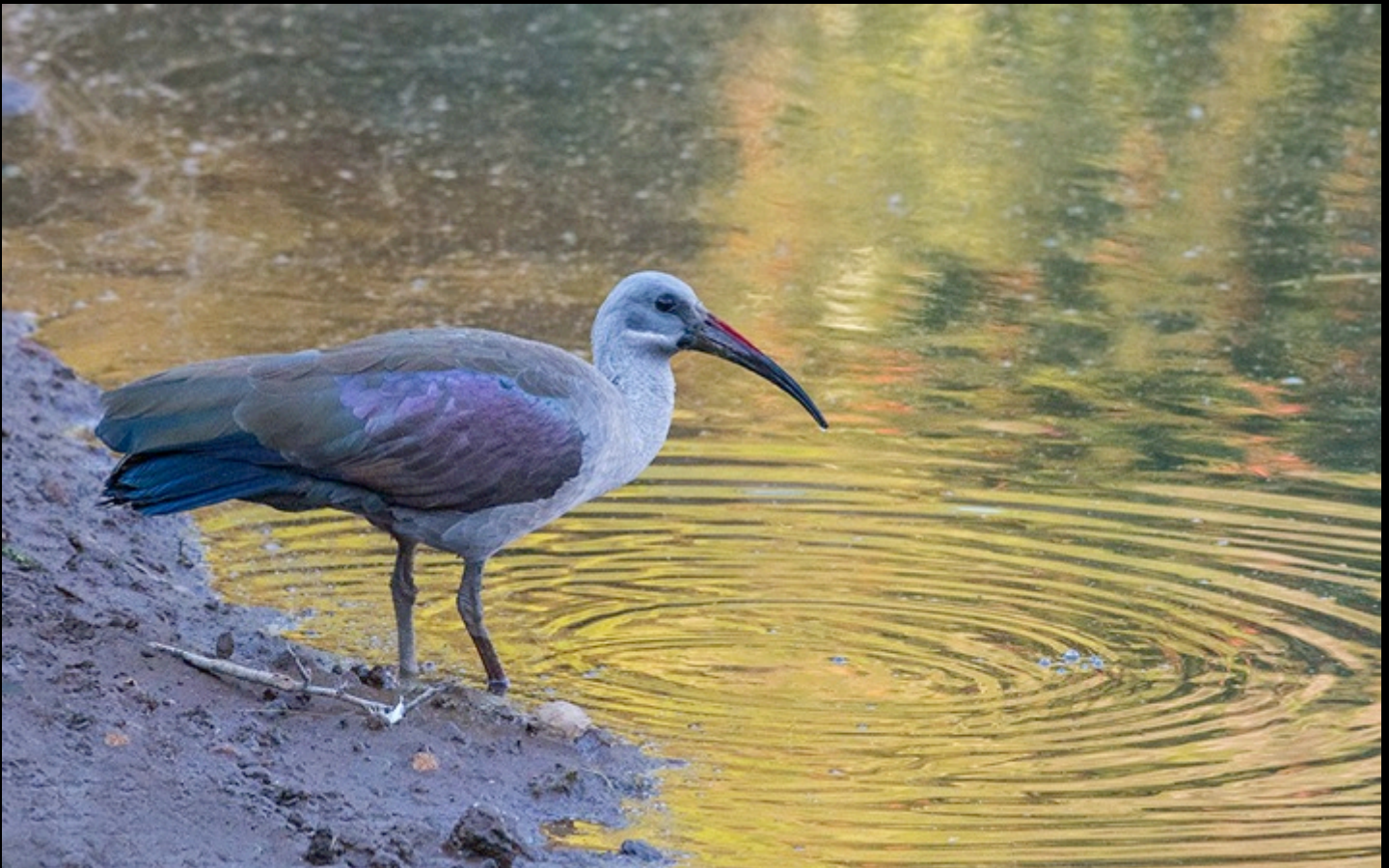
The subtle colors of the Hadada Ibis, in the eastern mountains. Ken Behrens.