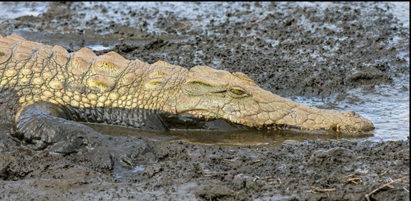
Mud come to life: a Nile crocodile in Kruger.