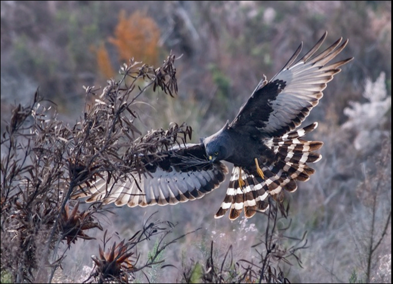
The beautiful endemic Black Harrier in Bontebok NP. Ken Behrens.