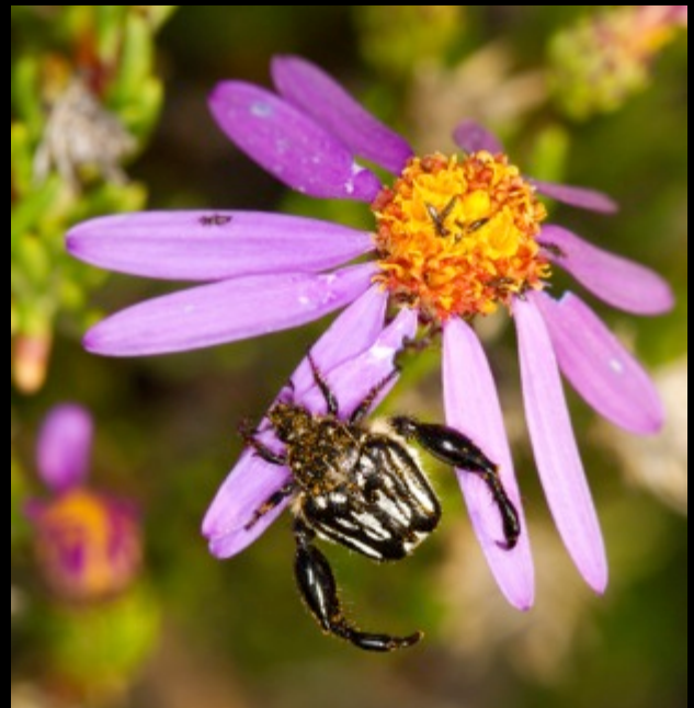
Burchell's Coual (left) and a scarab beetle (right).