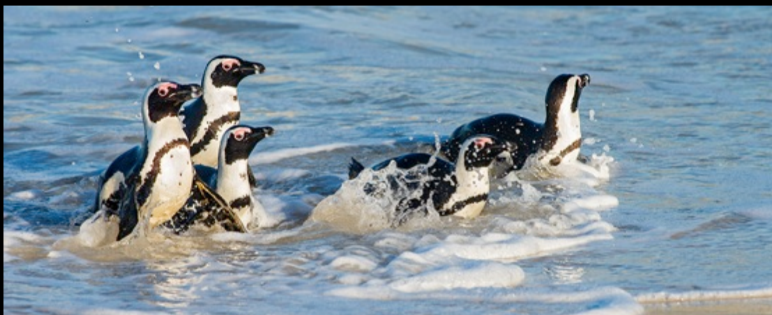
A few more Jackass Penguins... why not?