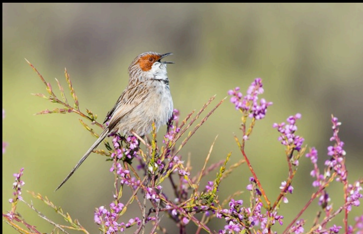
Rufous-eared Warbler, a prize from the Tanqua Karoo.