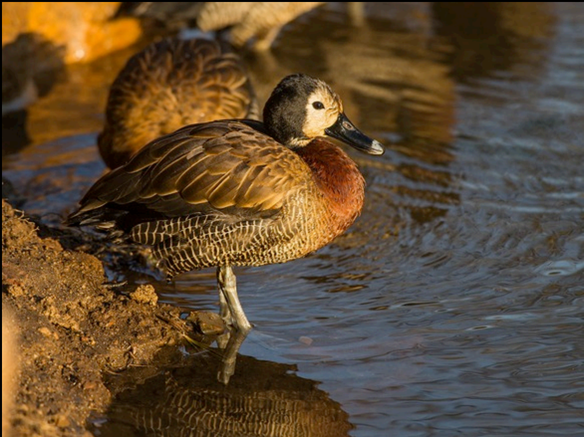
A White-faced Duck in early morning light. Ken Behrens.