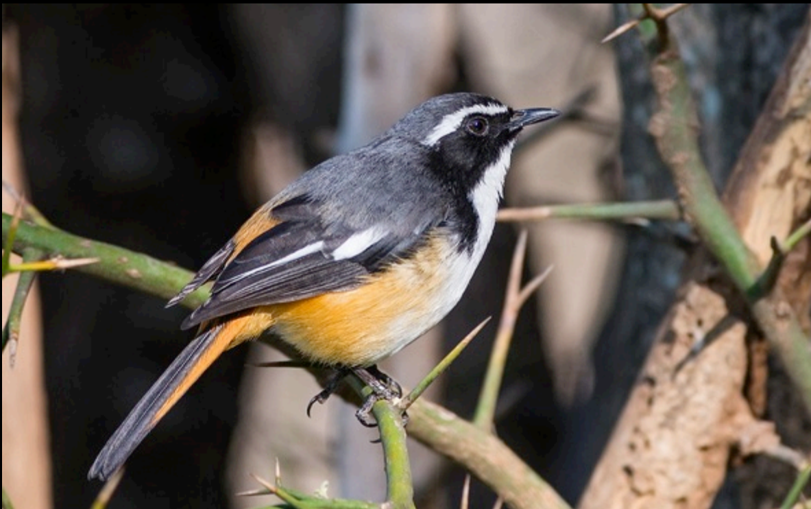
White-throated Robin-Chats performed well at my usual stakeout.