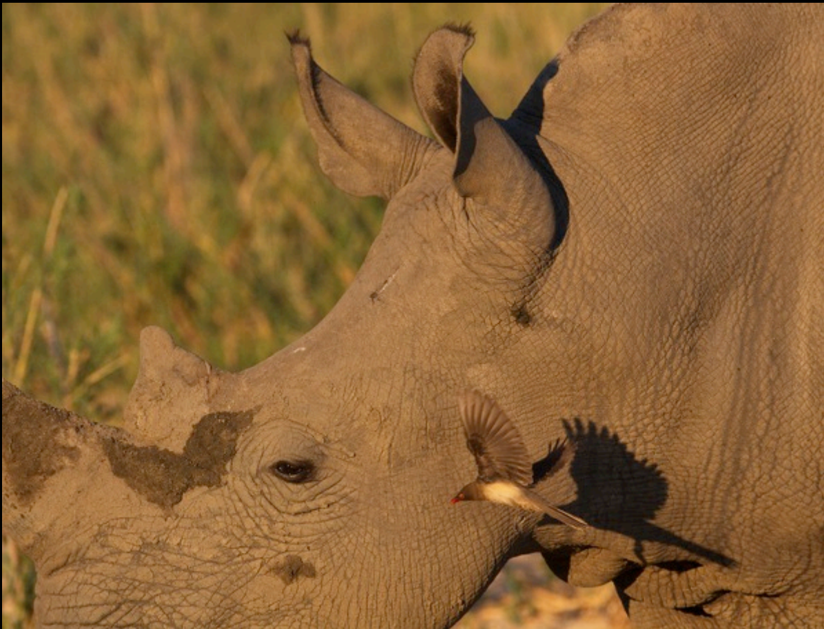
White rhino and Red-billed Oxpecker. Sue Post.