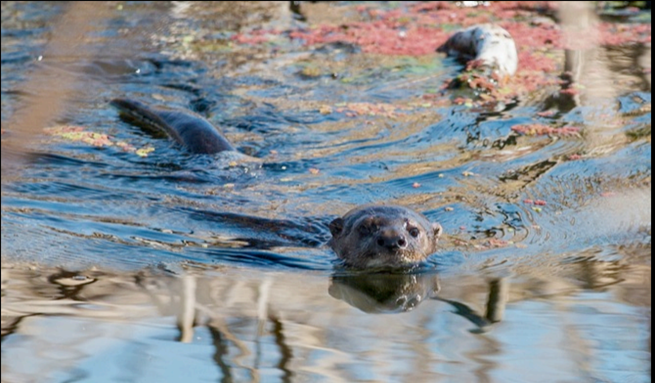
We found a family of spot-necked otters at Marievale Bird Sanctuary.