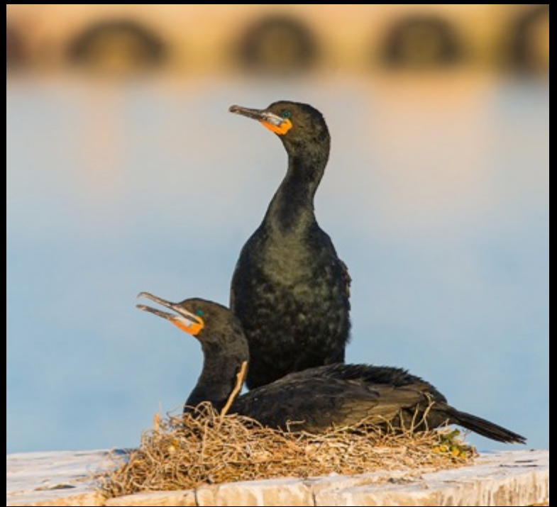
Yellow Bishop in Bontebok NP (left) and Cape Cormorants (right) nesting in Lambert's Bay.