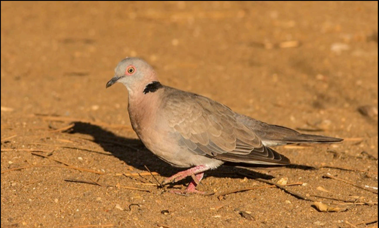
African Mourning Dove from Kruger NP, where the camps are full of tame birds. Ken Behrens.