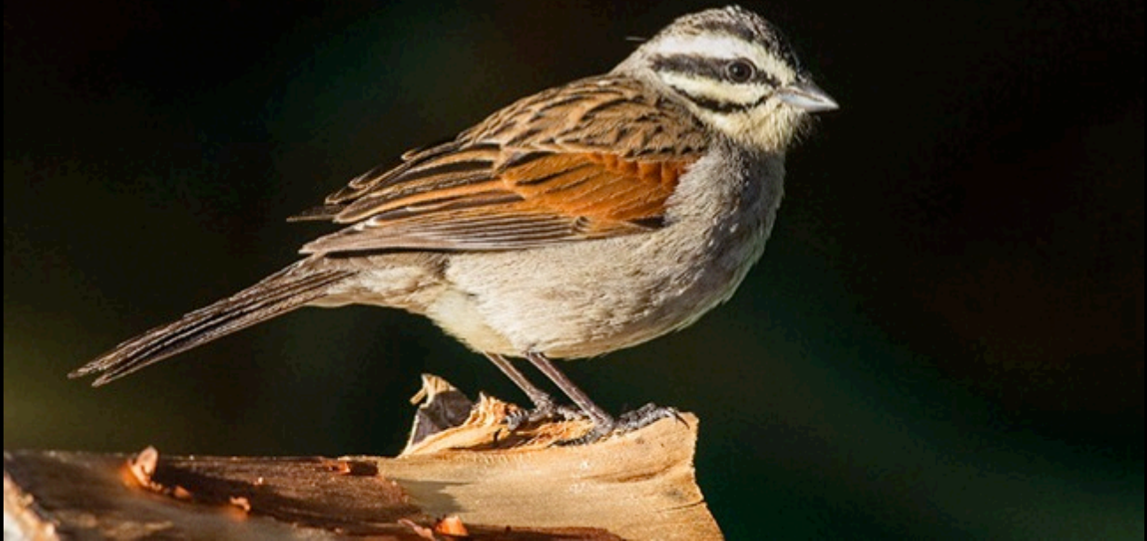
Cape Bunting at our lodge near the Tanqua Karoo. Ken Behrens.