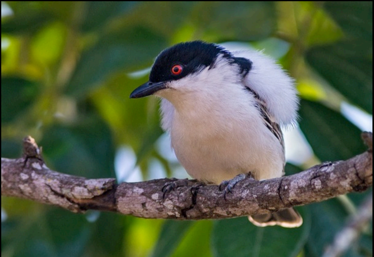
It's uncommon to see a Black-backed Puffback actually puffed up like this! Ken Behrens.