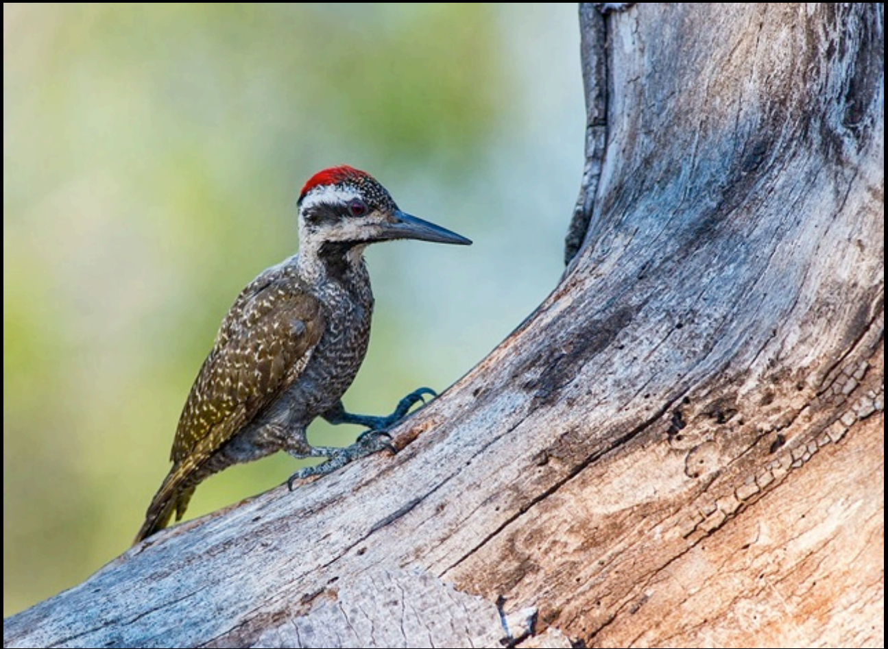
A Bearded Woodpecker in Kruger's Satara camp, which is excellent for photography. Ken Behrens.