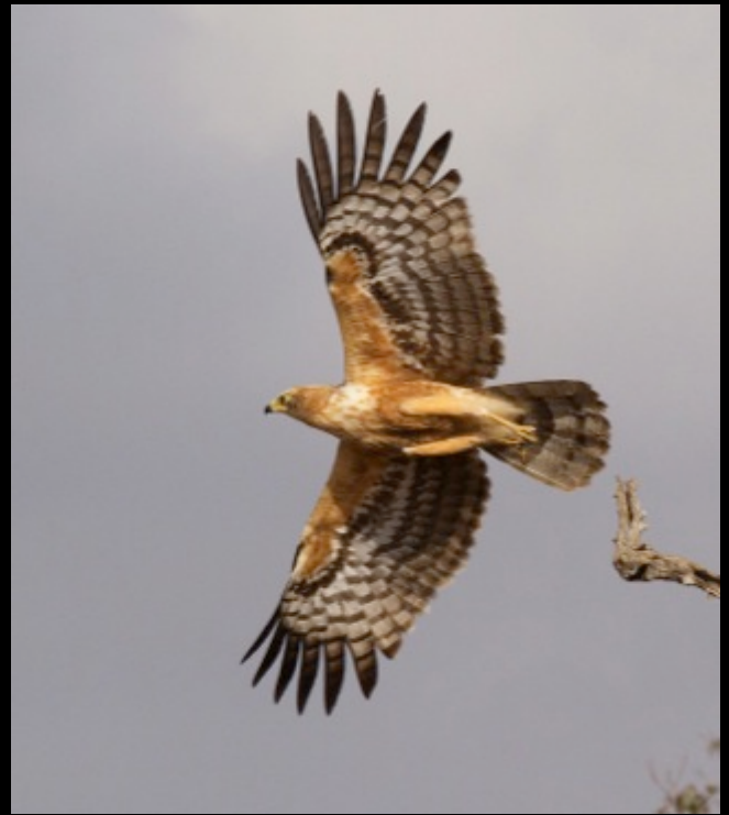
A couple birds on the wing: Lilac-breasted Roller (left) and African Harrier-Hawk (right). Sue Post.