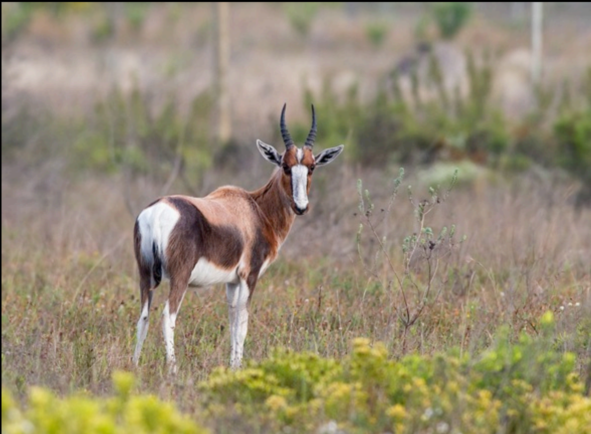
A Bontebok in the well-named Bontebok National Park.