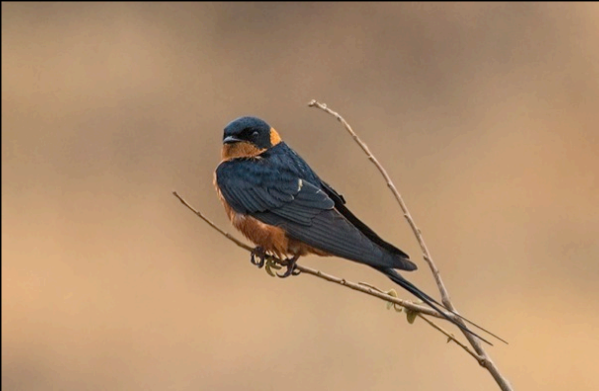
Rufous-breasted Swallow is a hefty grassland swallow found in Kruger. Ken Behrens.