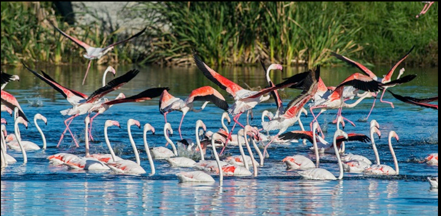
The flamingo spectacle at Strandfontein, near Cape Town. Ken Behrens.