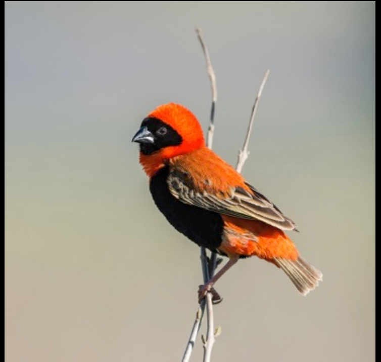
Southern Red Bishops were exploding with breeding plumage and behavior, for excellent photographic opportunities.