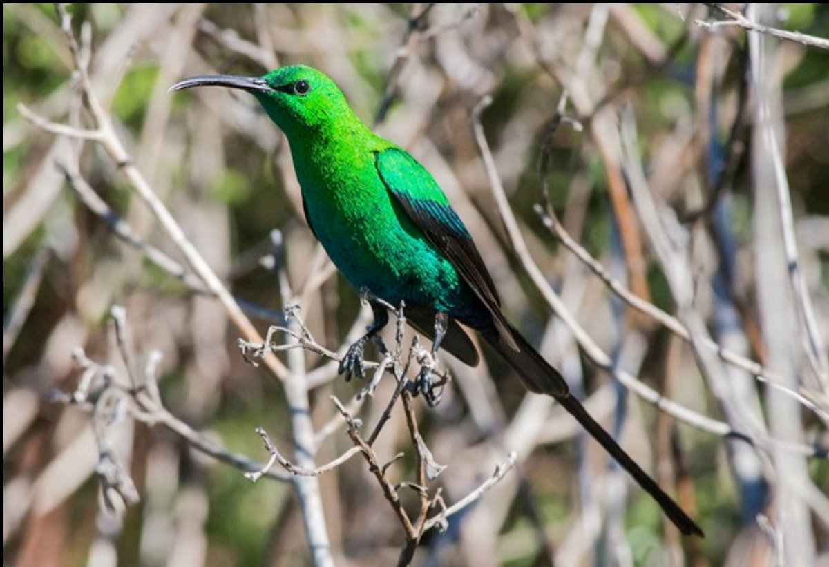
A Malachite Sunbird on the Cape Peninsula.