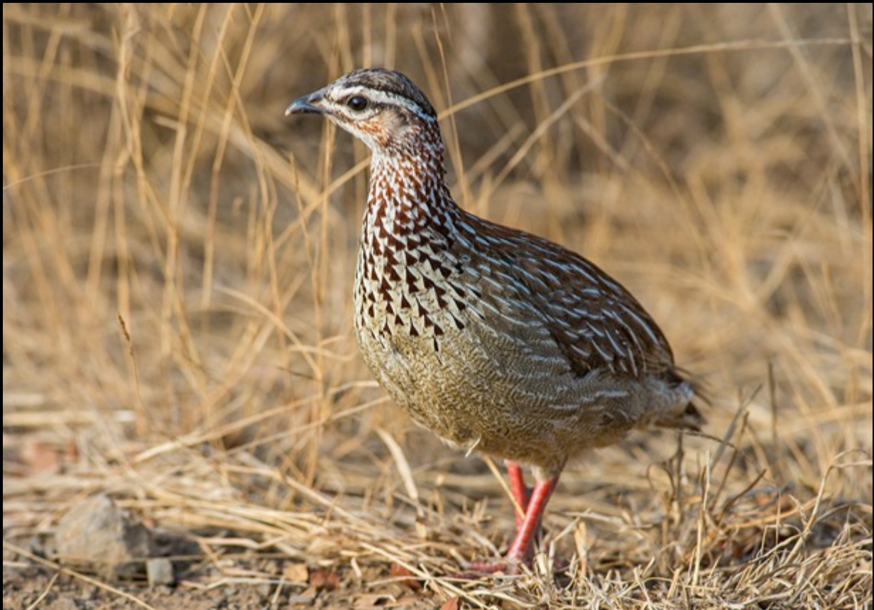
A Crested Francolin in Kruger NP.