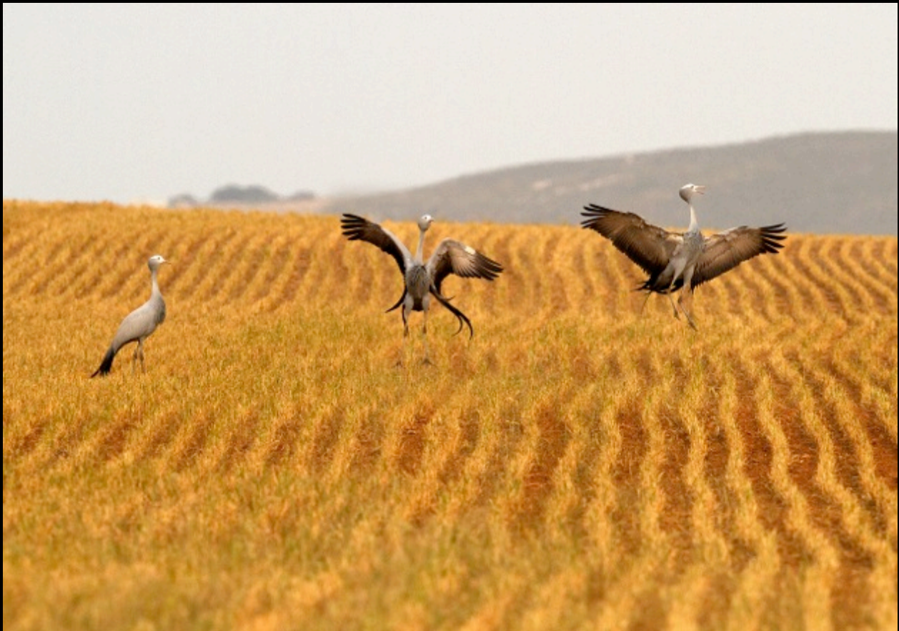
Blue Cranes dancing in the Overberg; one of the top targets for Michael Jeffords, who took this photo!