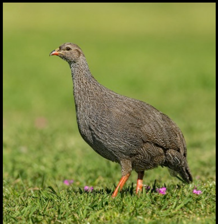
A couple of "Capers": Cape Canary (left) and Cape Francolin (right).