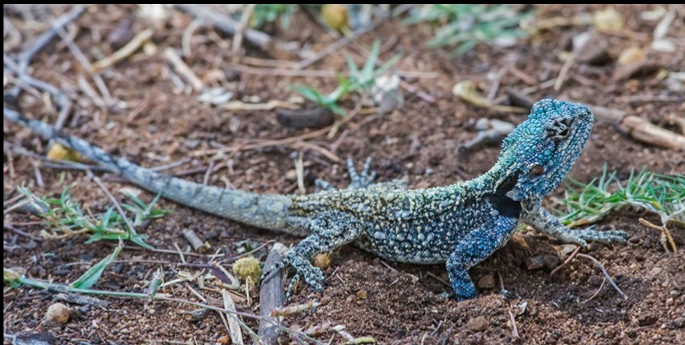
A handsome Southern tree agama in Kruger. Ken Behrens.