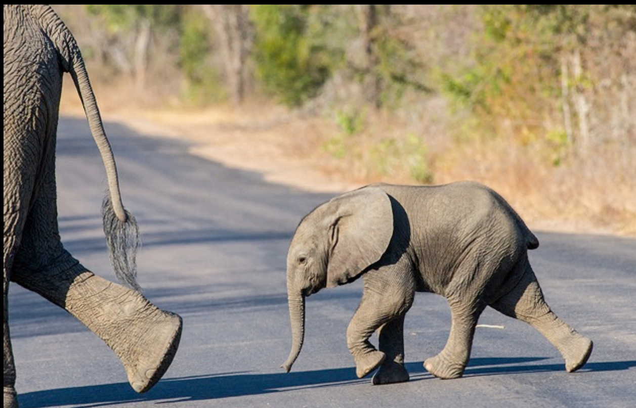
A baby African elephant stays close to its mother in Kruger NP.