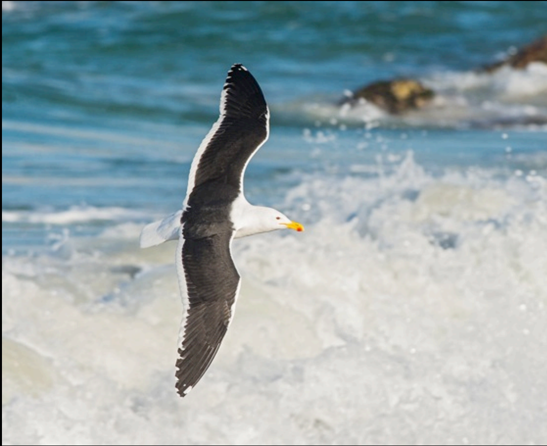
Kelp Gull against the cold South Atlantic surf.