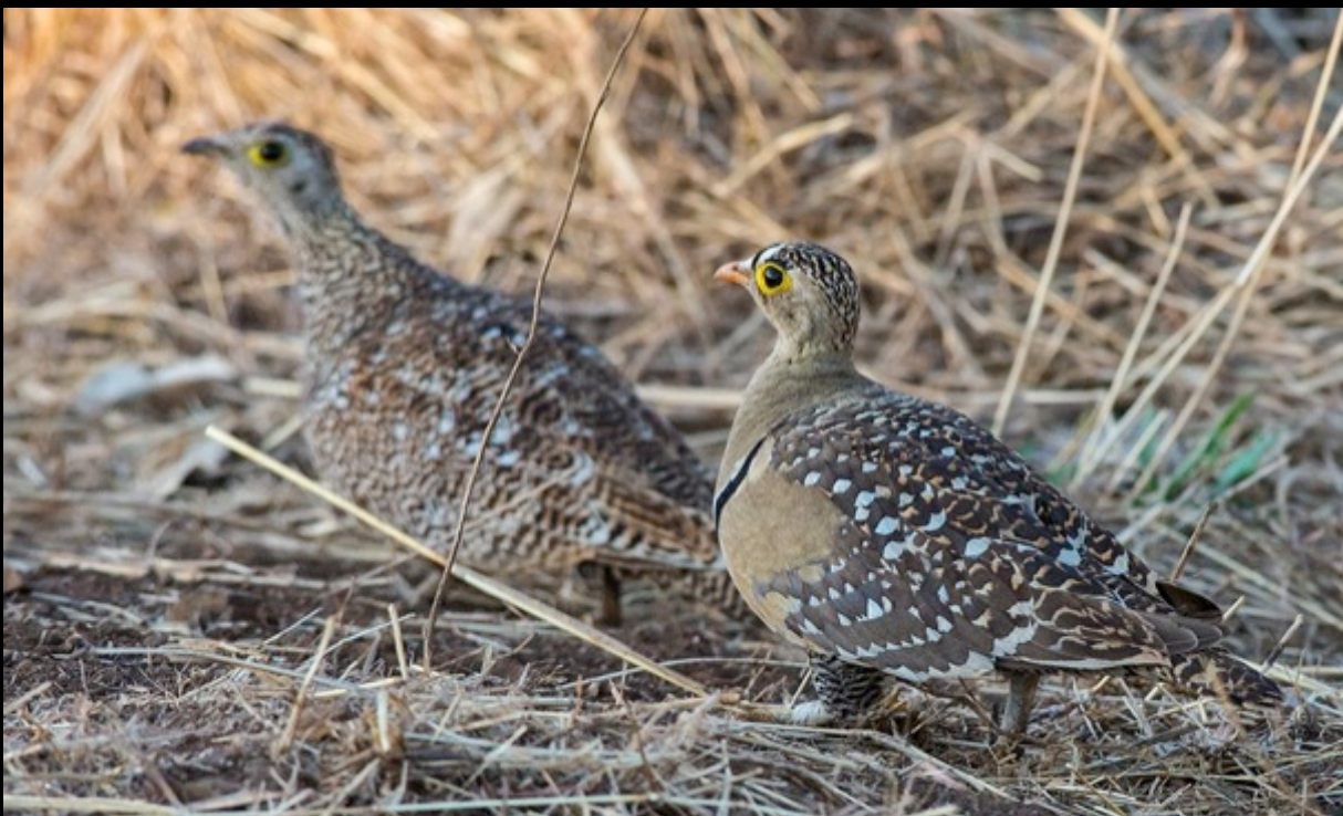
Double Double-banded Sandgrouse! Ken Behrens.