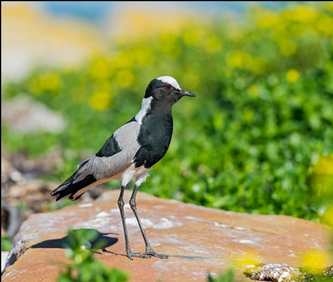
We found some nesting Blacksmith Plovers at Kommetjie. Ken Behrens.