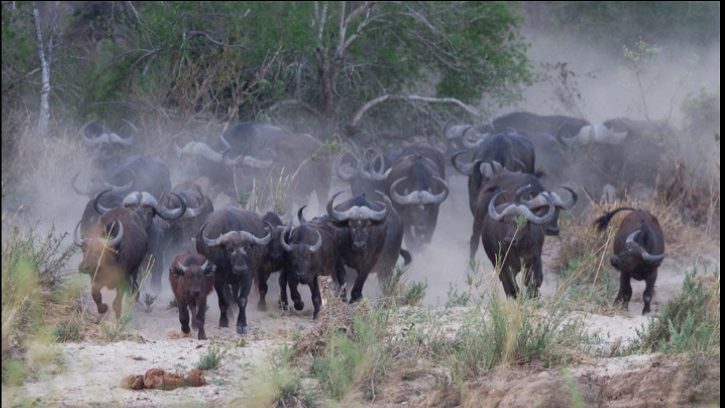
Buffalo and clouds of dust, a classic African scene. Sue Post.