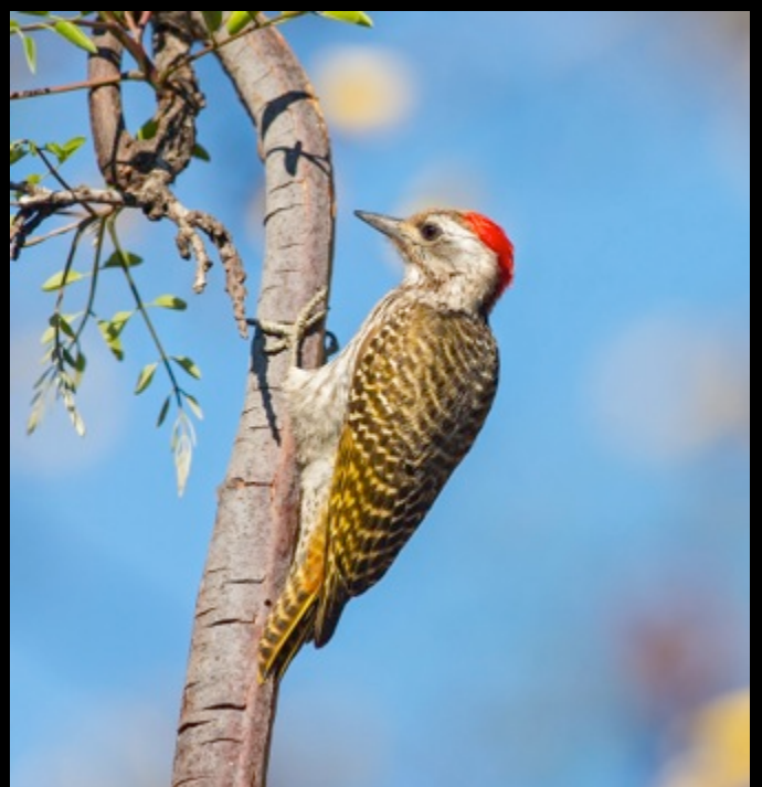
Brown-hooded Kingfisher (left) and Cardinal Woodpecker, a couple of Kruger's over 400 species of birds.