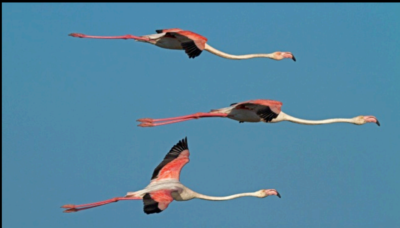
A trio of Greater Flamingoes from our first day, in the surprisingly magnificent Strandfontein Sewage Works!