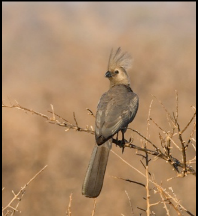
A couple of Bateleurs (left) and a Gray Go-away-bird (right).