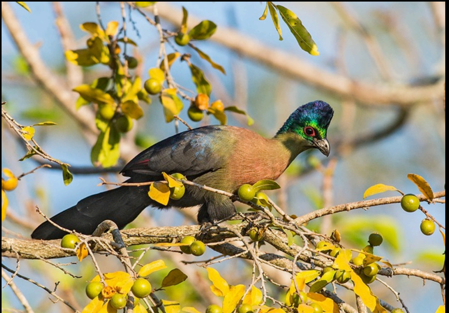
Purple-crested Turaco in Kruger's Skukuza Camp. Ken Behrens.