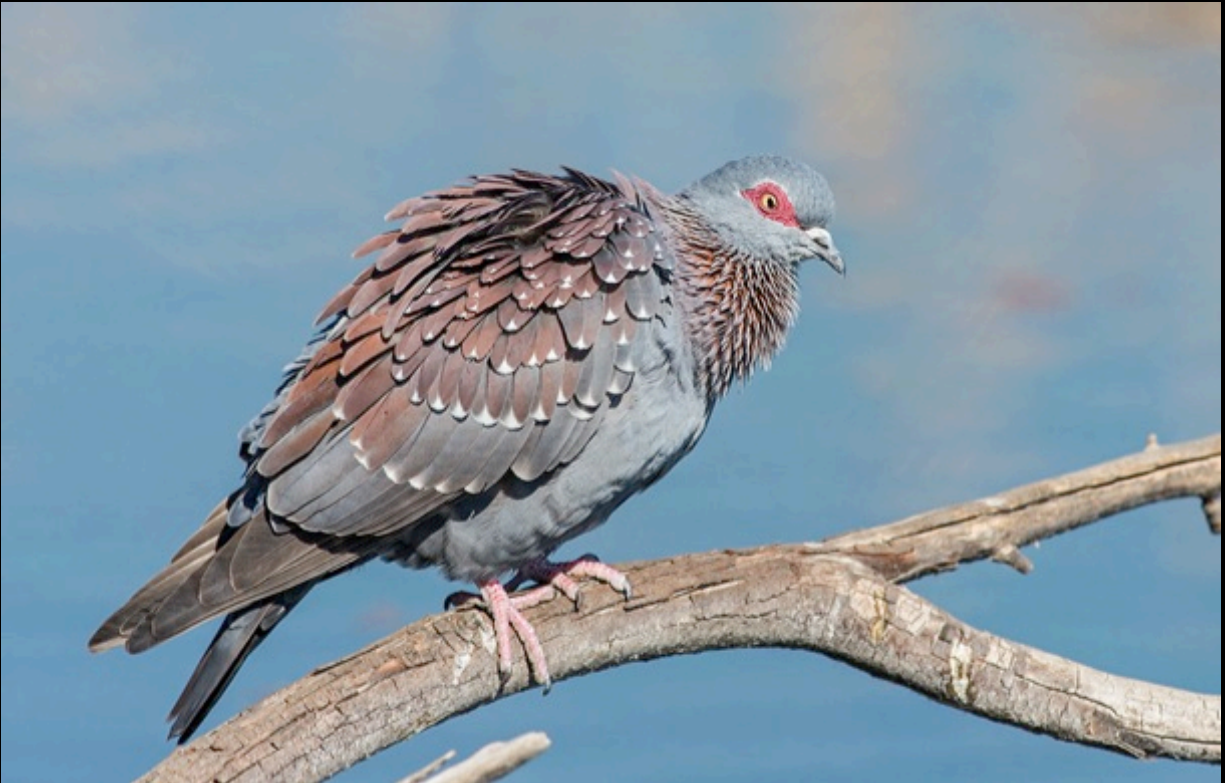
Speckled Pigeon may look like a city pigeon at a distance, but is actually quite handsome. Ken Behrens.