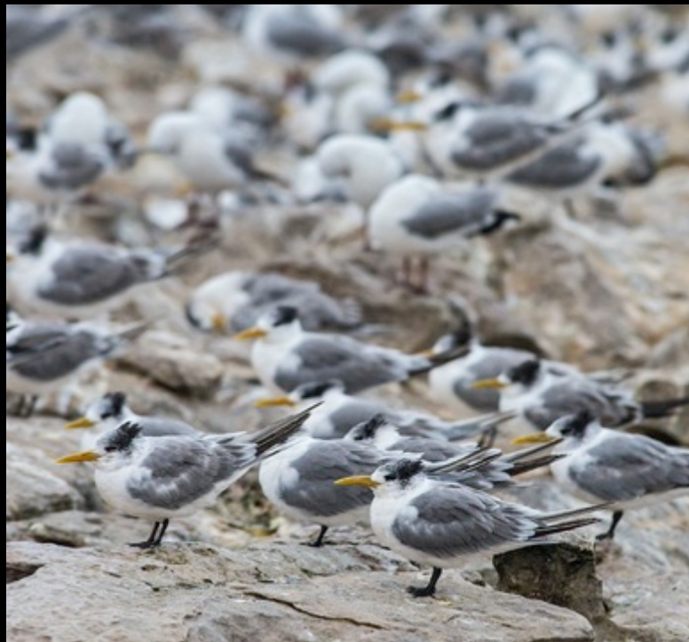
Endemic Cape Grassbird (left) and a flock of Greater Crested Terns (right).