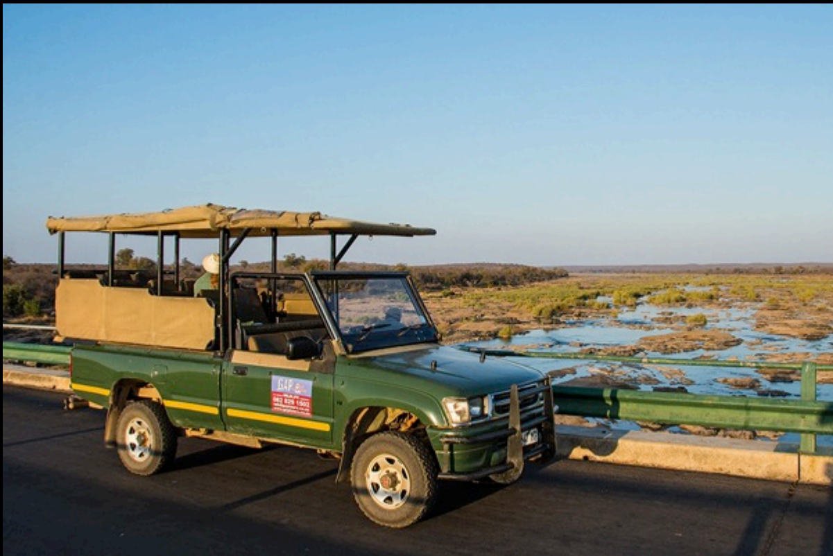
In Kruger, we had the perfect vehicle, which allowed us close and unobstructed views of the mammals. Ken Behrens.