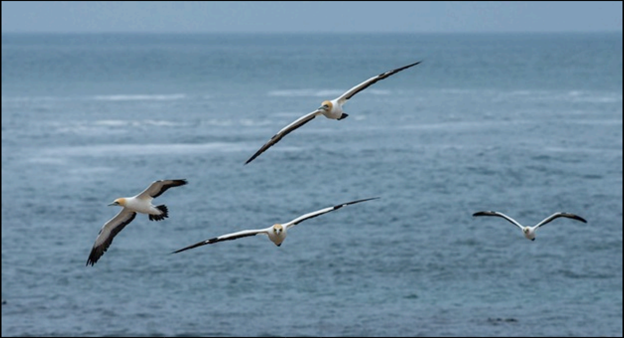
The Lambert's Bay colony of Cape Gannets: a feast for the eyes and ears, and a photographer's dream.