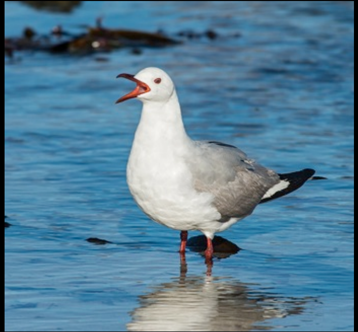
The colors and characters of Cape Town: Helmeted Guineafowl (left) and Hartlaub's Gull (right).