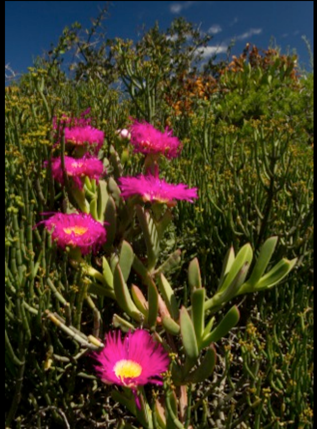
Wahlberg's Eagle over Satara Camp, Kruger NP (left). West Coast NP in bloom (right).