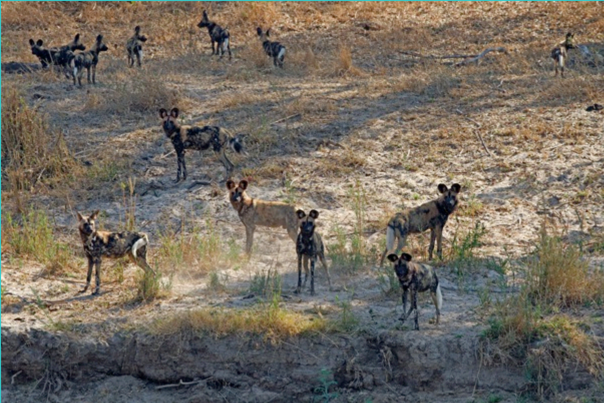
Wild dog was one of the extension highlights. Sue Post.

the bush, watching as she rested and groomed. We were close enough to notice she had an engorged tick on her otherwise immaculate coat and to hear the rasping of her tongue against her fur!