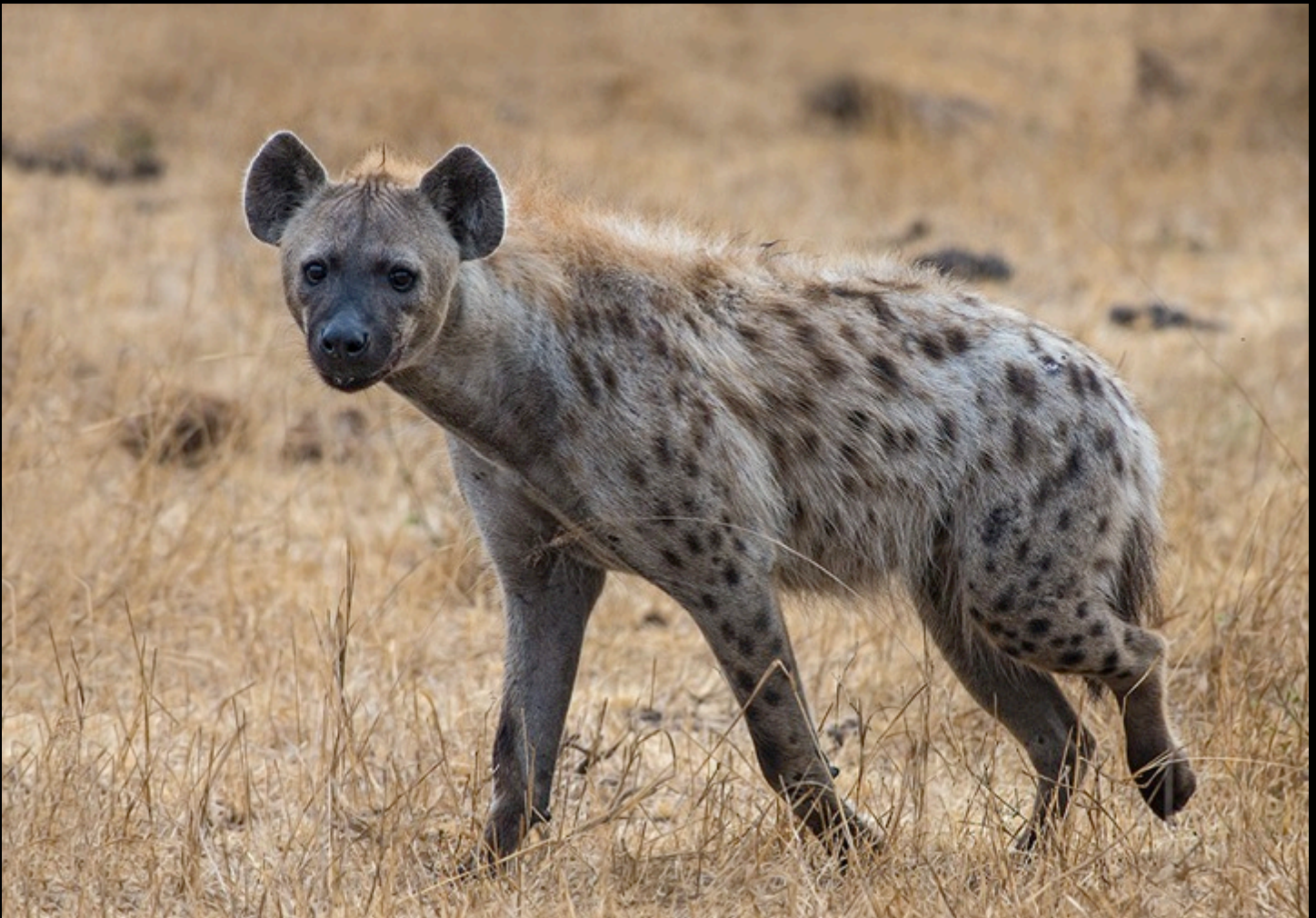
Spotted hyenas are great characters which are always fun to photograph. Ken Behrens.