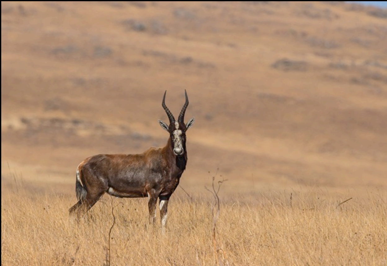
Bontebok in the Highveld grassland near Dullstroom.