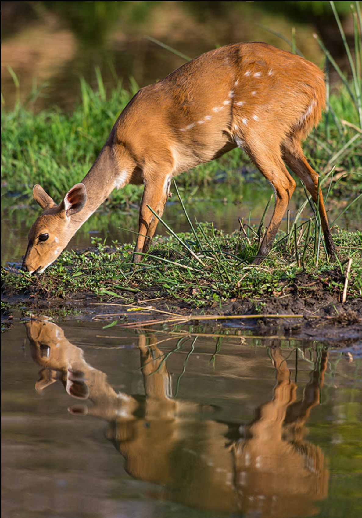
A female bushbuck, photographed from a fine hide in Kruger NP. Ken Behrens.