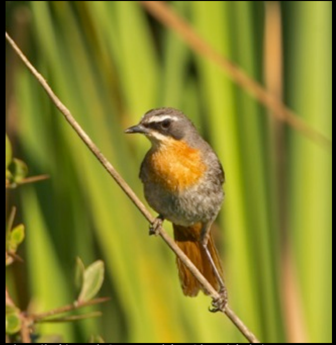
A couple of Old World flycatchers: Pale Flycatcher (left) and Cape Robin-Chat (right).