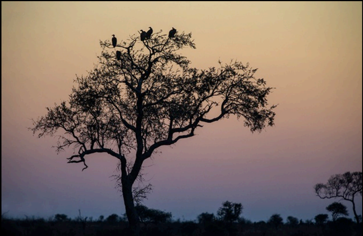
Some lanky White-backed Vultures against the sunset in Kruger. Ken Behrens.