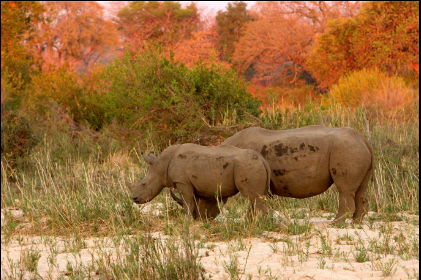
White rhinos in Sabi Sands.