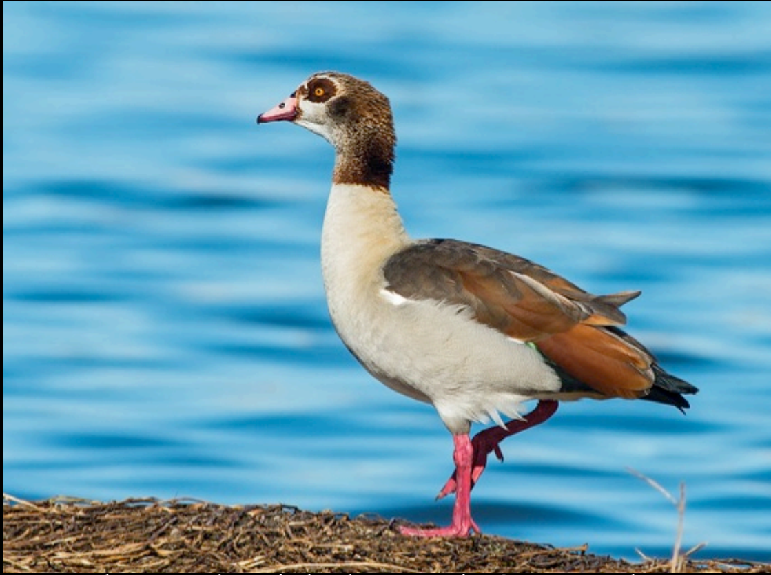
The common but quite handsome Egyptian Goose. Ken Behrens.