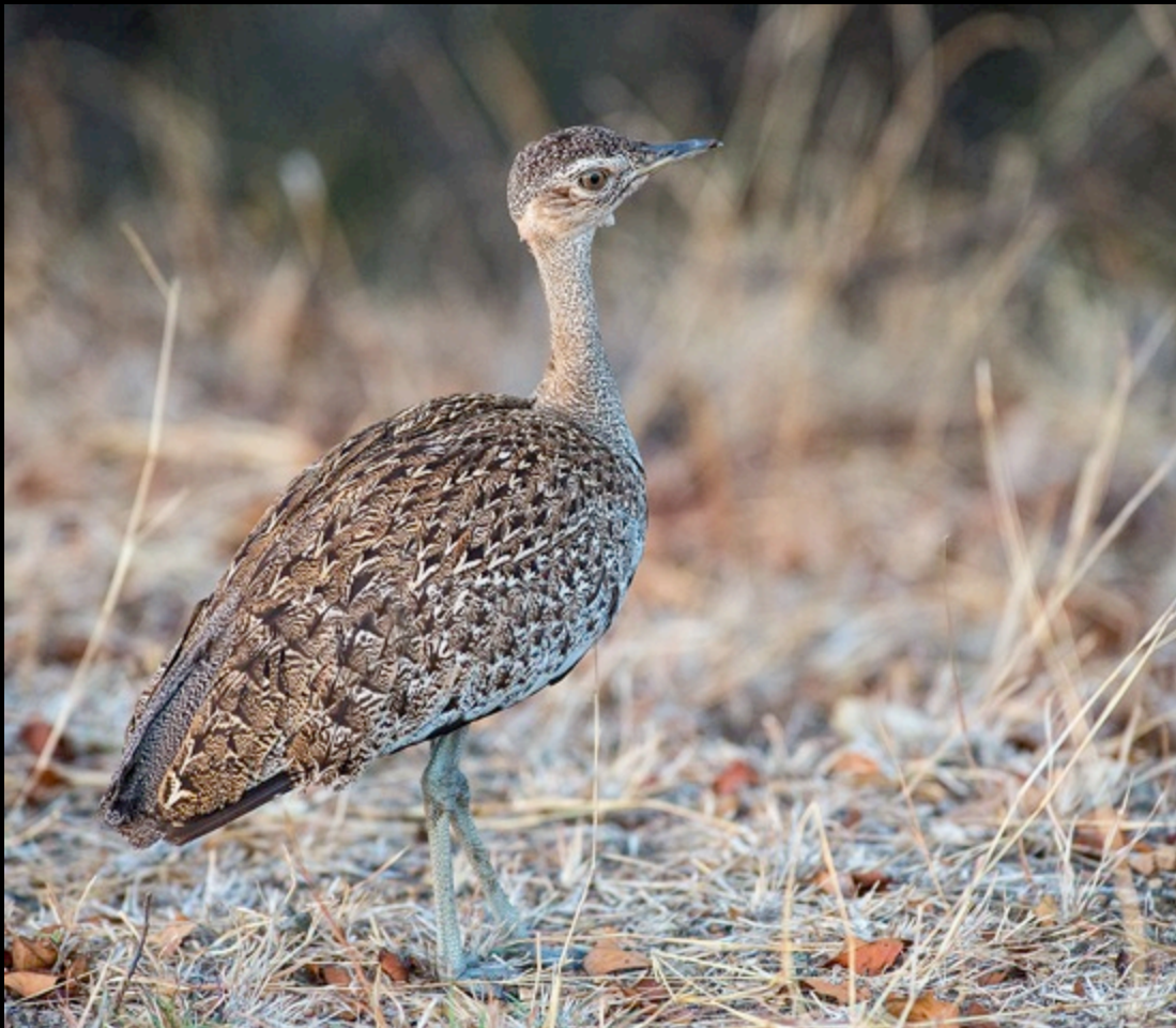
Red-crested Korhaans often walk very slowly, as if remaining invisible that way! Ken Behrens.