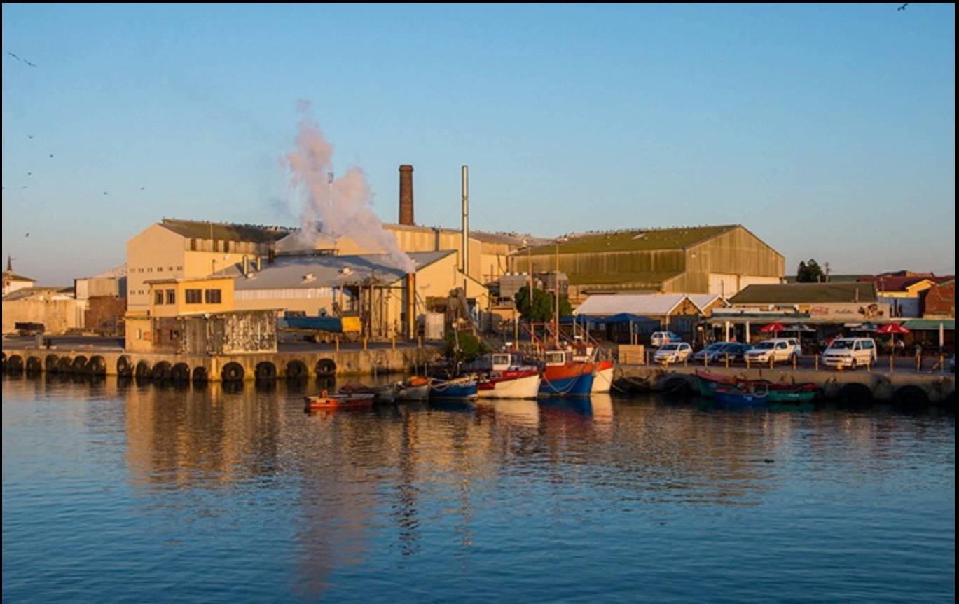
The fishing village of Lambert's Bay, which plays host to a gannet colony.