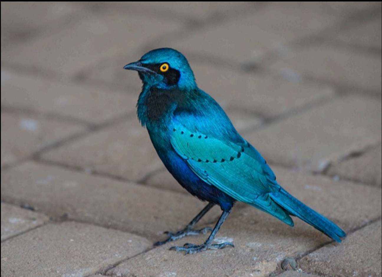
Kruger's picnic areas have ridiculously tame birds like this Greater Blue-eared Glossy Starling. Ken Behrens.