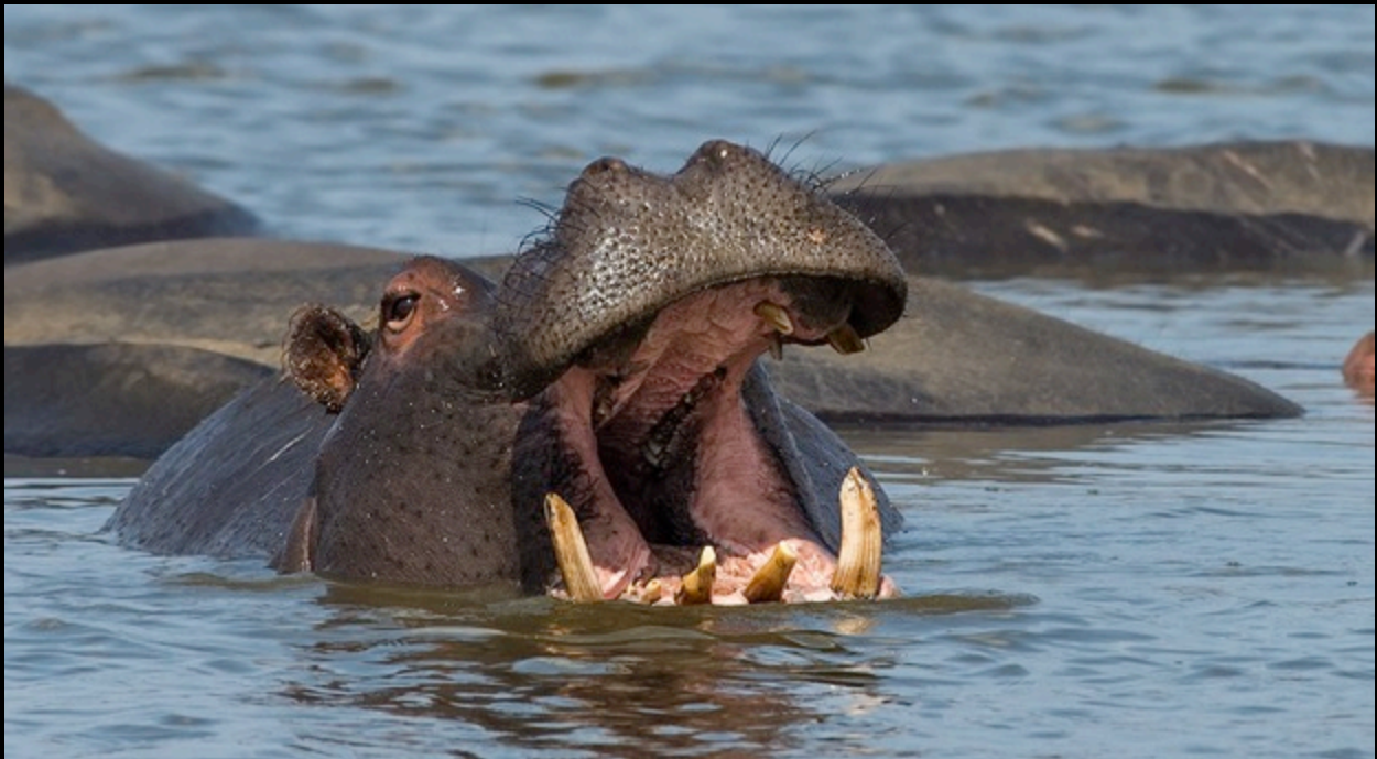
Hippos are abundant in Kruger NP.