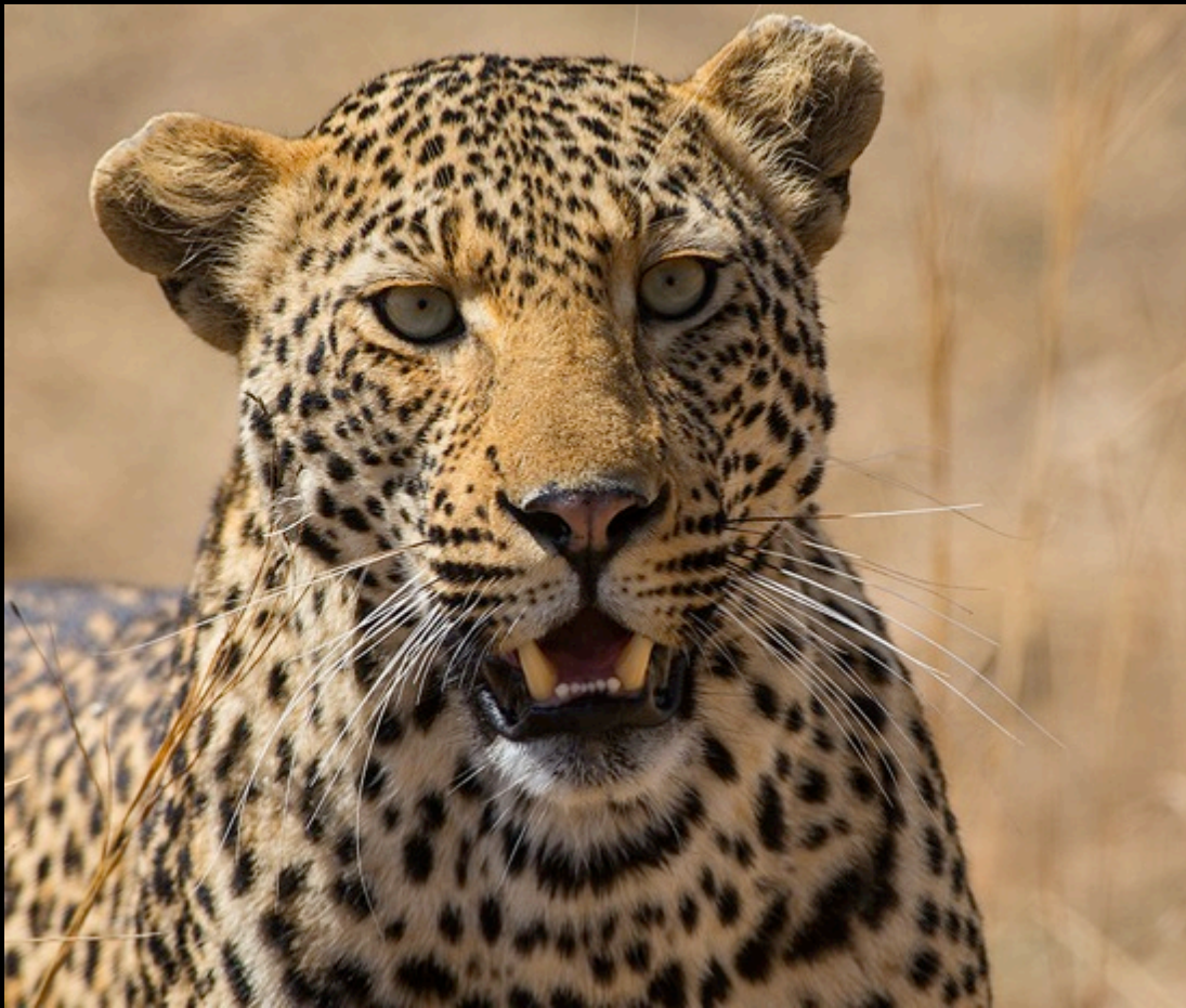
One of the leopards that graced our time in Kruger.