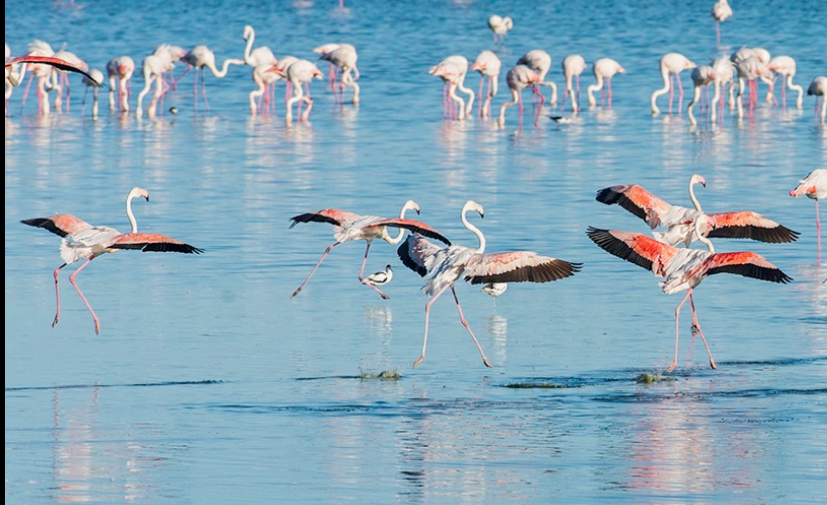
Greater Flamingoes at Strandfontein. Ken Behrens.