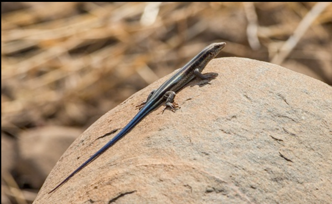
Rainbow or five-lined skink in Kruger NP.