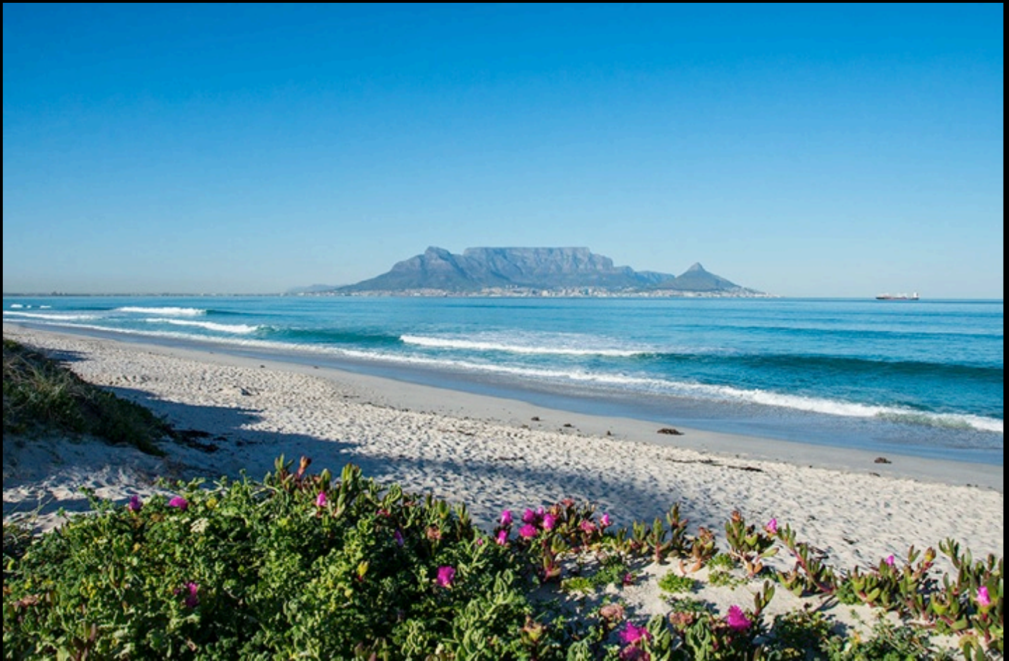
We made an early morning stop north of Cape Town for some Table Bay landscape photography. Ken Behrens.