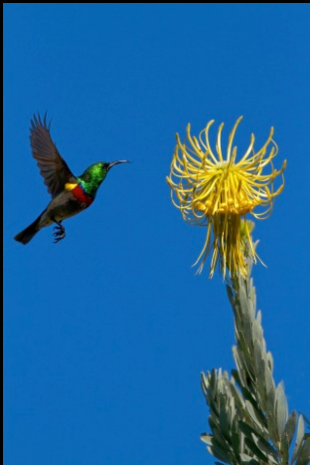
A unique bar in the middle of nowhere in the Karoo (left). Southern Double-collared Sunbird (right).