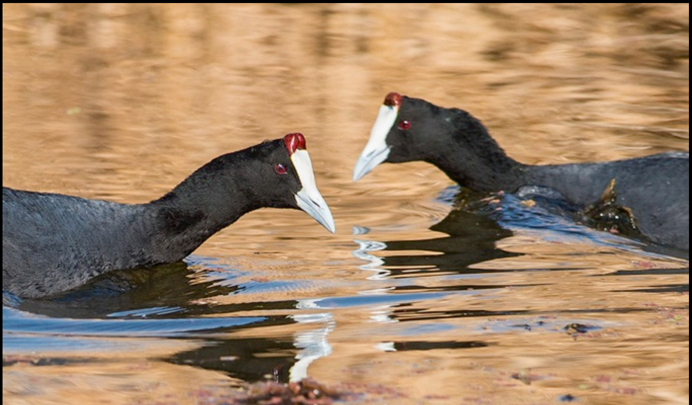
Mirrored Red-knobbed Coots.