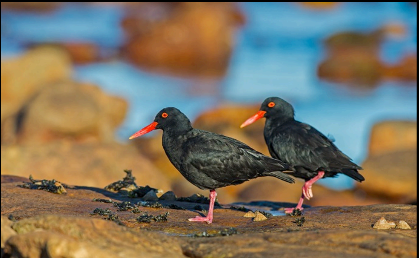
African Black Oystercatchers at Kommetjie, on the Cape Peninsula. Ken Behrens.