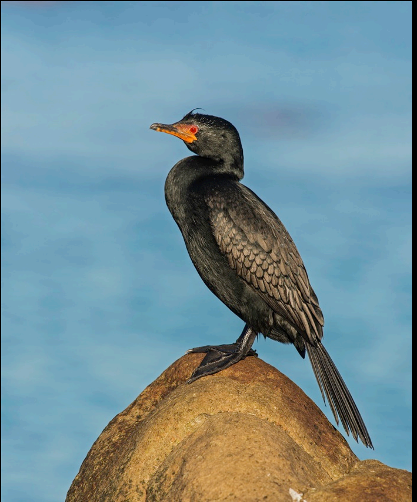
The southern African endemic Crowned Cormorant. Ken Behrens.