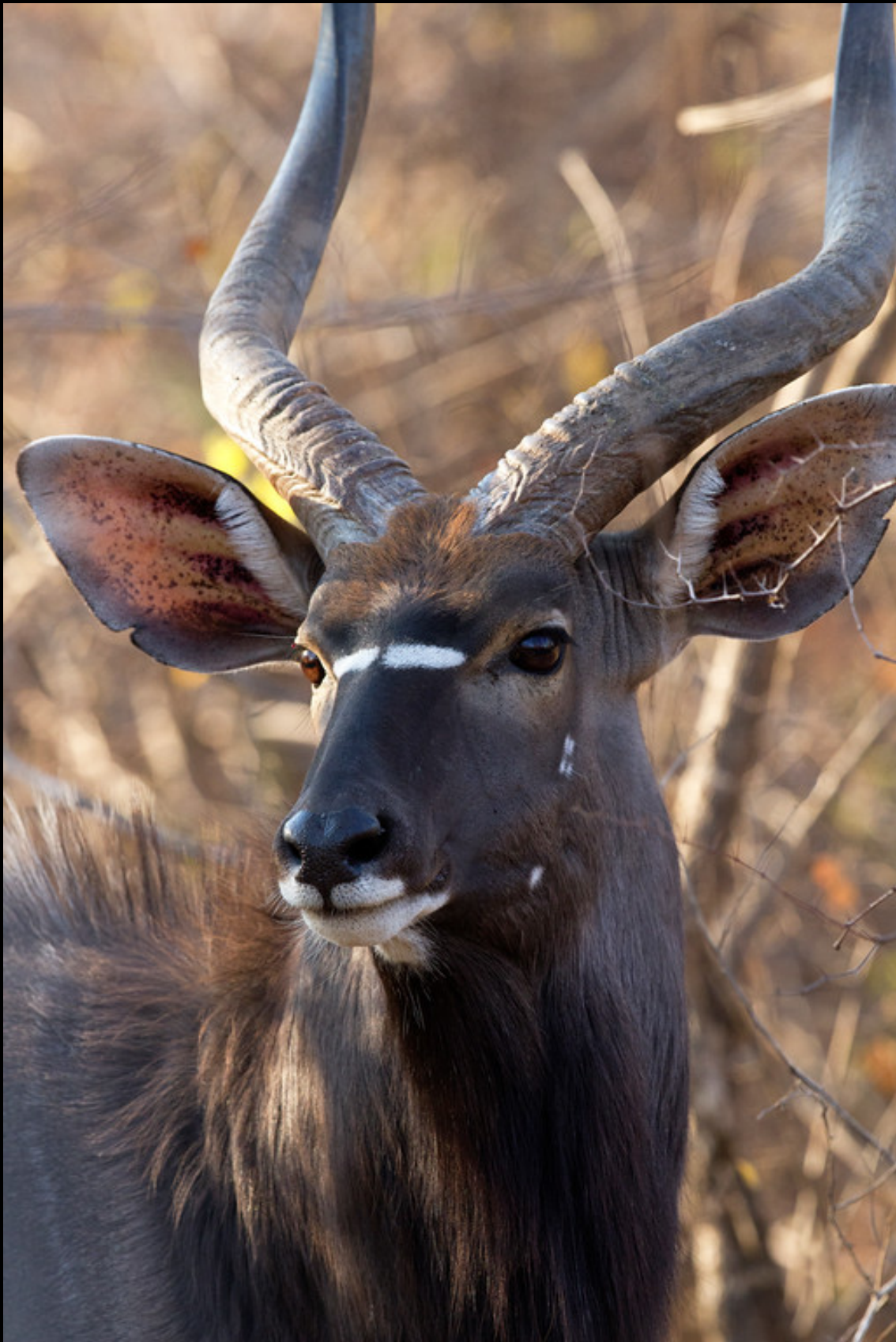
Beautiful male nyala in Sabi Sands. Sue Post.