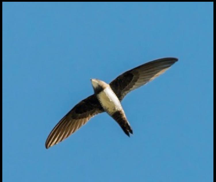
Swift photography is always a challenge. Here a White-rumped (left) and an Alpine (right).