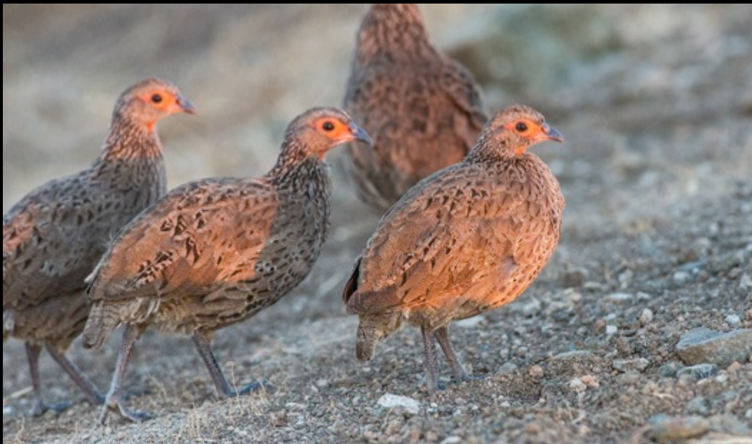
A family of Swainson's Francolins in the last of the late afternoon light.