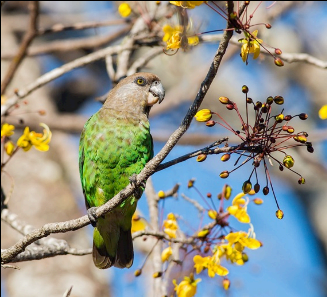
Kruger's sjambokpod trees were in bloom, and attracted Brown-headed Parrots. Ken Behrens.