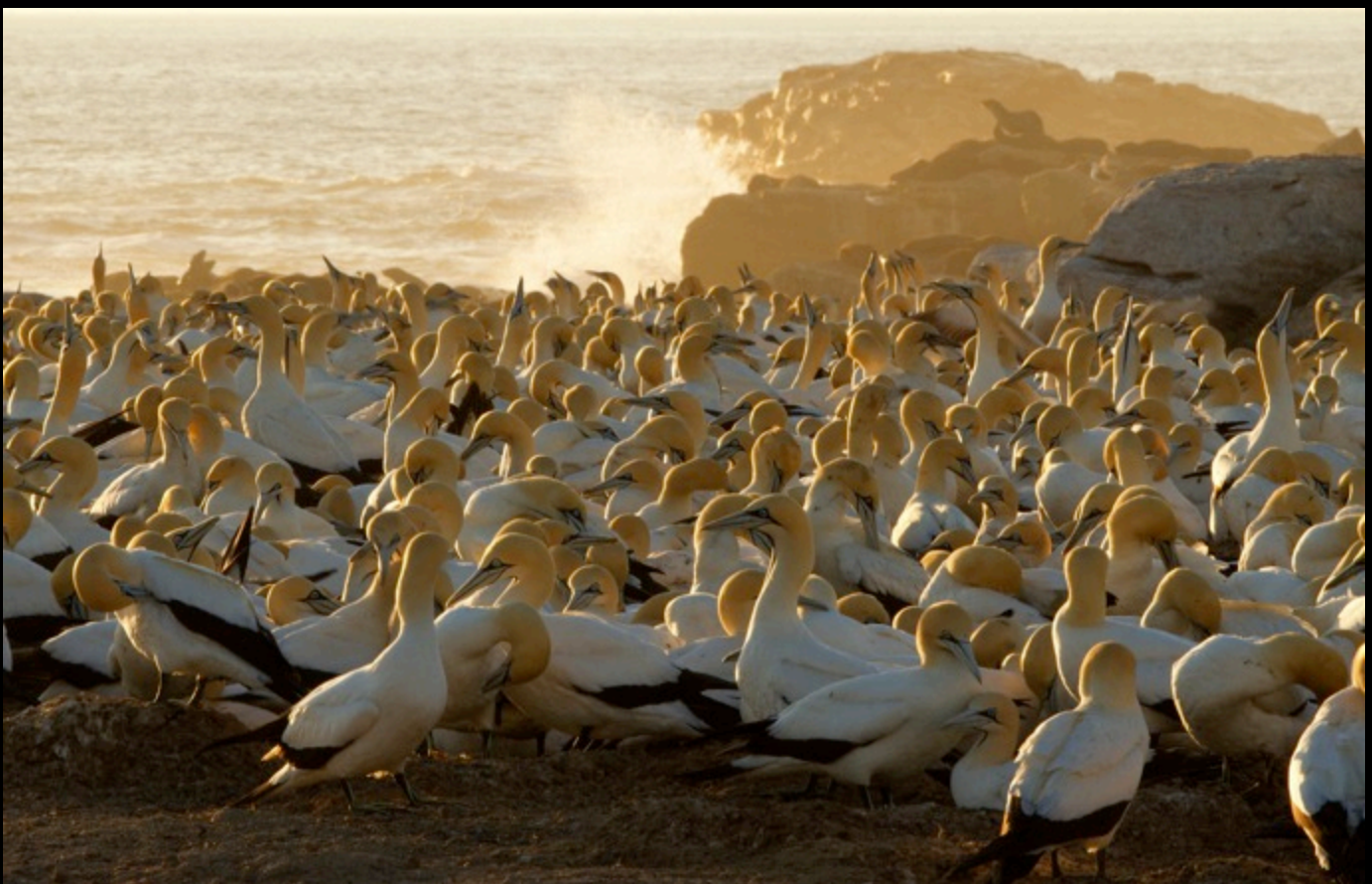
A Cape Gannet colony, one of the trip highlights, and a world away from normal "safari fare"!

experiences on top of Kruger's world-class wildlife photography. Around Cape Town, the climate is Mediterranean, and the major biome is the fynbos, one of the World's most diverse in terms of plants, and also supporting many endemic birds and mammals. Cape Town is scenically stunning, with the famous Table Mountain as its backdrop, and magnificent seascapes on all sides. Inland from the Cape lies the Karoo. Despite its proximity to the moist fynbos, this is a completely different world of dry scrubland and hauntingly beautiful landscapes that are reminiscent of the American Southwest. In the eastern part of the country, this tour takes in the Highveld, beautiful high-elevation grasslands with an attending suite of endemics. And of course, there is Kruger National Park... South Africa as seen by National Geographic.