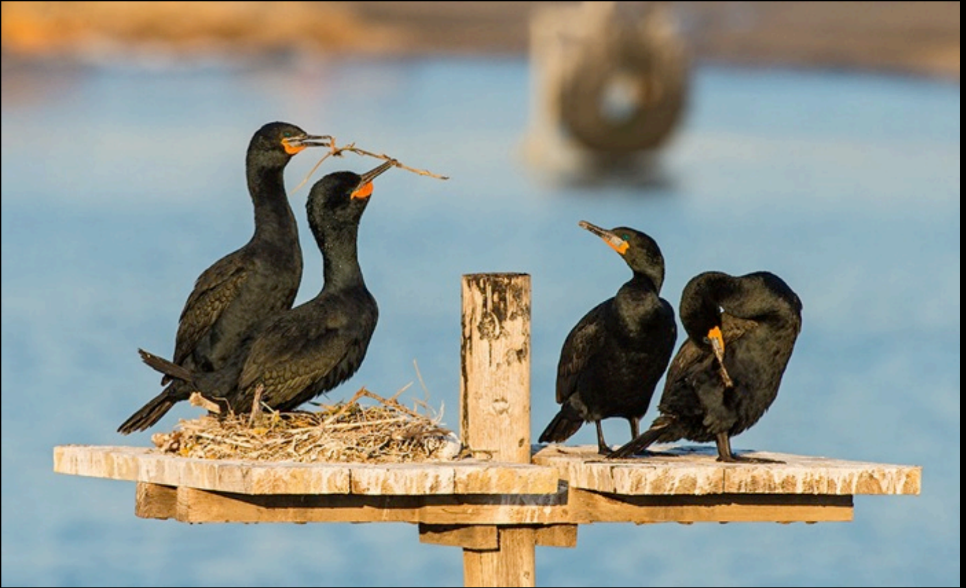
Cape Cormorants nesting at Lambert's Bay. Ken Behrens.