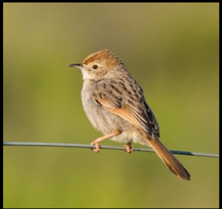
Greater kudu (left) from Kruger, and Gray-backed Cisticola (right) from the Karoo.