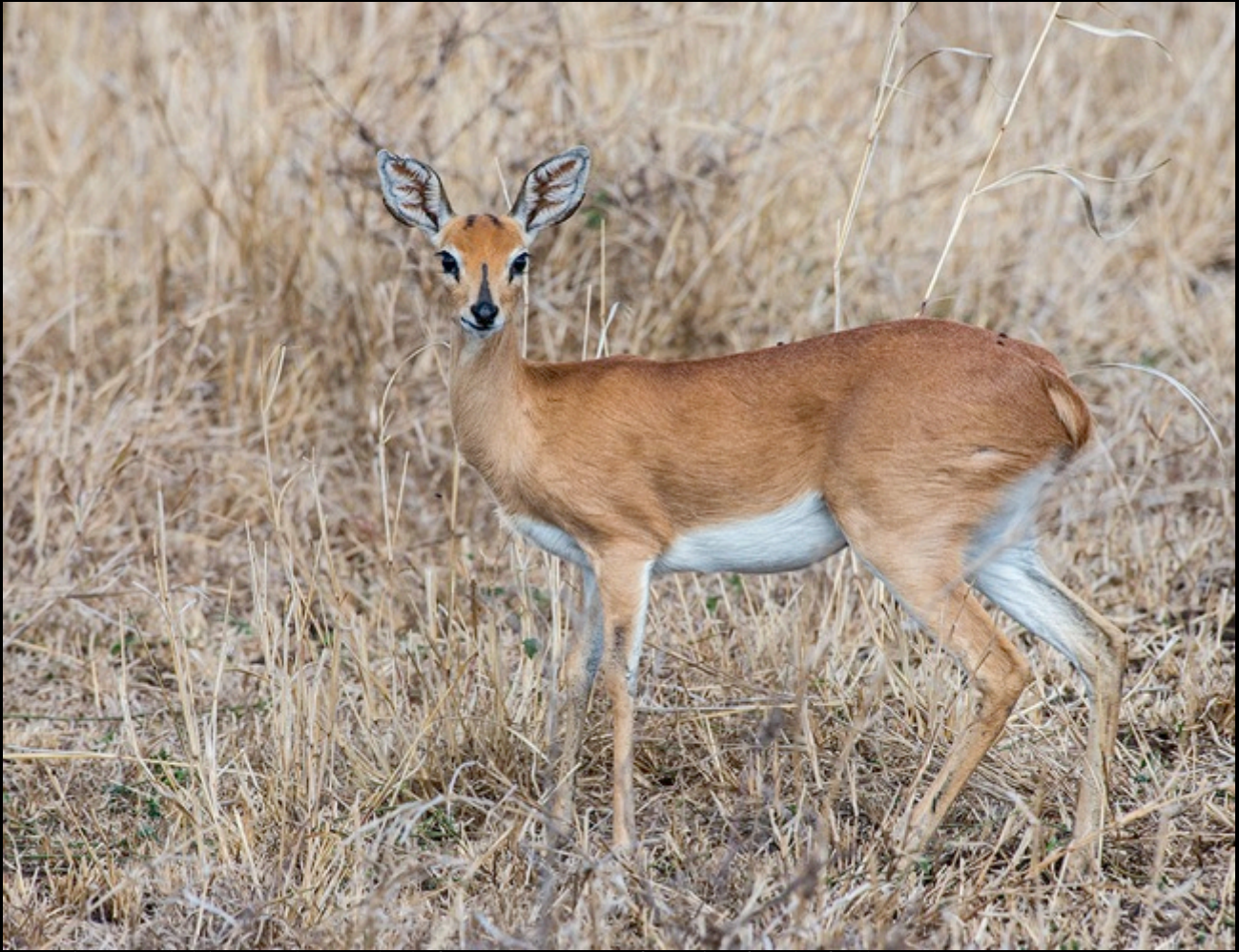
Big-eared, big-eyed steenbok from Kruger. A favorite food of all predators! Ken Behrens.