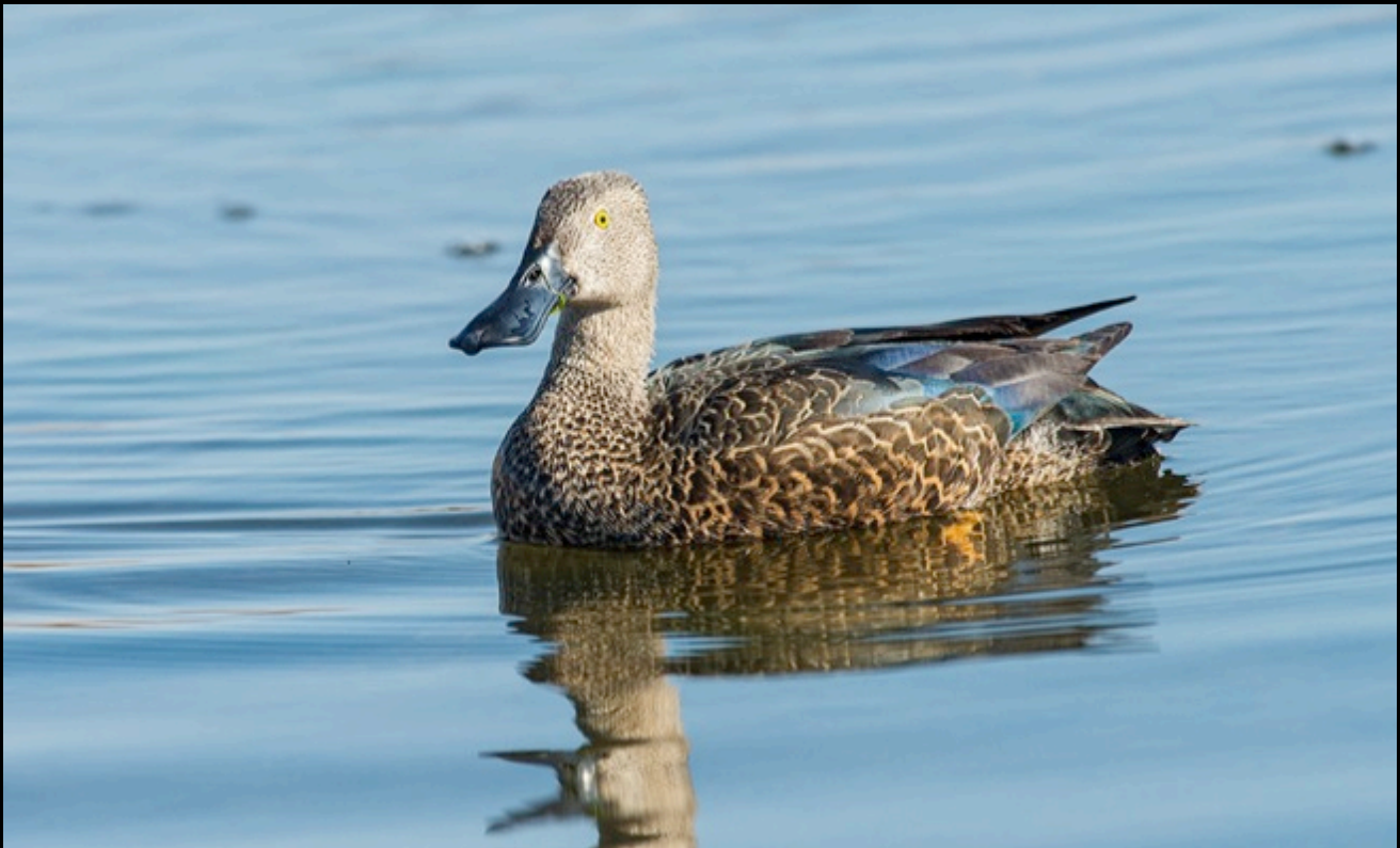
Marievale Bird Sanctuary is duck photography paradise. Here a Cape Shoveler. Ken Behrens.