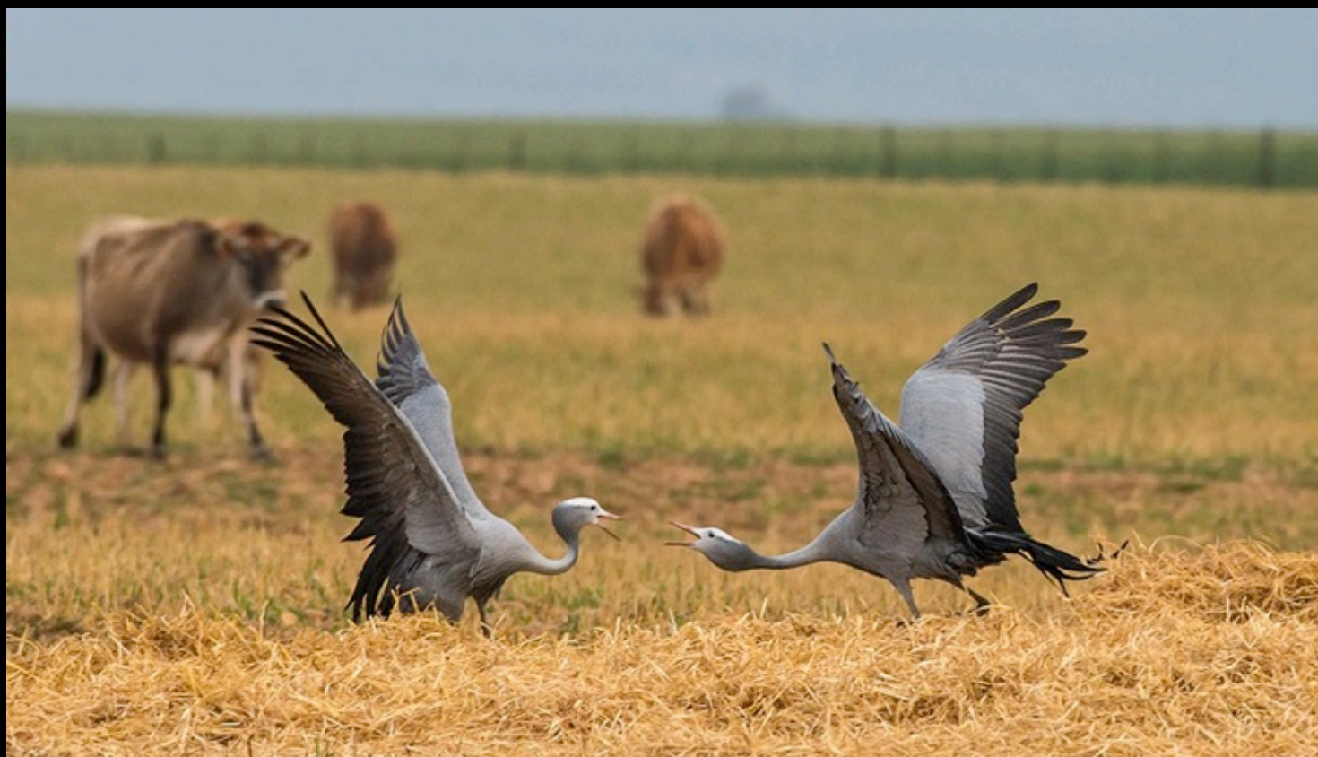
A pair of courting Blue Cranes in the springtime Overberg. Ken Behrens.