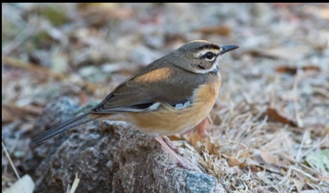
Bearded Scrub-Robin in Skukuza Camp, Kruger NP. Ken Behrens.