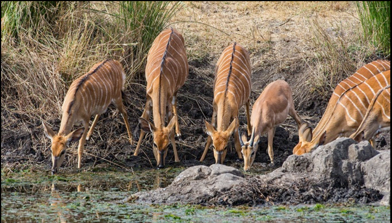
Nyala is a rather uncommon resident of Kruger NP, so we were happy to have a chance to photograph a small group of females and young males. Ken Behrens.