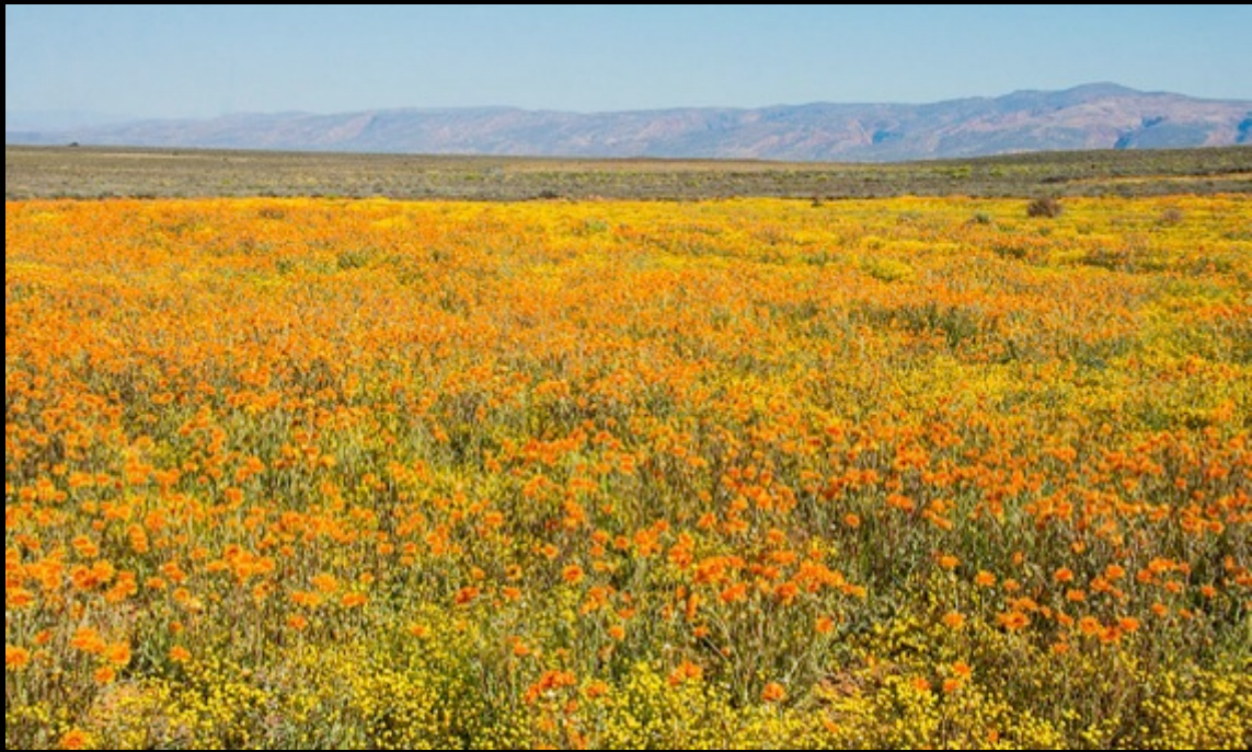
Incredible wildflower spectacle in the Tanqua Karoo. Ken Behrens.