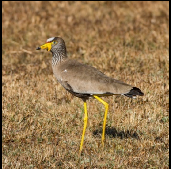
Southern Fiscal (left) in the Overberg and African Wattled Lapwing (right) near Dullstroom. We seek out subjects like these opportunistically, often using the car as a blind to photograph them. Ken Behrens.