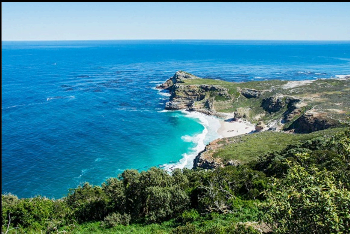
The scenic beauty of the Cape Peninsula. Ken Behrens.