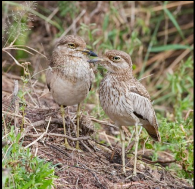
Martial Eagle (left) and Water Thick-knees in Kruger NP.