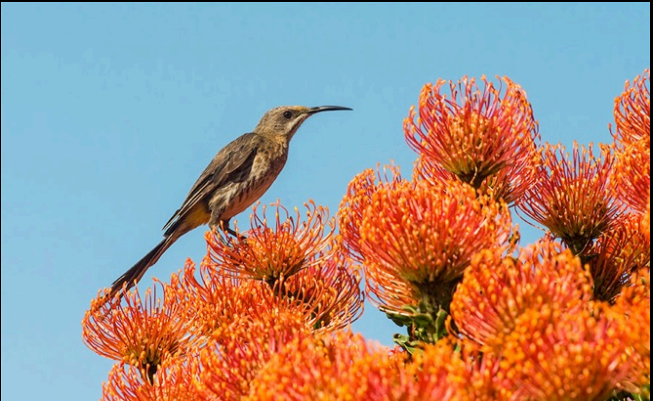
There are flowers everywhere around Cape Town during the austral spring, making for wonderful photo backdrops.