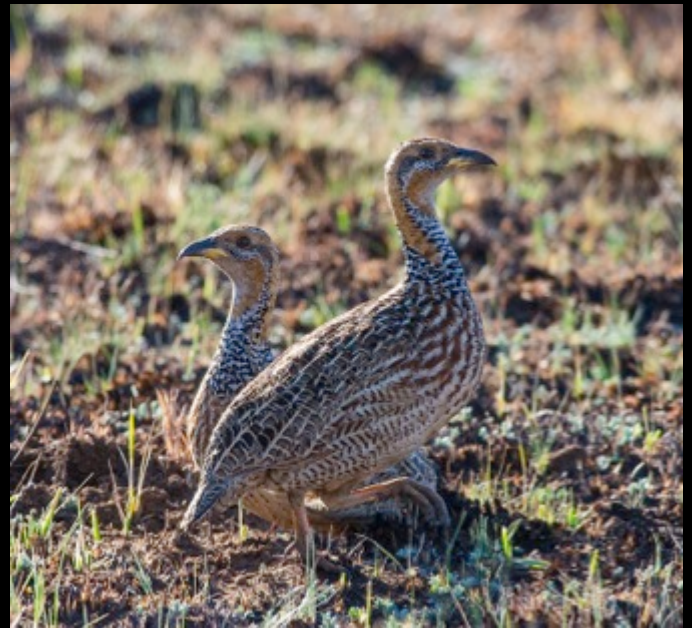
Shelley's Francolin (left) is quite a scarce bird in Kruger NP. The similar Red-winged Francolin (right) is a bird of the high-elevation grasslands around Dullstroom.