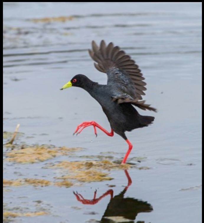
A fynbos blue (left) from Bonebok NP. A Black Crake (right) dancing across the algae in Kruger.