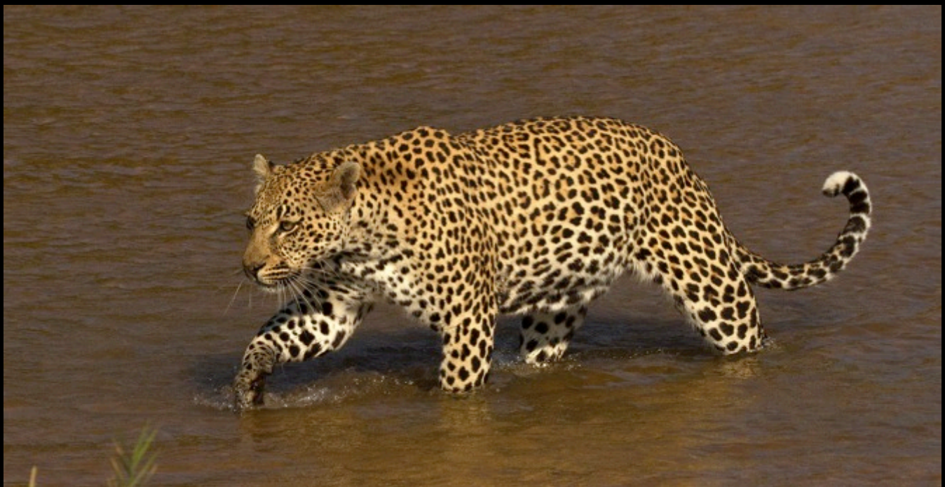
Leopard crossing the Sabi River.