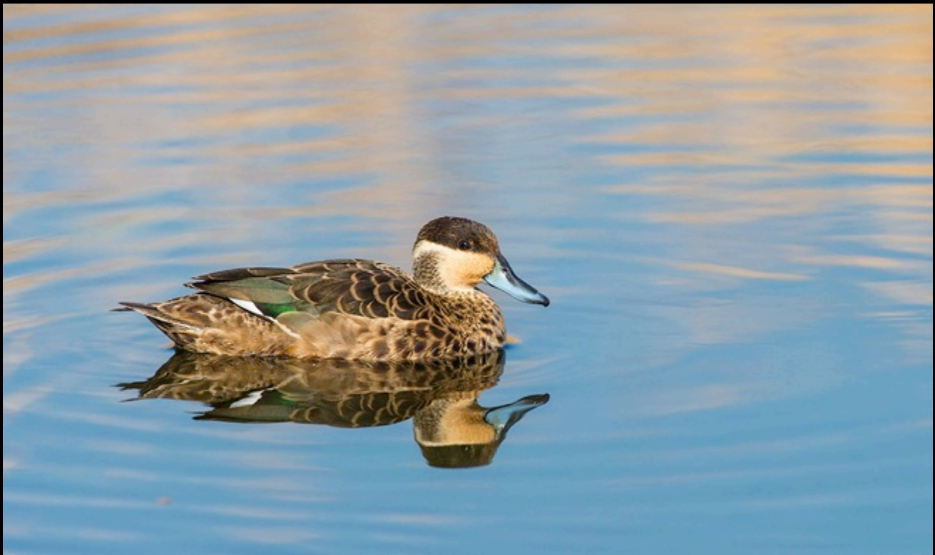
Hottentot Teal at an excellent nature reserve near Johannesburg.