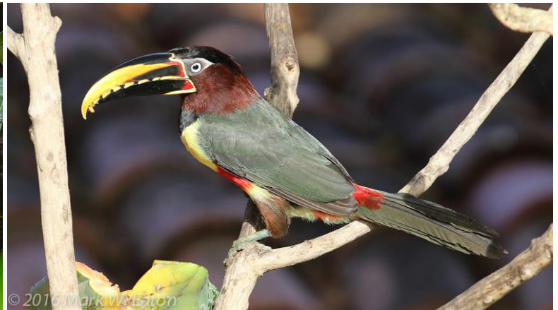
Sungrebe on the Pixaim River Chestnut-eared Aracari at the feeder