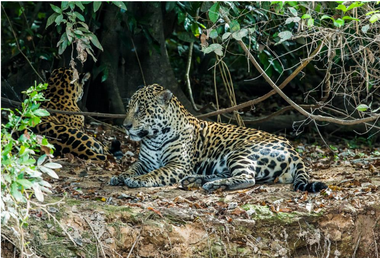
The male and female Jaguars we saw on the first afternoon at Porto Jofre