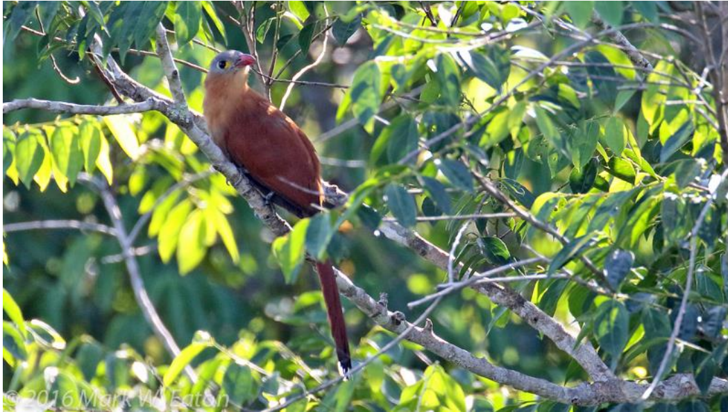
Black-bellied Cuckoo from one of the towers at Cristalino