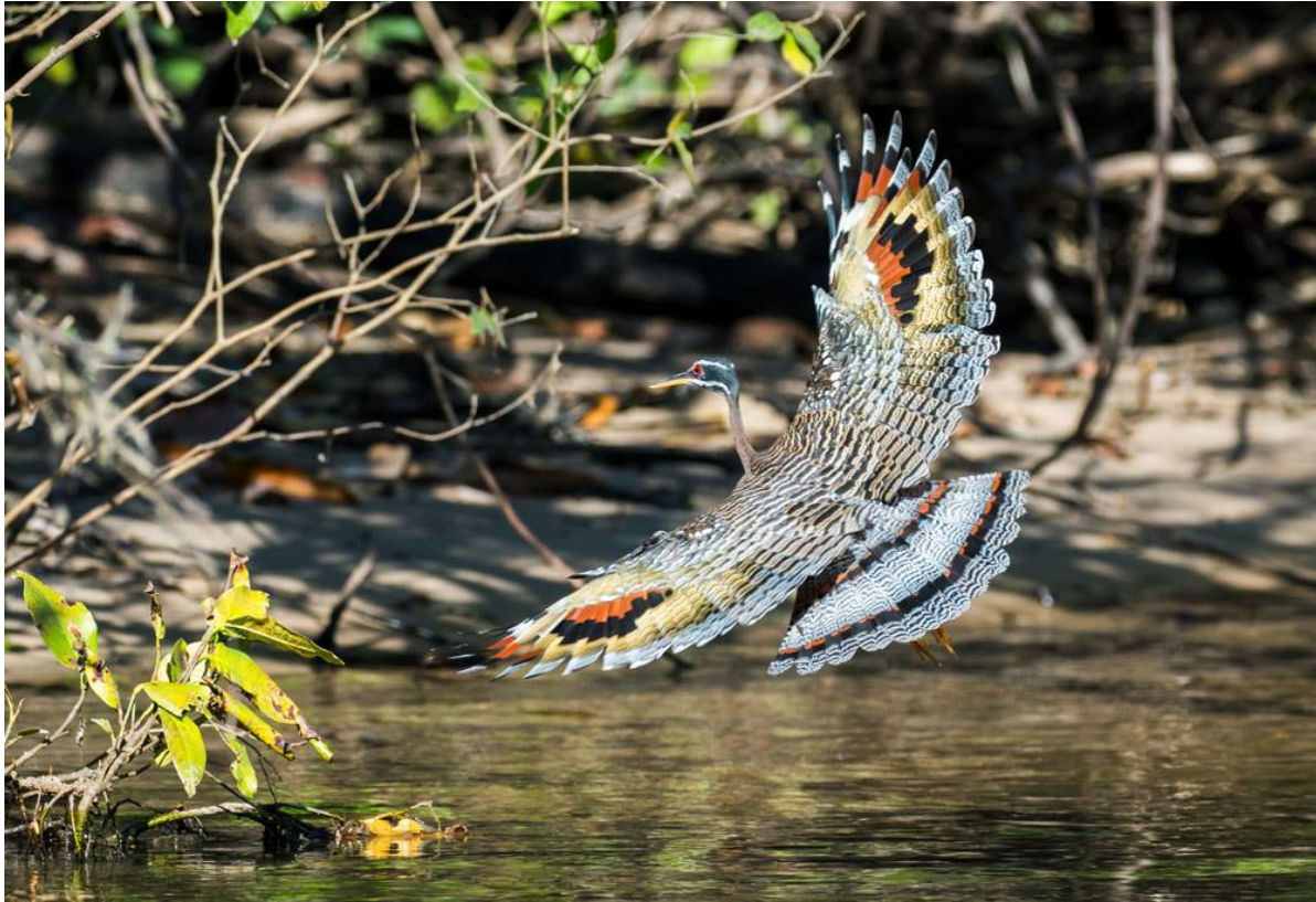
A sunbittern flying away from us as we cruised the river