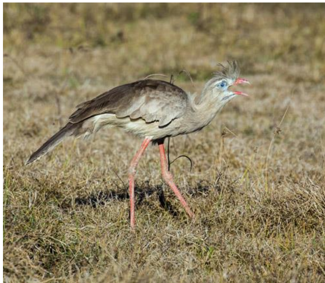
Great Rufous Woodcreeper and Red-legged Seriema, both from Pousada Piuval