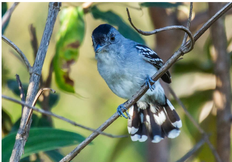
Planalto Slaty-Antshrike