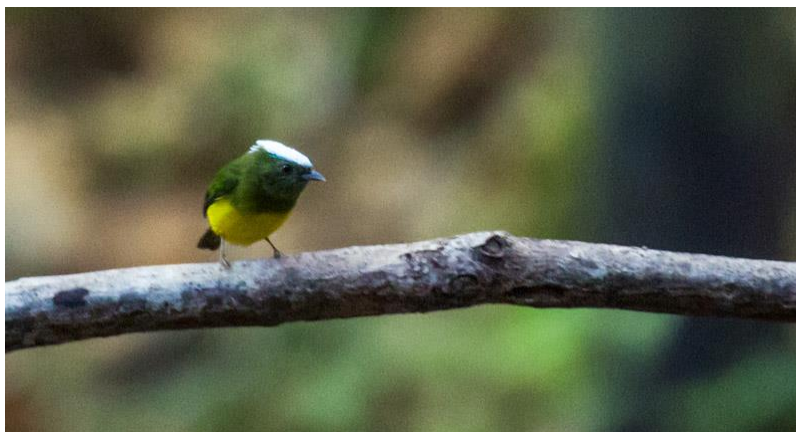
Snow-capped Manakin above the bird bath