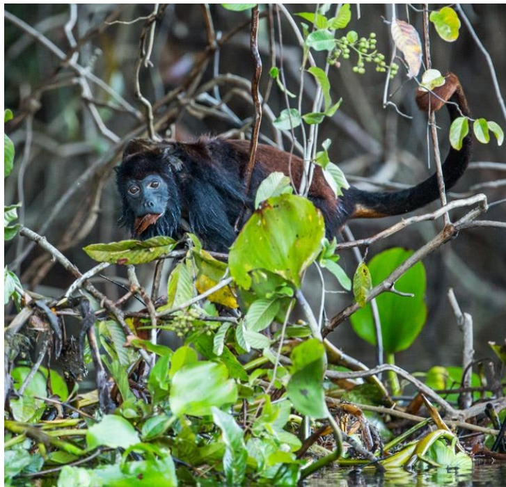
Red-handed Howler with baby at Cristalino

Green Iguana Iguana iguana – A couple along rivers in the Pantanal.