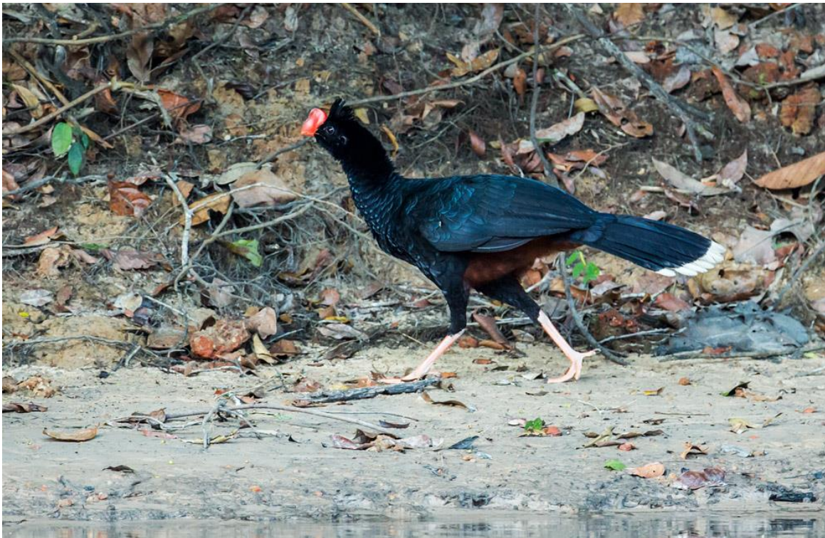
Razor-billed Curassow along the Cristalino River