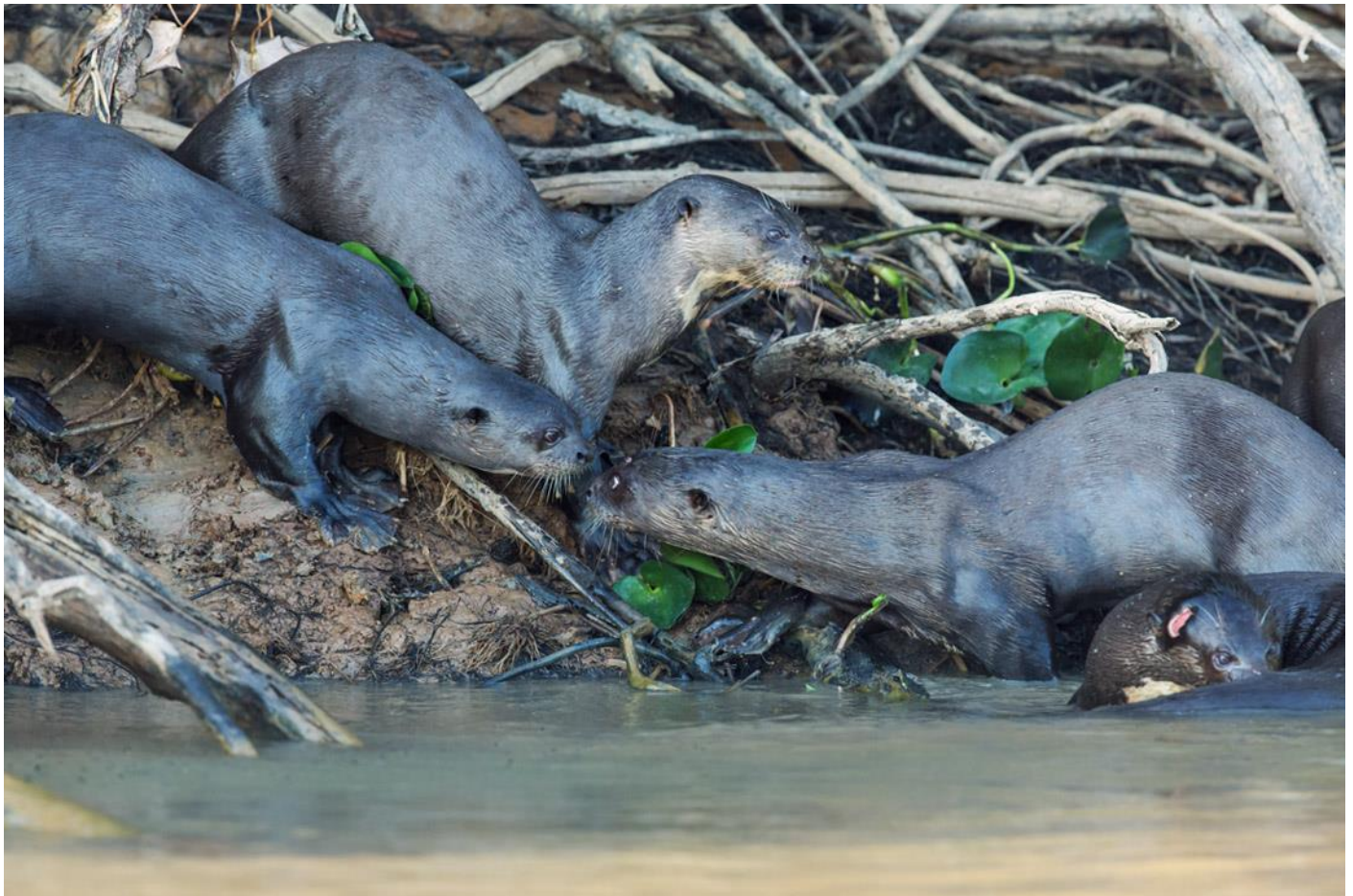
A "romp" of Giant Otters frolicking along the banks of the Cuiabá river