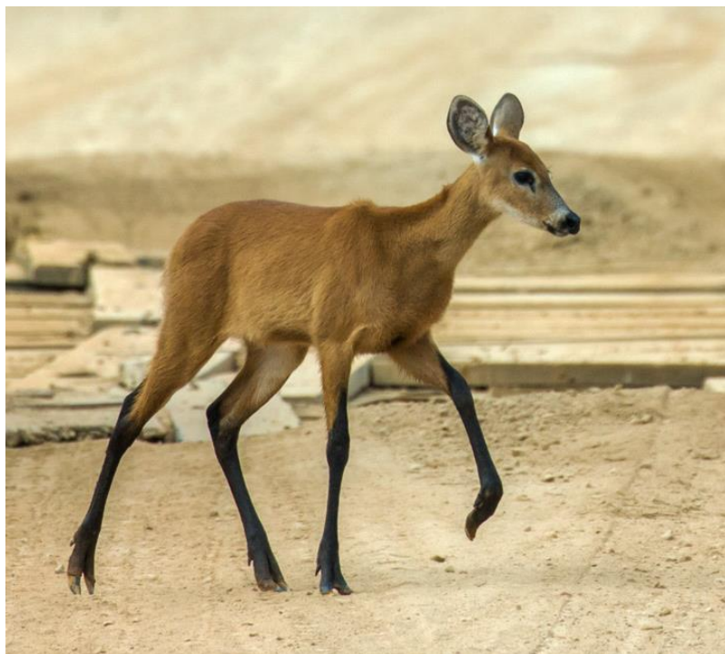
Scarlet-headed Blackbird and Marsh Deer, which we saw along the drive south to Porto Jofre