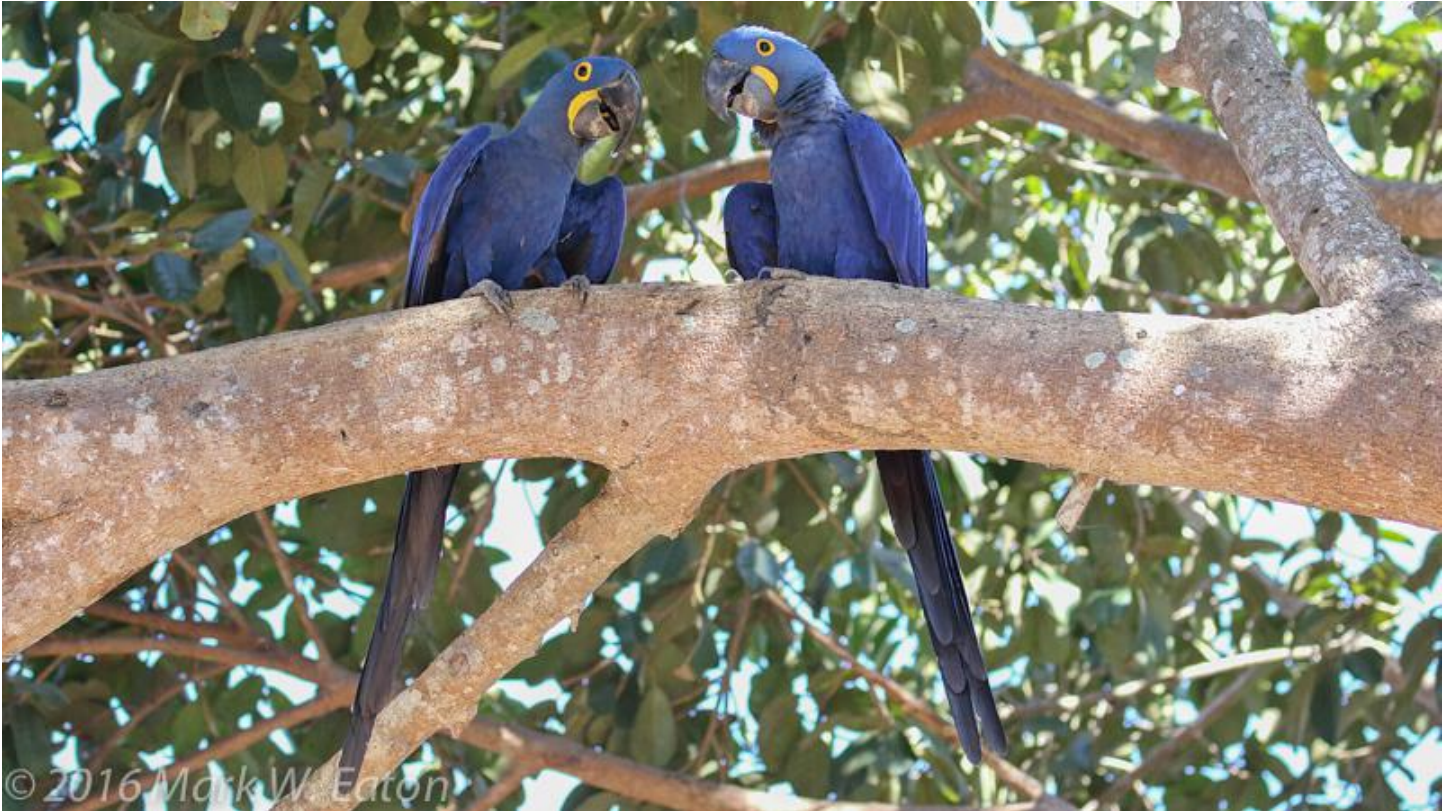
A pair of Hyacinth Macaws at the Pantanal Norte Hotel in Porto Jofre

By the last morning, we had had our fill of boat rides and instead worked our way slowly back north to Cuiabá, taking in the Pantanal scenery and wildlife one last time, and adding a surprisingly number of birds to the trip list such as Long-winged Harrier , Tawny-bellied Seedeater , and Crimson-crested Woodpecker . After a final night in Cuiabá, we went our separate ways the next morning, though some of the group joined me in Rio for the Atlantic Forest Introtour.