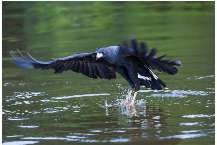
Black-collared Hawk and Great Black Hawk along the Pixaim River (Nick Athanas)

Our last new destination was Porto Jofre, at the southern end of the Transpantanal Highway. We stayed in a great hotel here and used it as a base to search for Jaguars along the Cuiabá River and its tributaries. Jaguars are always the main focus when we are out of the river here, but this time we really did not have to worry. Thirty minutes after beginning our quest, we were staring at male and female Jaguars through a small opening in the forest on the edge of the river! Even better, we found them ourselves, so did not have to contend with other boats jockeying for position in the river. They only stayed for a couple of minutes before disappearing into the forest. Based on the loud grunts we then heard, I strongly suspect they were mating. It was an incredible first encounter, and the first of several we had over the next day and a half. Having seen the Jaguars so easily, we could also relax and enjoy other mammals and birds on the boat rides, as well as around the lodge itself.