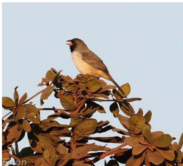
Black-faced Tanager and Black-throated Saltator from Chapada dos Guimarães