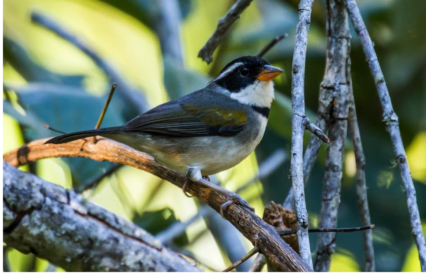
Saffron-billed Sparrow, Chapada dos Guimarães