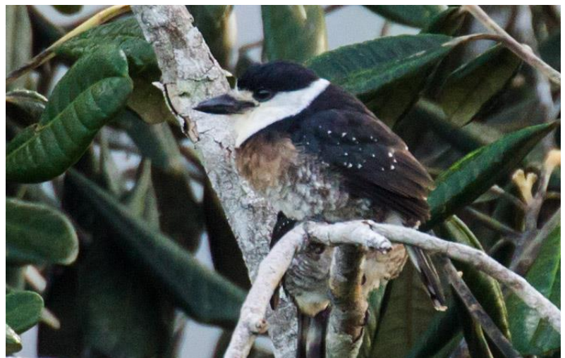
Black-girdled Barbet and Brown-banded Puffbird