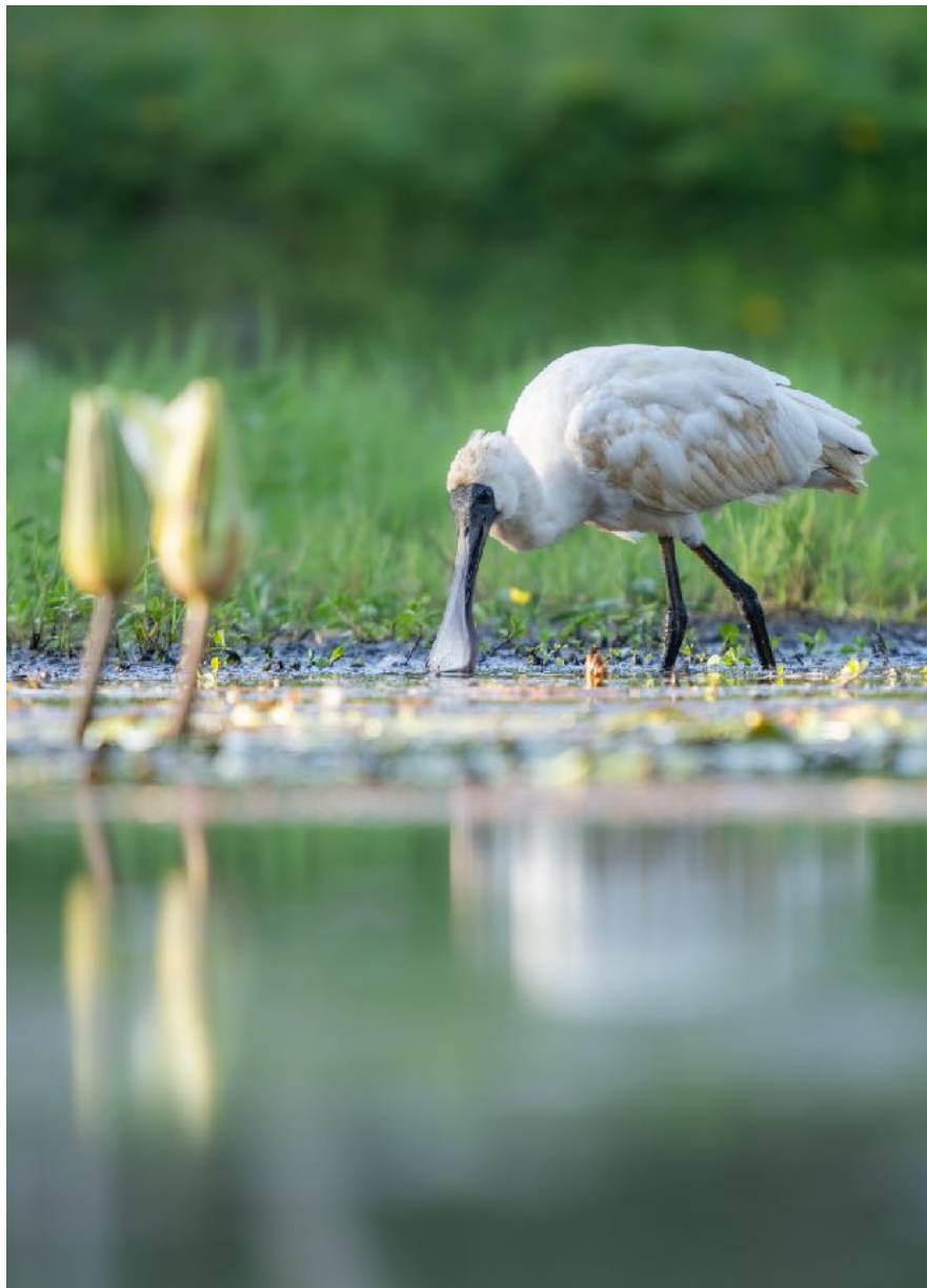
Royal Spoonbill

Today our first visit was to Centenary Lakes . Here the freshwater and saltwater lakes along with the mangroves and forests held a few new birds for us. Birds like; Australian Ibis , Royal Spoonbill , Pacific Black Duck , Australian Brush Turkey , Orange-footed Megapode , Australasian Grebe , Rock Pigeon , Australian Swiftlet , Plumed Egret , Little Egret , Pacific Baza , Torresian Kingfisher , Yellow Honeyeater , Dusky Myzomela , Helmeted Friarbird , Varied Triller , Nutmeg Mannikin , Black Butcherbird , Spangled Drongo , and a few of the common birds like House Sparrow and Welcome Swallow . We also had the pleasure of seeing the very cool and unique Krefft's River Turtle .