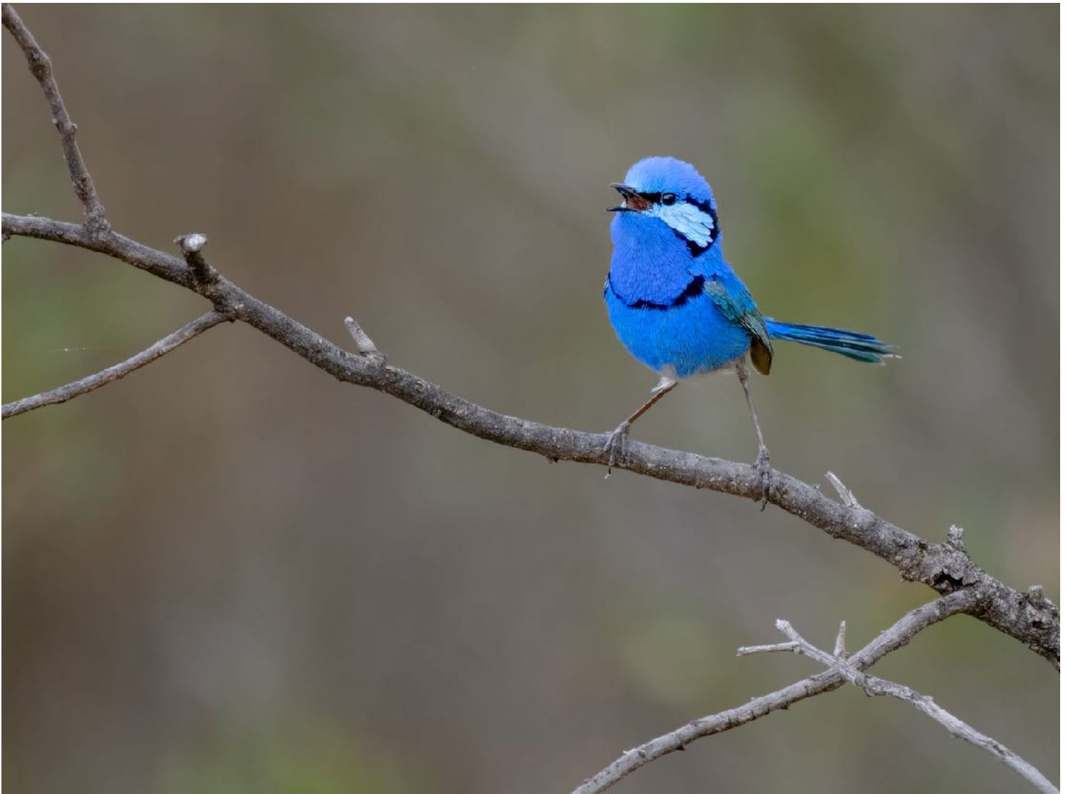
Splendid Fairywren

As mentioned previously, the highlights from Nombinni Reserve and Round Hill are as follows; Emu , Chestnut Quail-Thrush , Spotted Harrier , Red-backed Kingfisher , White-eared Honeyeater , Black Honeyeater , Pied Honeyeater , Shy Heathwren , Southern Scrub Robin , Hooded Robin , Spotted Bowerbird , Yellow-throated Miner , Splendid Fairywren , White-fronted , Spiny-cheeked , Singing , Striped , Gray-fronted and Yellow-plumed Honeyeaters , Diamond Dove , Australian Ringneck (Mallee) , Gilbert's Whistler , Budgerigar and Crimson Chat . Awesome stuff right?!? OH! And...on our way back to town, we stopped at a spot colloquially known as “ Chat Alley ”. Here we did indeed grab our last few chats; Orange and White-fronted Chat ...also we picked up, White-winged Fairywren , Brown Falcon and the adorable little Zebra Finch . We also saw a cute family of Red Fox !