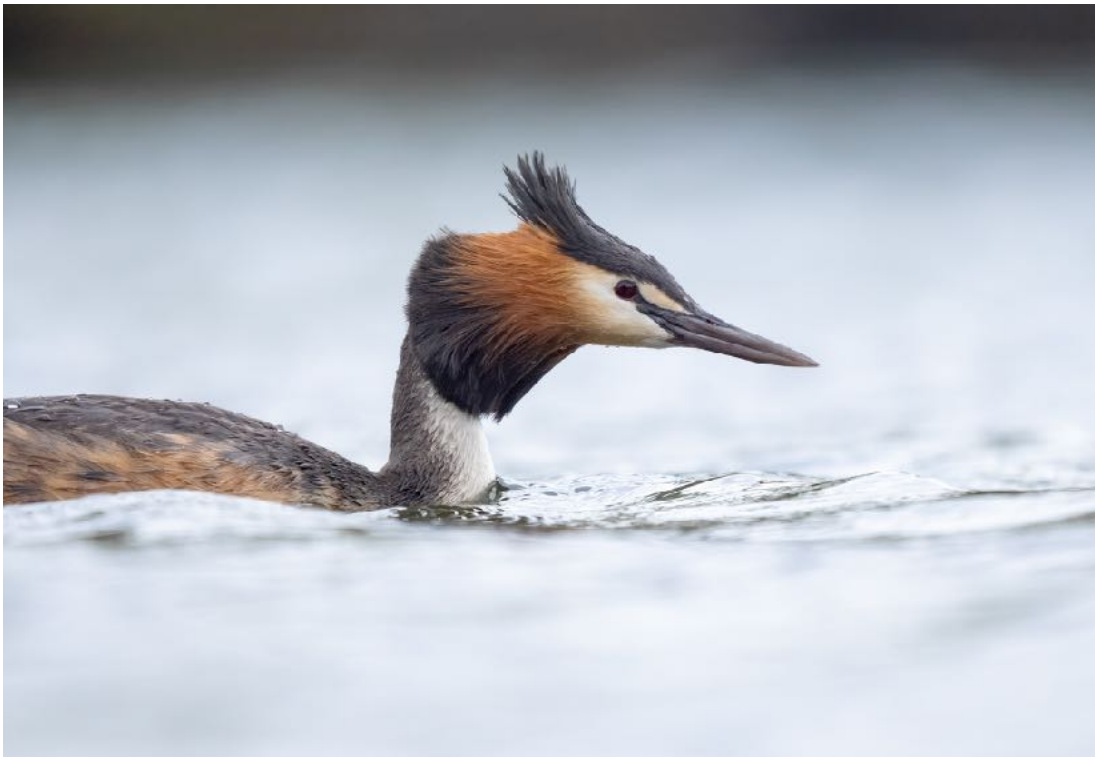
Great Crested Grebe