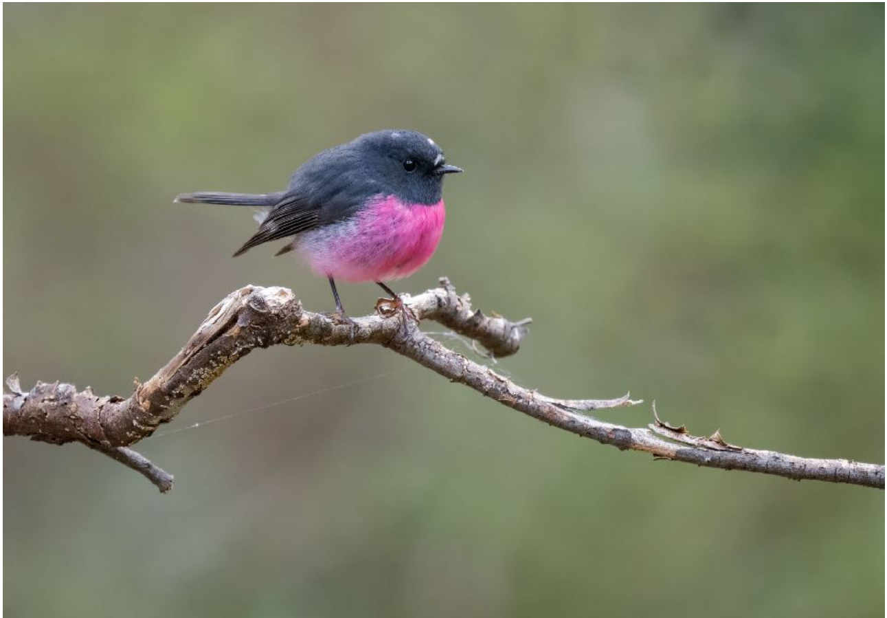
Pink Robin

After a quick flight to Hobart, we visited the Waterworks Reserve . Here we found some great targets; Tasmanian Thornbill , Tasmanian Scrubwren , Tasmanian Nativehen , Black Currawong , Common Bronzewing , Superb Fairywren , Gray Currawong , Bennet's Wallaby , Tasmanian (Rufous-bellied Pademelon) , and by far, the star of the afternoon, a stunningly pink and beautiful male Pink Robin . After a nice dinner, one guest decided he'd like to take me up on my offer to try some night time stuff so we returned to the Waterworks Reserve and found our main target, the Tasmanian Boobook .