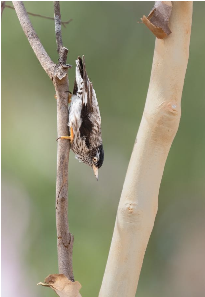
Varied Sittella

Next up was Hasties Swamp . Here we found all of the typical birds I would expect. Things like; Wandering and Plumed Whistling Duck , Australasian Grebe , Australasian Swamphen , Magpie Goose , Gray Teal , White-eyed and Maned Duck , Pacific Black Duck , Eurasian Coot , Dusky Moorhen , Sharp-tailed Sandpiper , Pied Stilt , Little Black Cormorant , Pacific Heron , Royal Spoonbill , Yellow-faced and White-cheeked Honeyeater , Eastern-yellow Robin , White-naped Honeyeater , Scarlet Myzomela and Dollarbird . After some sweet success here, we moved on to Wandeclea "Bluff" State Forest . Here the dry eucalypt forest holds a variety of new species for us. It was incredibly windy but we were able to add; Brown Treecreeper , Fuscous and Yellow-tinted Honeyeater , Varied Sittella , Sacred Kingfisher , Gray Shrike-thrush , Dusky Woodswallow . We also got to see a pretty sweet, Lace Monitor run across the road...HUGE!