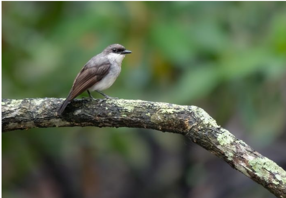
Mangrove Robin

Today is always fun. A quick check of the South End of the Cairns Esplanade gave us a few of our shorebird and 'water-bird' targets. Here we picked up; Whimbrel , Far Eastern Curlew , Bar-tailed Godwit , Great Knot , Sharp-tailed and Gray-tailed Tattler , Caspian and Australian Tern . The Mangroves gave us some nice views of Brown Honeyeater , Rose-crowned Fruit Dove and Mangrove Robin .