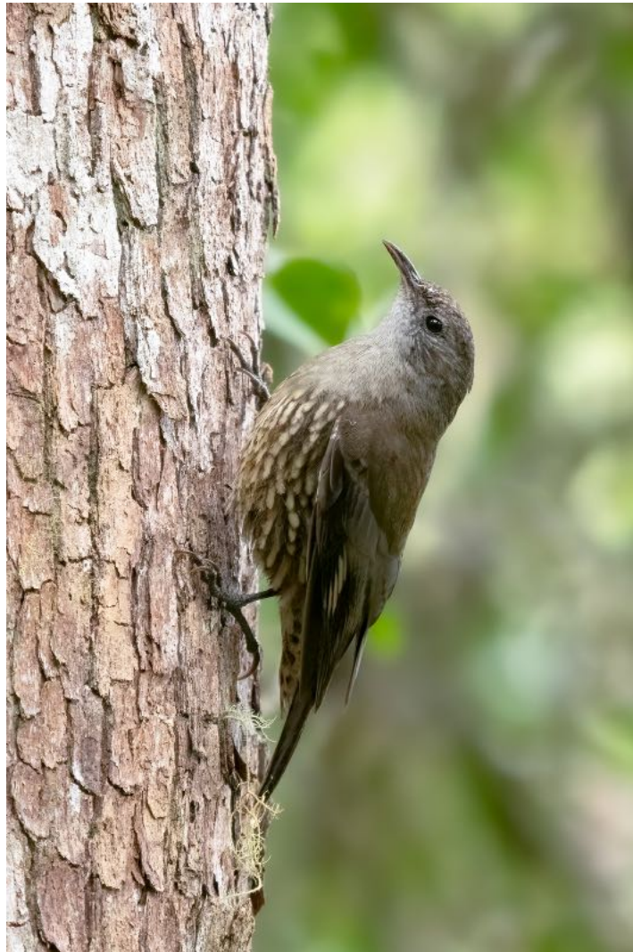
White-throated Treecreeper

Today is one of my favorite days mammal wise. We have three awesome mammals to find and of course, some stunning birds. First up, I had some unfinished with that last target in the town of Mareeba...however, after now TWO failed attempts I decided to call an addible and head for a different spot. So, our first stop after a quick coffee run was back to Davies Creek . After failing twice I was elated to hear our target calling right out of the car and within seconds we finally had a pair of White-browed Robins in our bins. Then, surprisingly, a Northern Fantail appeared too! I thought I had missed this species when I couldn't locate the resident at Abattoir Swamp so a really good pick up early in the day. After that wonderful start it was time to get to our main spot for the morning, Mt. Hypipamee NP . A random roadside spotting nabbed us Buff-banded Rail and Tawny Grassbird . Happy to say we picked up all of the main targets here; Mountain Thornbill , Bridled Honeyeater , Scarlet Myzomela , Bower's Shrikethrush , Golden Whistler , White-throated Treecreeper , Eastern Spinebill , Gray-headed Robin and Golden Bowerbird .