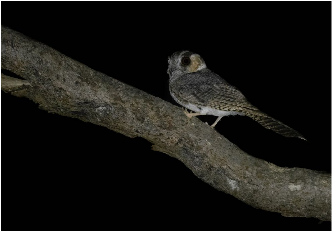
Australian Owlet Nightjar