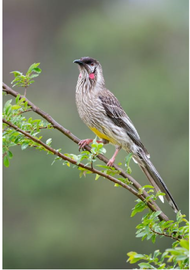
Red Wattlebird - Photo by Guide: Ben Knoot