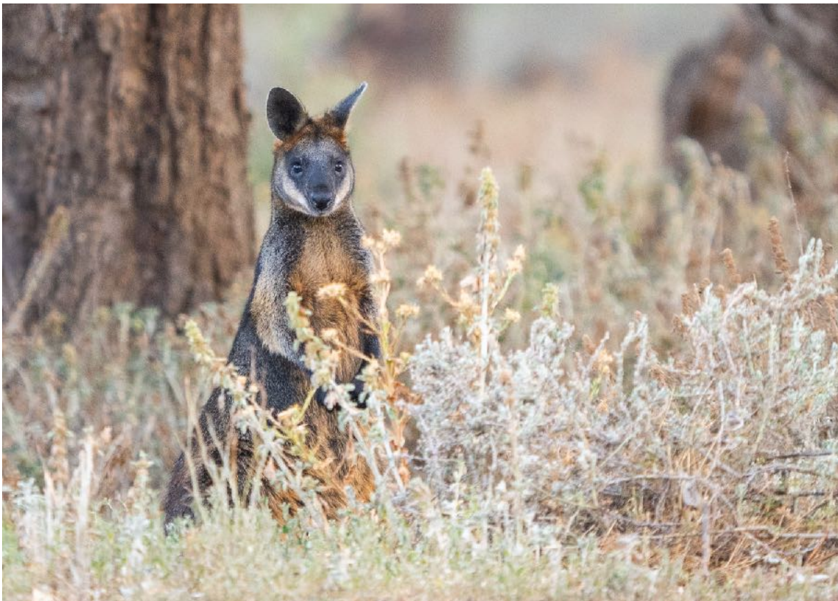
Swamp (Black) Wallaby