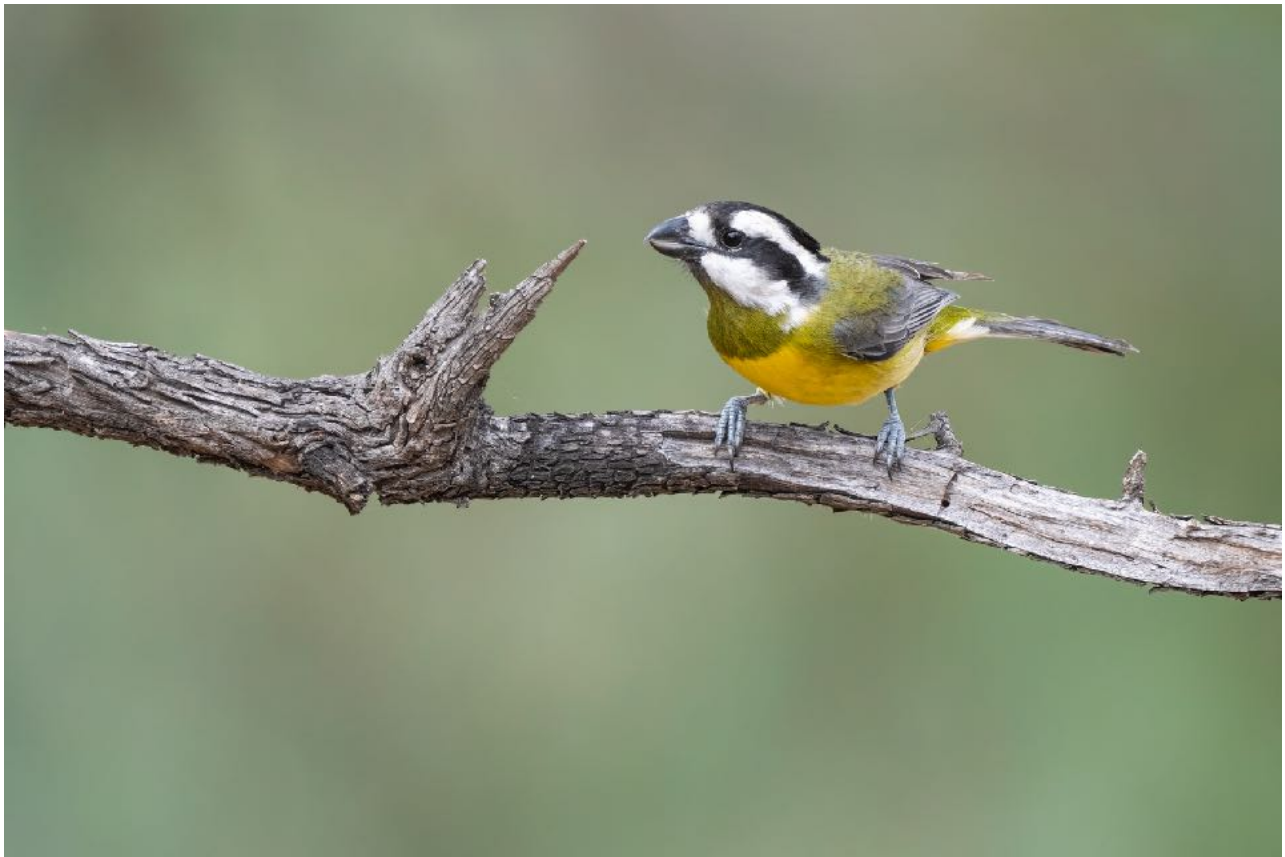
Eastern Shrike Tit

Our first stop of the day was the Lithgow Sewage Works . Here we found; Pink-eared Duck , Blue-billed Duck , Chestnut Teal , Australian Shoveler , Hoary-headed Grebe , European Starling , Eurasian Blackbird and Western Gray Kangaroo . After a quick visit there, we made our way into the main location for the morning, the Capertee Valley . Hot and dry conditions here but we still managed some great birds like; White-winged Chough , Little Corella , Spotted Pardalote , White-plumed Honeyeater , Rufous Songlark , White-browed Babbler , Diamond Firetail , Jacky-winter , Eastern Shrike-Tit and Red-rumped Parrot . And now...time for THE bird. A fair distance into Capertee Valley lies an area where conservation efforts are underway to aide a bird in dire need of recovery. Today was the day I'd finally get to try for this bird. I pulled over in an area I thought might have it and literally within two seconds I heard a call that I didn't recognize 100% (I had studied the call of this target the night before but it didn't quite match). But knowing that it was different from anything I knew and had heard before I scanned quickly...elated, I yelled out, "THE BIRD!!! GUYS THE BIRD IS HERE NOW!" Everyone hopped out of the car and got on the stunning Regent Honeyeater . I wasn't able to get any fantastic photos but the guests and I thoroughly enjoyed the views! In this same area we also managed some very nice Yellow-tailed Black Cockatoos .