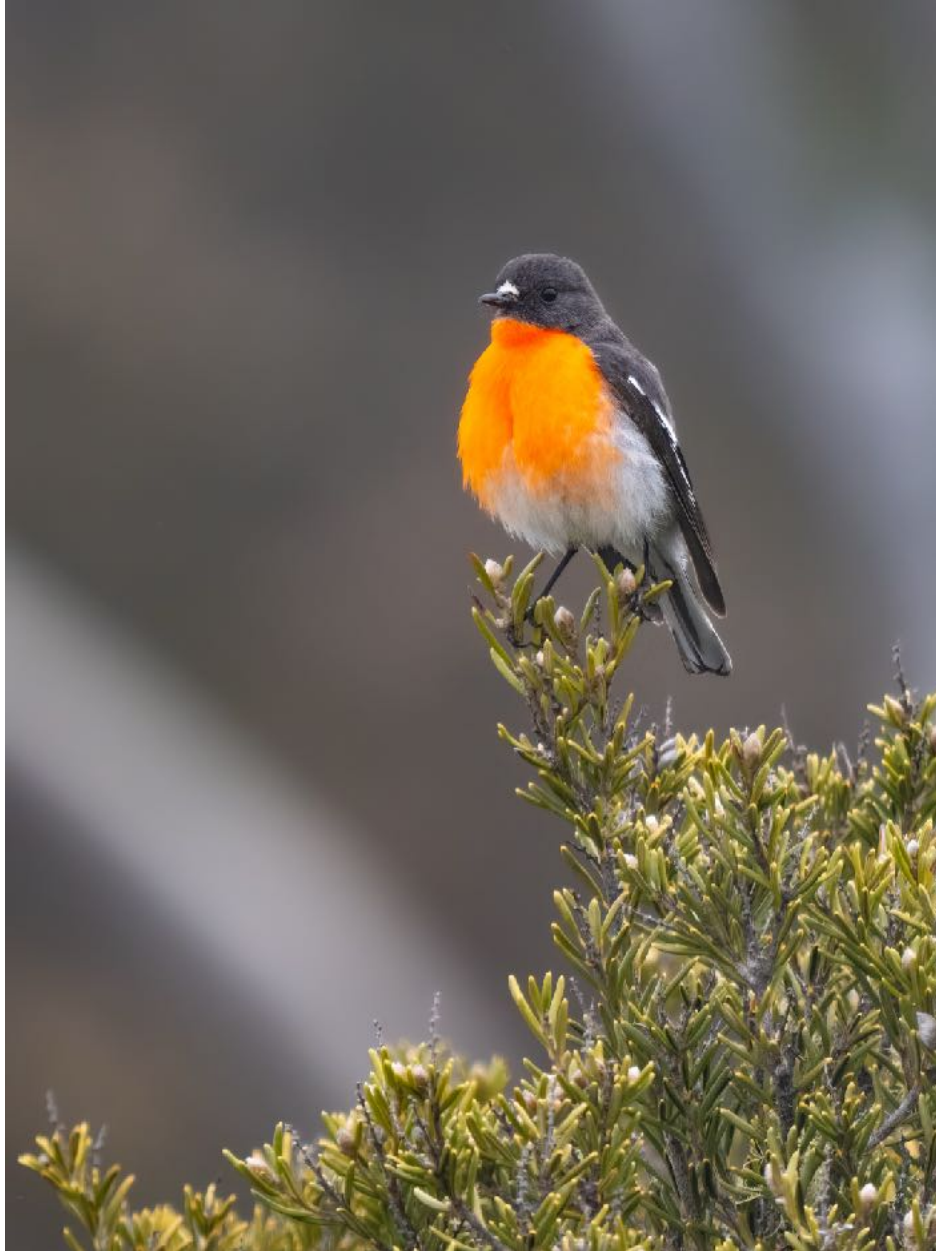
Flame Robin

Now back east to catch up with another few species we missed. So a nice stop-off at Sedbury Creek and Saltmarsh . Here we found loads White-fronted Chats , a single Australian Shelduck and what used to be a very hit or miss bird, a distant but confirmative Striated Fieldwren . Feeling satisfied and with several guests wanting to do some souvenir shopping and prep for the long travel home tomorrow, we all decided this was a great way to end the tour. Overall, this trip to Australia left the guests quite satiated in regards to wildlife in Australia but I think I can safely say that all the guests wouldn't mind another crack at this amazing country and its stupendous flora and fauna.