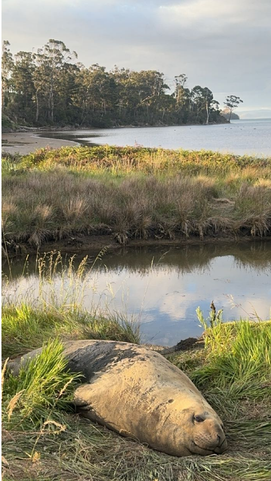
Elephant Seal 'Neil' (iPhone 15)