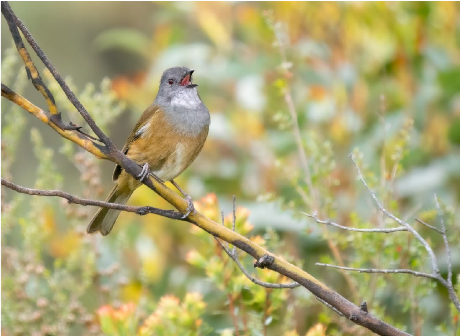
Olive Whistler

We then took a small trail system into the thick of it and found the last endemic I had missed on Bruny Island. This time we accomplished our mission and got some great views of the skulking Scrubtit. A quick trip up to “the Big Bend” turned out to be rather fruitful as we bagged our last Australasian Robin, the superlative Flame Robin. A short stop at Gould’s Lagoon gave us a 90% pure Mallard which we all agreed...was close enough to check off. And finally, a quick drive through the nearby neighborhoods to round out our very last introduced species, the European Greenfinch.