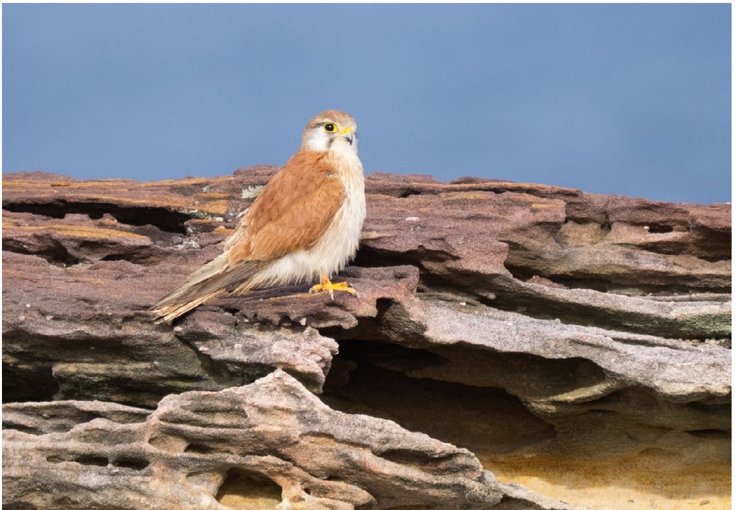
Nankeen Kestrel

Into Royal National Park for one last effort at Pilotbird but unfortunately, no luck again. We saw another Superb Lyrebird , Bassian Thrush , Maned Duck and lots and lots of Sulphur-crested Cockatoo . Then for the main event of the afternoon, the Wattamulla Coastal Track . It was quiet... very quiet. The start of the walk yielded Little Wattlebird and New Holland Honeyeater but nothing else really. At the end of where I wanted to go, I thought I heard a heath wren calling but after several attempts of nothing, I decided to call it quits and head back, hoping the next morning would be better. Then all of a sudden...OUT OF NOWHERE, a Chestnut-rumped Heathwren flew in and posed for us in a nearby bush. Excellent. But wait..it gets better! It flew over to a rock where I kid you not, a Rockwarbler came again, OUT OF NOWHERE and scared it off. Then, the Rockwarbler posed for us and was then scared off by some little mouse! All of this happened within 30-seconds of wonderful wildlife chaos...awesome stuff! We also had a lovely Nankeen Kestrel . Off to the hotel after what turned out to be a wonderfully successful afternoon!