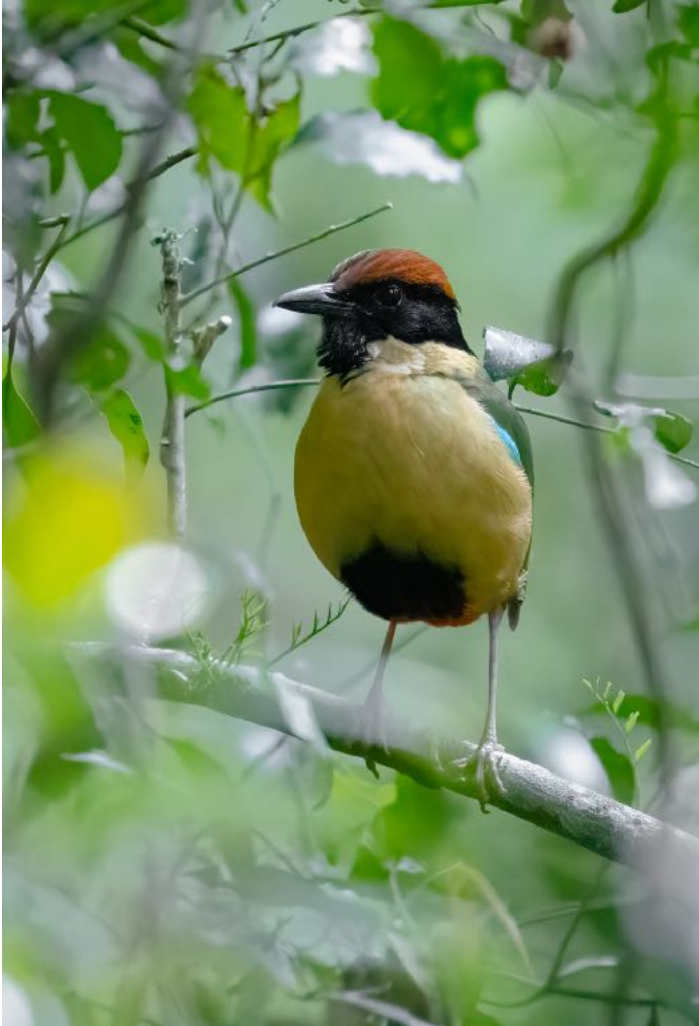
Noisy Pitta - Photo by Guide: Ben Knoot