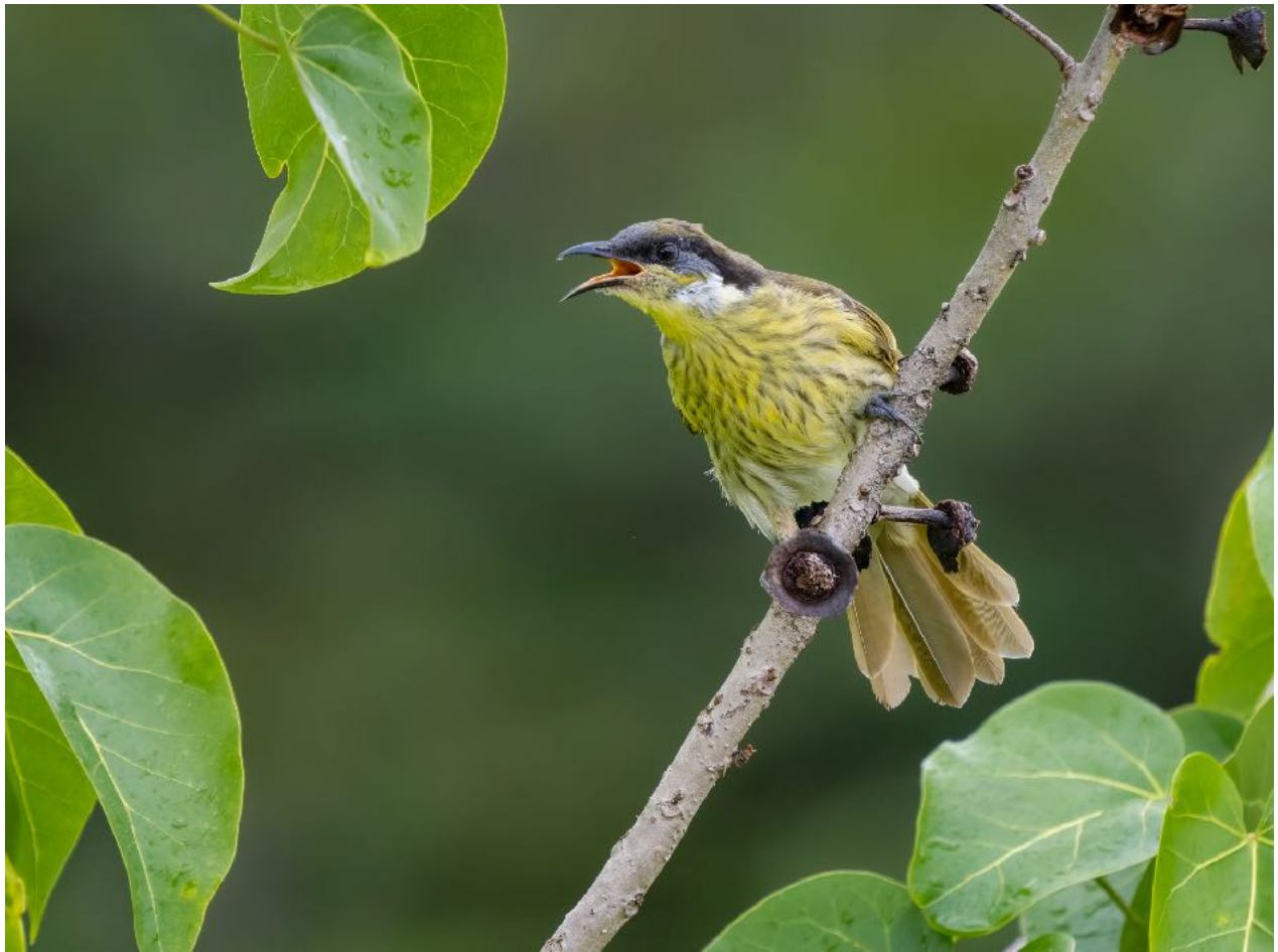
Varied Honeyeater

Then it was back to the Cairns Esplanade to try and grab some shorebirds now that the tide was right. Walking the whole esplanade we managed; Bar-tailed Godwit , Black-tailed Godwit , Far Eastern Curlew , Gray-tailed Tattler , Great Knot , Red-necked Stint , Terek Sandpiper , Pacific Golden Plover , Greater Sand Plover , White-faced Heron , Sacred Kingfisher , Nankeen Night Heron , Little Tern , Australian Tern , Silver Gull , Australian Pelican , Common Greenshank , Marsh Sandpiper , and Varied Honeyeater .