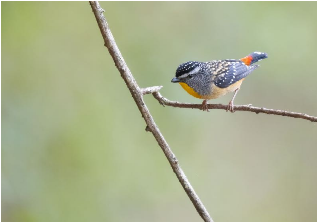
Spotted Pardalote - Photo by Guide: Ben Knoot