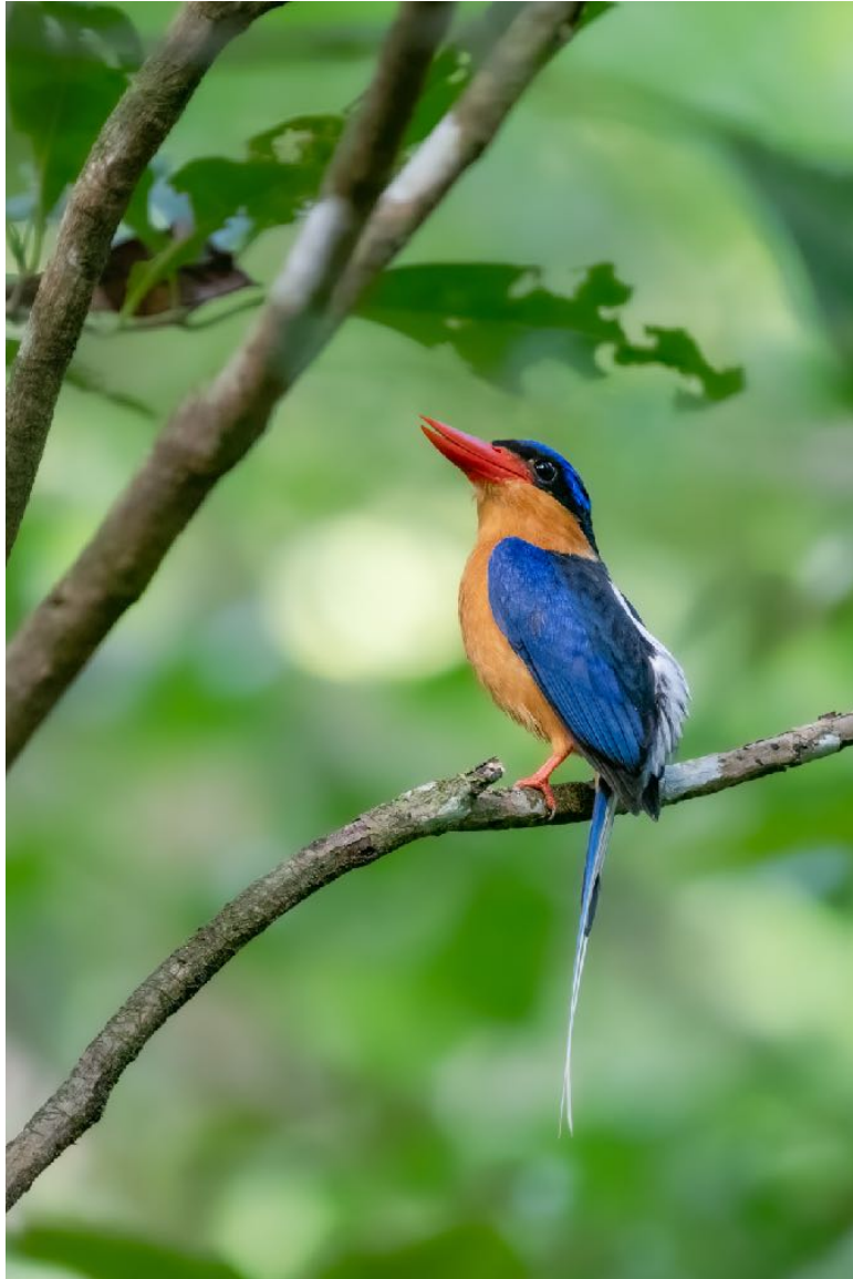
Buff-breasted Paradise Kingfisher

Next up, a quick stop at Cattana Wetlands to pick up an easy Green Pygmy Goose , Laughing Kookaburra , and a slightly more difficult Crimson Finch . We also got some other great birds like; Brown-backed Honeyeater , Latham's Snipe , Pacific Heron and Comb-crested Jacana . A journey over to Yorkey's Knob proved less than fruitful and after a nice but quick sushi lunch, we hit Newell Beach where we nailed our main target, a pair of lovely Beach Thick-knee . After a Pacific Reef Heron was spotted along the coast, we arrived at a wonderful tropical forest just south of our lodge. This spot is called Palm Road . Here we had some nice luck with some great birds like; Spectacled Monarch , Pied Monarch , Varied Triller , Mistletoebird and some wonderful little Fairy Gerygone . Our last stop for the day was a boardwalk north of our lodge in the Daintree area , we added a Brown Cuckoo-Dove and Cryptic Honeyeater and retreated to our lovely lodge for the night.