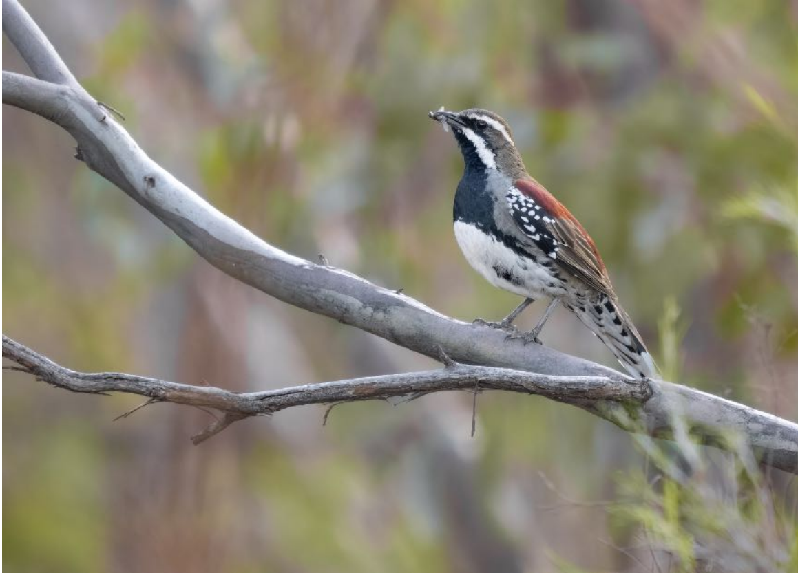
Chestnut Quail Thrush