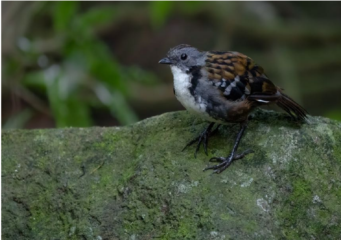
Australian Logrunner