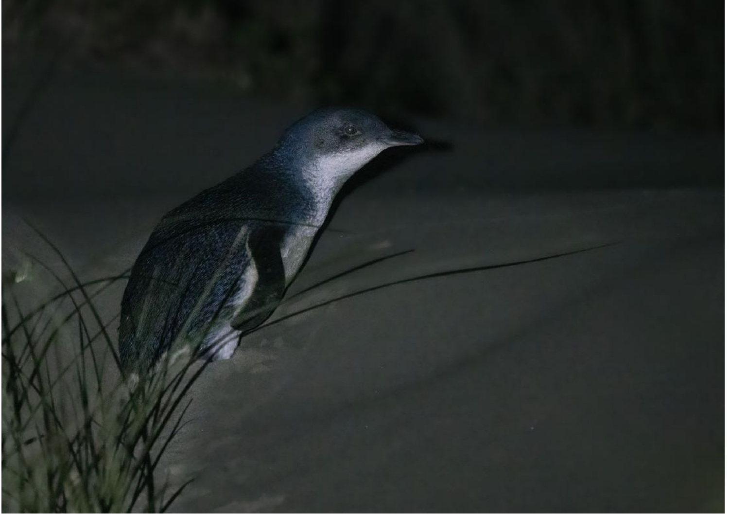
Little Penguin