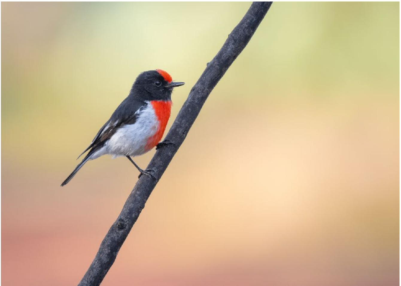
Red-capped Robin - Photo by Guide: Ben Knoot

The morning was spent in a place called Back-Yama State Forest . A very odd place honestly, especially compared to what we'd experienced until this point. Here we found; Greater Blue Bonnet , Common Bronzewing , Chestnut-rumped , Yellow and Inland Thornbill , Cockatiel , Brown-headed Honeyeater , Speckled Warbler , Western Gerygone , Southern Whiteface , Australian Raven , Red-capped Robin , Masked and White-browed Woodswallow .