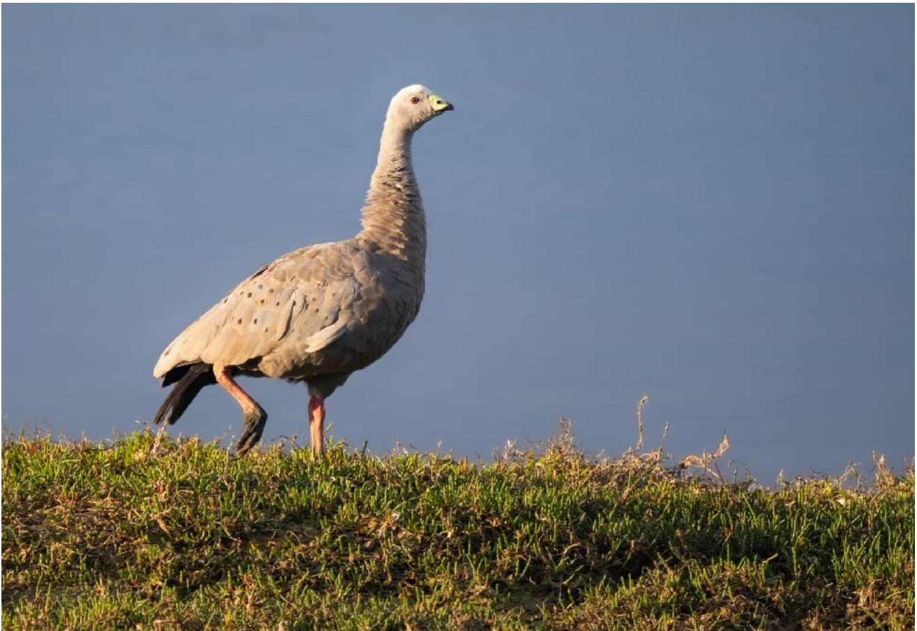
Cape Barren Goose

Now on the mainland, our final effort for the afternoon was to find a goose...a cool goose! After a bit of guess work and deductive birding around Impression Bay I finally found a small group. Once everyone got on the bird, I was so focused on getting a little closer and trying to get a better photo that I nearly stepped on what I thought was a log but what turned out to be A GIANT ELEPHANT SEAL . I was just using my peripheral vision and luckily it reared up and growled at me before I got to steppin' to close. This is the second time an animal gave me a heart attack on this tour but apparently, this one had a story! Turns out, "Neil the Seal" had been documented and tracked as well as been in the papers, has his own IG Page and is just a local celebrity. A wonderful and completely unexpected addition to this tour! Anyway, the Cape Barren Goose was cool too! Alas, after dinner, it was time for the main event of the evening. Typically somewhere around 45min - 1hr after sunset, Pirates Bay hosts a fun 'home-coming' event for those who can brave the chilly conditions. In the dark of night, Little Penguins make their way ashore from a day of fishing to roost in the sandy banks. They are typically a little weary but with a little patience, you can have a really fun night with the worlds smallest penguin. It really is an awesome way to end the day. A nice long drive home and we hit the hay to prep for our last full day of the tour on the Tasman Peninsula.