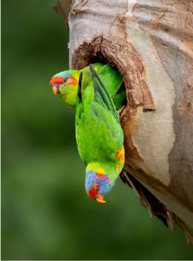
Musk Lorikeet (& Hybrid)