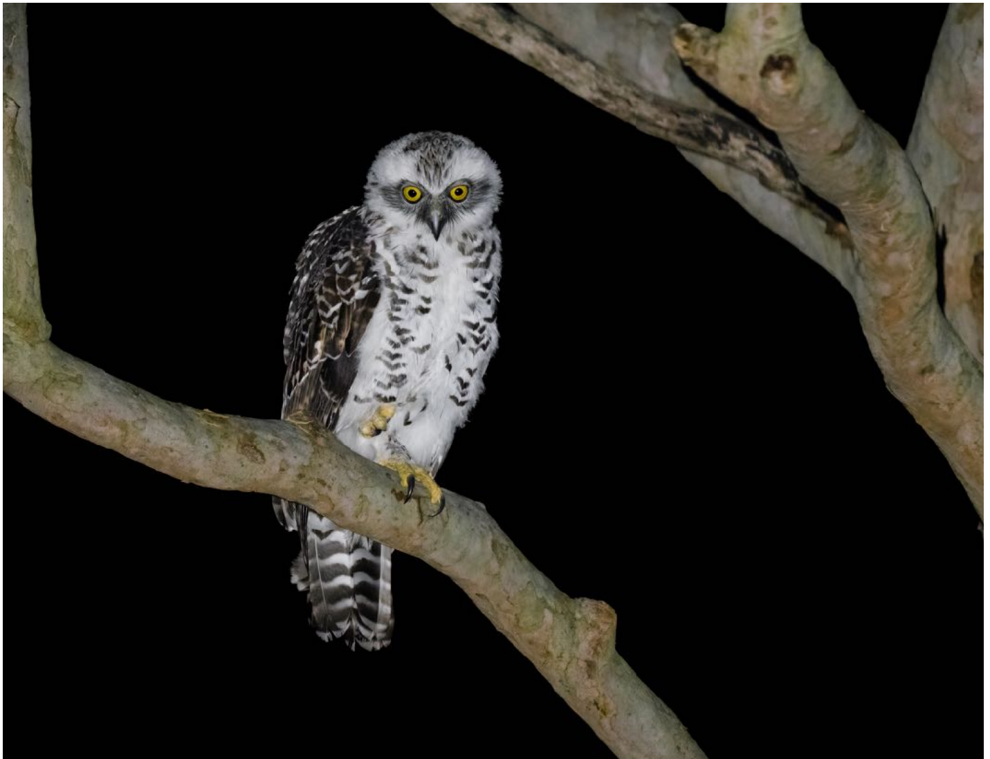
Powerful Owl (juvenile)