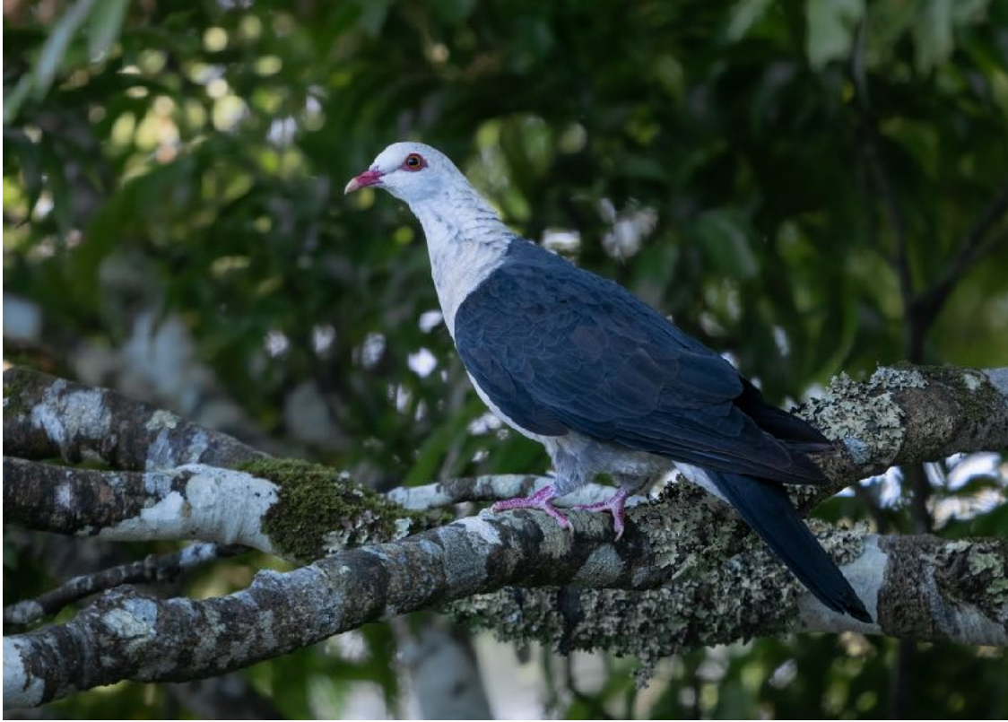
White-headed Pigeon