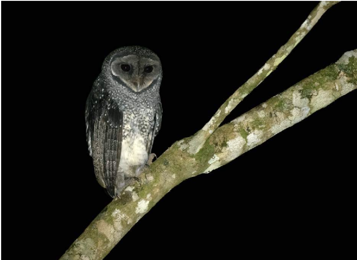
Lesser Sooty Owl

Now that it was getting later in the afternoon, we had a very important appointment to keep. We hustled over to Peterson Creek “Allumbah Pocket” . Here we have three targets and even though we tried many times and our absolute hardest, I only managed two. We started off with the colony of Spectacled Flying Fox and after a little wait, we had an amazing experience with a Duck-billed Platypus . Stupendous afternoon! Other highlights included a blue (very rare and restricted to the tablelands) Common Tree Snake , Coppery-tailed Brush Possum and a Green Ring-tailed Possum . After a quick dinner (to give us the best chance at a very difficult owl) I knocked off Sarus Crane and Brolga and then headed off to Curtain Fig Tree for the evening. Almost immediately out of the car we heard our target. After 5-min, we heard it again but unfortunately, though we searched hard, we couldn't find it. Too bad. Off to our accommodation for the evening; Chambers Lodge in Crater Lakes . The lodge has a honey feeder and after a little patience we got some cool night mammals. We managed; Krefft's Glider , Northern Leaf-tailed Gecko , Striped Possum , Long-nosed Bandicoot and Fawn-footed Malomys . While we were enjoying these mammals, I heard an unmistakable call. Our target from the Curtain Fig Tree only this time, just feet away. The two guests who were still awake and I enjoyed what was for me, the bird of the day and indeed one of my favorite birds of the trip, a Lesser Sooty Owl ...EPIC.