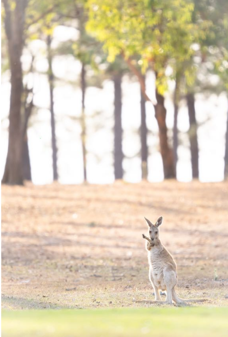
Eastern Gray Kangaroo