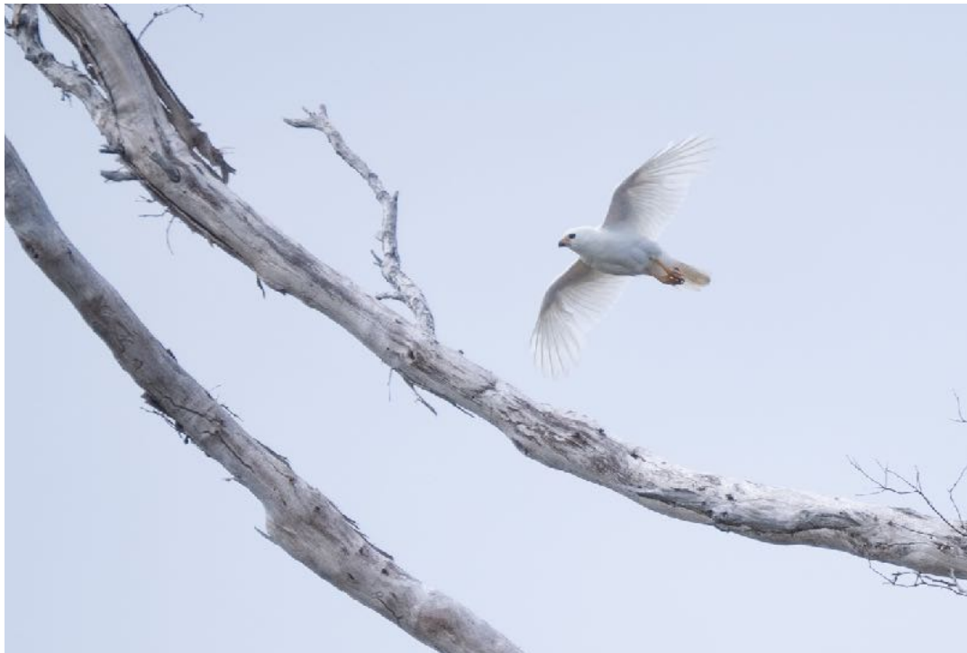
Gray Goshawk (white morph)