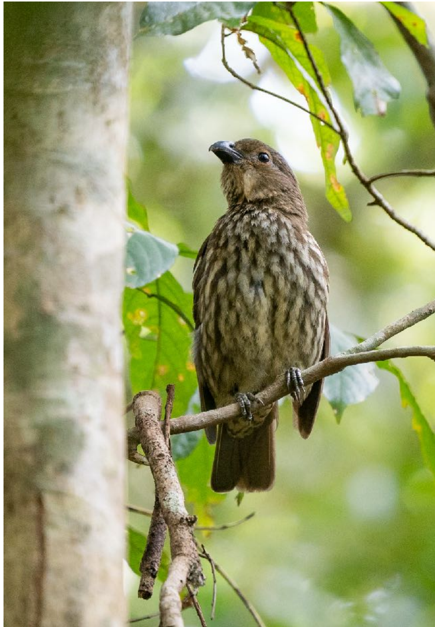
Tooth-billed Bowerbird

Today the plan is simple...target chase. We spend the day going to various locations to target northern Queensland birds we missed or still needed and we do this as fast as possible to get as many as possible. We started with an early morning around Chambers Lodge to get our last and most difficult species of monarch, the White-eared Monarch . Our first location was Lake Barrine for a nice morning walk around the lake. Once we arrived at the lake, we managed to see; Great-crested Grebe , Tooth-billed Bowerbird , Lewin's Honeyeater , and Chowchilla . We also saw a cute little Musky Rat Kangaroo .