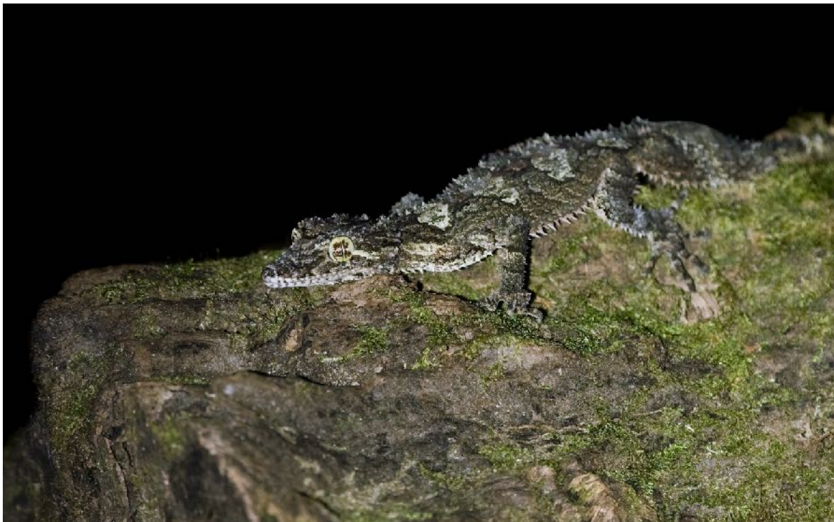
Northern Leaf-tailed Gecko