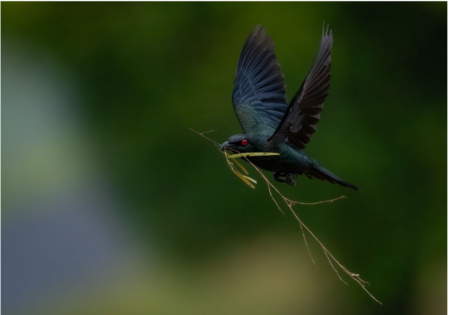
Metallic Starling

Arrival day does not simply mean meet, greet and eat on this tour. We got started right away with an hour and a half journey south with some afternoon birding along Etty Bay Road . Here we picked up the more common and abundant birds like; Metallic Starling, Bar-shouldered, Spotted and Peaceful Dove, Bush Thick-knee, Rainbow Bee-eater, White-breasted Woodswallow, Forest Kingfisher, Masked Lapwing, Great and Eastern Cattle Egret, White-bellied Sea-eagle, Black Kite, Sulphur-crested Cockatoo, Rainbow Lorikeet, Double-eyed Fig Parrot, Australasian Figbird, Willie Wagtail, Magpie Lark and Common Myna . It was lovely to get these common birds out of the way but they were not what we were here to see.