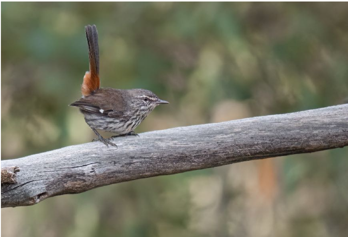
Shy Heathwren