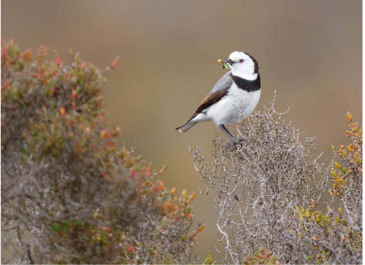
White-fronted Chat