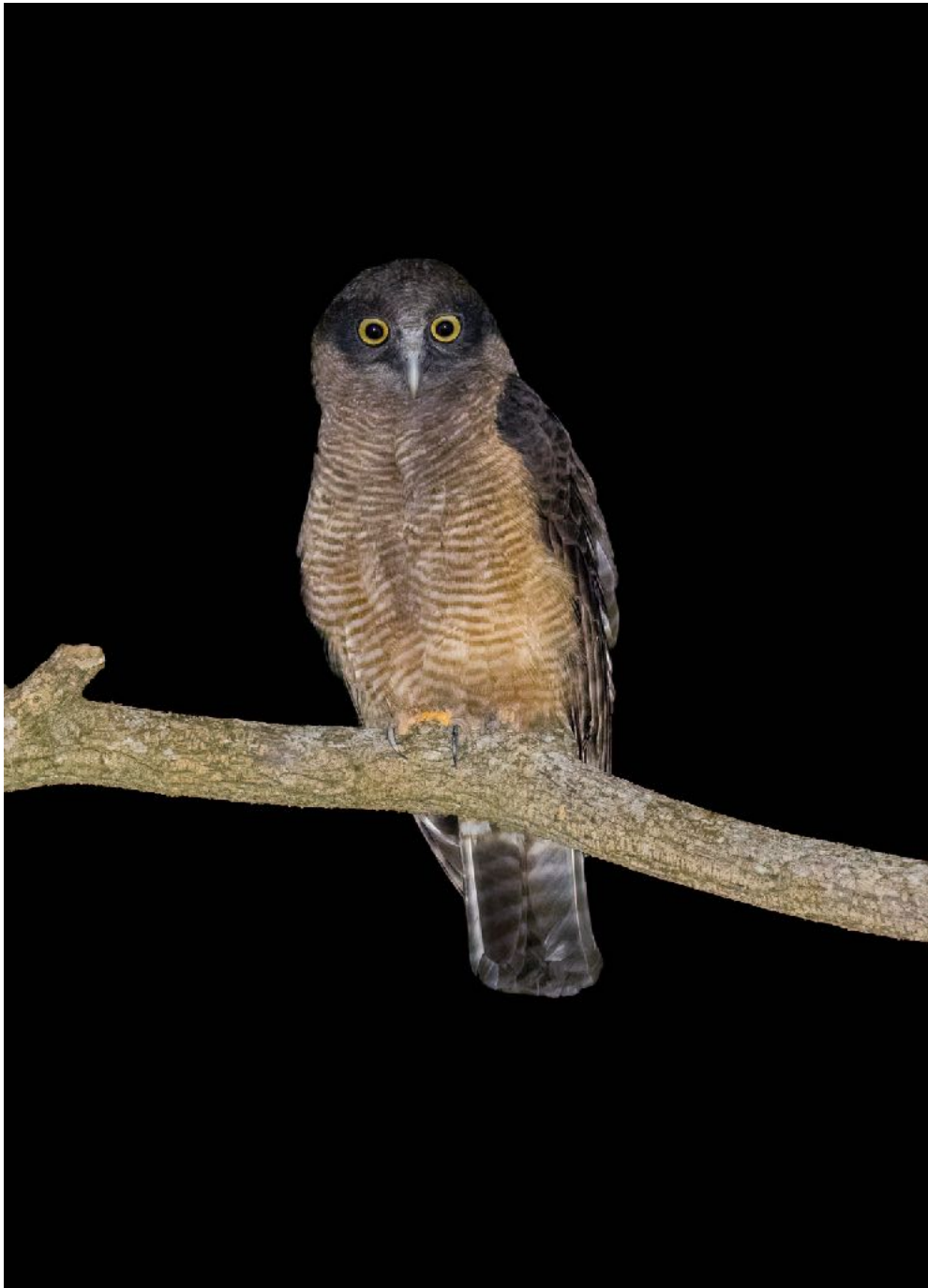
Rufous Owl

When we got back from the boat cruise we had a few hours so I took the group to a roosting Papuan Frogmouth to end the afternoon. The roost is a friends location so it will be kept private. After I finally found my land-legs, and a nice dinner, we went to a local park to find a wonderful pair of Rufous Owls. I had missed these birds in NT with one of the guests so nabbing this species for him (and of course for the rest of the group as well) was a real relief. The nights rest was a very welcome experience after a great long day.