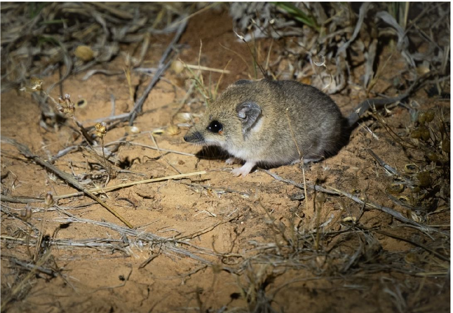
Fat-tailed Dunnart

Next up, a stop at Gum Swamp . This is a really cool place with several established blinds and short walking trails. We had great success here nailing several key targets. Yellow-billed Spoonbill , Cockatiel and the rarest duck in Australia, the Freckled Duck were all found and enjoyed throughly. We also added Eastern Snake-necked Turtle to our growing list of ‘other-animals’! We had quite a long drive towards Hay so we just sort of went...and after a wild lunch, we rested up for about an hour and then travelled towards Wanganella to meet our guide for the evening. The late afternoon and the evening was spent birding with local guide Phil Maher. For his privacy, his spots will remain “ Phils Spots ”. Over the course of the afternoon and an incredible evening on his friends ranch, we found; Black-tailed Native Hen , Glossy Ibis , White-backed Swallow , Tree Martin , Brown Songlark , Singing Bushlark , Banded Lapwing , Swamp Harrier , Tawny Frogmouth , Eastern Barn Owl and the monotypic highlight of the evening, the Plains Wanderer . We also found lots of Red and Western Gray Kangaroo , and a fun Fat-tailed Dunnart !