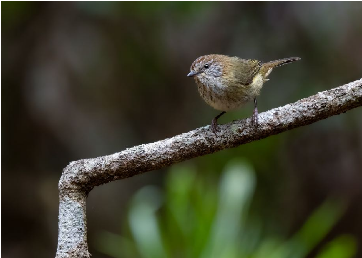
Striated Thornbill

Today we had a HUGE drive. The longest of the trip...about 6hrs. I had a few target chases in mind for the day and the first brought us back to Binya State Forest . Sometimes you can get Black-eared Cuckoo here but unfortunately, no luck for us. Dipping here, we moved on to try and find a Restless Flycatcher which I somehow missed in Capertee Valley. I checked a recent report about half way to Robertson as a last ditch effort and unfortunately, nothing. There were several Leaden Flycatcher that were bouncing around here as well as more lovely Superb Fairywren . Feeling a bit low and like I've ben missing a lot of the targets I set off for my last target chase before heading into Robertson. Luckily this one has a much higher chance of success and a brief stop in Ingalba Nature Reserve provided me with two much needed wins for the afternoon; Brown Goshawk and Buff-rumped Thornbill . We then made our way into Robertson and after about an hour of rest, we went to nearby MacQuarries Pass National Park "Clover Trail". Here we found three great birds; Striated Thornbill , Bassian Thrush and the superb Superb Lyrebird . After a quick check at Buderoo Fire Trail to grab Fan-tailed Cuckoo and Southern Emu Wren and after a quick dinner, we hit the mountain roads for our best chance at one of our last big mammal targets. We ended up driving Jamberoo Mountain Road which paid off handsomely with a wonderful Common Wombat .