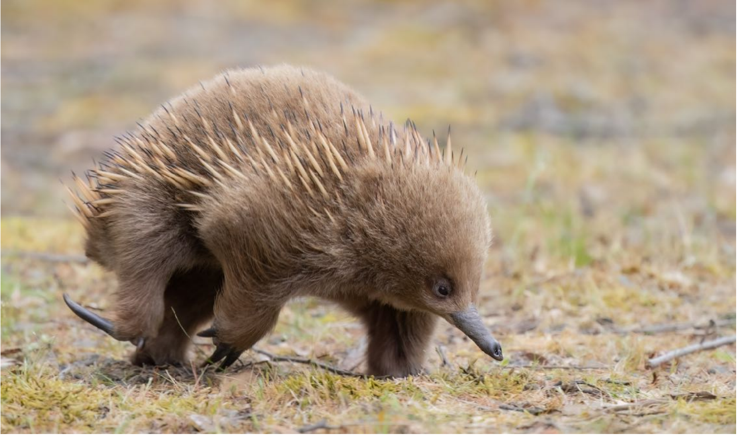
Short-beaked Echidna