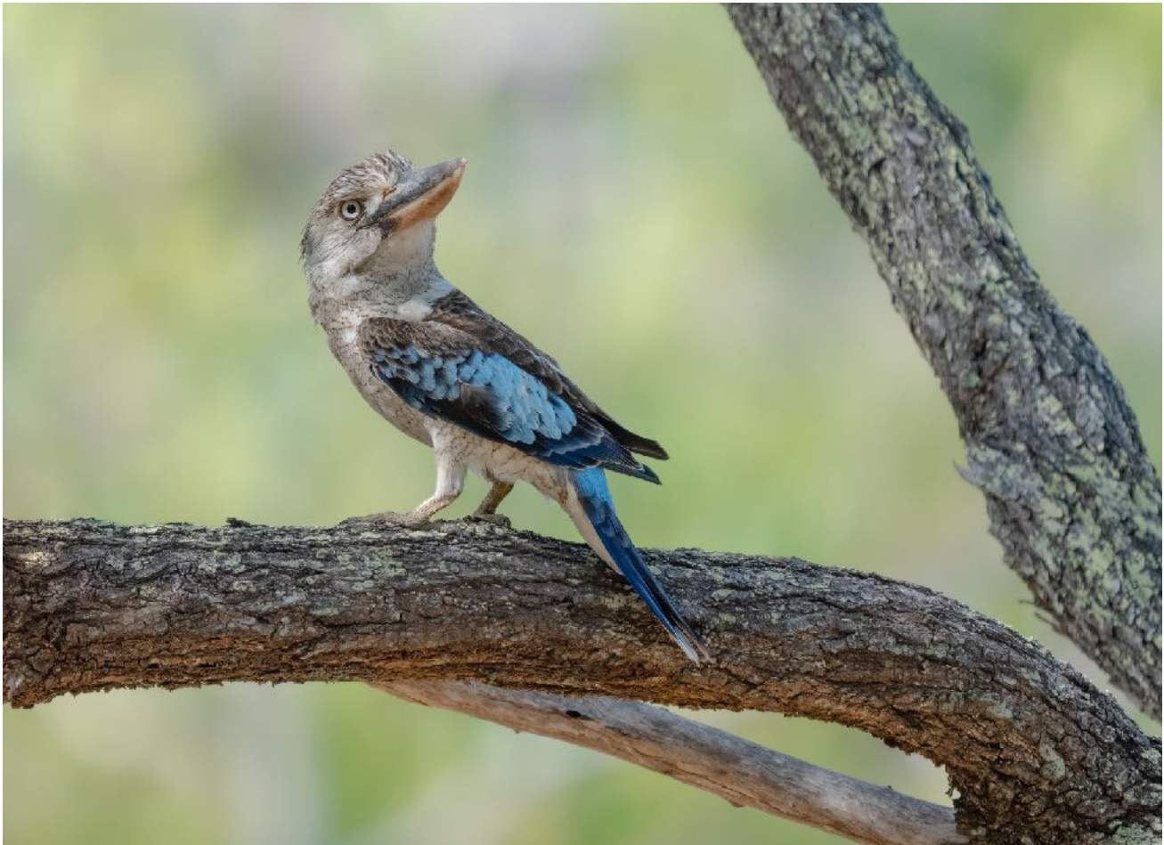
Blue-winged Kookaburra

As it was now getting later into the morning I decided to head up Mt. Lewis Road. Unfortunately, a recent cyclone had completely destroyed the road up to the best parts of Mt. Lewis. Especially for access to some great birds like Fernwren, Chowchilla, etc...we'd have to work some other unknown locations and habitat for these birds later but in the lower elevations of Mt. Lewis I was able to scrounge up Barred Cuckooshrike (the best bird of the morning in my opinion!), Gray Whistler , Brown Gerygone , Spotted Catbird and a decent look (to be improved on later) of a male Victoria's Riflebird . After a quick but lovely lunch, we ventured down East Mary Road to pick up our Banded Honeyeater , Australian Bustard and a nice White-winged Triller . After a failed hunt for White-gaped Honeyeater at McLeod River Crossing I took a quick side trip to Mt Carbine Cemetery for a White-throated Gerygone before heading to the main event for the afternoon, the Mt. Carbine Caravan Park . Here we grabbed the usual suspects; Blue-winged Kookaburra , Pacific Koel , Red-winged Parrot , Great Bowerbird , Galah , Pale-headed Rosella , Rainbow Lorikeet , Pied Butcherbird , Australian Magpie , Yellow Honeyeater , Blue-faced Honeyeater and some comedic Apostlebird . A wonderful afternoon. Back to the hotel for a good nights rest.