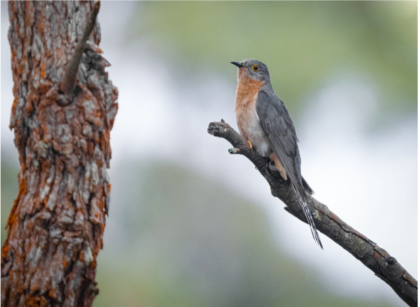
Fan-tailed Cuckoo