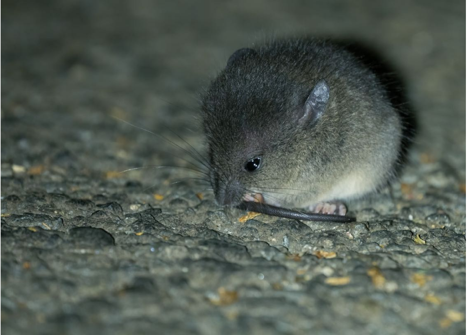
Fawn-footed Melomys