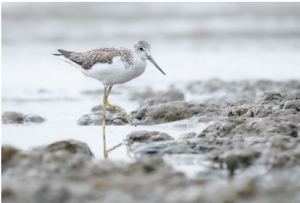
Common Greenshank