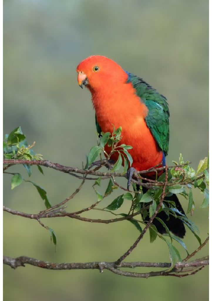
Australian King Parrot