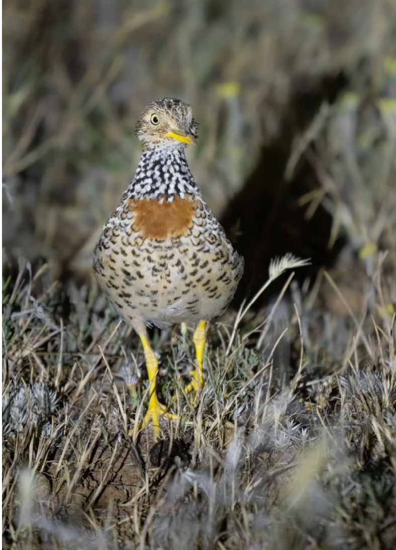
Plains Wanderer