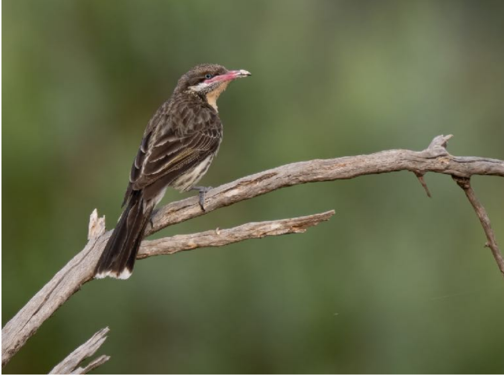
Spiny-cheeked Honeyeater