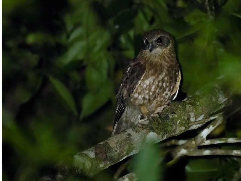
Australian Boobook

While we were enjoying this epic sighting I then heard another priority owl target, the newly split, Australian Boobook! It didn't take long to locate this individual either so we then enjoyed several great minutes with another wonderful bird before taking our leave for the evening.