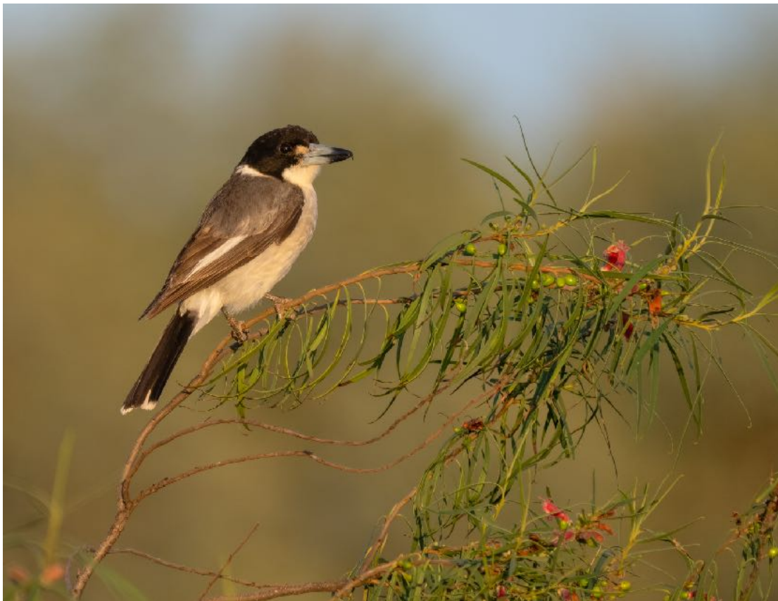
Gray Butcherbird