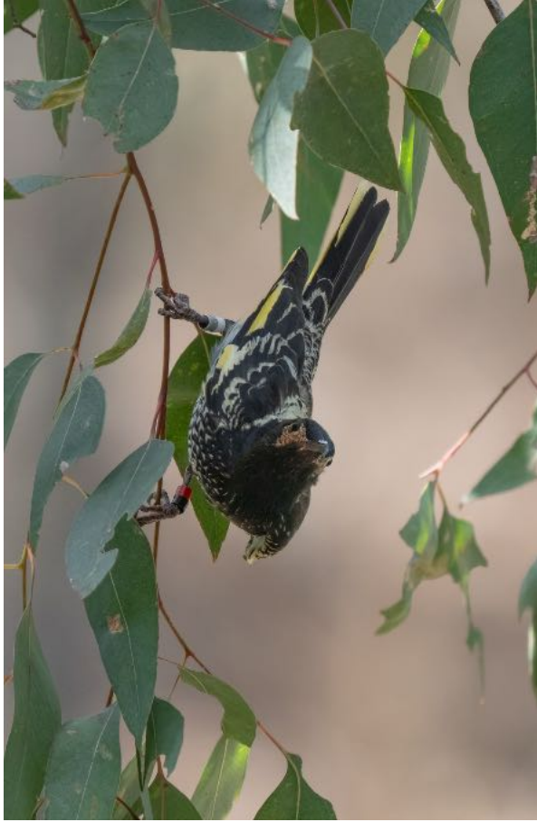
Regent Honeyeater