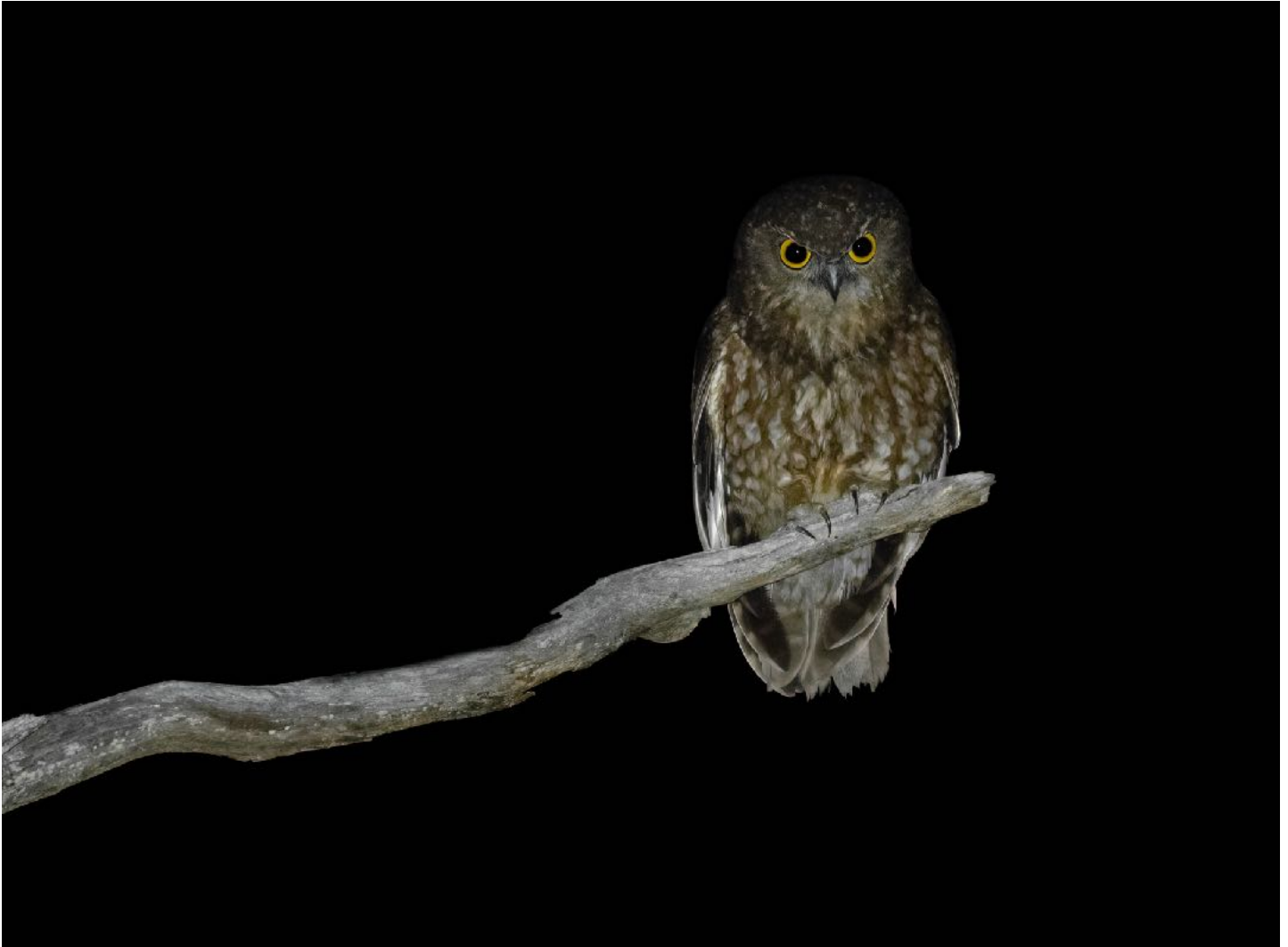
Tasmanian Boobook