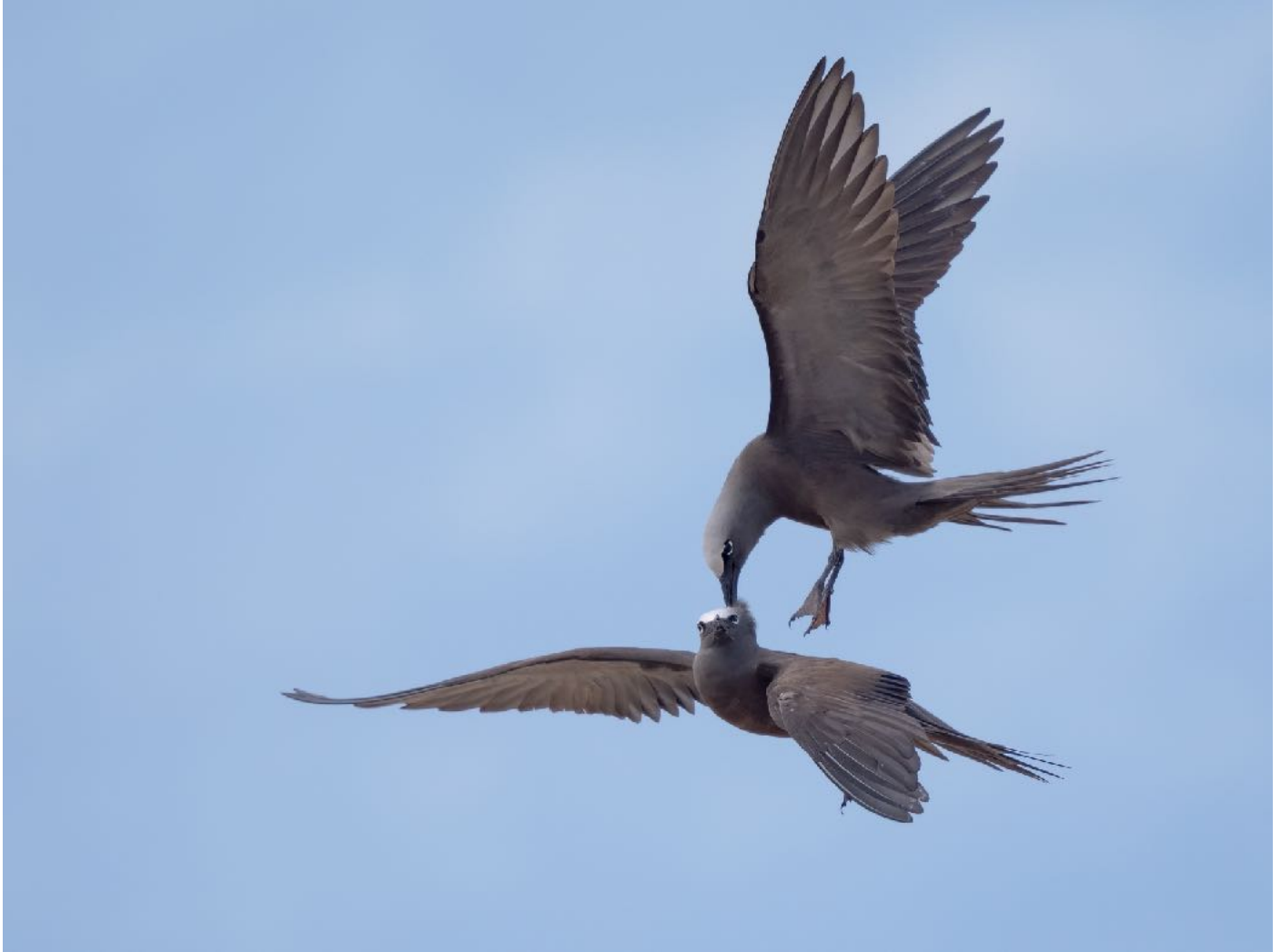
Brown Noddy

If you haven't explored The Great Barrier Reef , you need to. It is a very cool experience. Equally as cool are the birds that call the tiny little sandy island of Michaelmas Caye a breeding ground. Birds like; Great Frigatebird , Sooty , Bridled , Lesser Crested , Great Crested , Red-footed Booby , Ruddy Turnstone , Brown Booby , Silver Gull , Brown and Black Noddy .