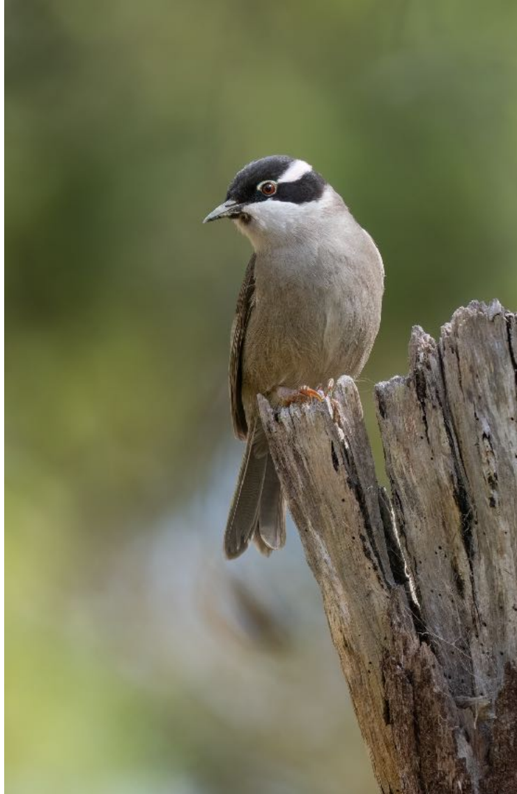
Strong-billed Honeyeater