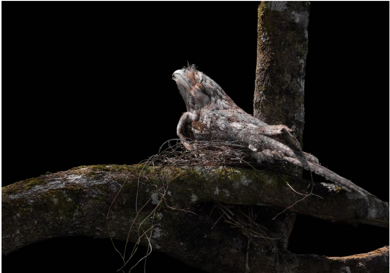
Papuan Frogmouth

As our cruise wasn't until 9am, we visited a special area north of Heritage Lodge for one big target. Luckily, upon arrival I heard three of the stunning migratory Buff-breasted Paradise Kingfishers calling from just feet away. A little bit of sneaking later and we got some great looks at this papuan species. Here we also saw a stunning Wompoo Fruit Dove in some stunning golden light. After we crossed the ferry into Daintree Village we ventured down Steward Creek Road . This bit of rainforest is often quite good. We struck gold quickly with a great group of Lovely Fairywren, Rufous Shrikethrush, and Yellow-spotted Honeyeater .