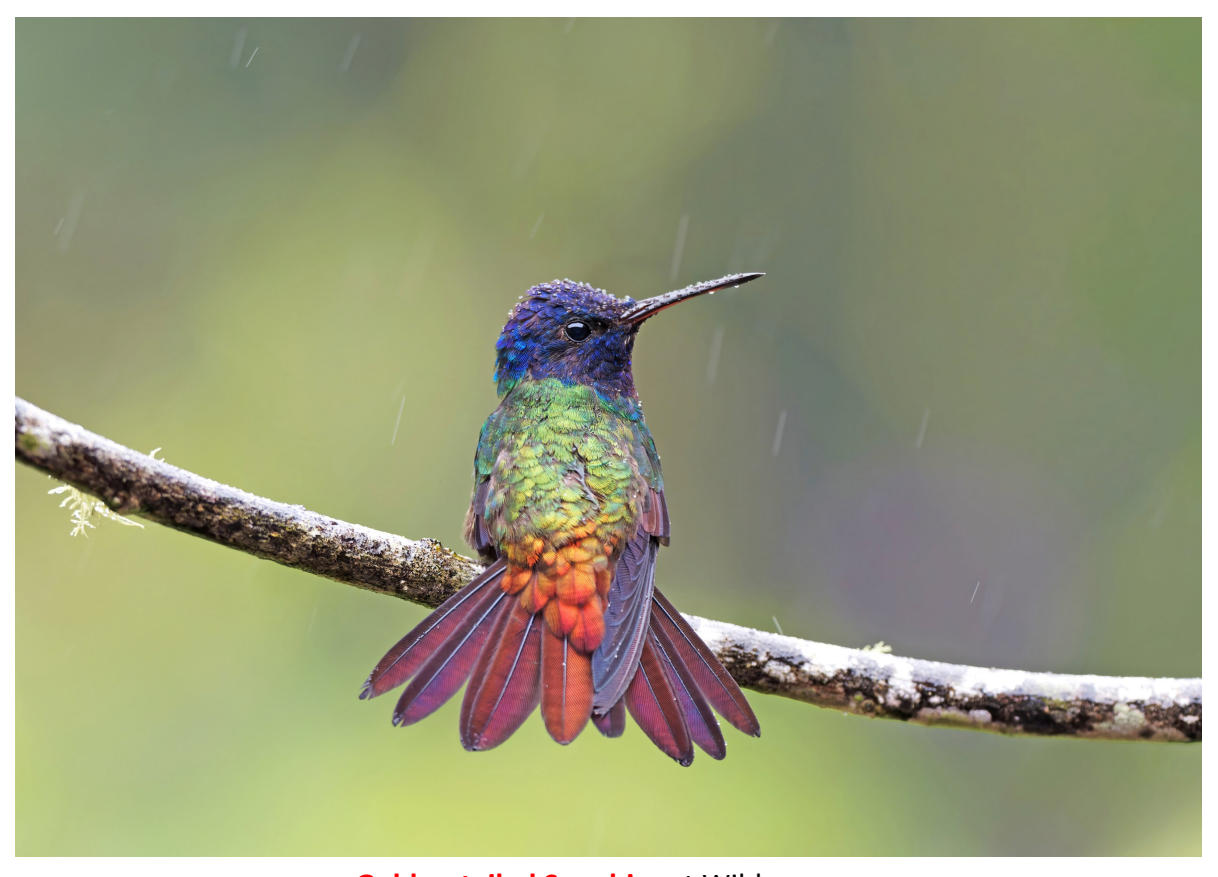
Golden-tailed Sapphire at Wildsumaco

An eclectic mix of hummingbird species also visited the porch feeders, an captivated us for some time; Peruvian Racket-tail, Brown Violetear, Many-spotted Hummingbird, Fork-tailed Woodnymph, Golden-tailed Sapphire (photo below), Green-backed Hillstar, Black-throated Mango, Napo Sabrewing, Violet-fronted Brilliant, Green Hermit, Violet-headed Hummingbird, Gould's Jewelfront and the stunning Wire-crested Thorntail were all seen either at the feeders or in the lodge garden.