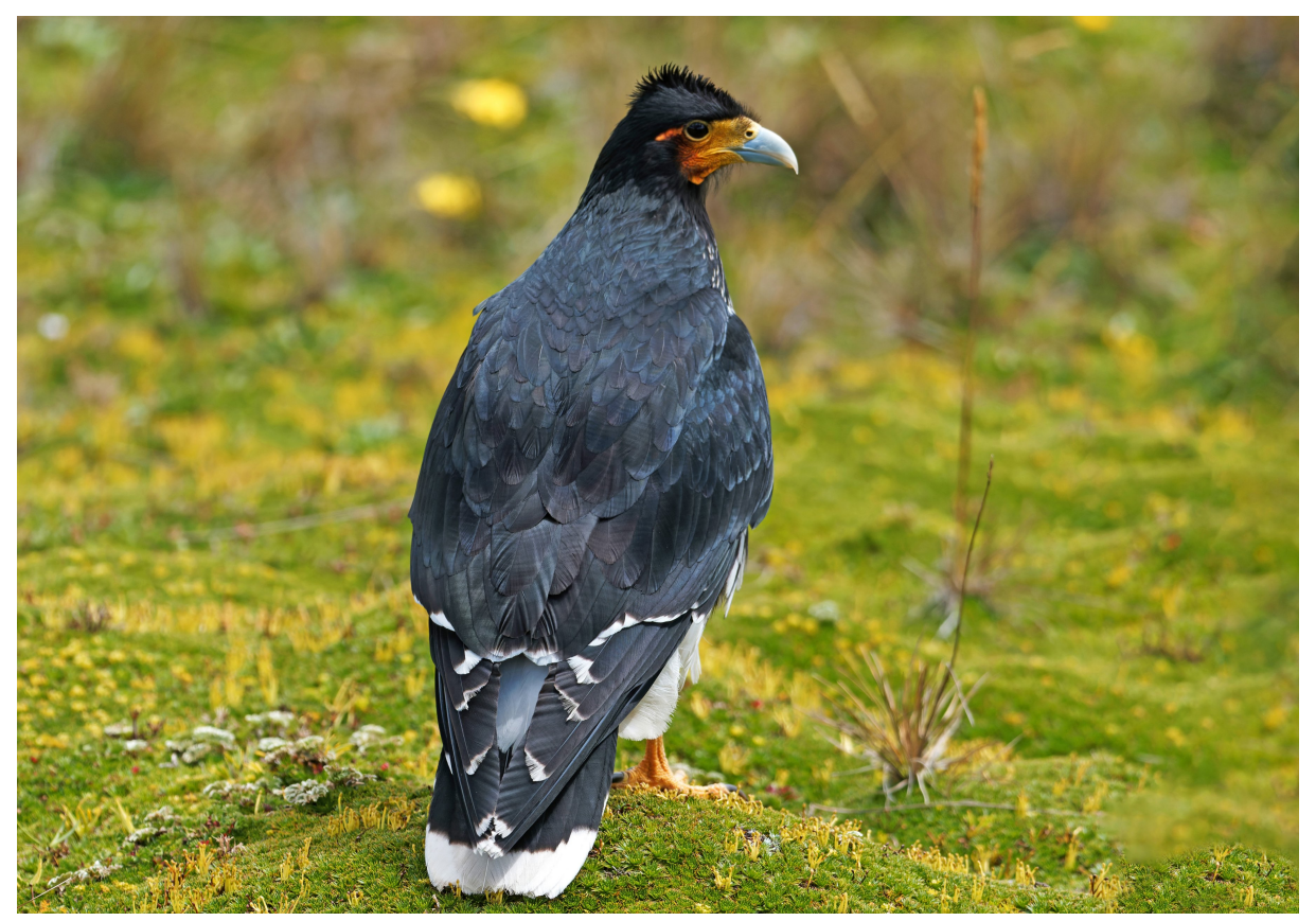
Carunculated Caracara at Antisana National Park

This tour was the second part of the Hummingbird Extravaganza that focused on the east side of the northern Andes. The previous night was spent in Puembo , conveniently placed for our visit to Antisana, which lies to the east of Ecuador's capital, Quito . Near the entrance to the park smoke from a local fire threatened to derail our plan to enter the park. However, the smoke lifted, and we entered Antisana as planned after all. This high Andean, open country, park provided us with some easy opening birding with typical highland species like Stout-billed and Chestnut-winged Cinclodes , Black-billed Shrike-Tyrant , Plumbeous Sierra-Finch , Andean Tit-Spinetail , and Streak-backed Canastero all being found during this opening spell. We also saw a series of raptors on the wing, including four Andean Condors , in addition to Variable Hawk and Black-chested Buzzard-eagle . These were all seeing as we drove up the road ever higher. Once we reached the open plateau, we added a series of other highland species, most notably, Carunculated Caracara ( photo above ), Andean Lapwing , Andean Gull , Black-winged Ground-Dove and the endangered Andean Ibis for which the site is famous for.