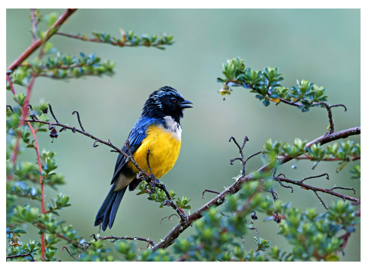
Buff-breasted Mountain-Tanager from Papallacta Hot Springs & Green-backed Hillstar at Las Brisas