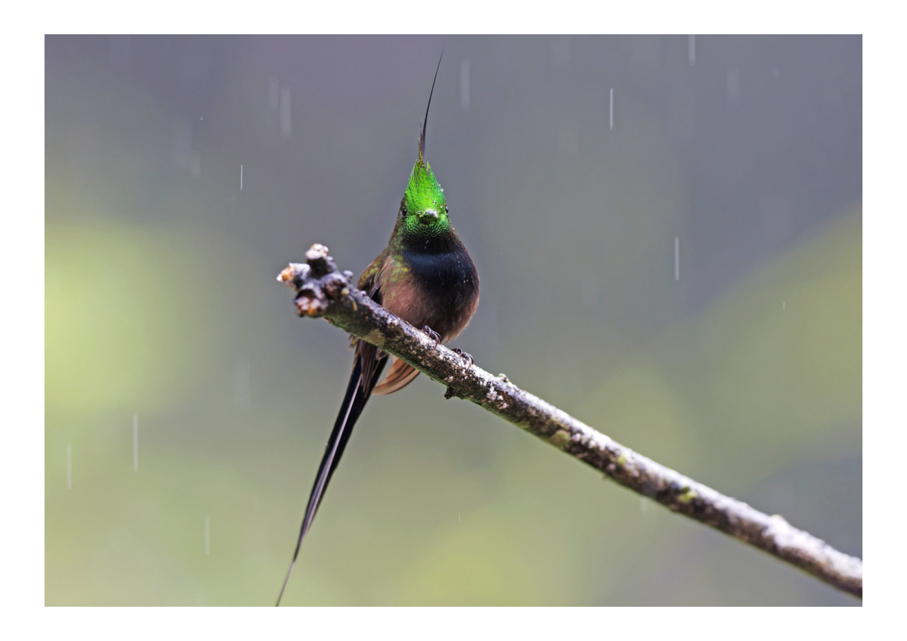
Wire-crested Thorntail at Wildsumaco

Among the non-hummingbirds there was plenty to admire too, and the ones highlighted by the group at the end included Green-backed Trogon, Torrent Duck, Andean Pygmy-Owl, Carunculated Caracara, Gray-breasted Mountain-Toucan, Golden-crowned Tanager, Andean Lapwing, Plain-backed Antpitta, Band-bellied Owl, and fittingly too, Ecuador's national bird, the huge Andean Condor .