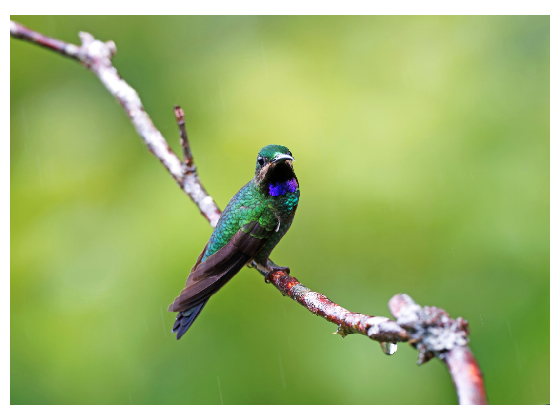
Black-throated Brilliant from Amaru Pacha