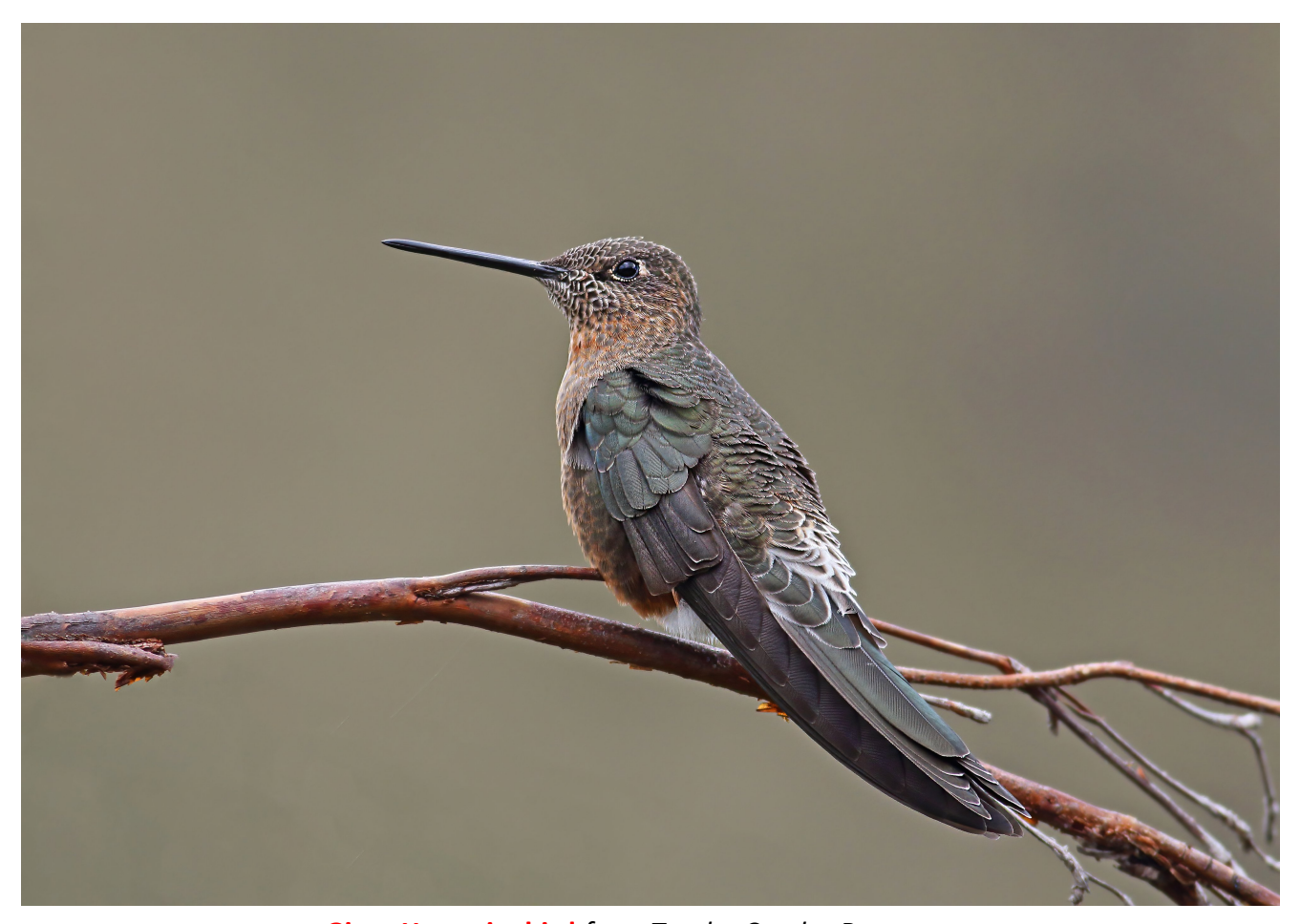
Giant Hummingbird from Tambo Condor Restaurant