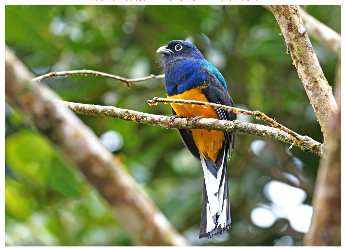
Green-backed Trogon from Wildsumaco Lodge