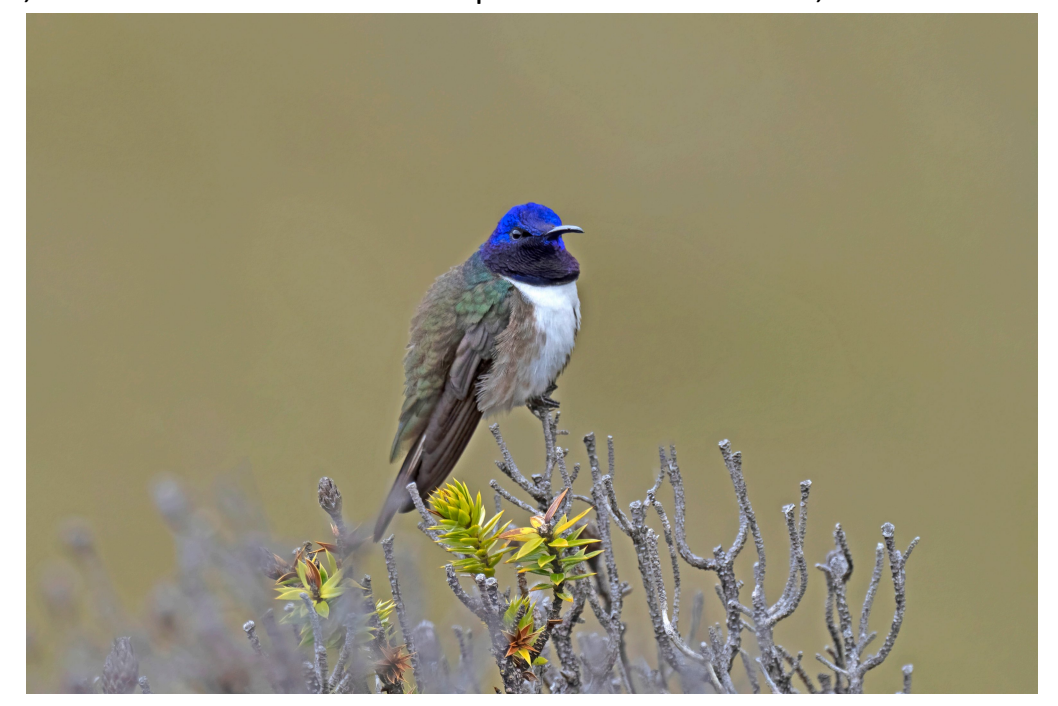
Ecuadorian Hillstar from Cayambe-Coca National Park.

The day's birding opened in the hotel garden, set within wonderful high Andean scenery. This enabled us to see Grass Wren , Spectacled Redstart and a handsome Buff-breasted Mountain-Tanager . We then took breakfast at the hotel before driving a little higher up into the paramo within Cayambe-Coca National Park . Our star find there was a dreamy male Ecuadorian Hillstar ( photo below ), though we also managed to see White-chinned Thistletail , Scarlet-bellied Mountain-Tanager , and Tawny Antpitta . In an area of polylepis woodland, the highest growing trees on Earth, we were fortunate to find a specialist of this habitat, a handsome Giant Conebill .