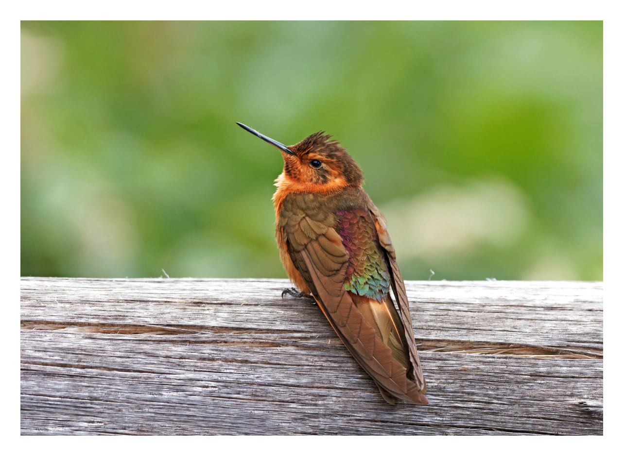
Shining Sunbeam at Tambo Condor

We took lunch at a local café ( Tambo Condor ), where some special hummingbirds were also in attendance too. However, the most unexpected sighting was a Spectacled Bear walking up the slope opposite the restaurant! On the hummingbird front, Shining Sunbeams ( photo below ), were the most visible, and competed with Tyrian Metaltail , Black-tailed Trainbearer , Sparkling Violetear , Great Sapphirewing and the enormous, starling-sized, Giant Hummingbird for a place at the feeders. After a wonderful local lunch with hummingbirds in attendance, we drove to Papallacta Hot Springs where we spent the night, with private hot tubs steaming just outside of our rooms!