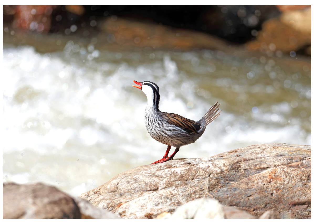
Torrent Duck at Guango Lodge