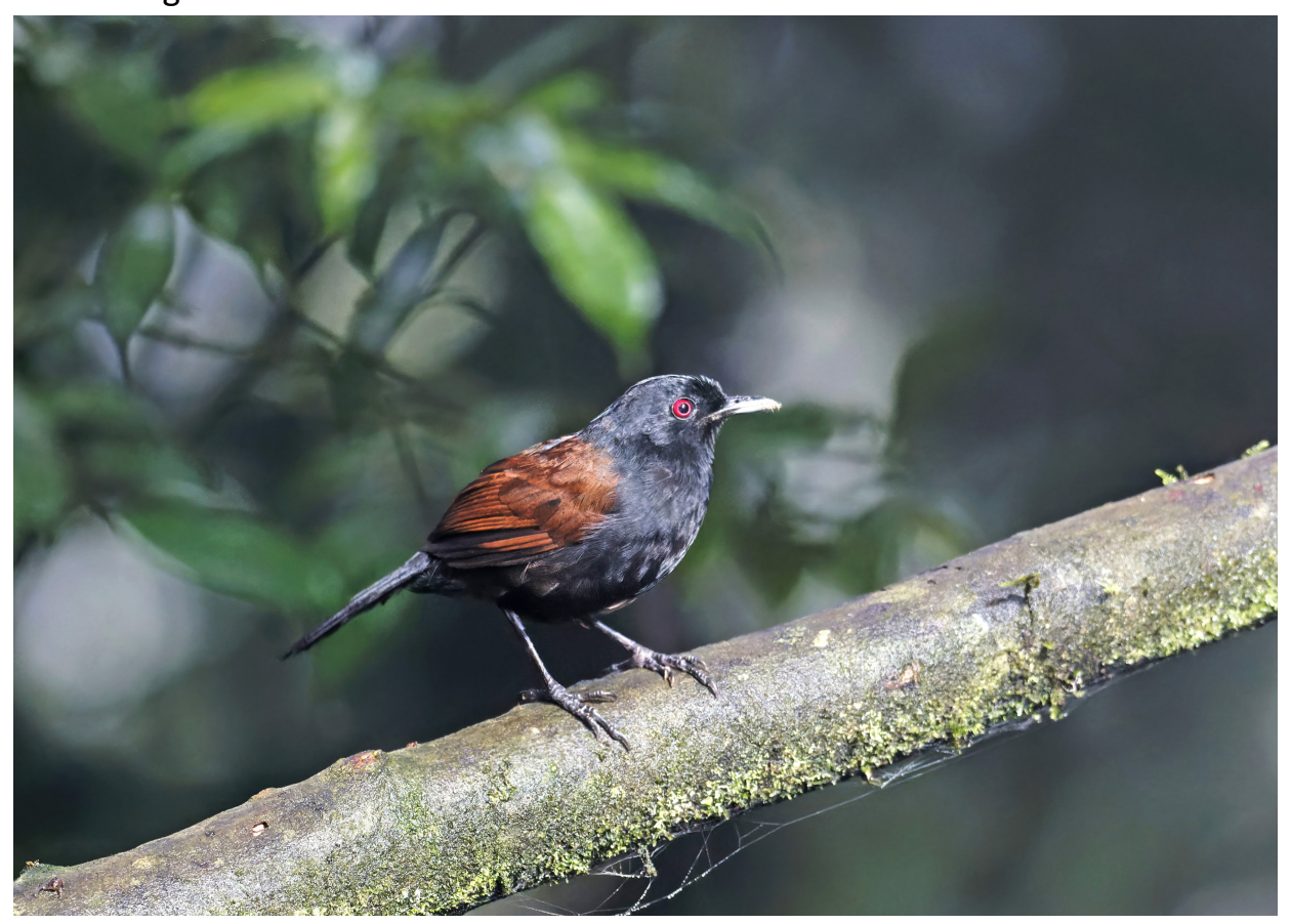
Western Fire-eye female at Wild Sumaco

While most people reveled in the hummingbird photography, we also picked up some other birds on the property, like Montane Foliage-Gleaner , Variegated Bristle-Tyrant , Barred Becard , Fulvous-breasted Flatbill and the striking Red-headed Barbet . After that, we continued our journey to WildSumaco Lodge , breaking this with a stop in Pachakutik community to view a family of roosting Band-bellied Owls .