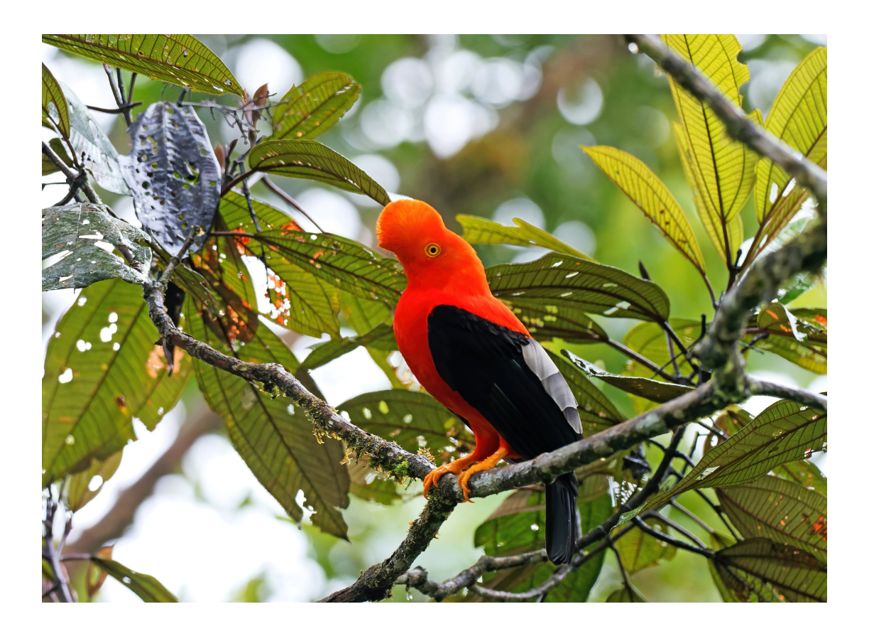
Andean Cock of the Rock from Amaru Pacha

This was the final day of Part 2 of the Hummingbird Extravaganza , and we started out by visiting nearby Amaru Pacha Reserve, close to the lodge. The star there was not a hummingbird but Andean Cock-of-the-rocks, half a dozen or more males of which were seen displaying there in spectacular fashion. They also had some interesting hummingbird feeders on the property, that held Black-throated Mango, Long-billed Starthroat, Violet-headed Hummingbird, Glitteringthroated Emerald, Black-throated Brilliant, Many-spotted Hummingbird and Great-billed Hermit. After that, we returned to WildSumaco for one final lunch meal, afterwhich we packed up and drove back to Quito. Some final birding around the veranda at the lodge gave us Yellowthroated Toucan, Green-backed Trogon and a group of Many-banded Aracaris. There was little of note on the journey back aside from a soaring Black-and-chestnut Eagle, which was a very fortunate find, and nice final bird for the tour!