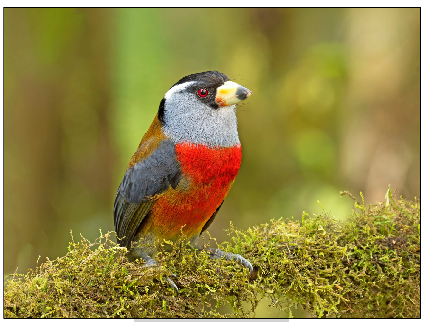
Toucan Barbet at Tandayapa Bird Lodge

For the remainder of the afternoon, we birded the lodge property for a while and along the road nearby, where we came across Tropical Parula , Golden and Golden-naped Tanagers , Gray-breasted Wood-Wren , Crimson-rumped Toucanet , Blue-winged Mountain-Tanager , Flavescent Flycatcher , Golden-headed Quetzal and ended the day by seeing a very cooperative Cloud-forest Pygmy-Owl .