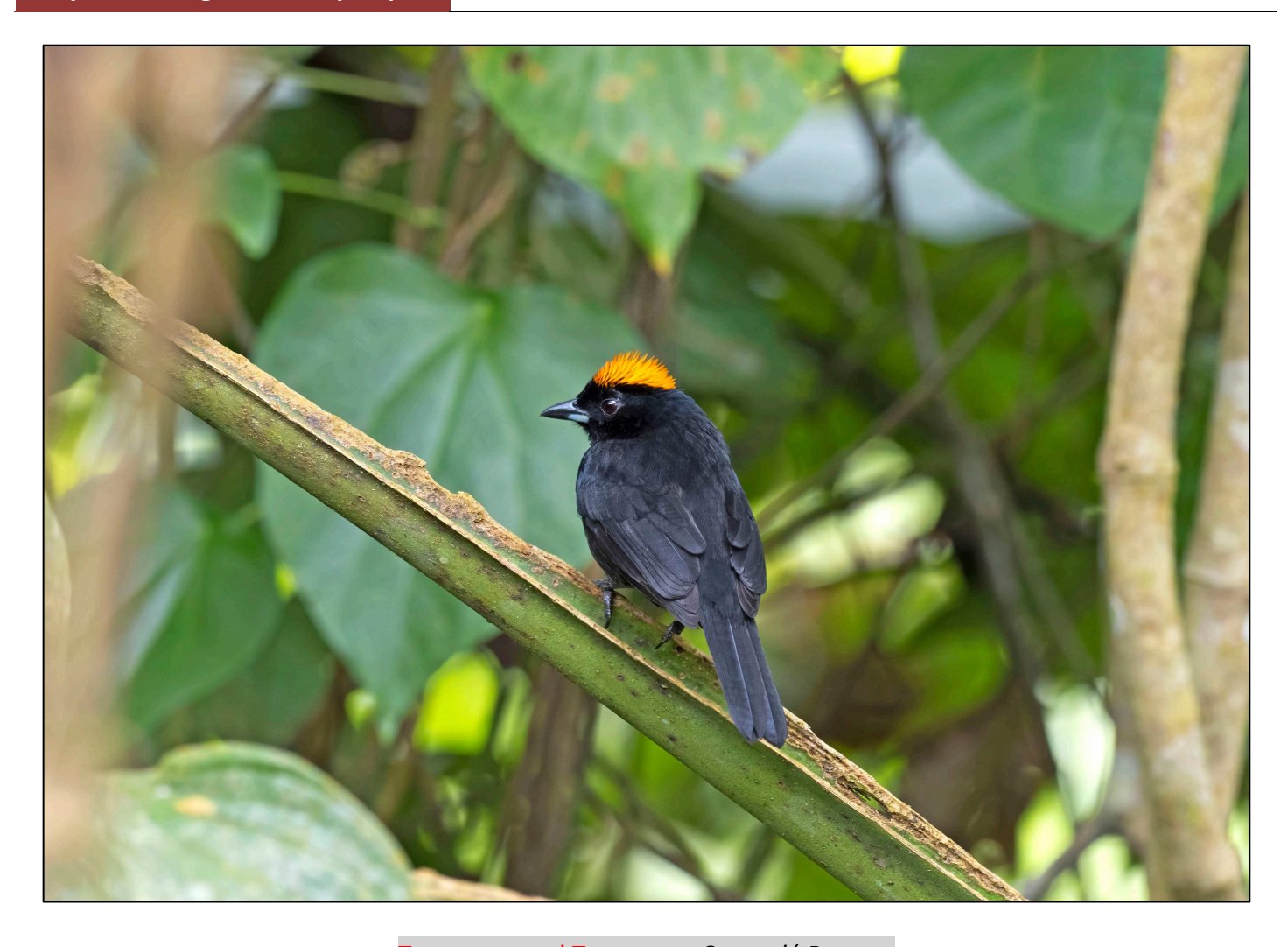
Tawny-crested Tanager at Canandé Reserve