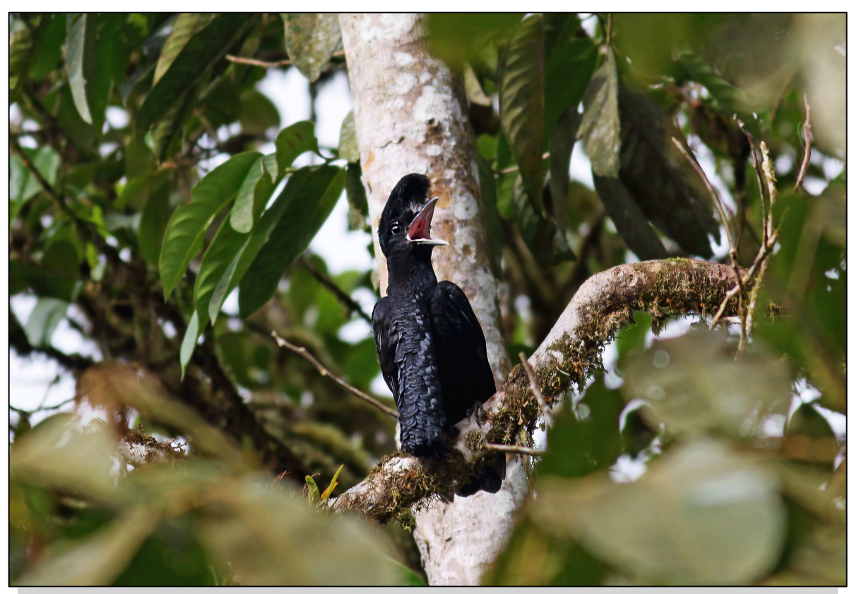
Long-wattled Umbrellabird from 23 de Junio (top) & Crested Owl at Kapari Lodge (below)