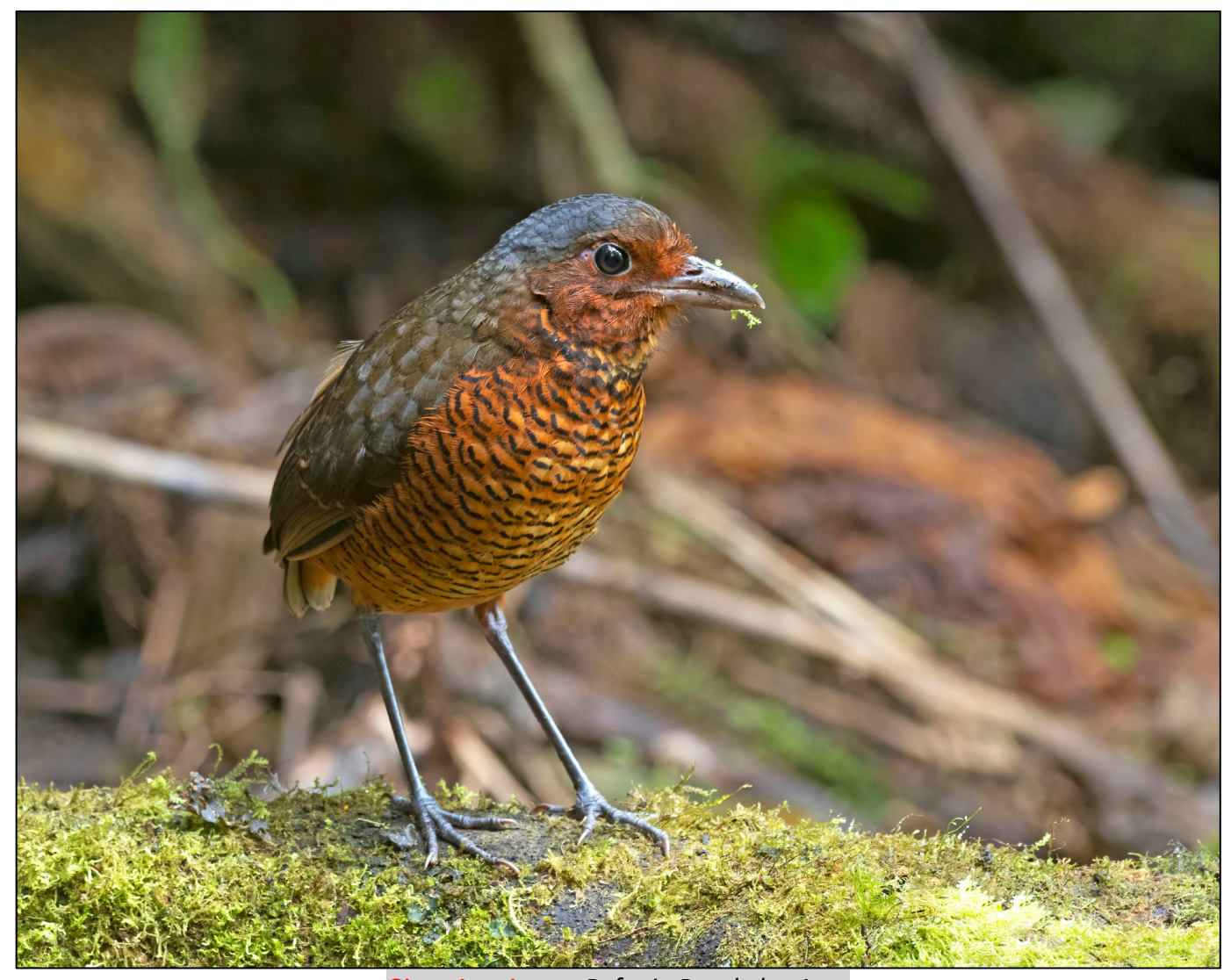
Giant Antpitta at Refugio Paz de las Aves

In the surrounding area we also found Mountain Wren, Brown-capped Vireo, White-winged Brushfinch and the scare Tyrannine Woodcreeper . We returned to Tandayapa for lunch.