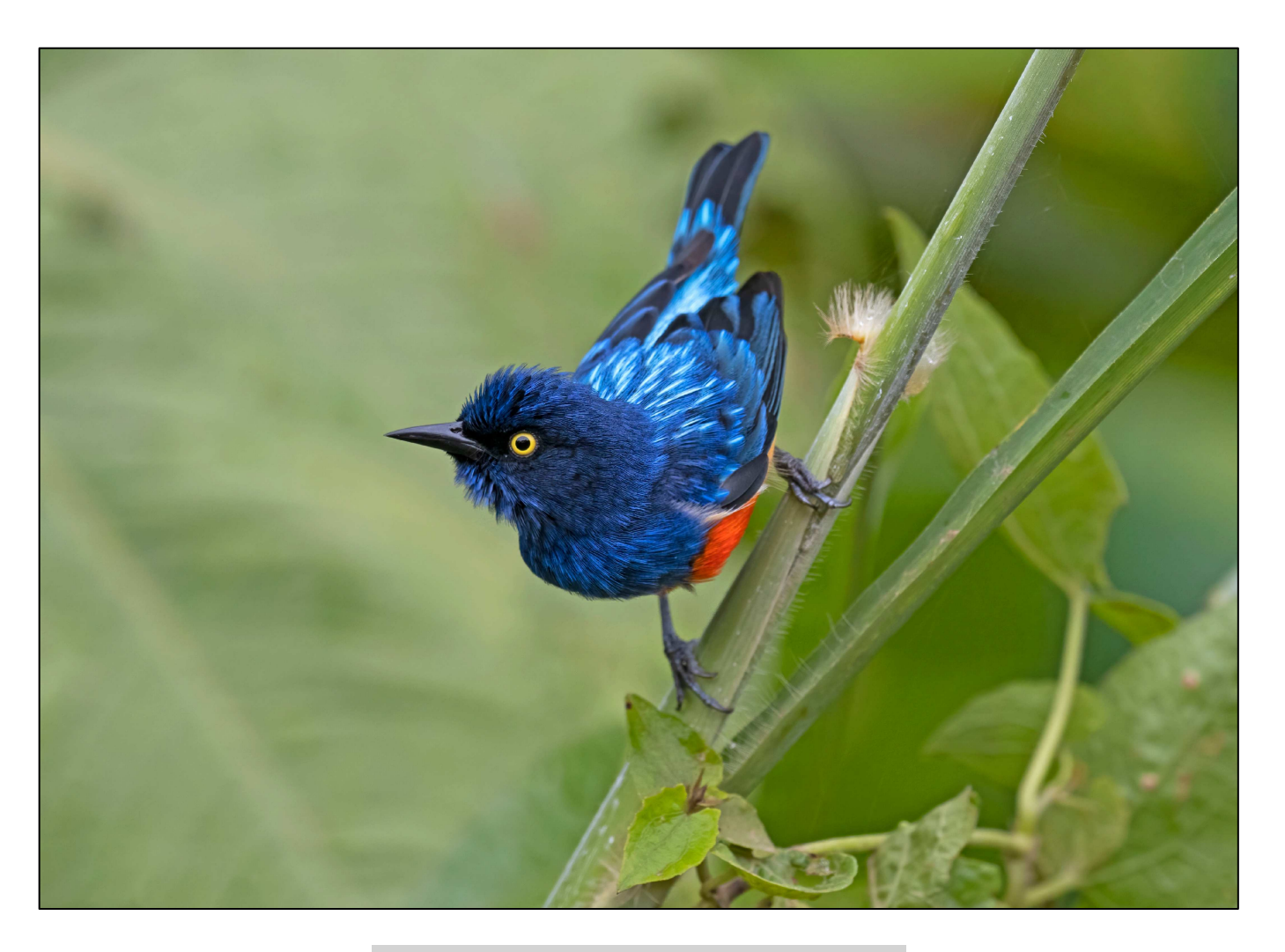
Scarlet-breasted Dacnis from Canande Reserve