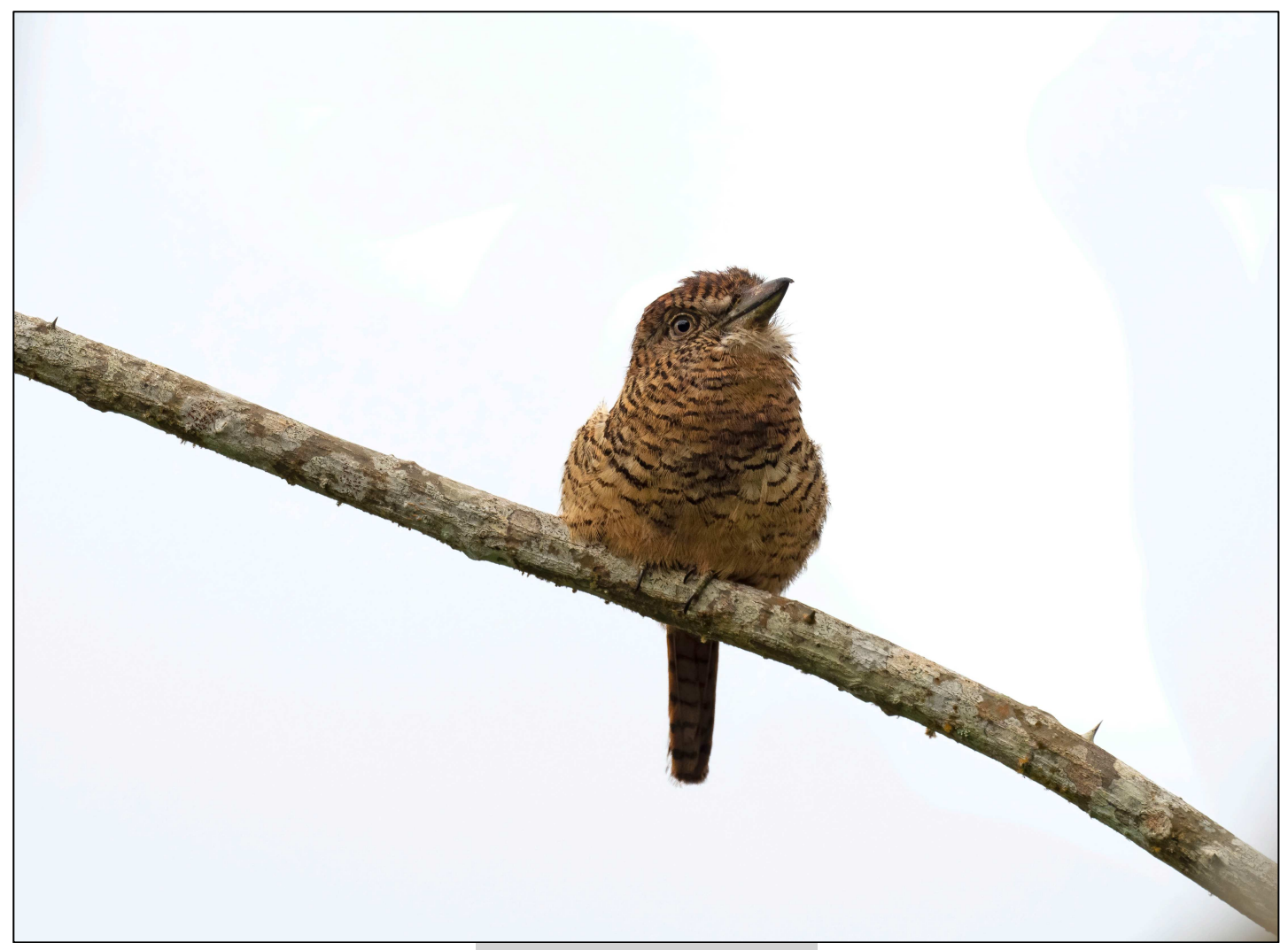
Barred Puffbird from Silanche

Before taking our field lunch there was time for some trail walking, which turned up Chestnut-backed Antbird, Checker-throated Stipplethroat and the vociferous Purple-throated Fruitcrow. After lunch, we birded the roadf nearby and got Sooty-headed and Yellow-crowned Tyrannulets, White-bearded Manakin, the monotypic Dusky-faced Tanager, Streak-headed Woodcreeper, the bizarre looking Red-billed Scythebill and Great and Black-crowned Antshrikes. We made a quick stop at Rancho Suamox too but did not find anything we had not already seen. At the end of the day we checked into Kapari Lodge, where we had some successful night birding with a Choco Screech-Owl before dinner and a late afternoon Brown-throated Three-toed Sloth before that.