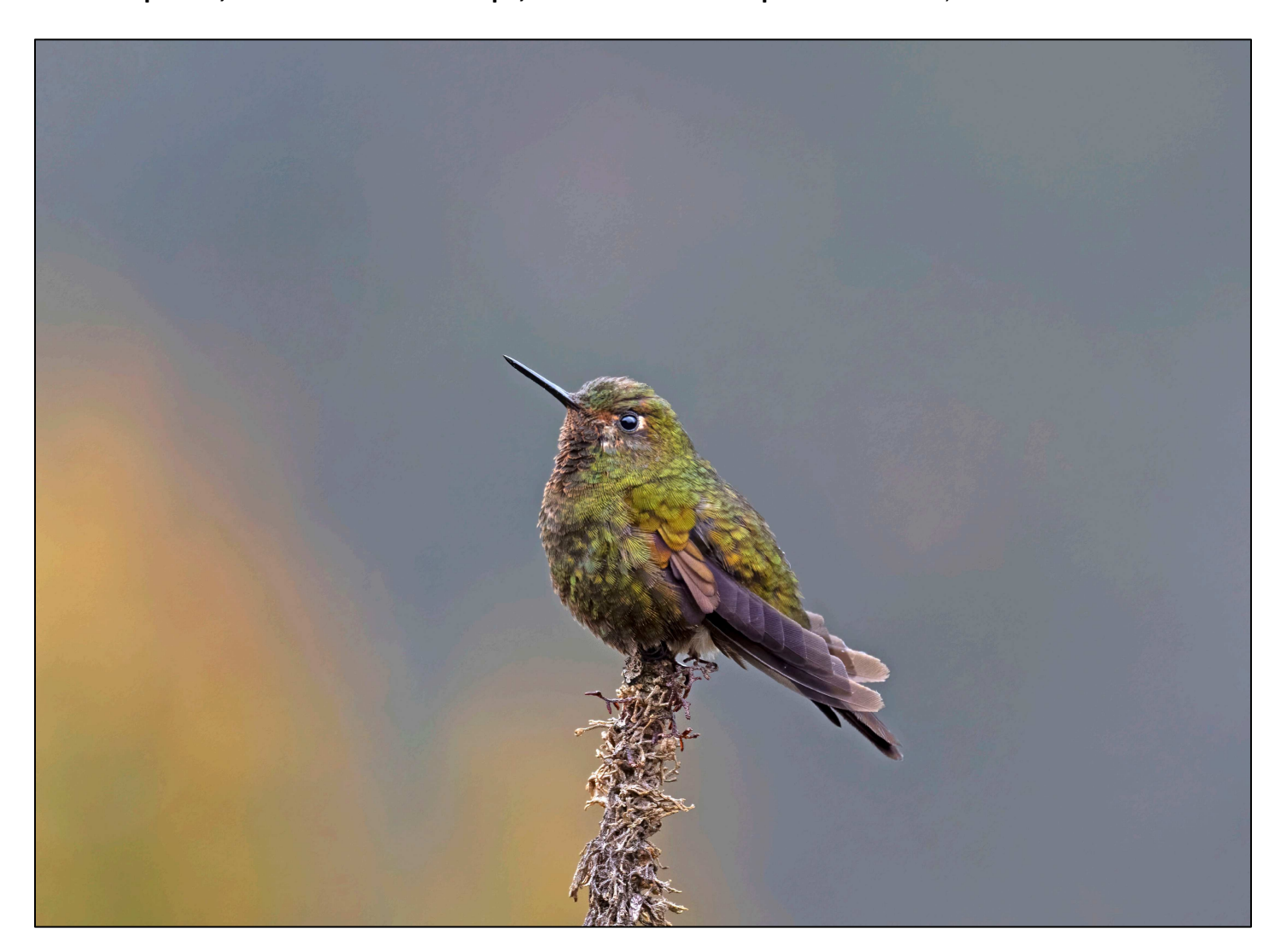
Viridian Metaltail at Cayambe-Coca National Park

In this trip of some two weeks we recorded more than 450 species, with the most popular being Scarlet-breasted Dacnis, Andean Condor, Scarlet-and-white Tanager, Ocellated Tapaculo, Long-wattled Umbrellabird, Giant Antpitta, Cloud-forest Pygmy-Owl, Guayaquil Woodpecker, Moustached Antpitta, Giant Hummingbird, Lita Woodpecker, Rufous-bellied Seedsnipe, Montane Woodcreeper and the cute, White-booted Racket-tail.