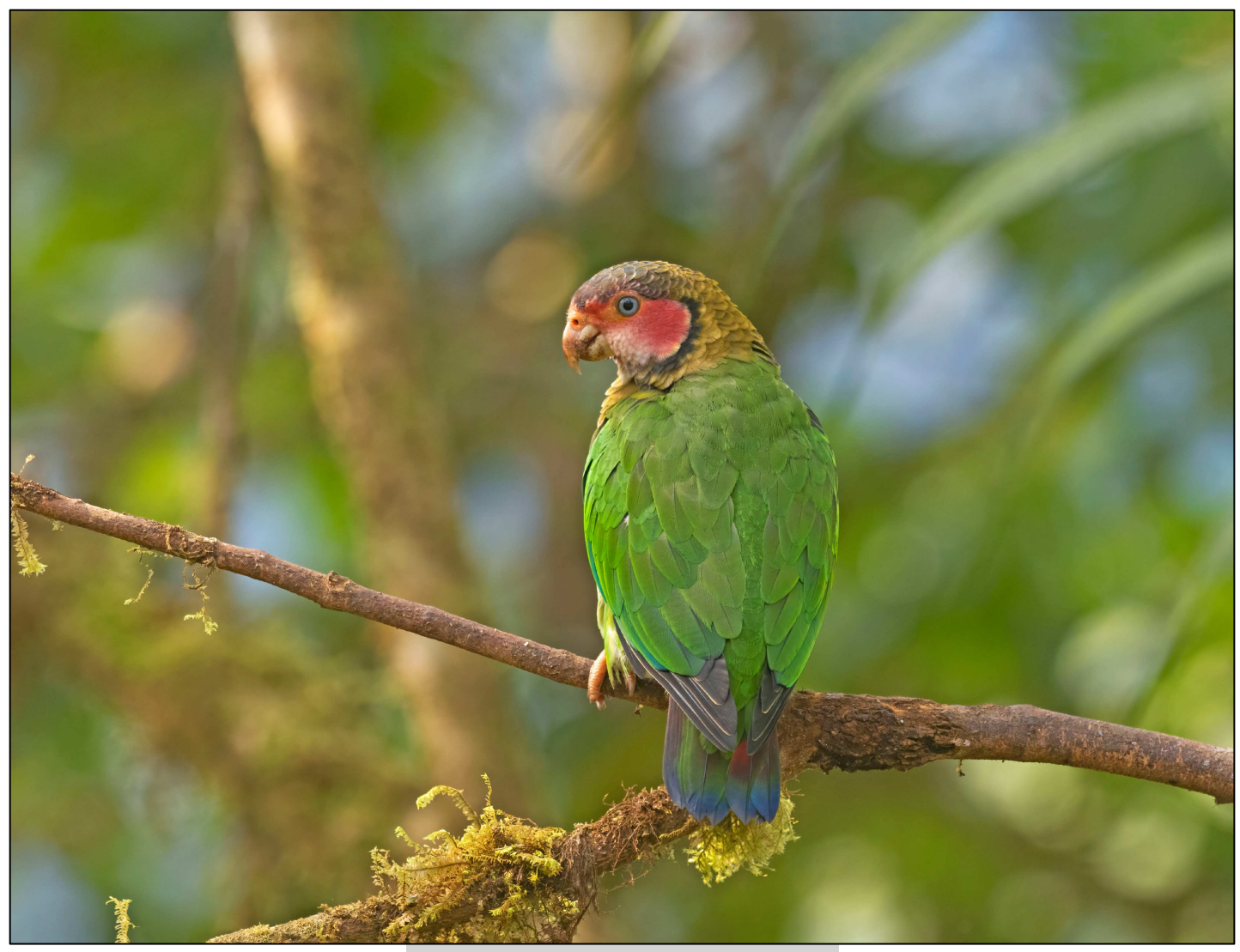
Rose-faced Parrot at Amagusa Reserve

We birded the road near the reserve for the rest of the morning. We encountered a small feeding flock with Pacific Tuftedcheek, Barred and Cinnamon Becards, Tricolored Brushfinch, Golden-collared Honeycreeper, Red-faced Spinetail, Smoky-brown Woodpecker, Orange-breasted Fruiteater and Indigo Flowerpiercer. We also got some difficult species there, like the scarce Olive Finch and another Chocó specialty, Esmeraldas Antbird. We took our lunch in the field and then birded the Lower Mashpi Road for the remainder of the day, which runs below the reserve and passes through some very good forest patches, that held Russet Antshrike, Golden-olive Woodpecker, One-colored and Black-and-white Becards, Bay Wren, Slaty-capped Shrike-vireo, Rufous-rumped Antwren, and Purple and Green honeycreepers.