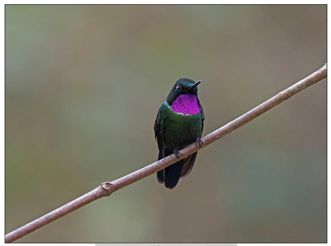
Gorgeted Sunangel from Choco Birds Reserve

Before breakfast, we walked to a forest blind, around ten minutes from the lodge. A Streak-capped Treehunter was seen there, and in the same area we also noted Ochre-breasted Antpitta, Scaled Fruiteater and Pale-eyed Thrush. We then returned to the lodge for breakfast, and while we ate added further species right around the building, like Chestnut-capped Brushfinch Thick-billed and Orange-bellied Euphonias, an elegant Rufous Motmot, and a striking Choco endemic Toucan Barbet. After breakfast we drove the short distance to the top of the Tandayapa Valley, and birded along a quiet dirt road, where we found Spillman's Tapaculo, Russet-crowned Warbler, White-tailed Tyrannulet, Cinnamon Flycatcher, Sierran Elaenia, Azara's Spinetail, Montane Woodcreeper, Sharpe's Wren, Dusky Chlorospingus, Gorgeted Sunangel, Flame-faced and Beryl-spangled Tanagers, Streaked Tuftedcheek, and Turquoise Jay. We found a bunch of White-collared Swifts with the rare Spot-fronted Swift among them too. After a a productive morning we returned to the lodge for lunch.