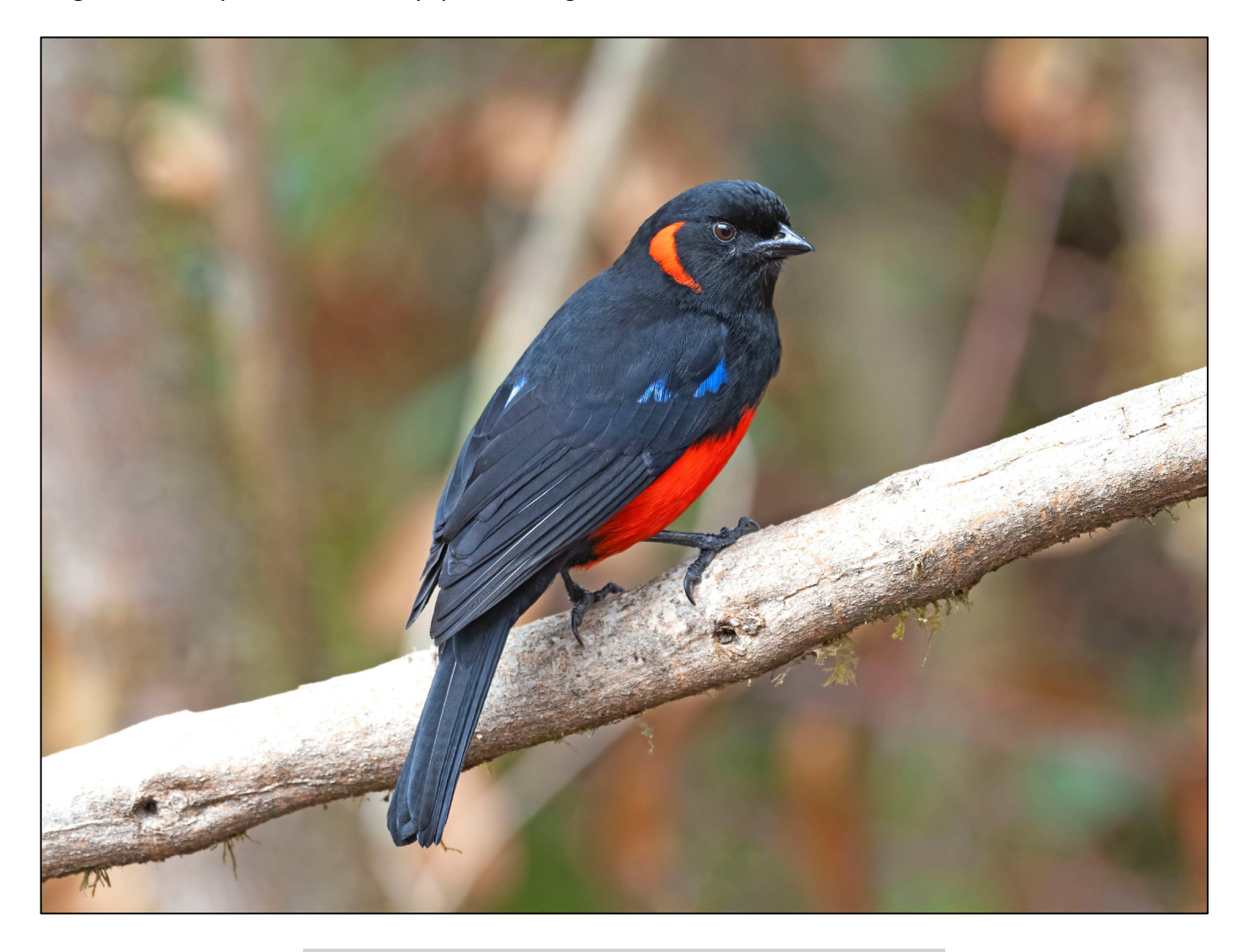
Scarlet-bellied Mountain-Tanager from Yanacocha Reserve

After a delicious lunch at the reserve we headed down towards Tandayapa, birding along the Old Nono-Mindo Road along the way with the limited time remaining. Along the upper section of this road we found Buffbreasted Mountain-Tanager, Plain-tailed Wren, Pearled Treerunner, and White-throated, Tawny-rumped and White-banded Tyrannulets. Further down the same road we found the colorful Crimson-mantled Woodpecker, Masked Trogon, Streak-headed Antbird, a few Chestnut-bellied Chat-Tyrants, and the striking White-winged Tanager. We finally arrived at Tandayapa Bird Lodge close to dusk.