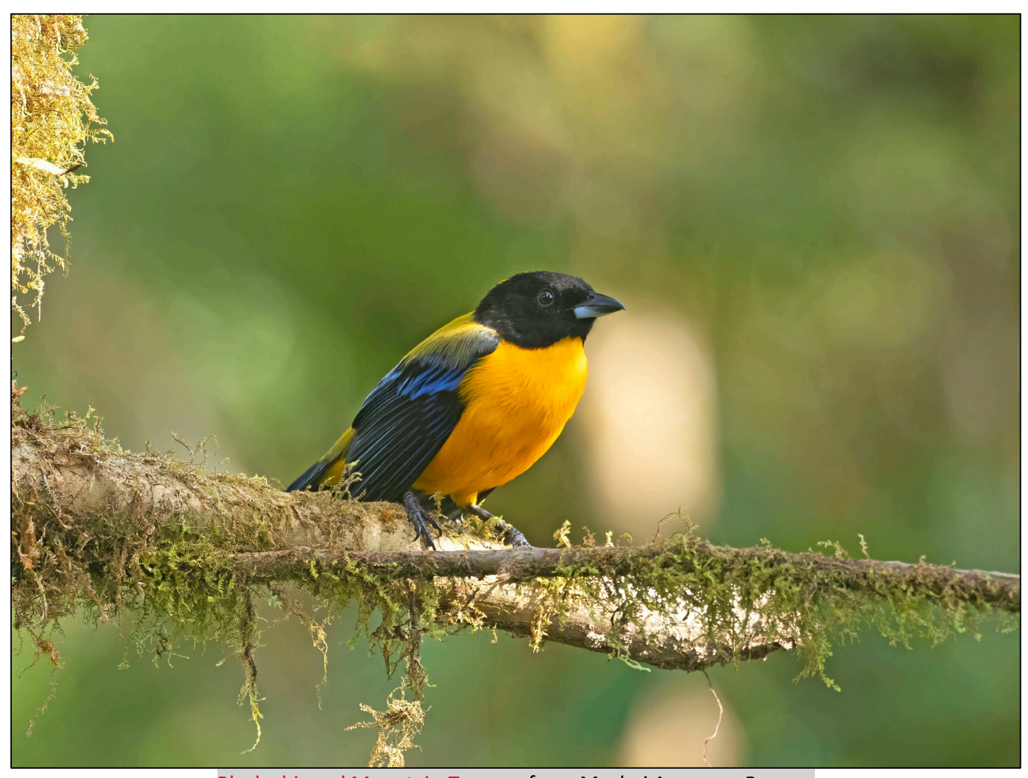
Black-chinned Mountain-Tanager from Mashpi Amagusa Reserve