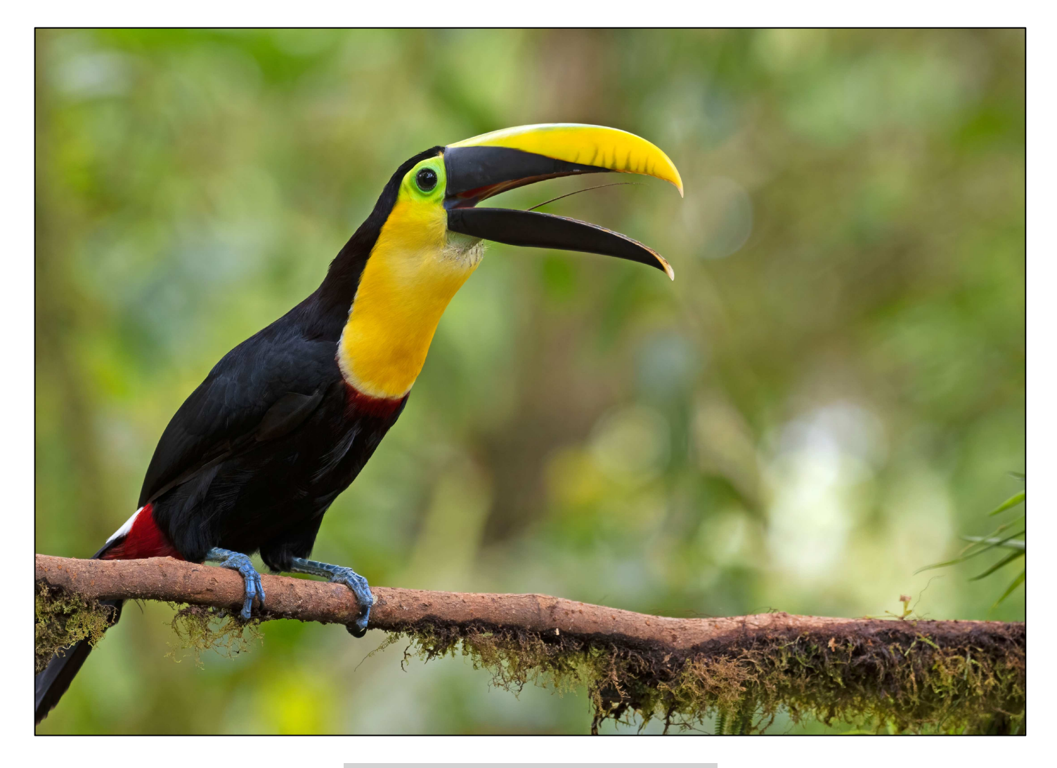
Chocó Toucan from Milpe Bird Sanctuary

After lunch at the wonderful Mirador Rio Blanco restaurant in Los Bancos, we visited nearby Milpe Bird Sanctuary. The first things of note were at the feeders, where Green Thorntail, White-necked Jacobin, Whitewhiskered Hermit, Green-crowned Brilliant and the spectacular Crowned Woodnymph were coming to the hummingbird feeders, and Collared (Pale-mandibled) Aracari, Orange-bellied Euphonia, Silver-throated Tanager and Orange-billed Sparrow were at the other feeders. We used our time after that to walk trails within the reserve, finding the melodious Speckled Nightingale Thrush hopping beside the trail, and further on we located Choco Toucan, and Golden-winged and Club-winged Manakins. We also encountered some feeding flocks whilst continuing further along the forest trail, which held Slaty Antwren, Choco Warbler, Striped Woodhaunter, Scaly-throated and Buff-fronted Foliage-Gleaners, Smoky-brown Woodpecker, Pale-vented Thrush, Ochre-breasted Tanager and a group of Yellow-collared Chlorophonias. We returned to Kapari Lodge for the night, finding another owl before dinner again, with Crested Owl this time!