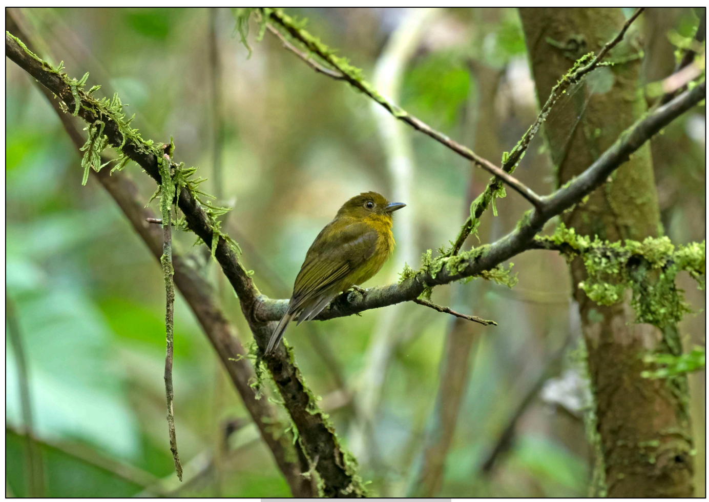
Sapayoa at Canandé Reserve

For much of the day we birded the trails behind the lodge, finding a cooperative Choco Tapaculo, Stripethroated Wren, a pair of Wattled Guan, Tufted Flycatcher, Rufous Piha, Dusky Pigeon, and Choco Manakin. We also got great views of shy birds like Spotted and Ocellated Antbirds, and Lita Woodpecker which took some effort to get it. Wonderful views were had of both male and female Scarlet-and-white Tanagers too. One of the biggest surprises for me was stumbling into the rare, monotypic Sapayoa within a small feeding flock.