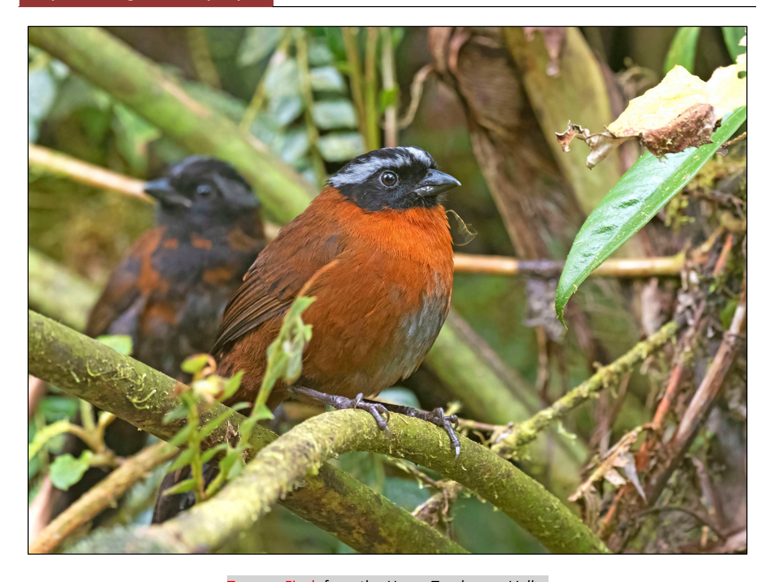
Tanager Finch from the Upper Tandayapa Valley