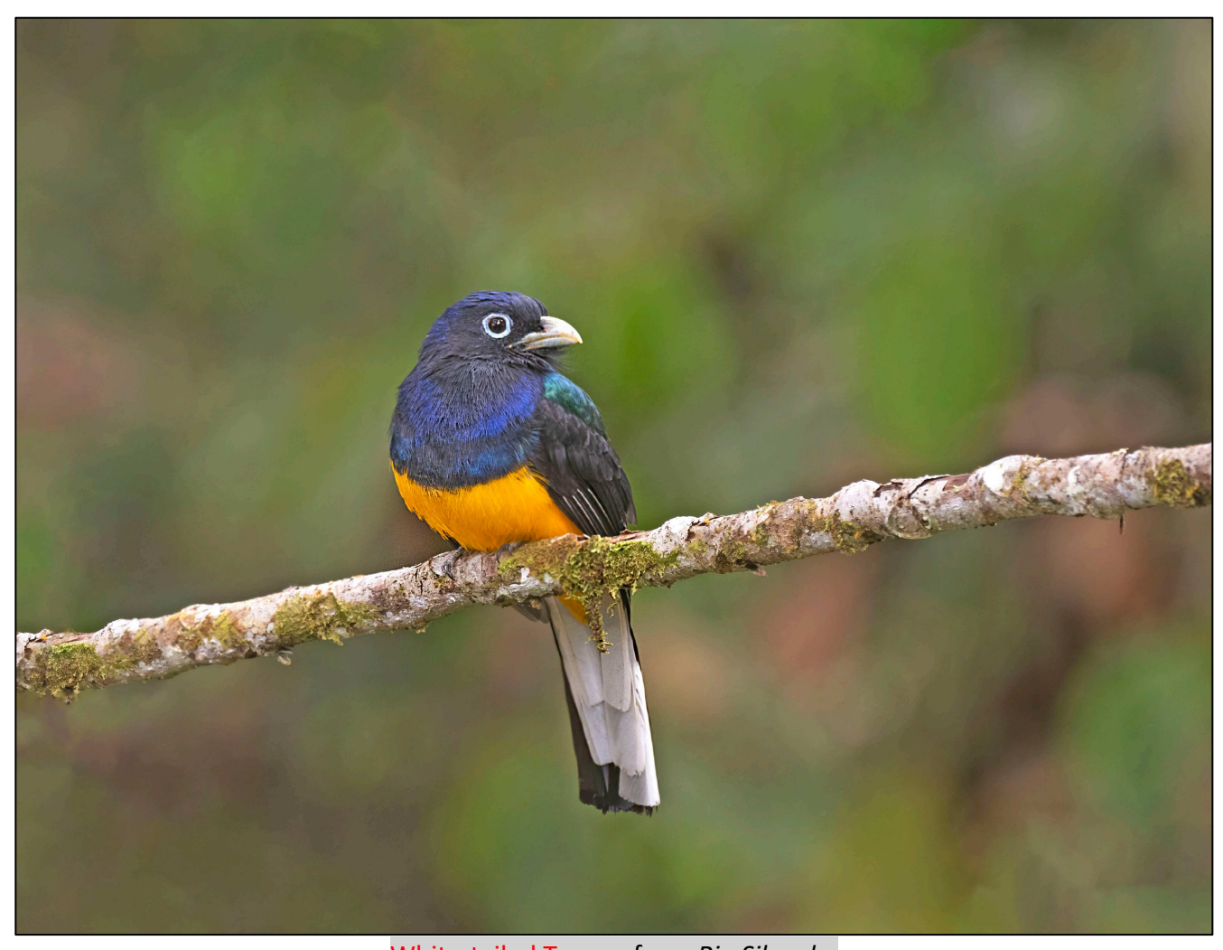
White-tailed Trogon from Rio Silanche