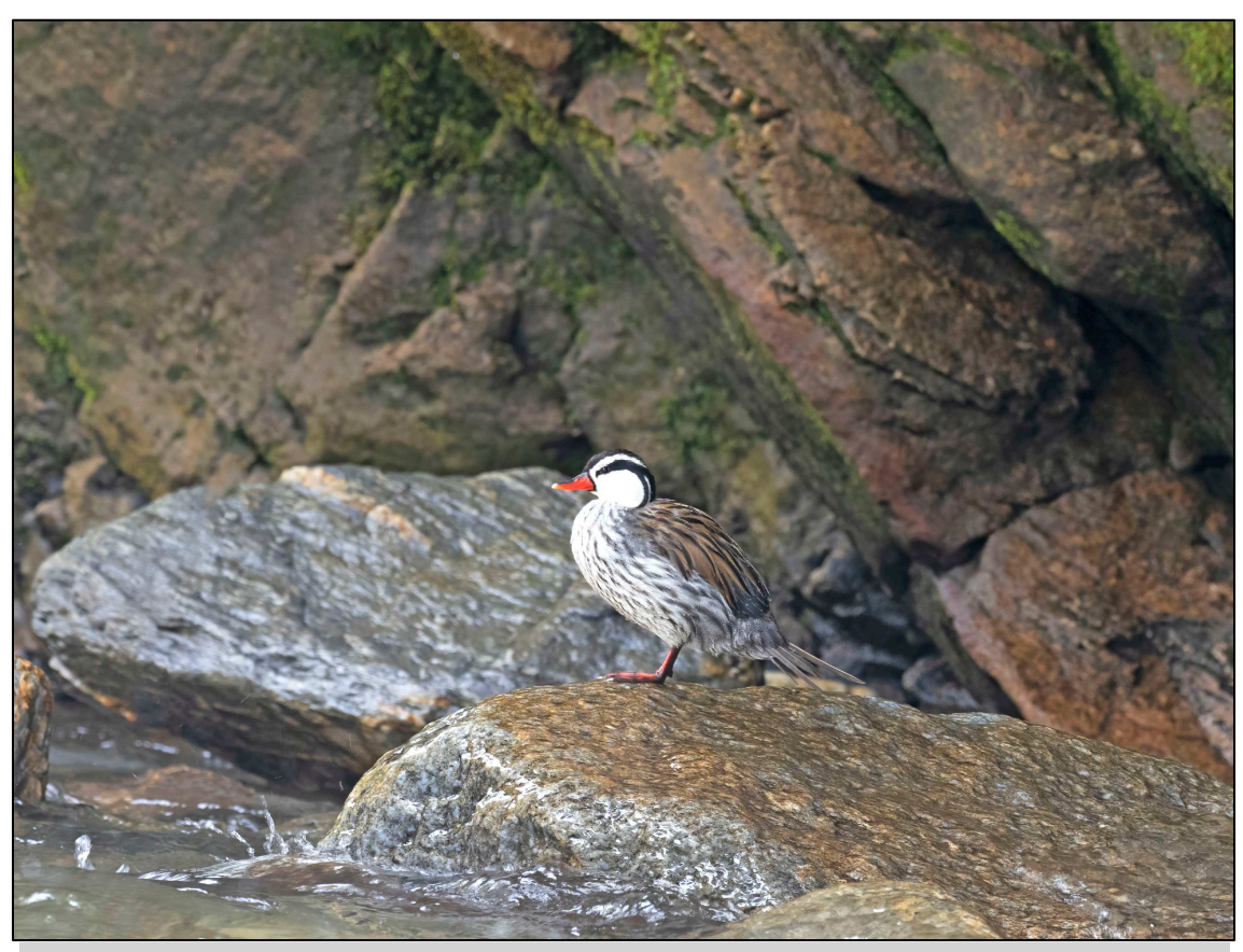
Torrent Duck at Guango Lodge (top) and Rufous-winged Tanager at Canande (bottom)