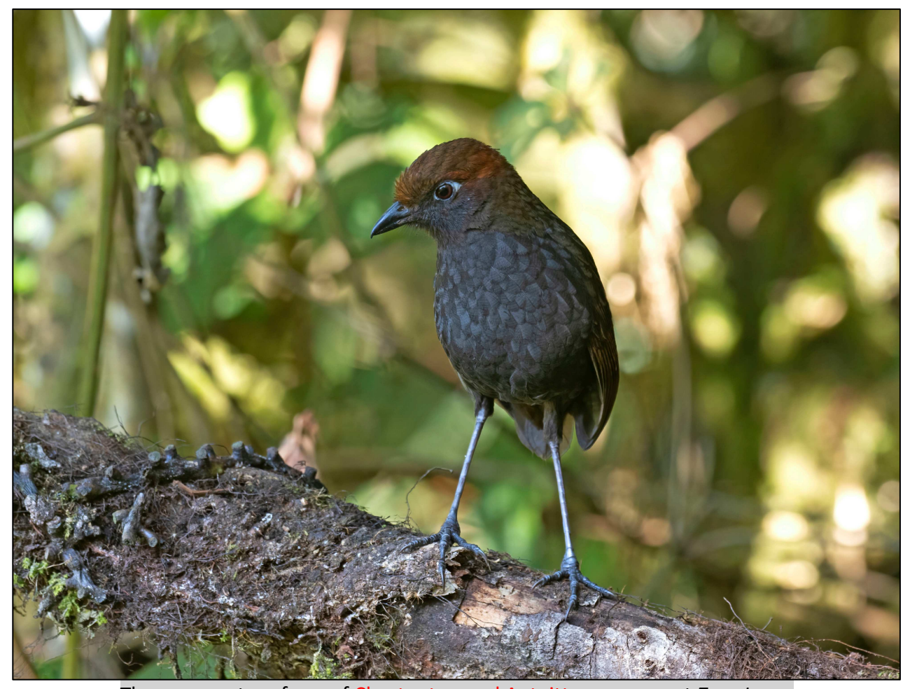
The rare western form of Chestnut-naped Antpitta was seen at Zuro Loma

After meeting up at our hotel in Quito during the morning, we were soon on our way, driving up higher into the Andes from there, starting out in nearby Zuro Loma Reserve . We arrived at this beautifully set up private reserve, and soon started seeing some temperate zone hummingbirds at their feeders, like Buff-winged Starfrontlet , Mountain Velvetbreast , Tyrian Metaltail , Black-tailed Trainbearer , Sparkling Violetear , and the bizarre looking Sword-billed Hummingbird . The same general area also produced Yellow-breasted and Gray-browed Brushfinches , Blue-capped Tanager , Hooded Mountain-Tanager , Glossy , Black and Masked Flowerpiercers , and a hulking Andean Guan . Surveying the wider area, we caught up with Red-crested Cotinga and Black-crested Warbler too . Just before we took to their trails, the owner of the reserve, Silvio, managed to lure out their main avian attraction, the shy Chestnut-naped Antpitta , which put in a good performance. Along the trail Silvio also attracted a pair of Equatorial Antpittas . Further along the same trail, we got Yellow-bellied Chat-Tyrant , Blackish and Ash-colored Tapaculos , and a singing Streak-throated Bush-Tyrant .