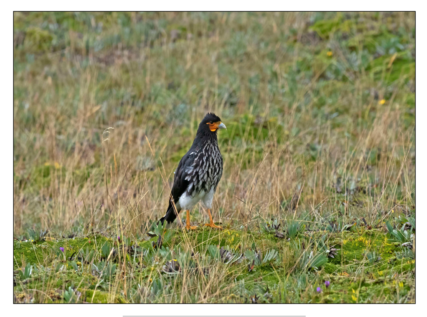
Carunculated Caracara at Antisana National Park

As soon as we got there, we began looking for our only really high-altitude target, Rufous-bellied Seedsnipe, finding it closer to the parking area after hiking far from there! We birded our way down from there, finding Andean Tit-Spinetail, White-chinned Thistletail, Many-striped Canastero, Variable Hawk, Blue-mantled Thornbill and Tawny Antpitta several times. That night, we checked into a wonderful nearby hotel with private hot springs on the grounds.