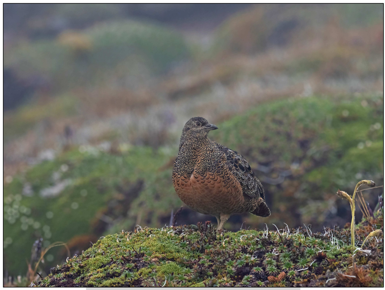
Rufous-bellied Seedsnipe at Cayambe-Coca National Park