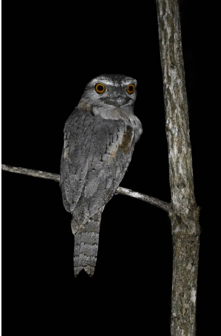
Tawny Frogmouth