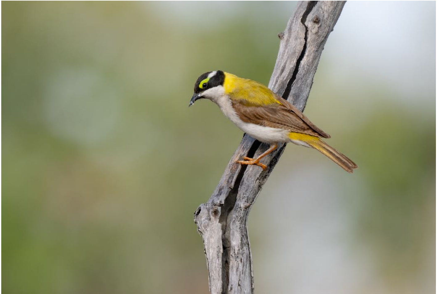
Black-chinned Honeyeater