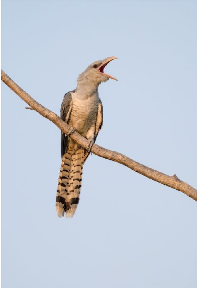
Channel-billed Cuckoo