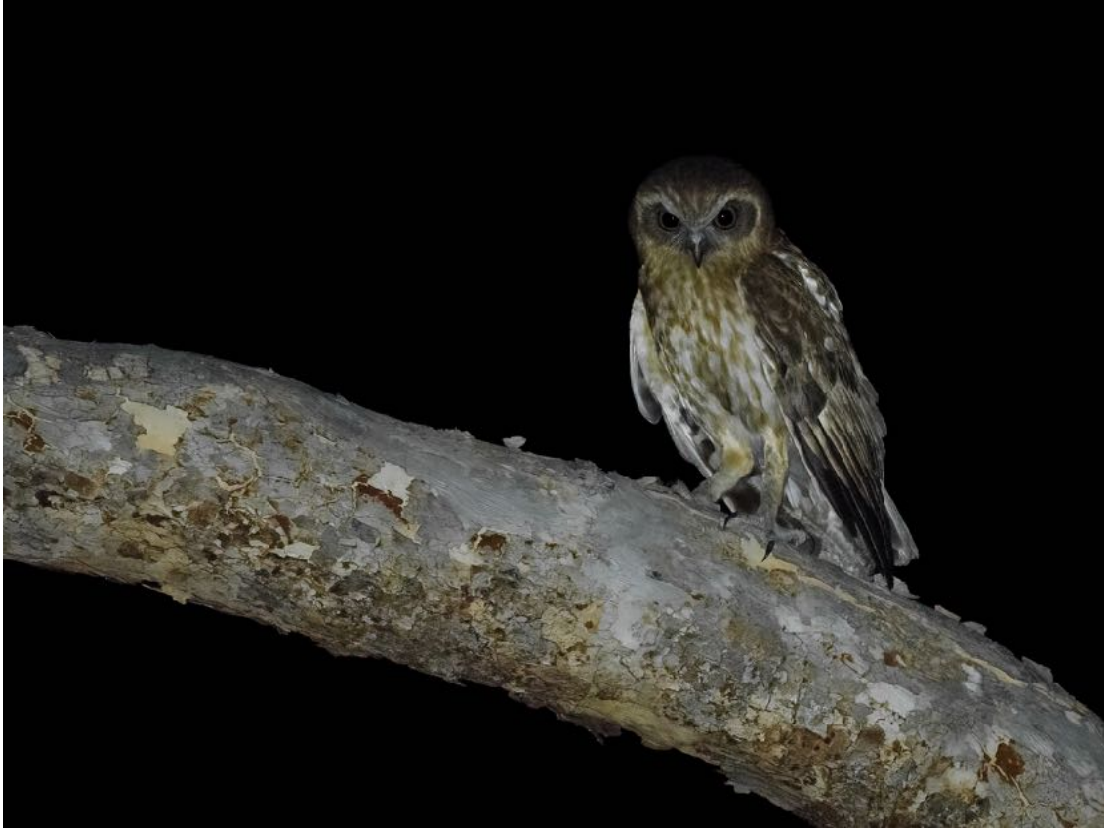
Australian Boobook