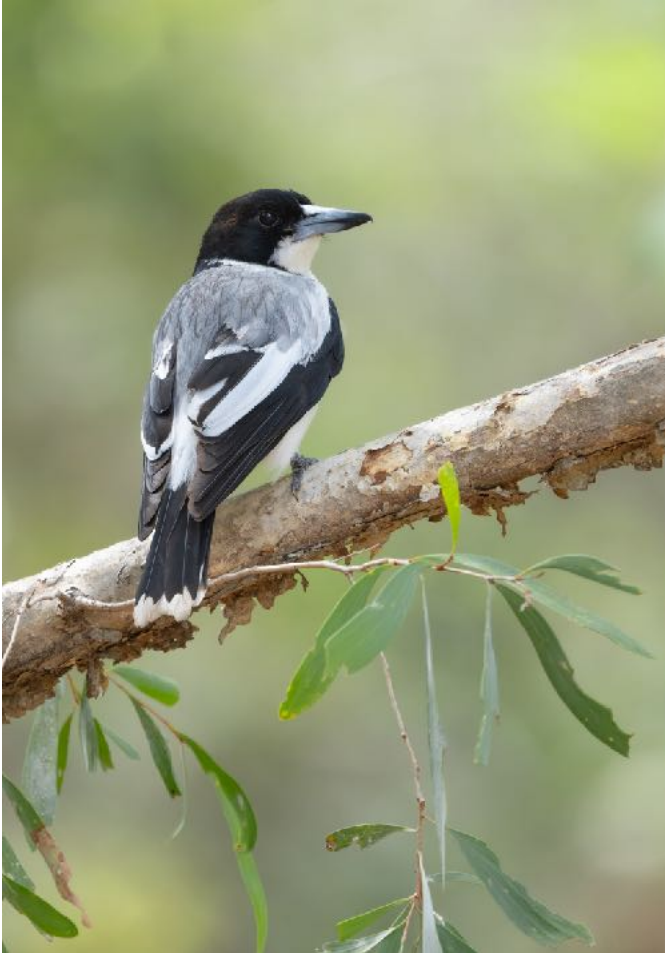
Silver-backed Butcherbird - Photo by Guide: Ben Knoot