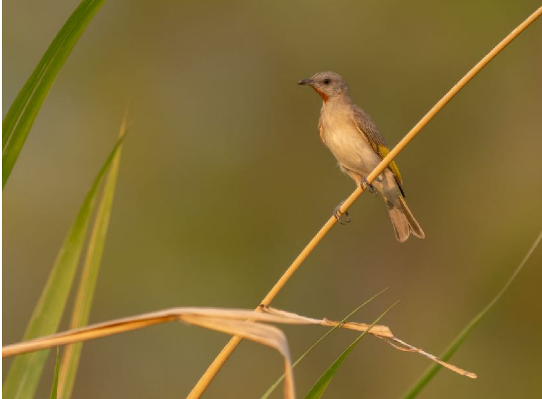
Rufous-throated Honeyeater - Photo by Guide: Ben Knoot