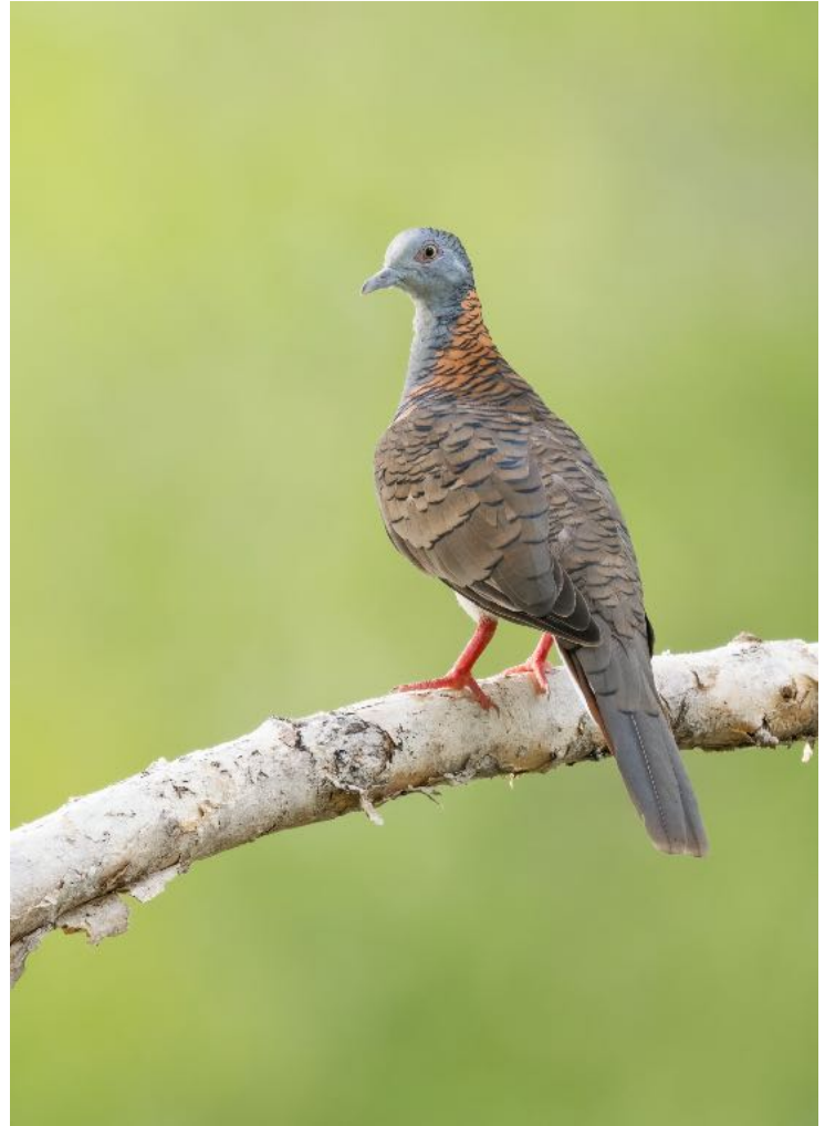
Bar-shouldered Dove