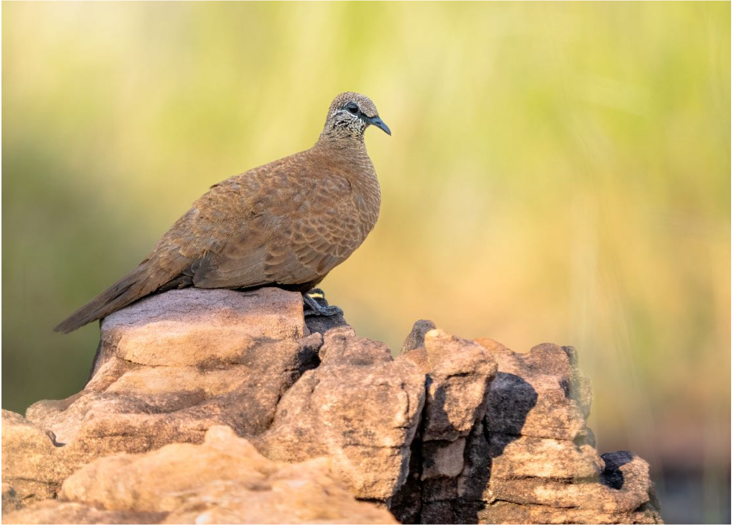
White-quilled Rock Pigeon

Our secondary escarpment walk was just north of Timber Creek called the Neckaroo Lookout . This escarpment is a little different but overall it has the same feel. Here is where we found our Sandstone Shrike-thrush and Diamond Dove . This escarpment has always been reliable.