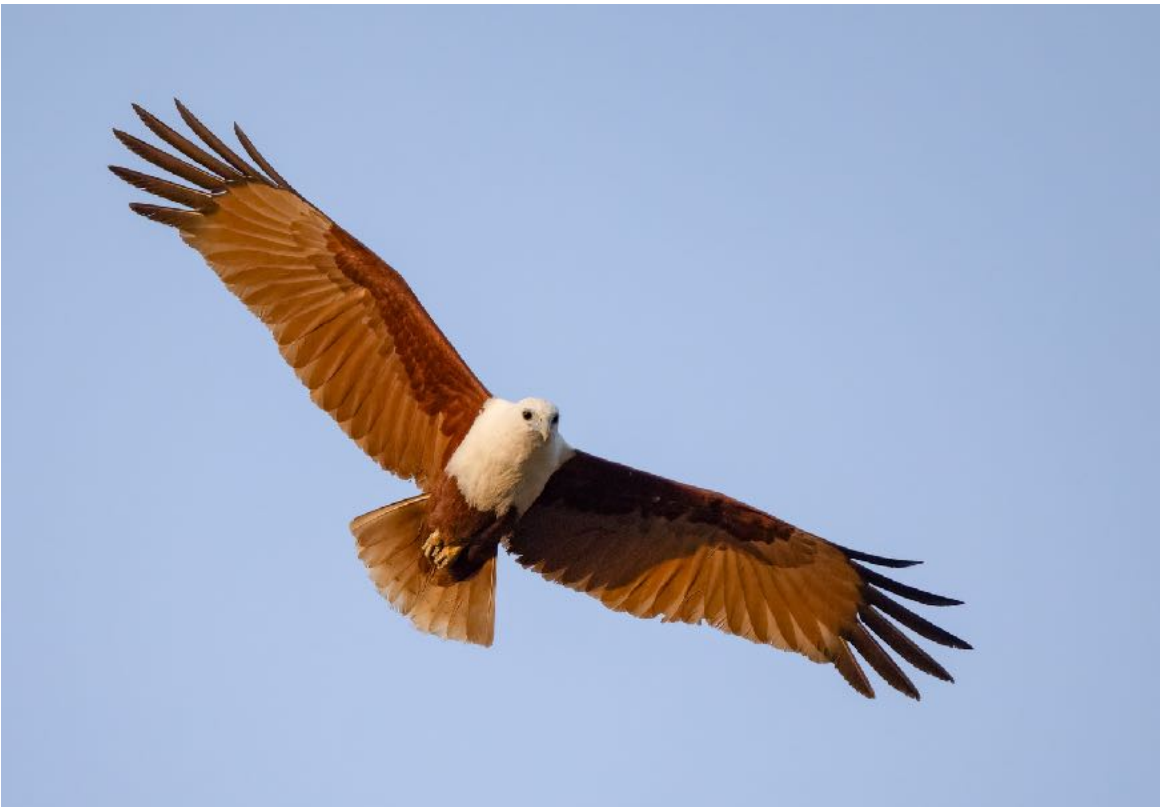
Brahminy Kite