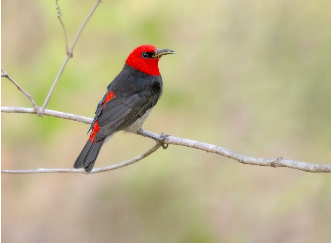
Red-headed Myzomela