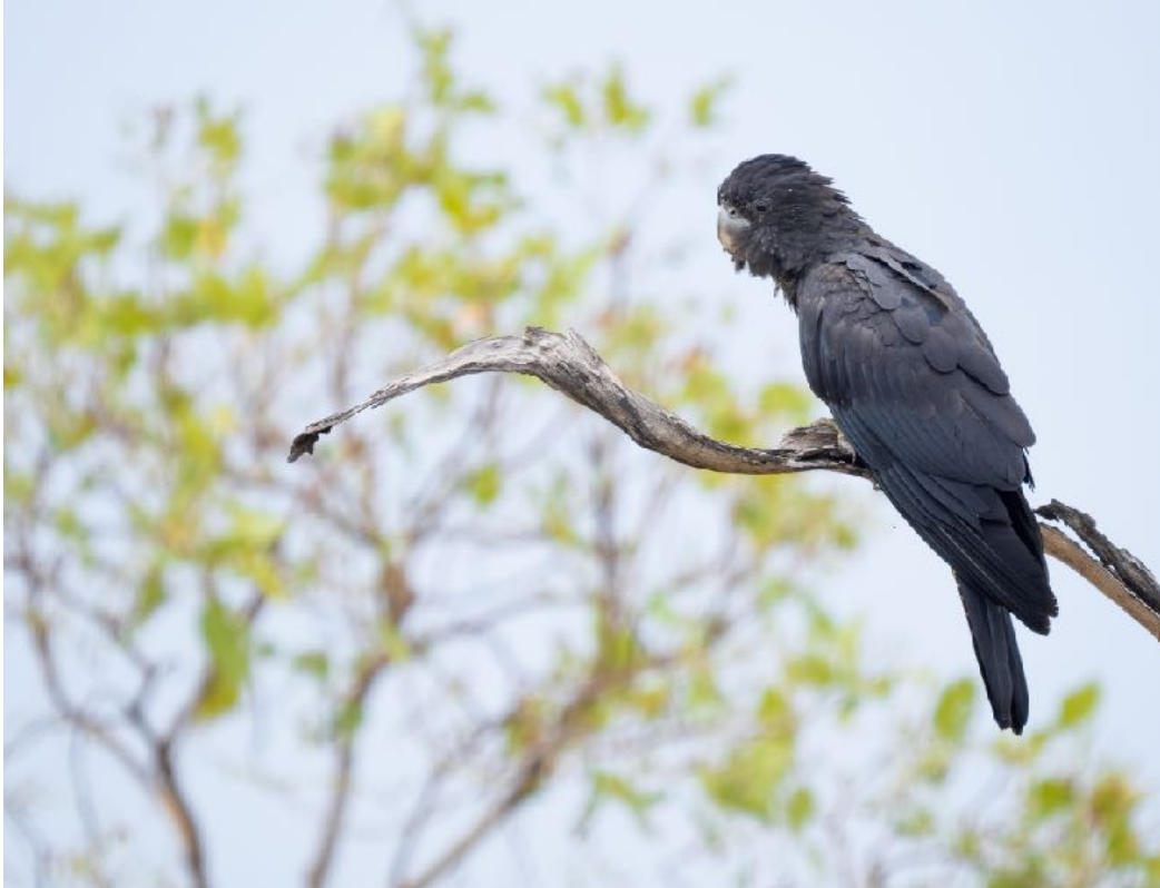
Red-tailed Black Cockatoo