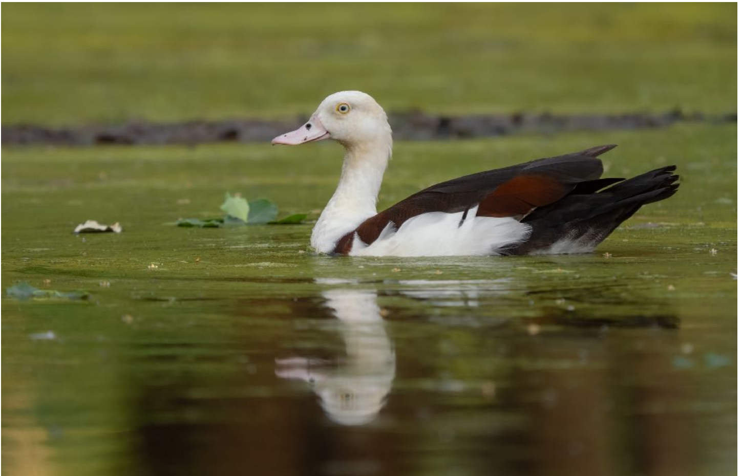
Rajah Shelduck

A few 'non water-based' birds were found near the wetlands as well, which is also to be expected. Birds like; Crimson Finch, Long-tailed Finch, Masked Finch and Channel-billed Cuckoo were present and showed off nicely. We also had some great luck at the Katherine Waste Water Treatment Plant when we picked up about a dozen or so Australian Pratincole.