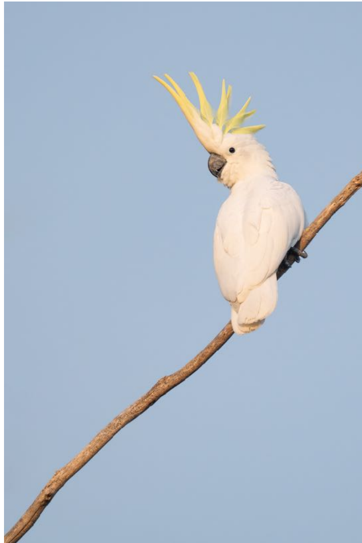
Sulphur-crested Cockatoo: Photo by Guide - Ben Knoot

The Northern Territory like all places has a lot of “generalists”. These birds can really hang in any habitat category. We see these birds over the course of the entire tour in various habitats. Birds like; Torresian Crow, Magpie Lark, White-breasted Woodswallow, Dollarbird, Red-backed Fairywren, Brown Honeyeater, Brown Falcon, Red-tailed Black Cockatoo, Galah, Great Bowerbird, Sacred and Forest Kingfisher, Red-winged Parrot, Paperbark Flycatcher, Little Corella, Sulfur-crested Cockatoo, Rainbow Bee-eater, Blue-winged Kookaburra, Brown Goshawk, Black Kite, White-bellied Cuckoo-shrike, Red-collared Lorikeet, Cockatiel, Whistling Kite, Peaceful and Bar-shouldered Dove.