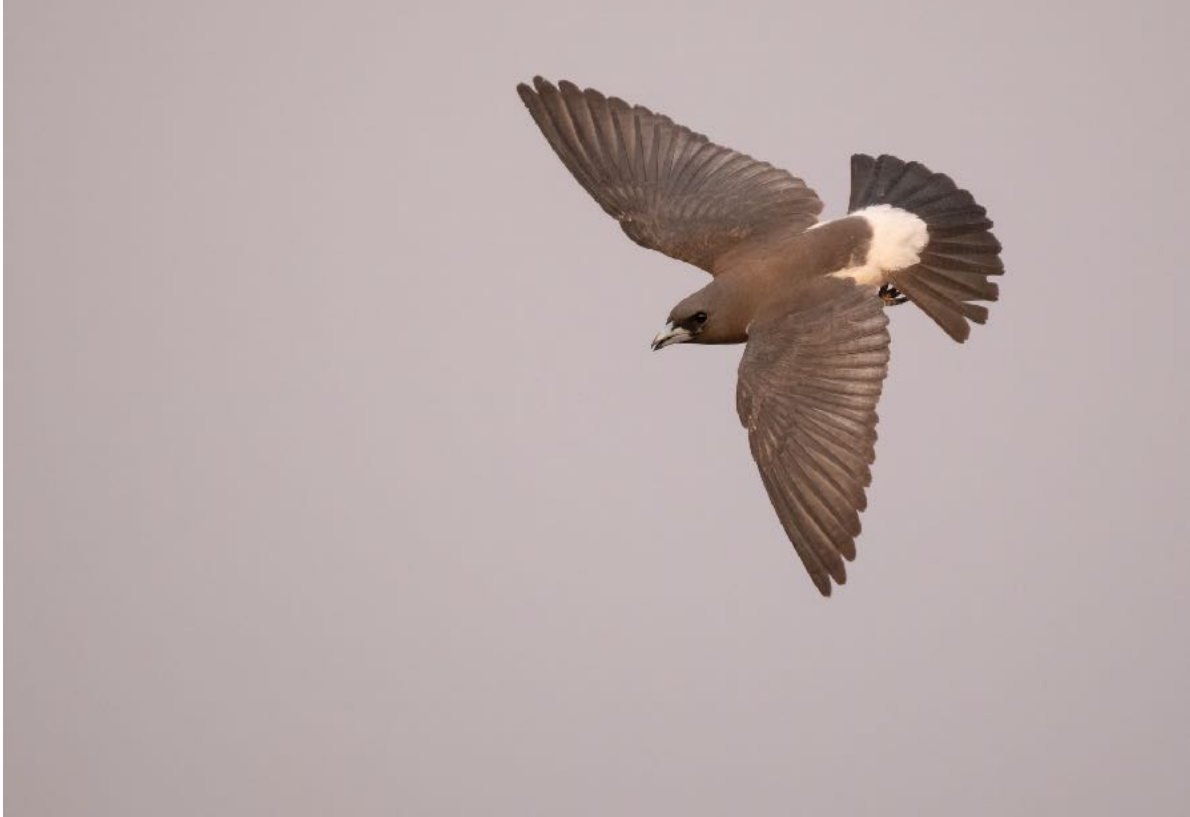
White-breasted Woodswallow