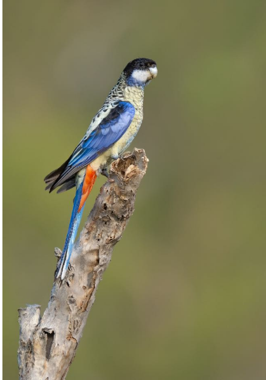
Northern Rosella

There are several Australasian Robins seen on this tour but the only truly randomly placed one (or so it seems) is the Buff-sided Robin in Timber Creek Caravan Park . The entire area surrounding this little caravan park is dry, eucalypt woodland and grassy fields...then you get to the Timber Creek Hotel and are presented with a random stretch of huge fruiting trees that border a river. Here it where you can find not only a pair of Buff-sided Robin but also a few Freshwater Crocodile and Little Red Flying Fox . Heading out of Timber Creek we ran into a huge flock of Pacific Swift . One of the coolest sightings of the trip was a pair of Grey Falcon outside of Top Springs .