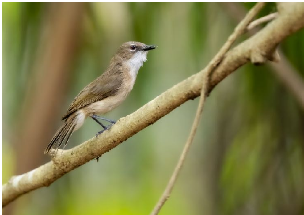
Large-billed Gerygone