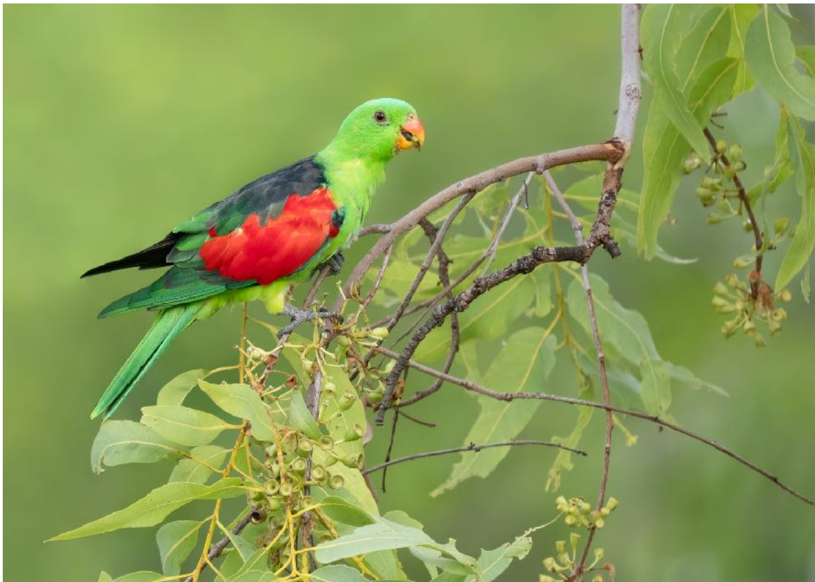
Red-winged Parrot