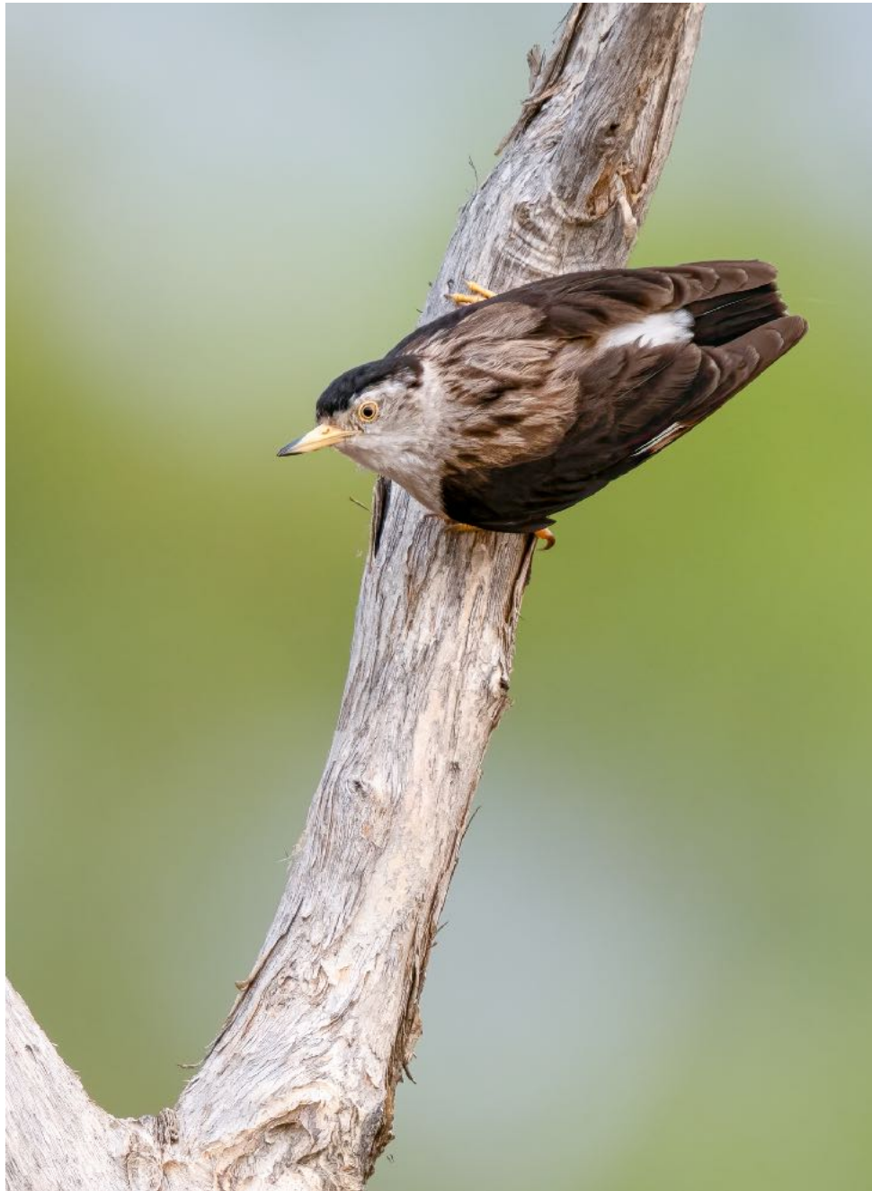
Varied Sittella

By far one of the more desired and difficult chases that we managed to pull off came just south of Katherine . Our first few tries failed so our last go really put the pressure on. Luckily, the never give up attitude of the group prevailed and we were able to get cracking views of Northern Shrike-tit . This recent split from Crested Shrike-tit was a big target for one of the group members so we were all stoked to pick up this bird. Other great birds we found in this area was the Black-tailed Treecreeper , Varied Sittella , Black-chinned Honeyeater , Jacky Winter , Yellow-tinted Honeyeater , Rufous-throated Honeyeater , Brown Quail and though we tried, we could not locate any buttonquail...too bad.