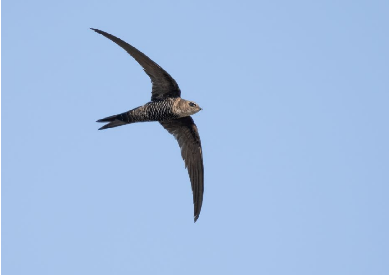
Pacific Swift