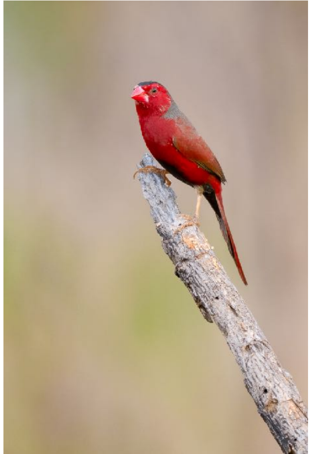
Crimson Finch