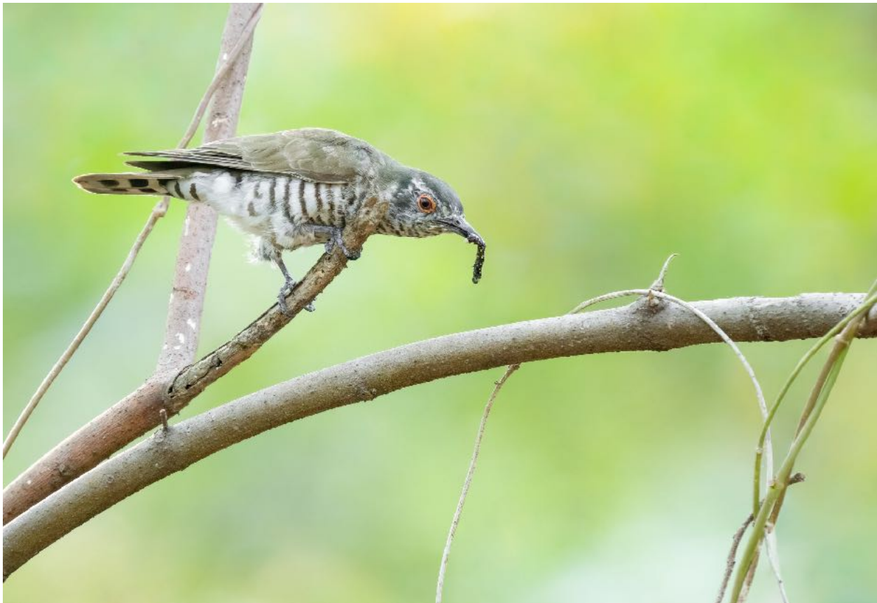
Little Bronze Cuckoo