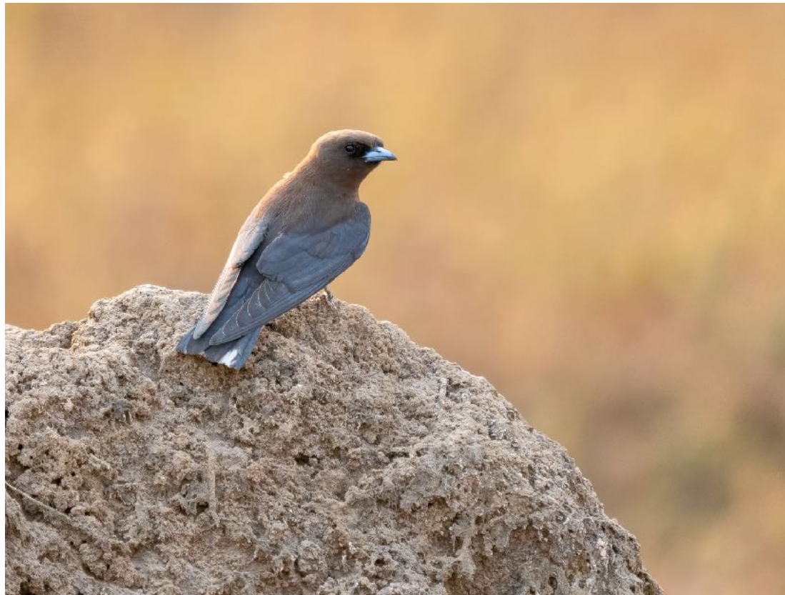
Little Woodswallow