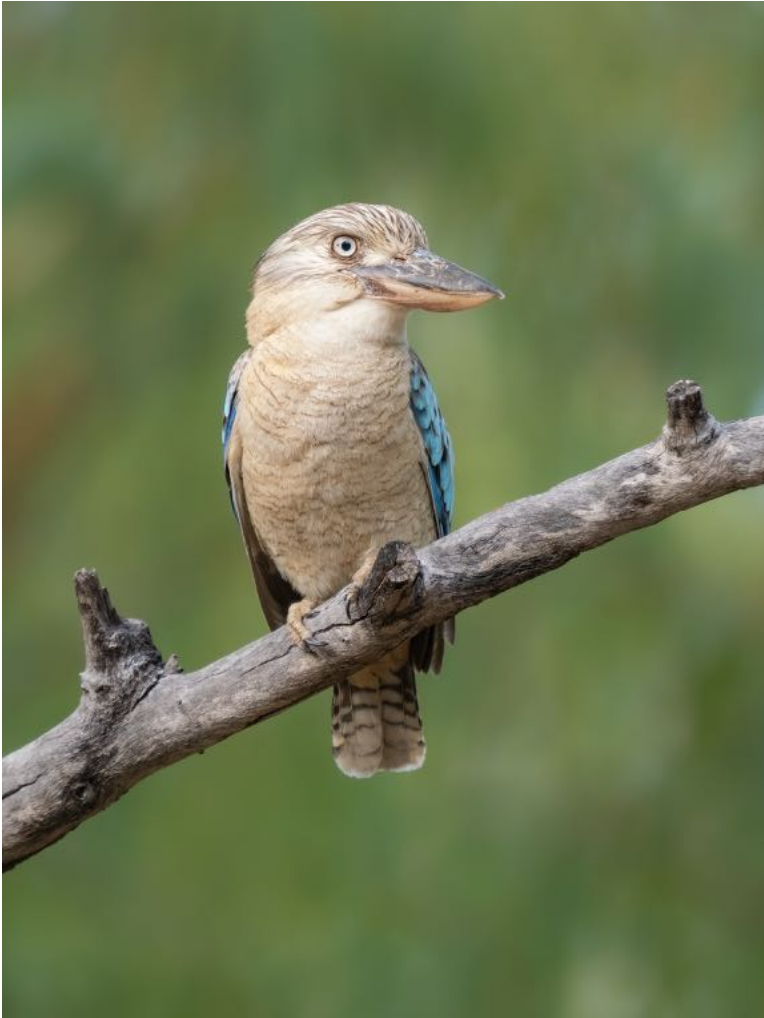
Blue-winged Kookaburra