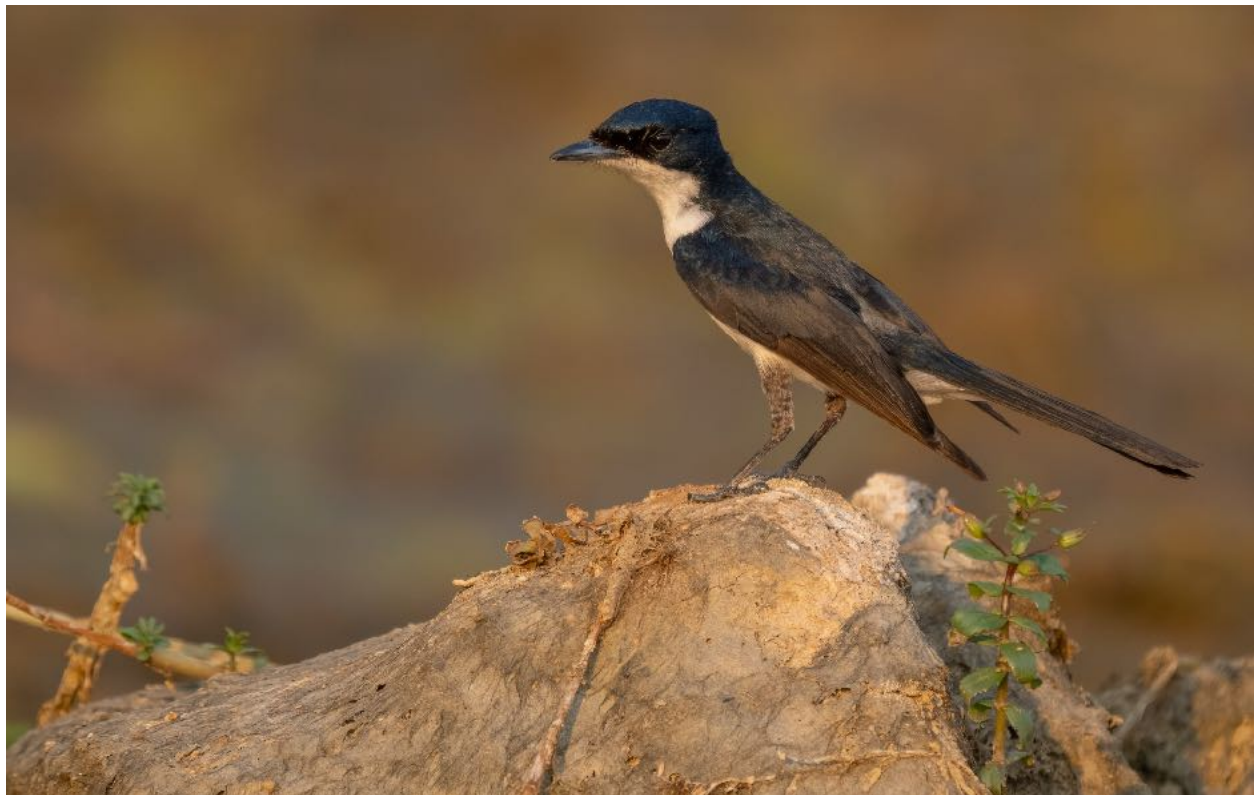
Paperbark Flycatcher