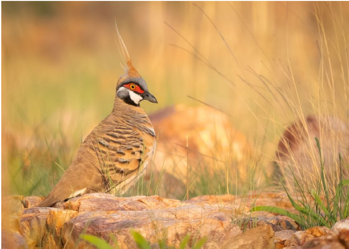
Spinifex Pigeon - Photo by Guide: Ben Knot