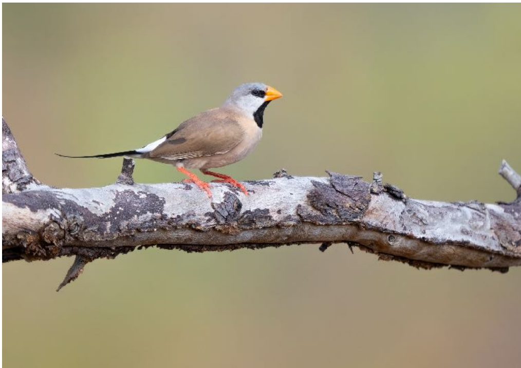
Long-tailed Finch