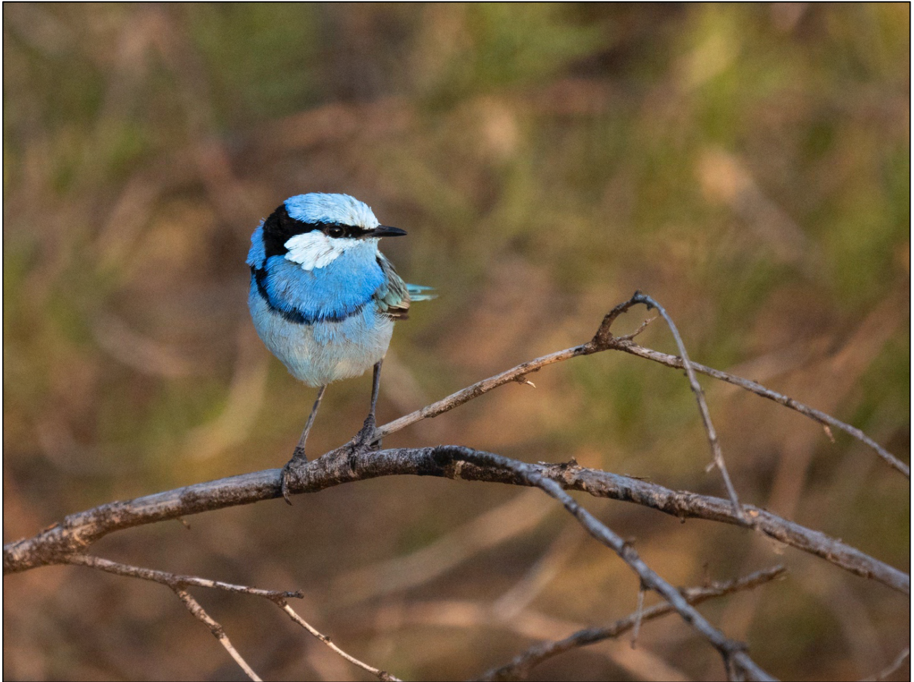
Splendid Fairywren is an iconic bird of the Australian Outback.

We next visited the Grassy Mulga habitat around Cunnamulla where we had most of the same species, we had found earlier at Windorah, in addition to species such as Bourke's and Mulga Parrots, and Greater Bluebonnet. The area was also pumping with passerines such as Masked, White-browed, and Black-faced Woodswallows, as well as a bunch of honeyeaters, including a single Black Honeyeater.