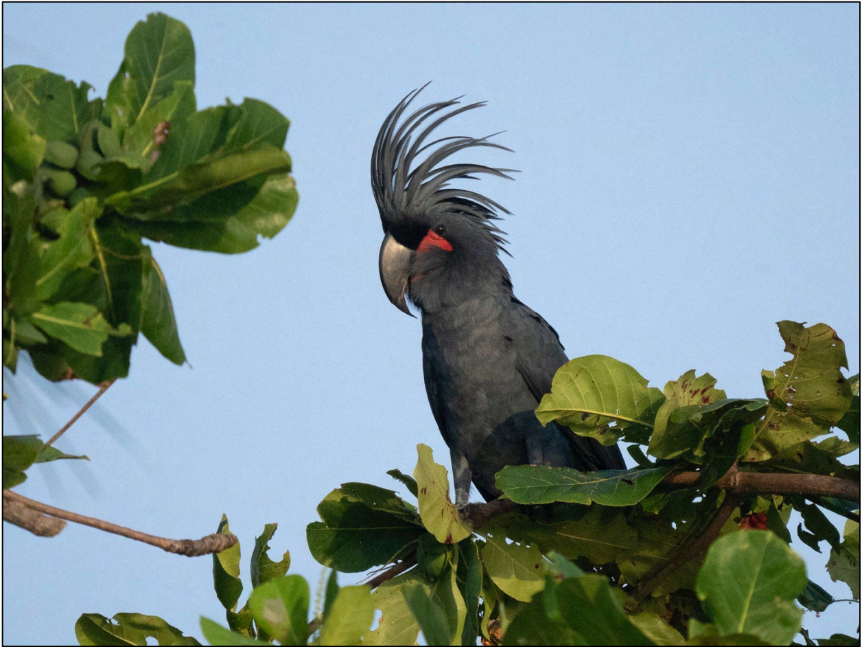
Cape York Cockatoo: The gargantuan Palm Cockatoo is also a specialty of the Tropical Lowland Rainforest on the peninsula.

The area around the lodge at The Greenhouse is comprised of Tropical Lowland Rainforest and Monsoon Vineforest. All the of the target rainforest bird species there occur in both forest types, though some species such as Yellow-legged Flycatcher , Black-winged Monarch , Red-faced Parrot , and Northern Scrub-robin show a definite preference for the pure rainforest (over the vineforest).