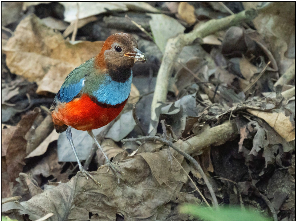
Cape York's Most Wanted: A wet season visit was planned to catch up with this Papuan Pitta , a temporal visitor to Cape York from the island of New Guinea (Iain Campbell/Tropical Birding Tours).

Birds in the photos within this report are denoted in RED.