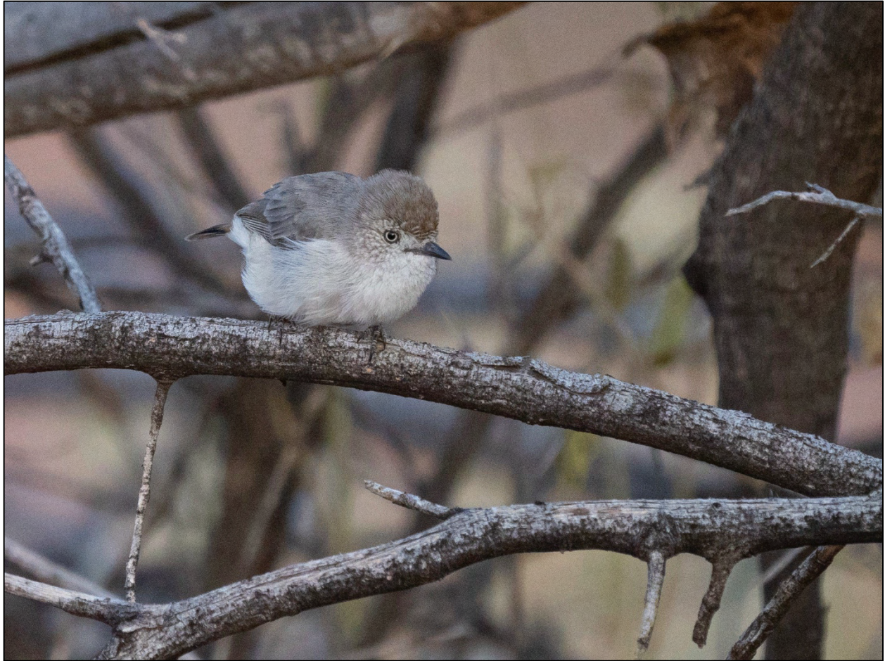
Another species we found in the Mulga was this “Australasian Warbler” (family Acanthizidae), Southern Whiteface (Iain Campbell/Tropical Birding Tours).

We passed through Brigalow Woodland Savanna east of St. George and Eucalypt woodlands of the Darling Downs on our way to the last stop of the Border Ranges. Here, we concentrated on the area around O’Reilly’s Rainforest Retreat at the top of the range.