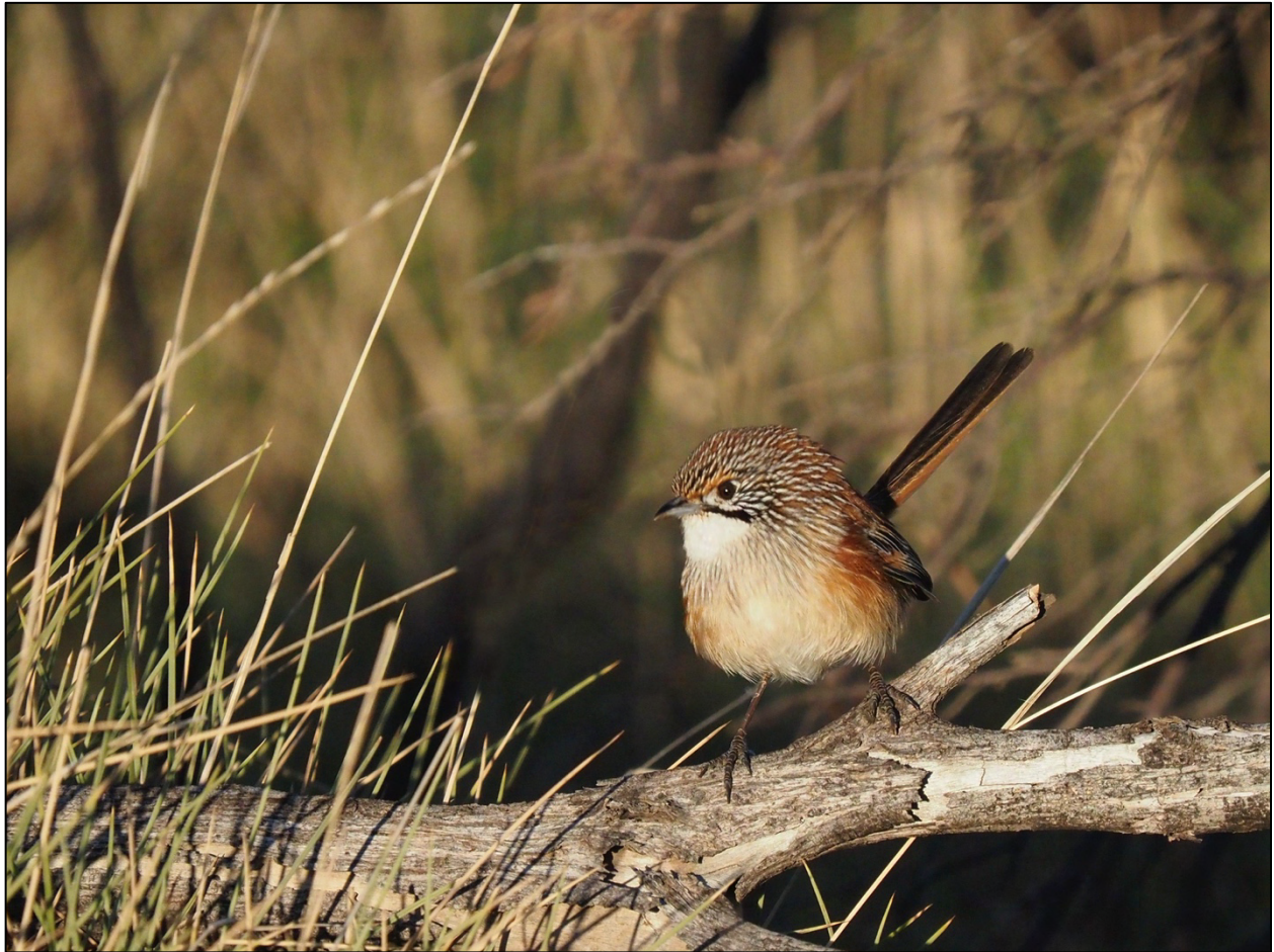
Mount Isa Star Species: The Opalton Grasswren has a tiny range being endemic to this region, and inhabiting very specific spinifex-dominated microhabitats.

We visited Windorah to break the drive down to extreme southwestern Queensland. The area around Windorah is the northwest outlier of the Mulga forests more common further south but does mark another boundary between the Spinifex Deserts and the Grassy Mulga and Chenopod-dominated environments farther south. Here, Crested Bellbirds became the usual background sound to any birding, along with more southern species such as Spiny-cheeked and Singing Honeyeaters .