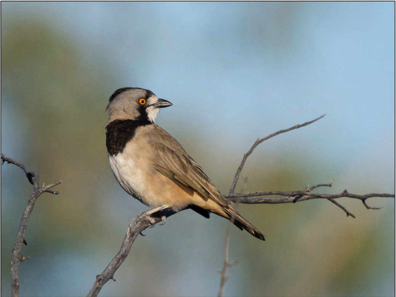
Crested Bellbirds were conspicuous around Windorah.

The next stop was Noccundra, and the vast Gibber Chenopodplains and overflows of the Channel Country. This vast expanse of braided streams and ephemeral overflows is dominated by Lignum Swamps. We used The Noccundra Hotel as our base, with very basic “donga” accommodation that is a shock to most of our clients, usually used to great lodges and hotels. We do state “best available” and this fitted the bill, being the only accommodation for over 100km. The spartan lodgings were mitigated by the engaging and very friendly publicans and the best food within a day’s driving. The lignum at the usual stakeout for the Gray Grasswren was destroyed by a hailstorm last year, so we had a frantic hunt for good stands in the area. We found a stand and with that found a territory of a Gray Grasswren . This bird is renowned for being a difficult bird to get a good look at, and we had to accept flybys across the small channels. The gibber plains are usually nearly devoid of vegetation, being a varnished desert with a cap of larger rocks linking to protect the soil profile below. This year, however, they were absolutely blooming with ephemeral vegetation of small bluebush, saltbushes, a few grasses, and a multitude of flowers.