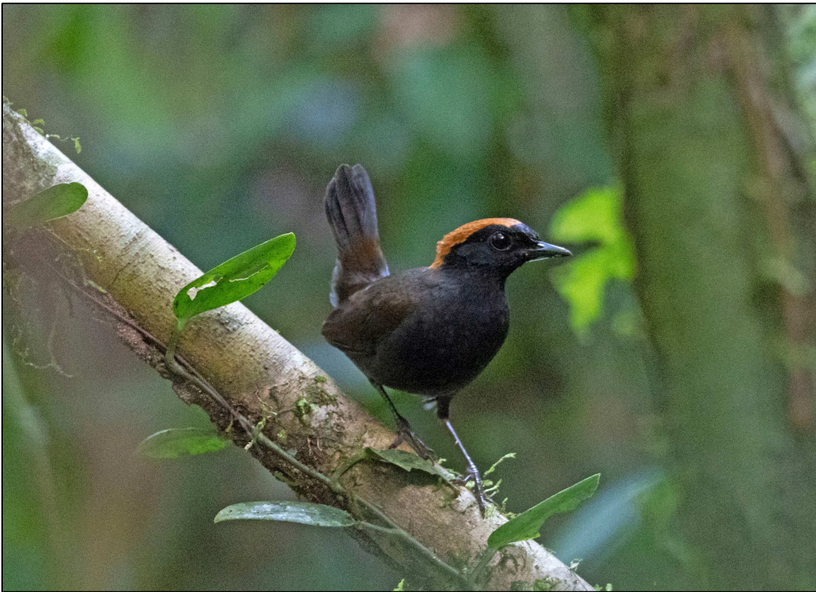
Rufous-capped Anthrush from Sani Lodge