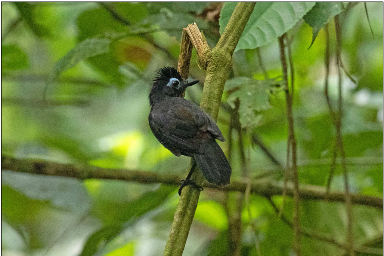
Sooty Antbird at Yasuni NP

We walked into some exciting understory activity, which implied there were army ants swarming in the area, as it attracted some species that spend their lives following these, like the jaw-dropping White-plumed Antbird , as well as Lunulated, Sooty, White-cheeked, Common Scale-backed, and Black-faced Antbirds , along with Plain-brown Woodcreeper , another species that can be found around ant swarms too. Much further along, we came across some further activity that yielded species like, Dusky-throated and Cinereous Antshrikes, Blue-crowned and Green Manakins and we also got awesome looks at a perched Slate-colored Hawk .