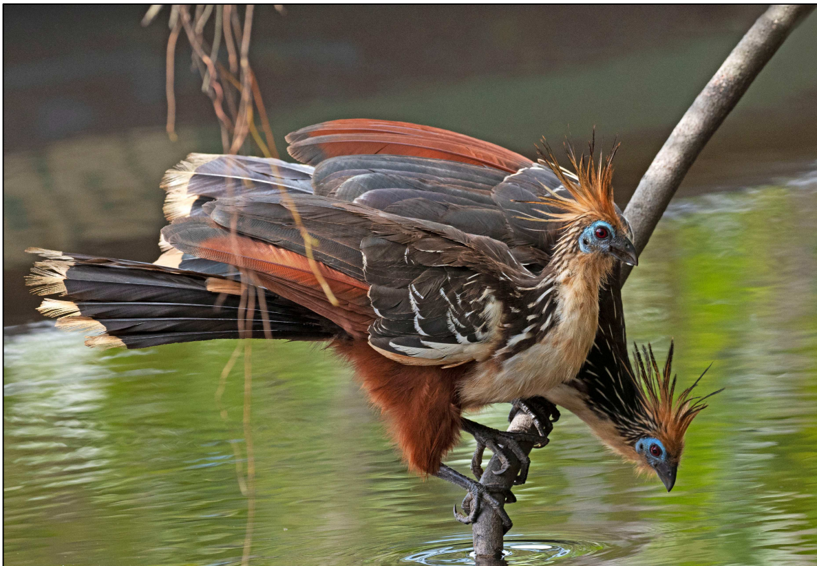
Hoatzin at Sani Lodge

After such a productive stop, we started heading towards WildSumaco Lodge to collect some other participants on the way who were also joining this tour. This led us to a Cliff Flycatcher , Magpie Tanager , Black Caracara , White-lined Tanager , and Lined Antshrike on the way there, then by the lodge we checked the hummer and were quickly rewarded with Golden-tailed Sapphire , Gould's Jewelfront , Many-spotted Hummingbird and Violet-headed Hummingbird in the garden.