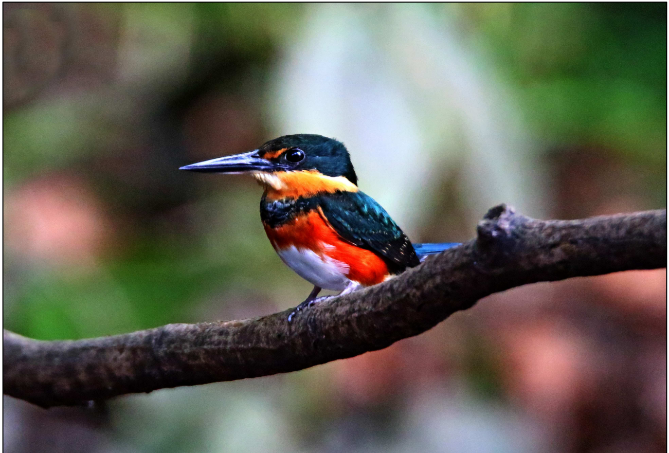
America Pygmy Kingfisher from Sani Lodge

As this was our final day, we maximized time in the field and made plans on where to go based around what we had not yet seen. Therefore, our starting move was to visit a trail called Chorongo Corto , accessible following another short canoe ride. As we crossed the lagoon we watched plenty of birds passing overhead just after dawn, like Orange-winged Parrots and Blue-and-yellow and Chestnut-fronted Macaws . Wetland species were also found around the lake edge, such as Cocoi and Capped Herons , Limpkin the typically boisterous Black-capped Donacobius , and a wonderful American Pygmy Kingfisher . We reached the trail head and began our walk, at first experiencing little activity. However, little-by-little birds began to call, and were dug out of the foliage, like Striped , Elegant and Buff-throated Woodcreepers . The main target bird though was the rare and local Cocha Antshrike , for which Sani is arguably the best place in the world. This is how it turned out on this day too, as we were rewarded with a pair of them. We continue to walk slowly along the same trail, which proved effective as we found the scarce Citron-bellied Attila , as well as Slate-colored Hawk , Laurence's Thrush , Peruvian Warbling-Antbird , Ornate Stipplethroat , Cinereous and Plain-winged Antshrikes and White-breasted Wood-Wren . Near the end of the morning a late star was a White-chested Puffbird , not long before we returned to the lodge for lunch.