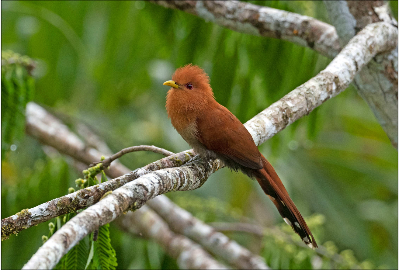
Little Cuckoo at Sani Lodge

After lunch, we had a little time spare before our afternoon plans, so some of us stayed birding and photographing from the bar porch. This resulted in another feeding flock being encountered with with the shy Little Cuckoo , the tiny Lafresnaye's Piculet , and Yellow-bellied Dacnis , Chestnut-bellied Seedfinch , Silver-beaked and Masked Crimson-Tanagers , White-winged Becard , Yellow-rumped Cacique , Crested and Russet-backed Oropendolas , Yellow-crowned Tyrannulet , noisy Violaceous Jays and, in the garden, we even saw Cattle Tyrant and Red-capped Cardinal . Later on, we visited a forest trail, which was quite quiet in the heat of the afternoon, but we did get some goodies there, like Cinereous Mourner , Green-backed Trogon , Long-billed and Cinnamon-throated Woodcreepers , a Rufous-capped Anthrush and Screaming Piha , the latter another Amazonian iconic species by virtue of its extremely distinctive call. After our short walk, we went out on the lake in canoes, trying to find species best found in this relaxing way of birding, and yielded Striped Woodcreeper and Rufescent Tiger-Heron during daylight, and then Short-tailed Nighthawk , Common Pauraque , Boat-billed Heron , Common and Great Potoos as dusk fell in earnest.