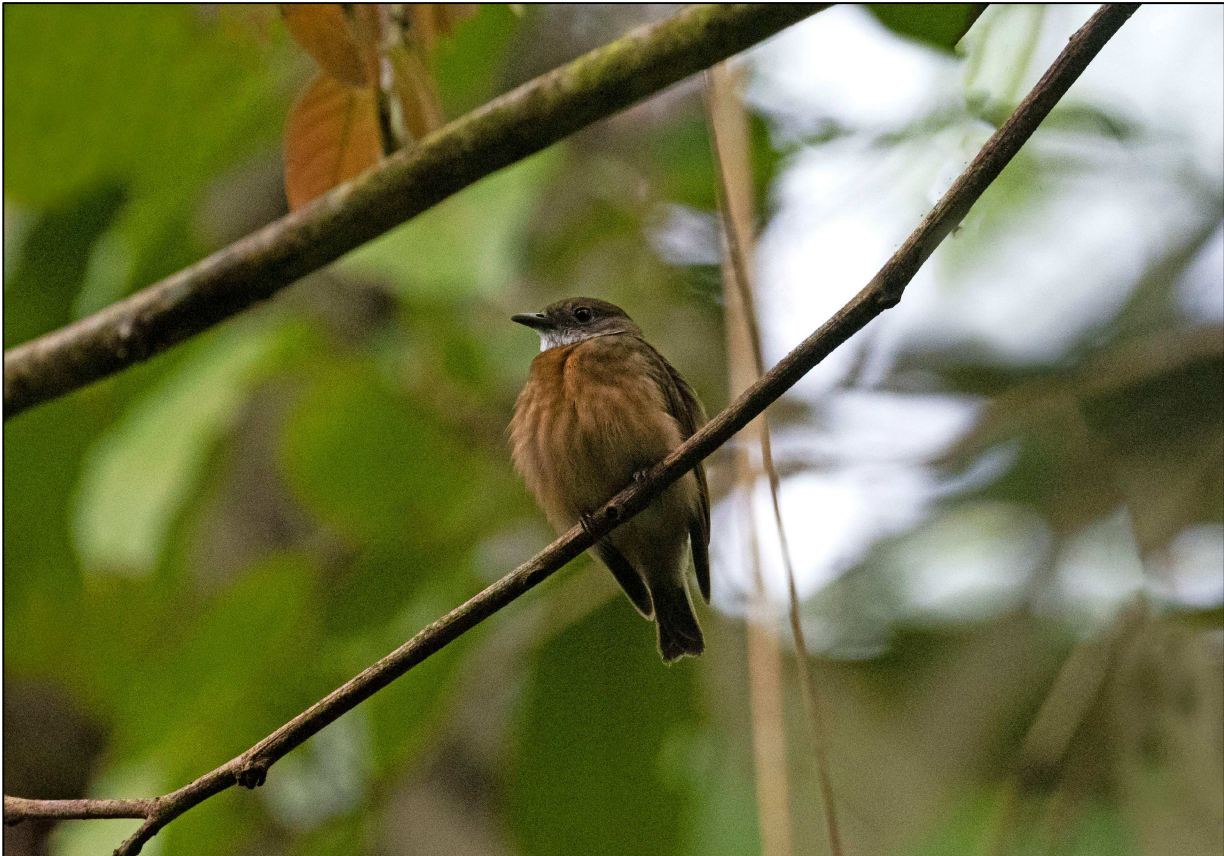
Orange-crested Manakin near Sani Lodge

After a short boat ride, we arrived at a spot for the near endemic Orange-crested Manakin ( photo below ), which responded very well for us. Following tips from my cousin who works at the lodge, we continued on by boat to another location, where we got good looks at the extremely secretive White-lored Antpitta . Then, we walked a community trail, more used by locals to connect with their local relatives than birding, but it was productive, as we mopped up some gaps in our list and found a bunch of cool birds like Point-tailed Palmcreeper , White-bearded Hermit feeding on the Heliconia flowers and a Long-billed Starthroat . Much further up the same trail we also found White-eared Jacamar , Amazonian Motmot and the striking Rufous-headed Woodpecker , a scarce species. We had decided to come to this place not only for daytime birds, but also to linger as darkness fell for nocturnal birds too. However, before that we saw one of the World's smallest primates, the so-called "Pocket Monkey", or Pygmy Marmoset . As dark took over, we managed views of Crested Owl , and Tawny-bellied and Tropical Screech-Owls .