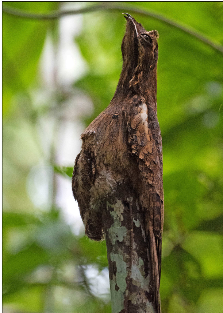
Long-tailed Potoo from the Sani Isla Community

After such a productive time within the deep forest, we headed towards Sani Isla Community Center for our field lunch. While we were waiting for that, we took in other birds like Southern Lapwing , Gray-breasted Martin , White-banded Swallow and a few Swallowing Puffbirds that were flying back and forth from a dead snag. We had brought a boxed lunch with us from Sani Lodge , but we also had the opportunity to try some local cooked food provided by the community women's group. After having this varied lunch, we were ready to bird again, and went to a local property nearby, as it was rumored to have a roosting bird we were interested in. While there, we notched up Piratic Flycatcher , Chestnut-crowned Becard , Gray-crowned Flatbill , Orange-backed Troupial and a cute Ferruginous Pygmy-Owl . THE bird we were there for though, was also present, a nesting Long-tailed Potoo ( photo below ), in which a chick could be seen snuggled under the belly of the parent bird.