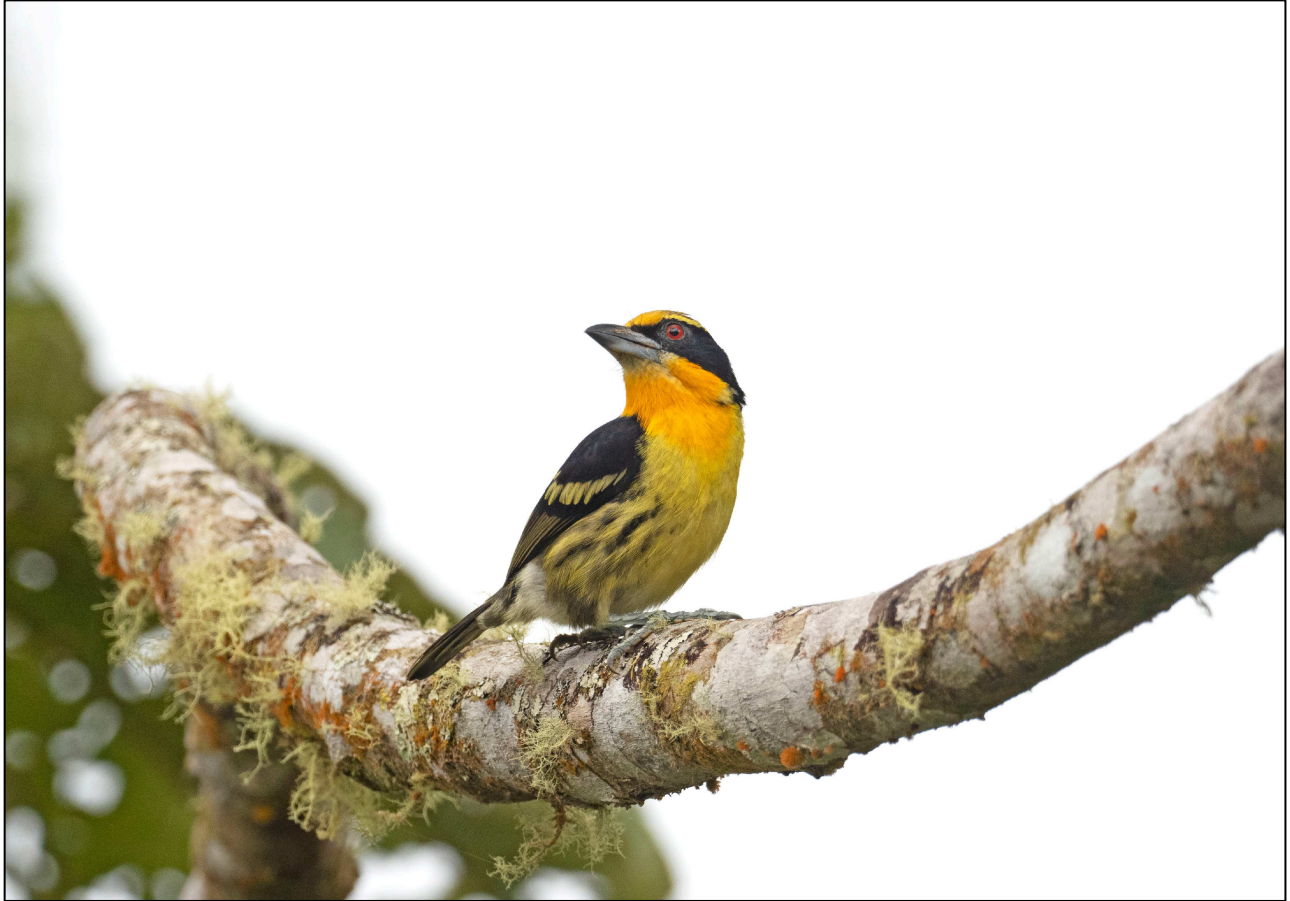
A gorgeous Gilded Barbet from Sani Lodge

Some of these birds were seen close and perched up (some even in the same canopy as we were stood), but we also had birds passing by in flight, such as Mealy and Black-headed Parrots , Greater Yellow-headed Vulture and many Blue-and-yellow Macaws . After this wonderful opening to our day, we descended the tower and worked for some birds at ground level, birding the trail near the base of the tower, and finding the terrestrial Dot-backed Antbird and arboreal Gray Antbird , Golden-headed and Wire-tailed Manakins provided the wow factor, and a small understory feeding flock held Plain-throated and White-flanked Antwrens , Plain-winged Antshrike , Wedge-billed and Elegant Woodcreepers , and Double-banded Pygmy-Tyrant . We then birded from the boat, on the way back along a creek to the main lake on where the lodge is located. From the canoe, we saw Amazonian Streaked Antwren , Plumbeous Antbird , Chestnut-fronted Macaw , Orange-winged Parrot , Amazon, Green and Ringed Kingfishers , Short-crested Flycatcher , Snail Kite and several beautiful Capped Herons .