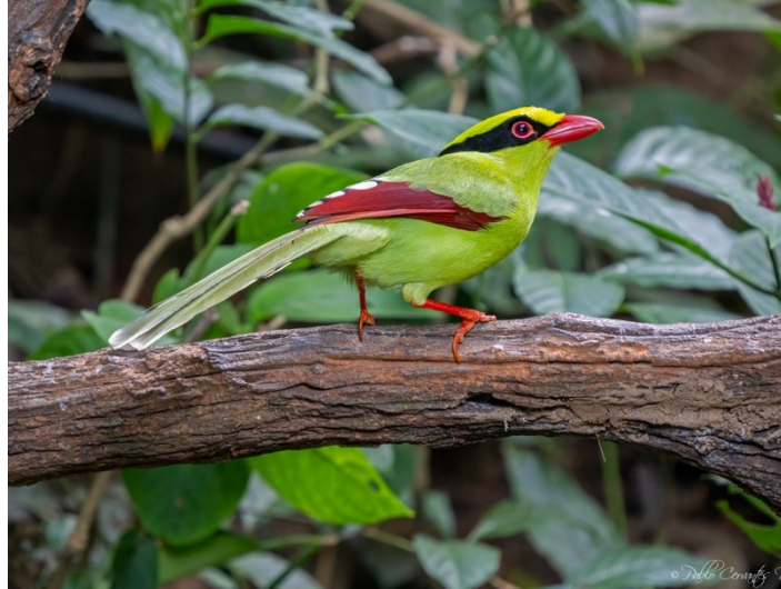
🜮 Common Green-Magpie