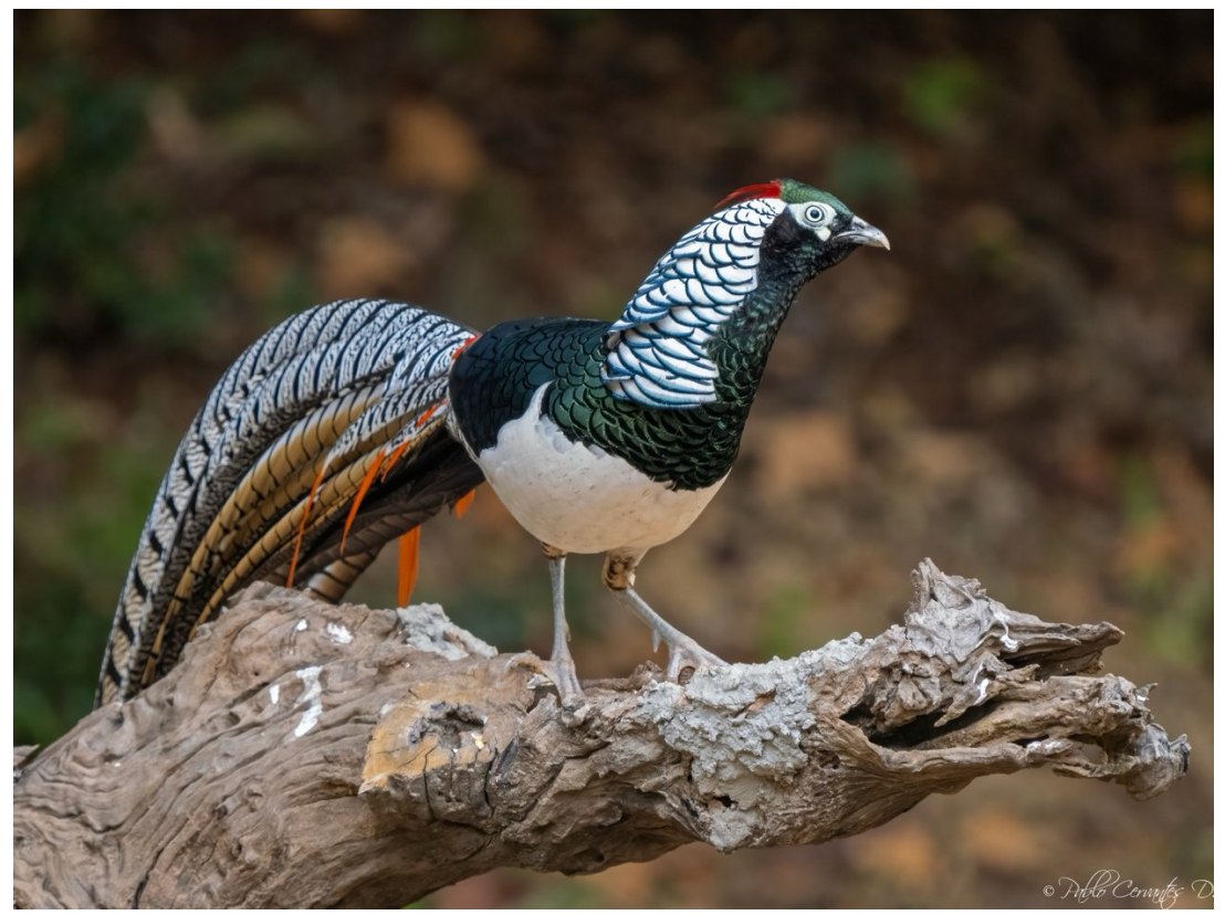
Lady Amherst's Pheasant