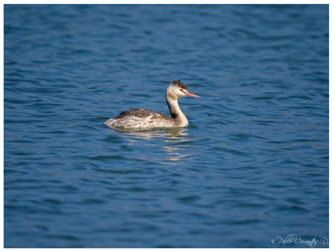
Great Crested Grebe