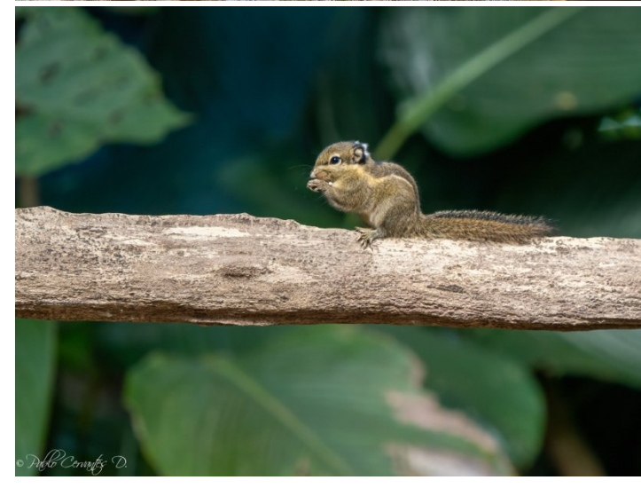
Asian Striped Squirrel