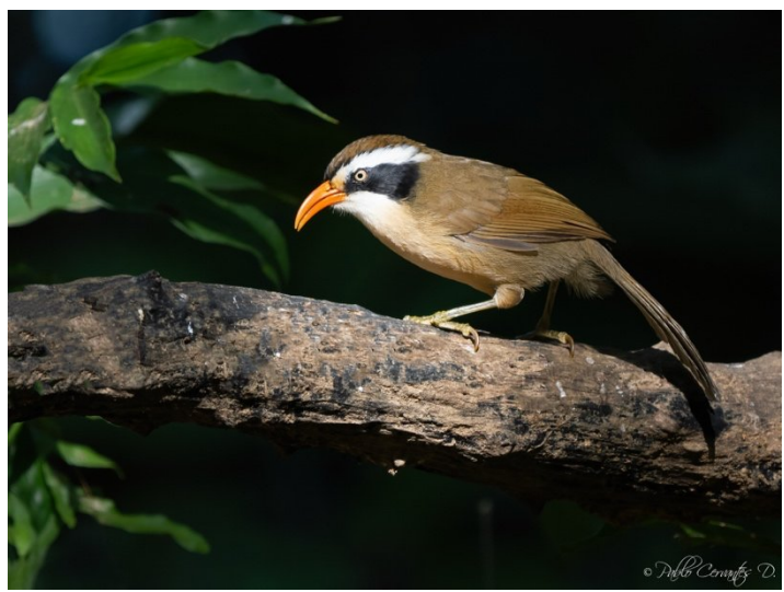
<del>ാഗ്രീഗ്രണ്ട്; <sup>©</sup> </del>Brown-capped Scimitar-Babbler