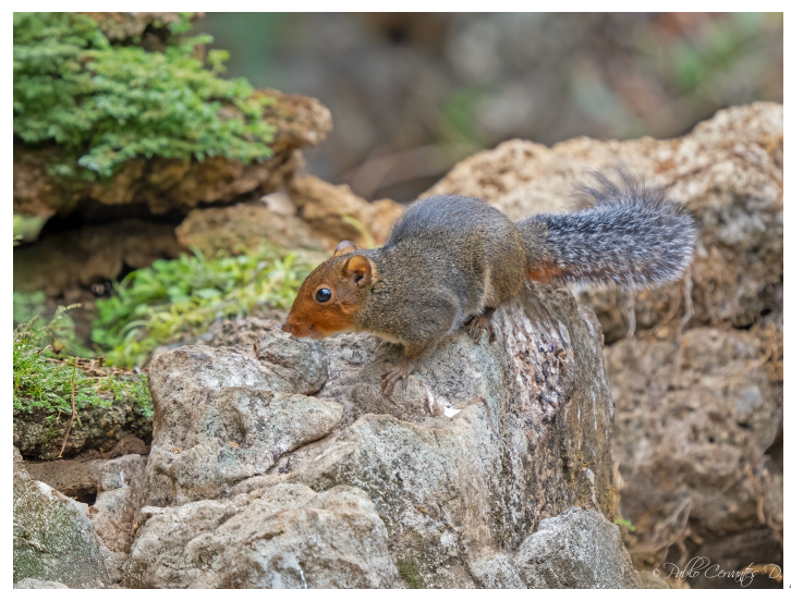
Asian Red-cheeked Squirrel