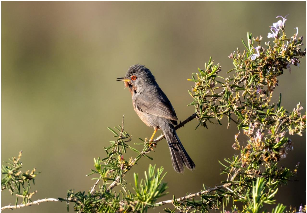
Dartford Warbler singing from wild rosemary, Doñana National Park

species depicted in photographs are named in Bold Red