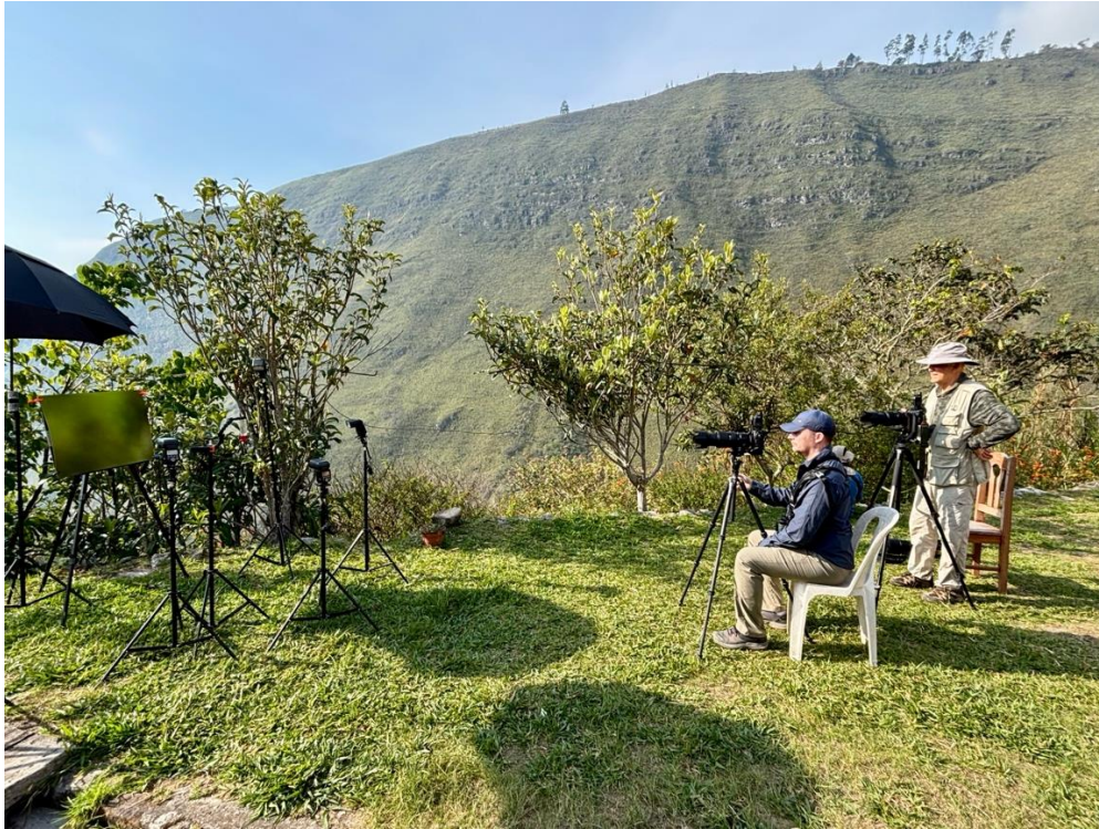
Multiflash hummingbird photography