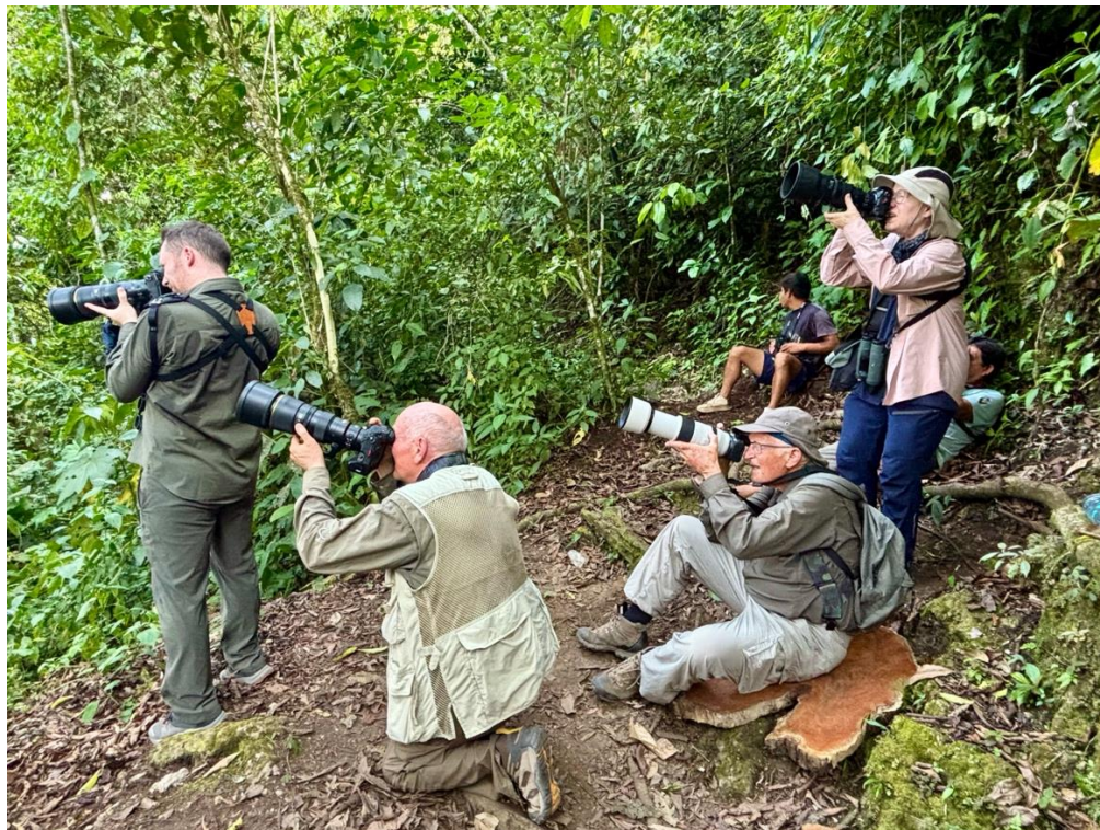
Andean Cock-of-the-rock Lek