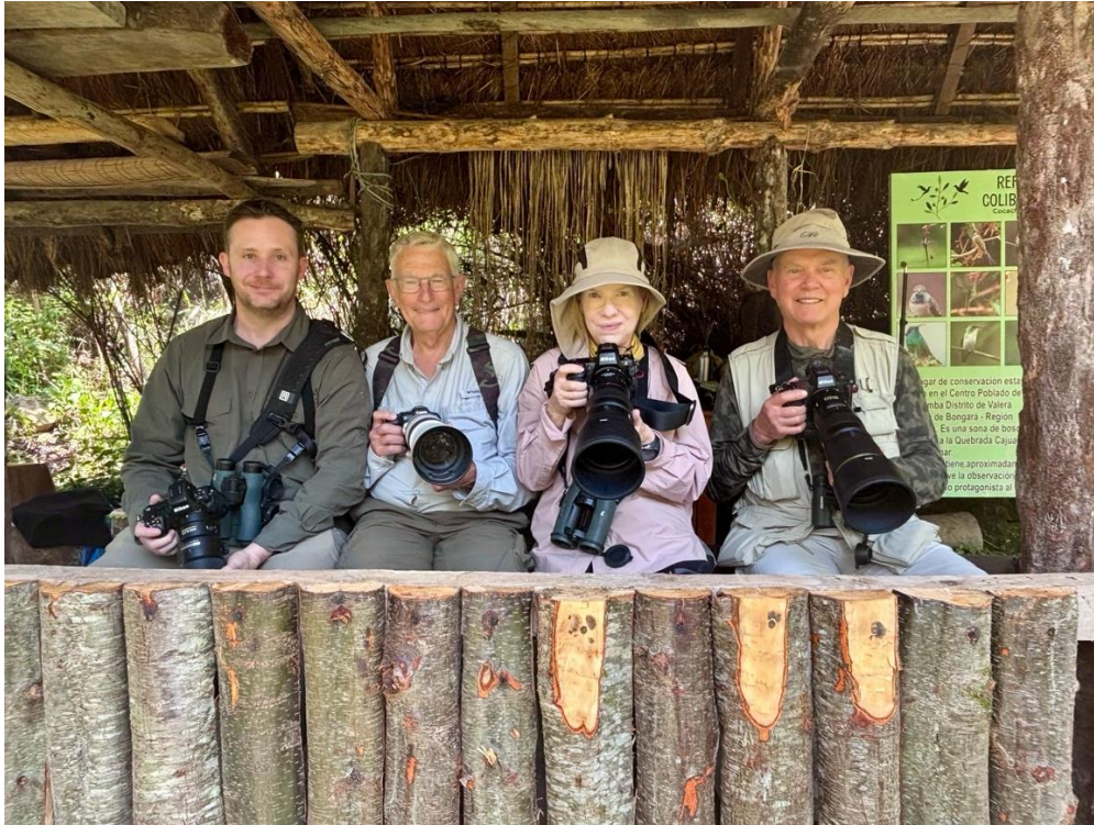
Everyone waiting for the Marvelous Spatuletail